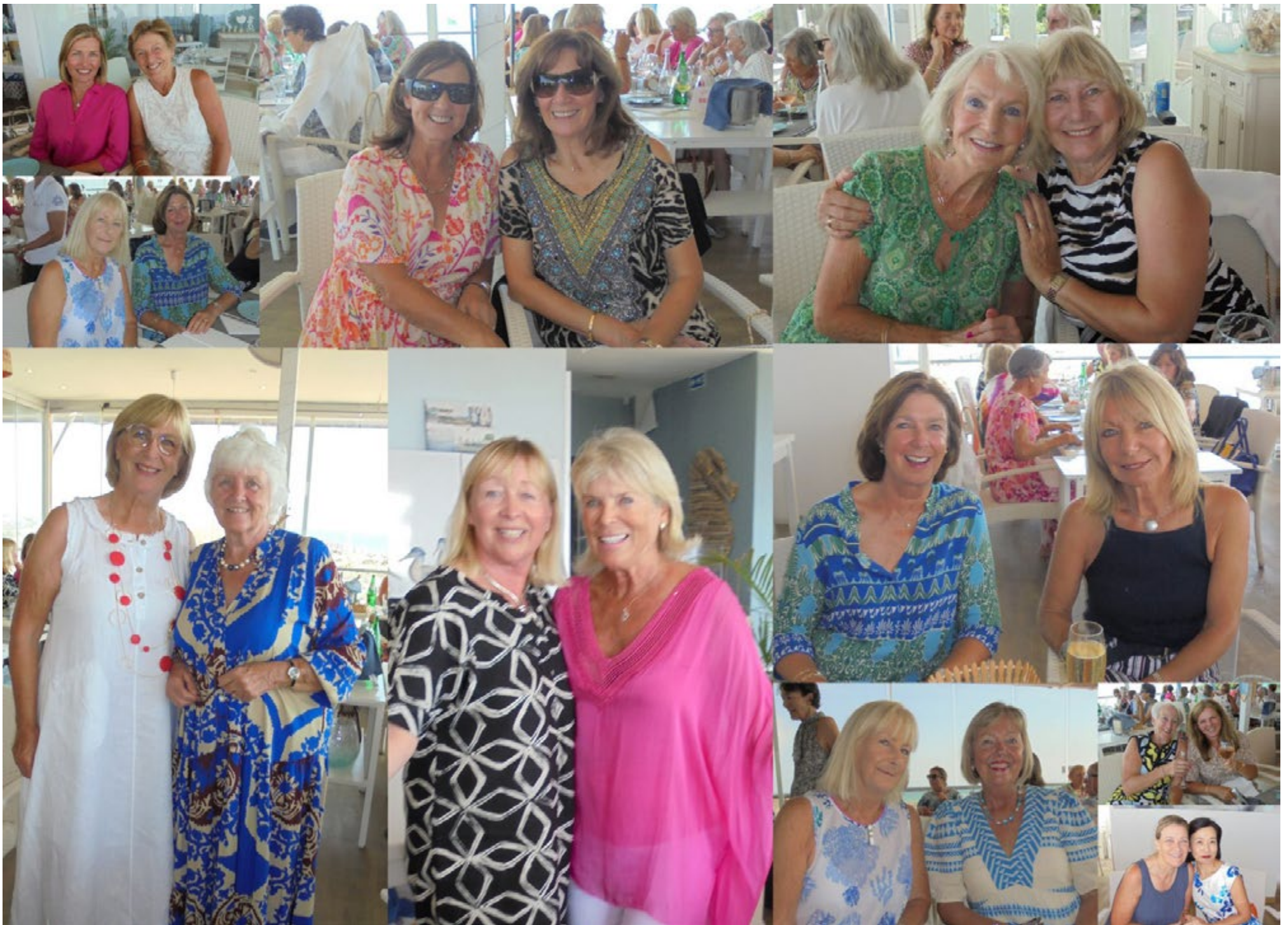
Lady Captain's Day