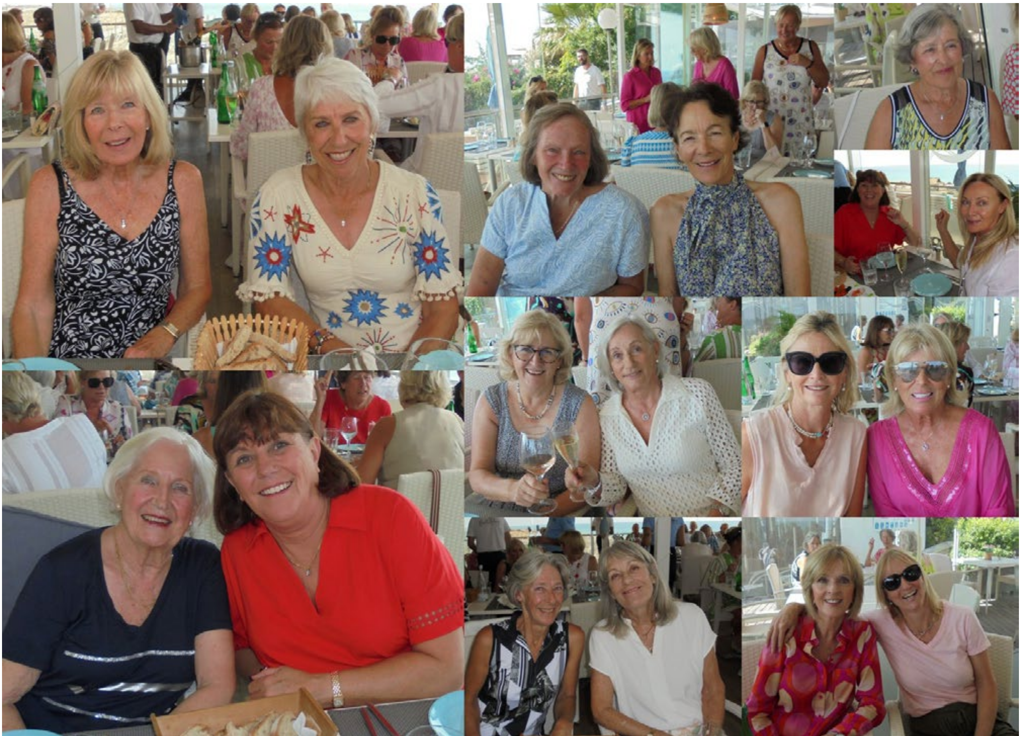
Lady Captain's Day