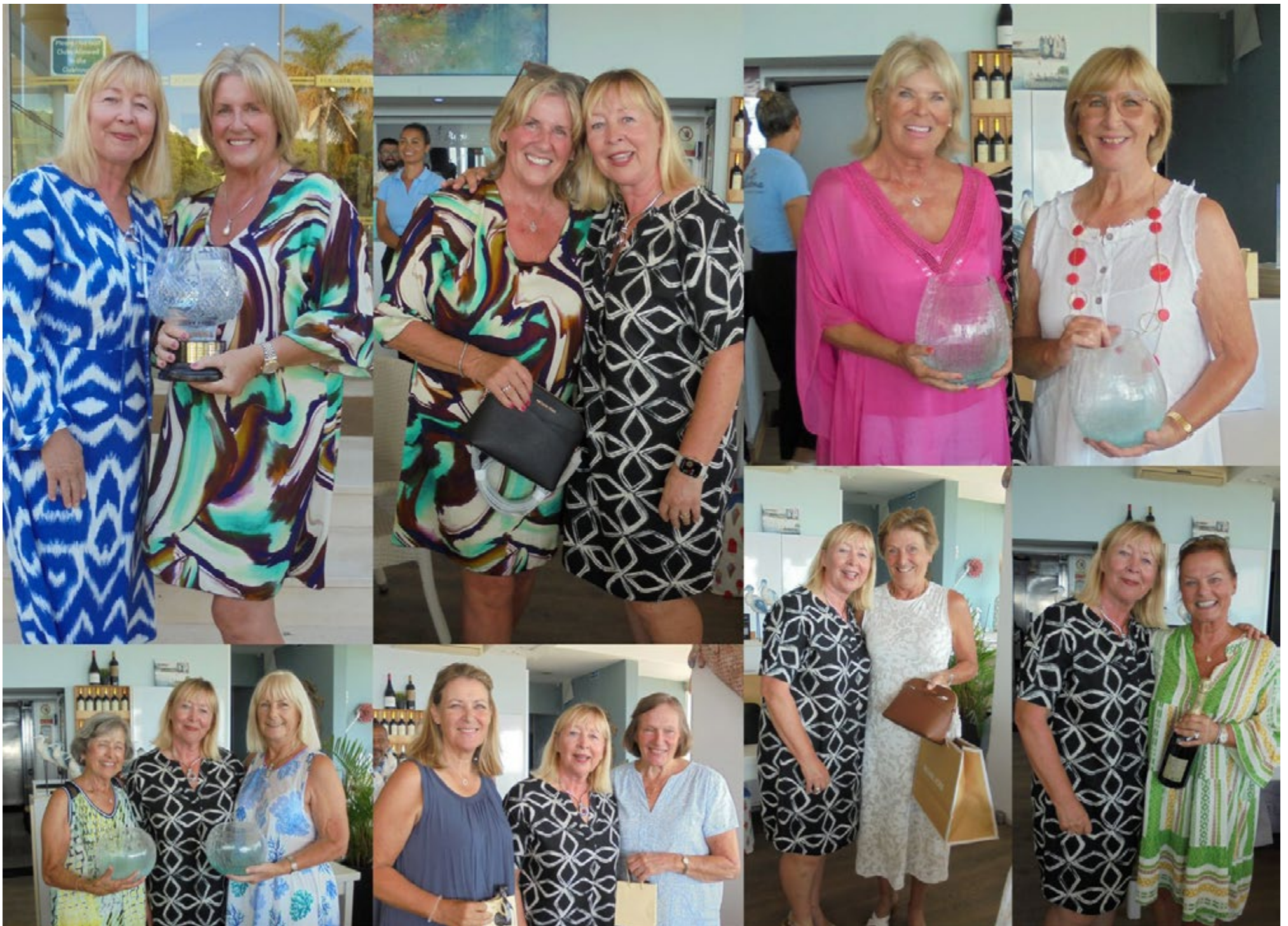
Lady Captain's Day Prize Winners