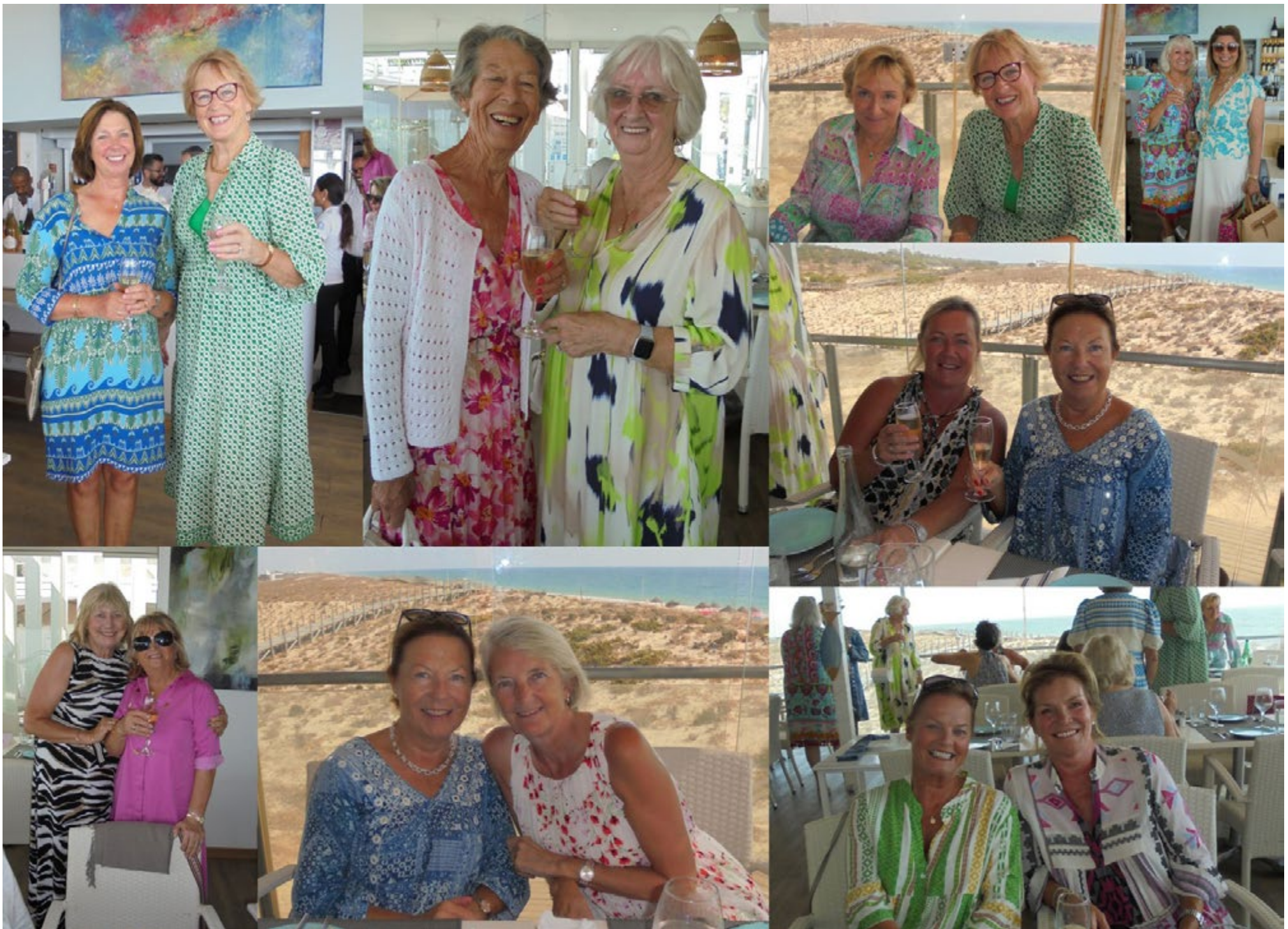
Lady Captain's Day