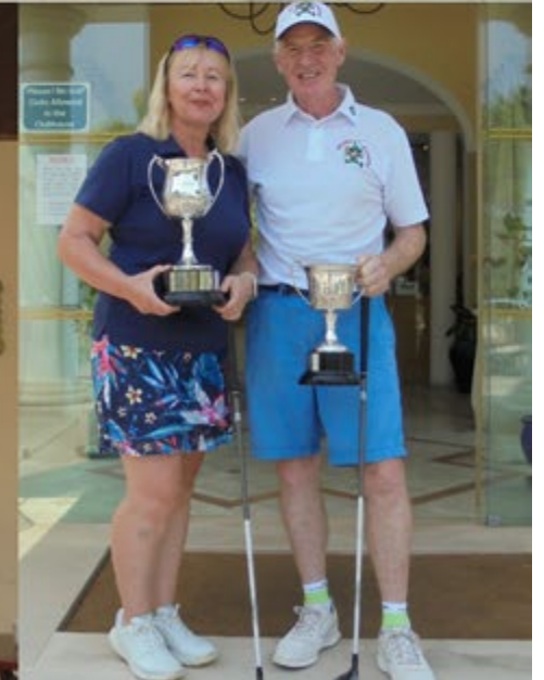
Matchplay Championship Prize Winners