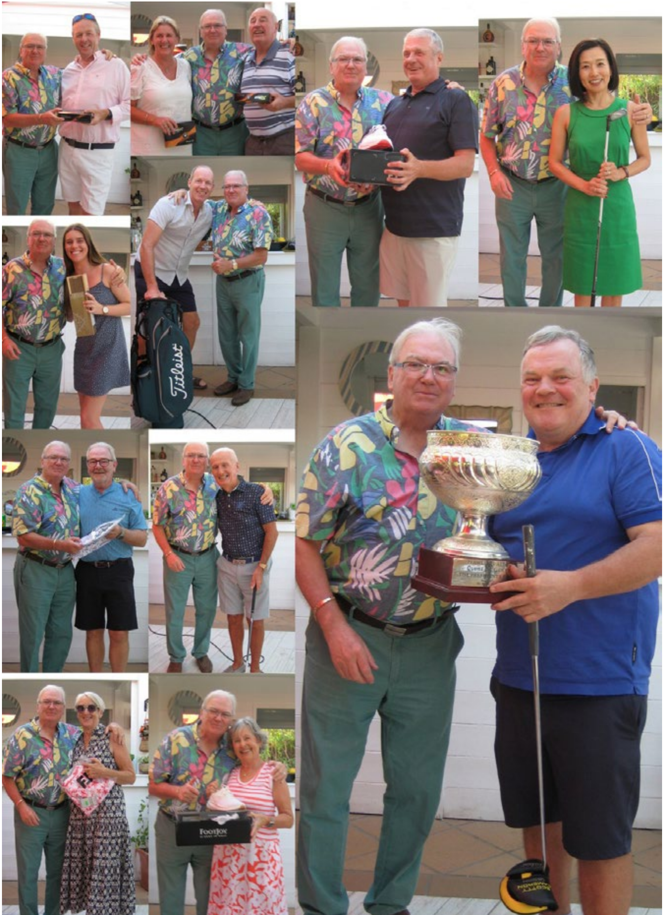
President's Day Prize Winners