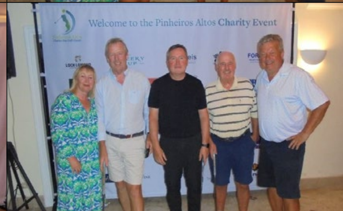
Charity Day Prize Winners