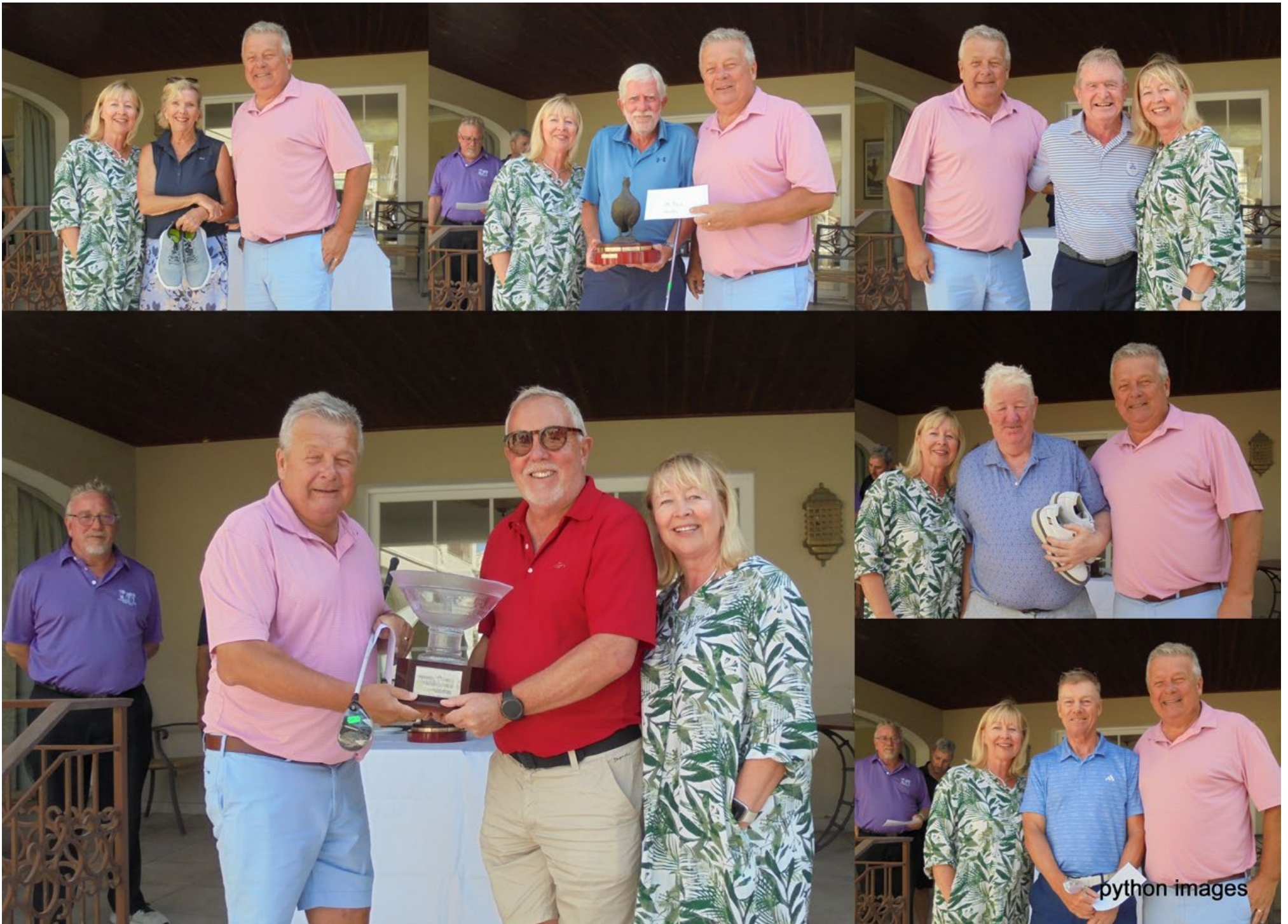
Seniors Championship Prize Winners