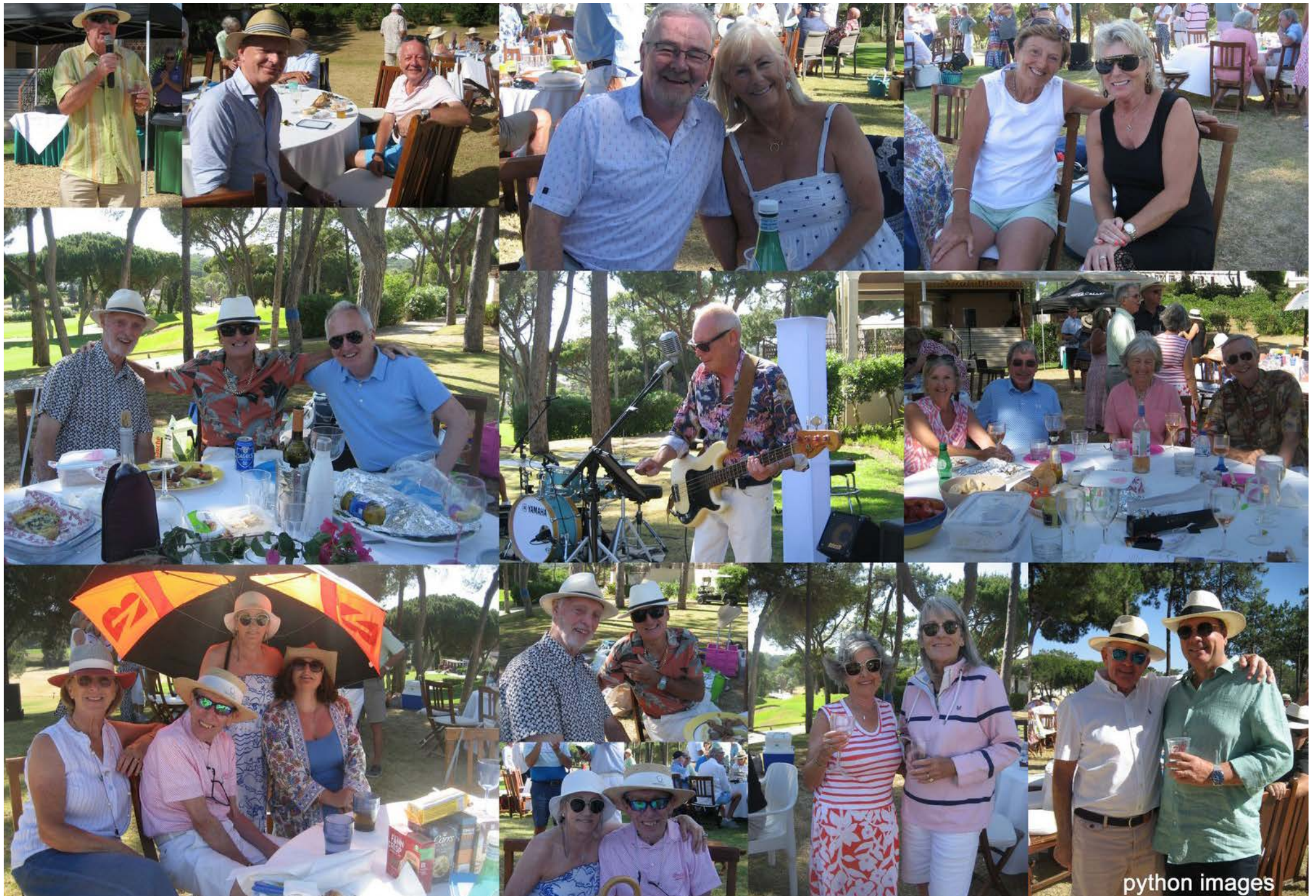
Picnic on the Green