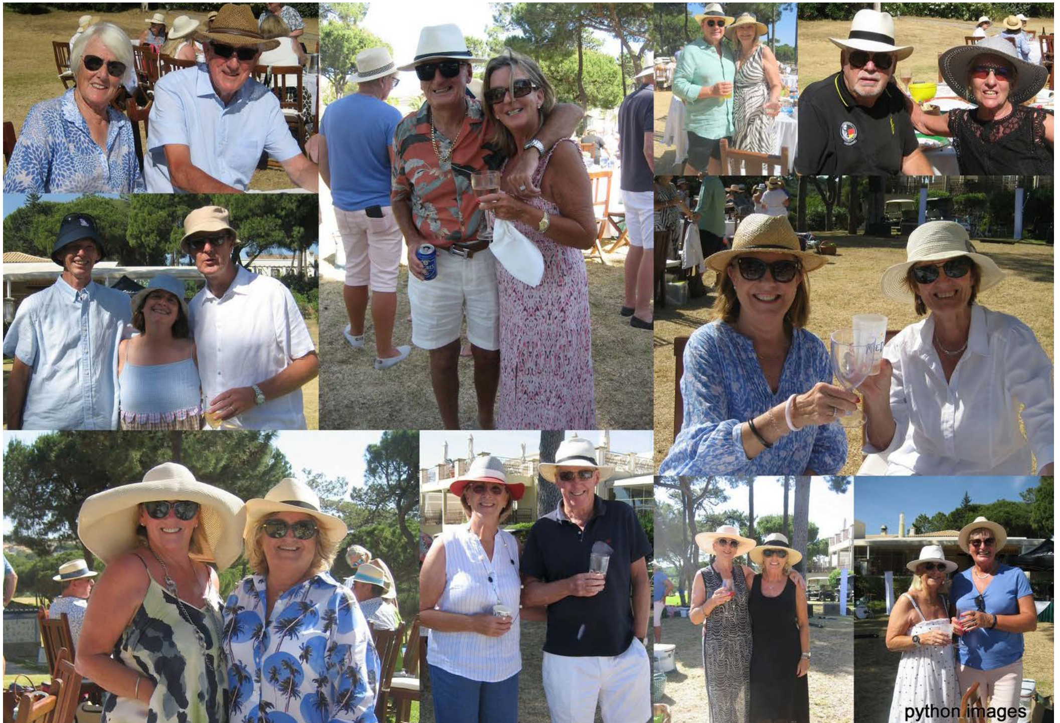
Picnic on the Green