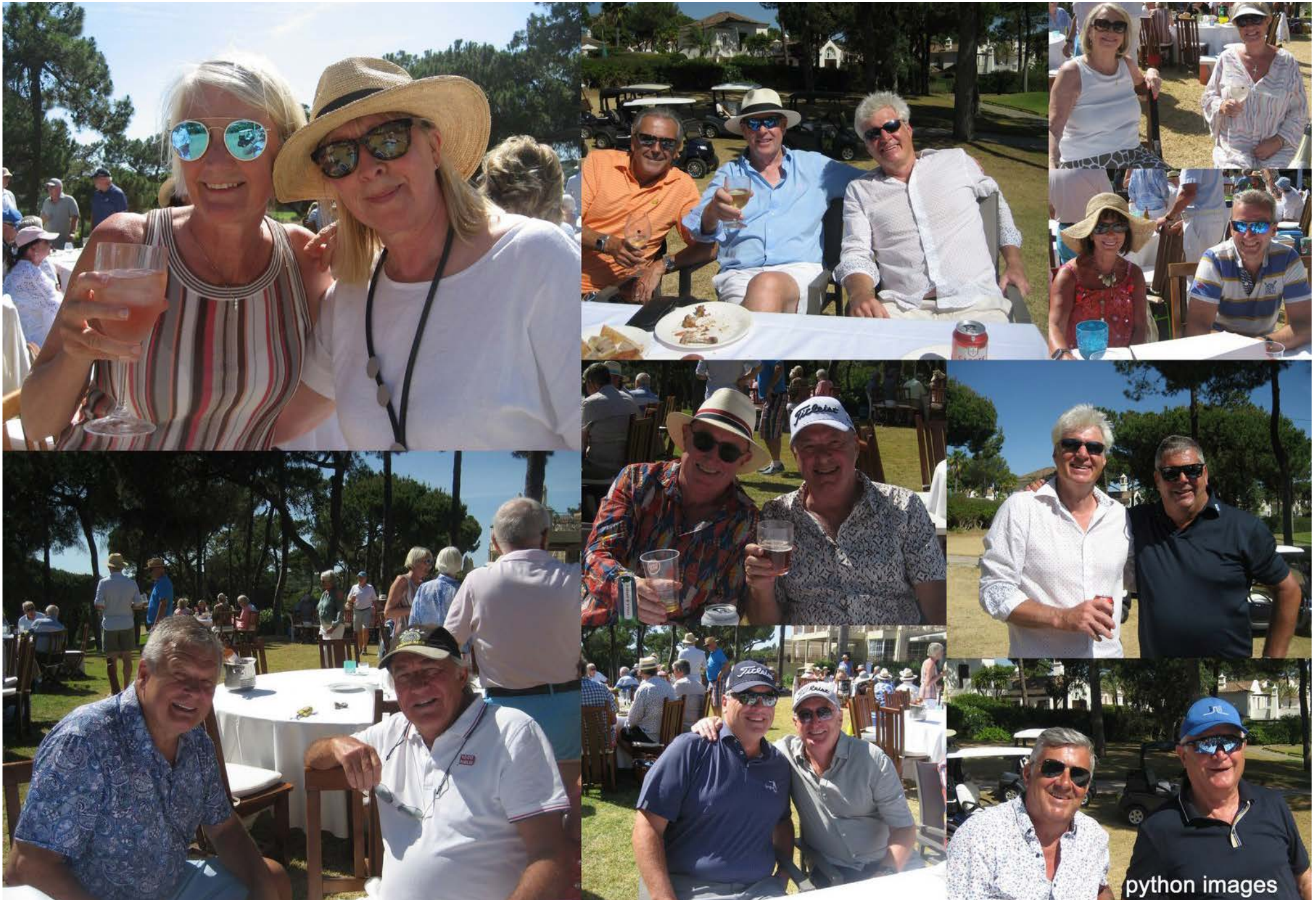
Picnic on the Green