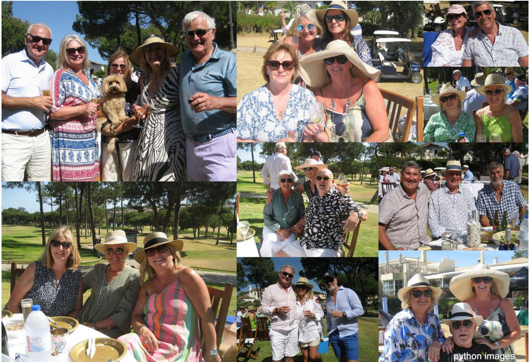
Picnic on the Green