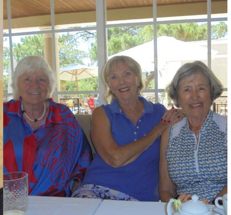
Past Lady Captains Day