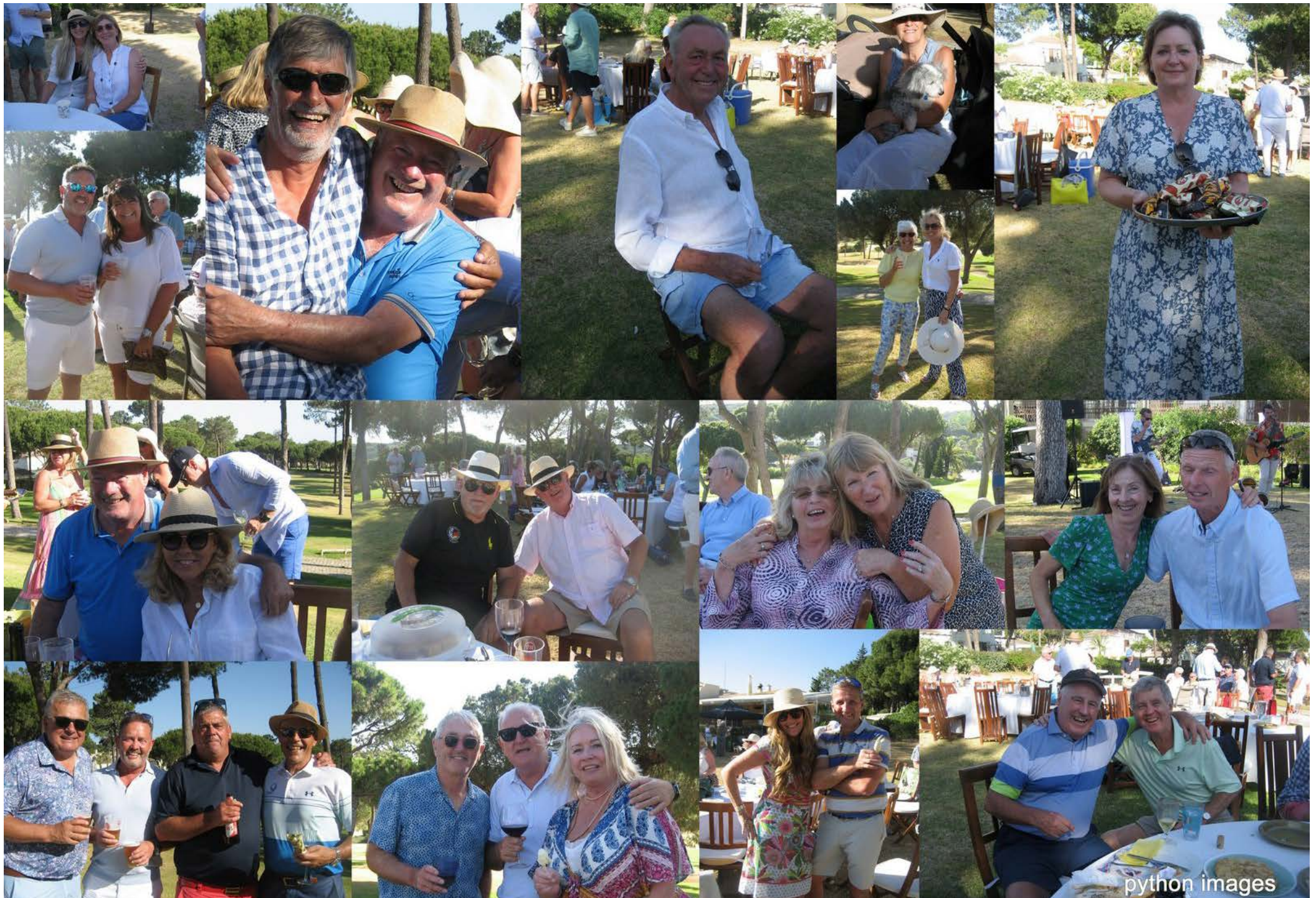
Picnic on the Green