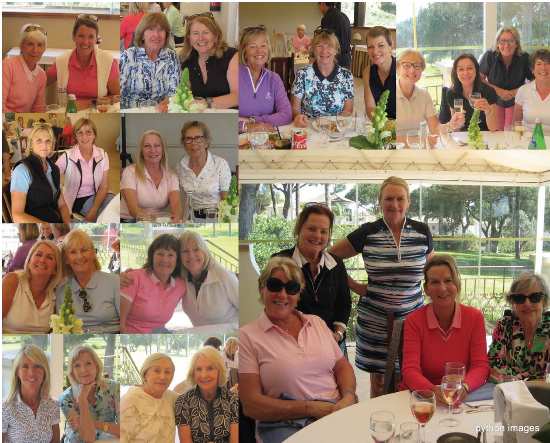
Lady Captain's Drive In Lunch