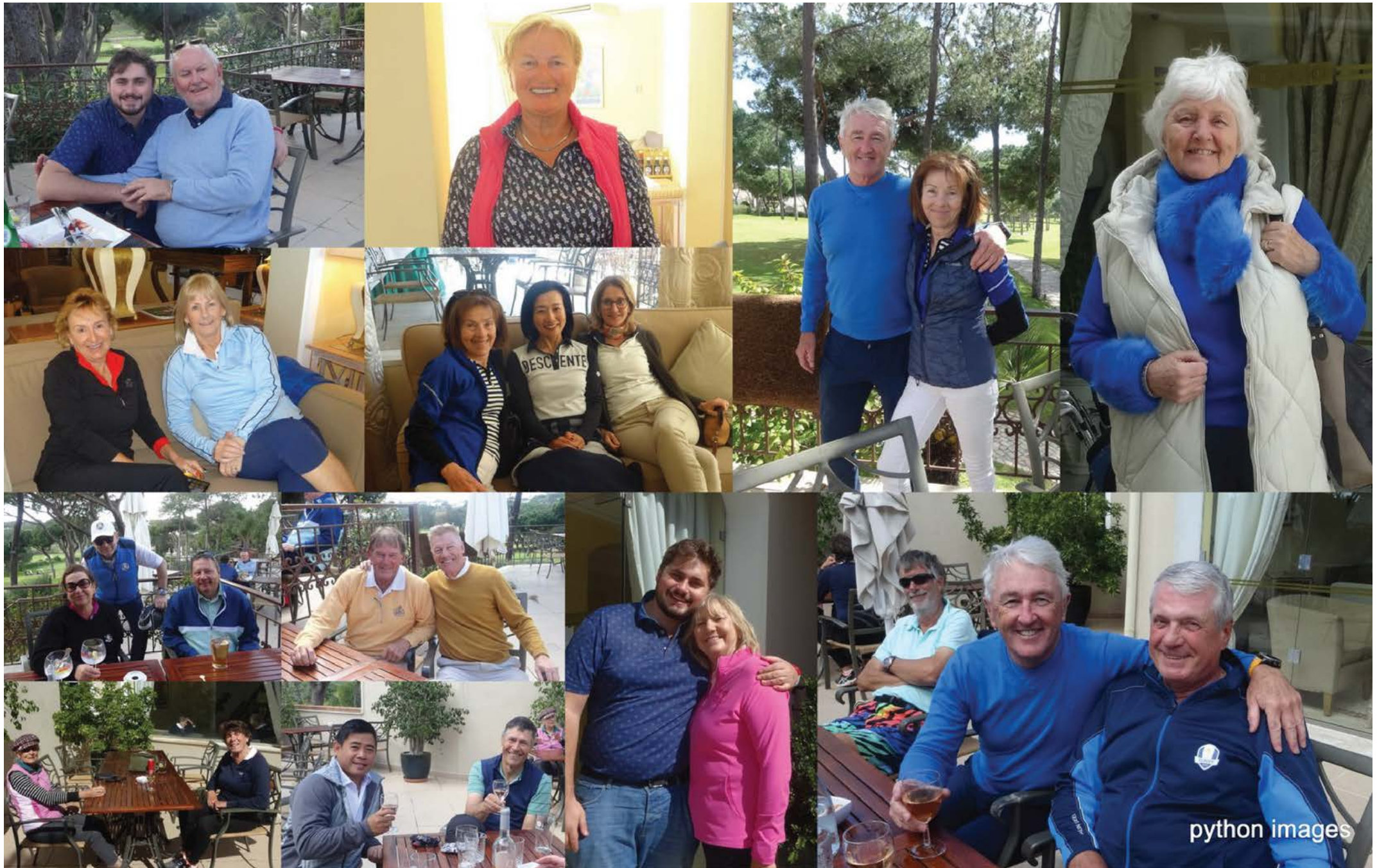
Men's Pairs Match Play