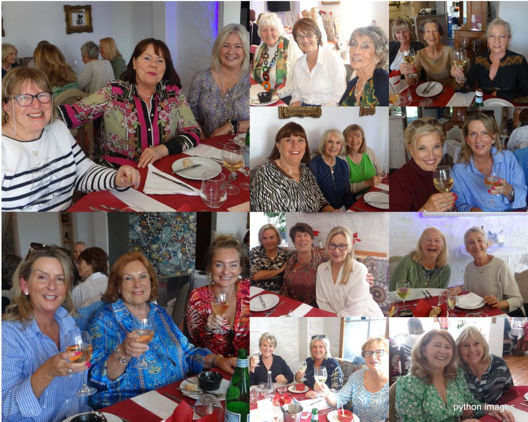
Ladies Social Lunch at Eden Restaurant