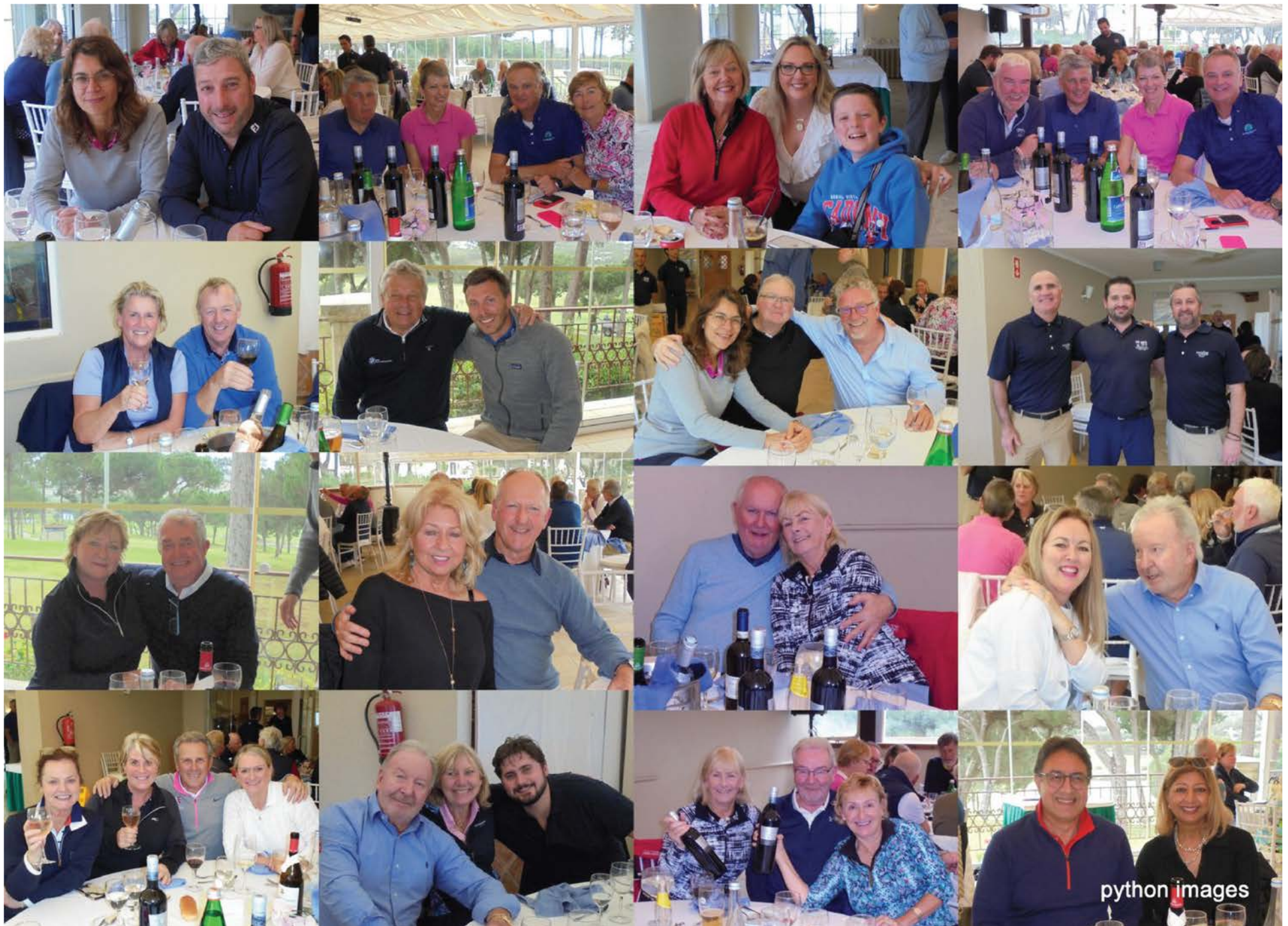
Captain's Drive In Lunch