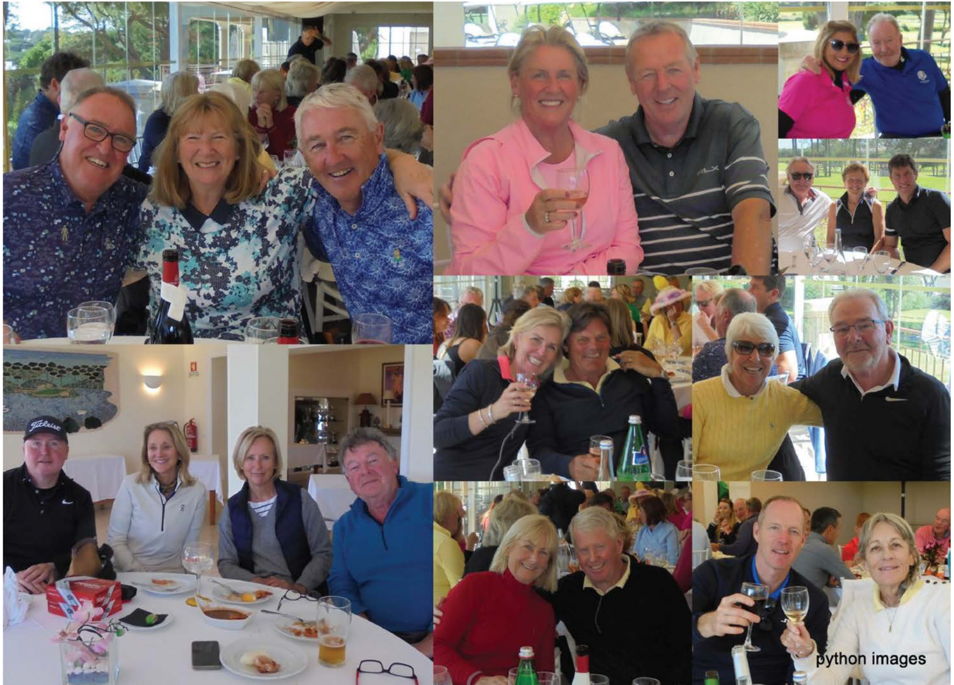
Easter Scramble Lunch