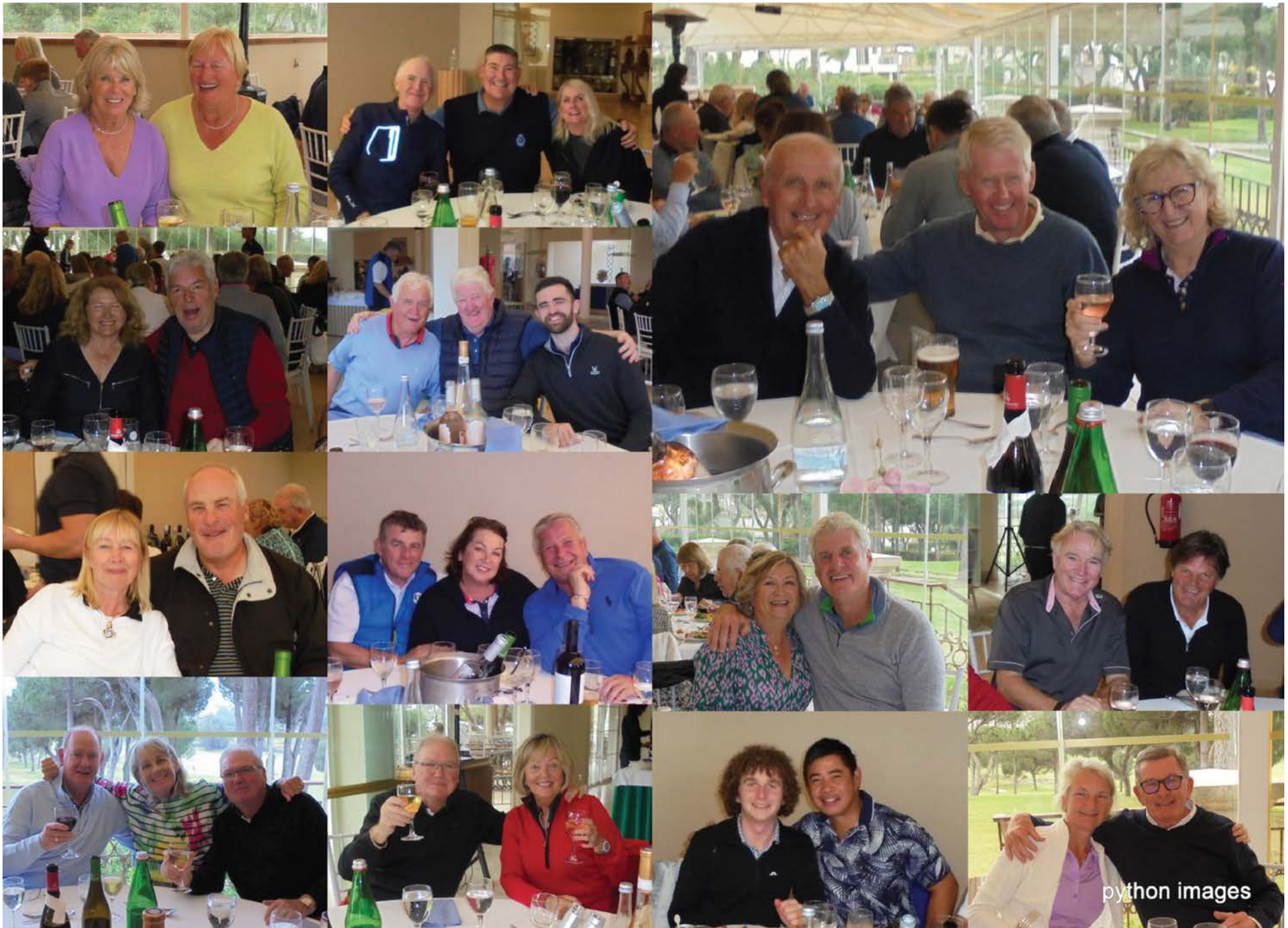
Captain's Drive In Lunch