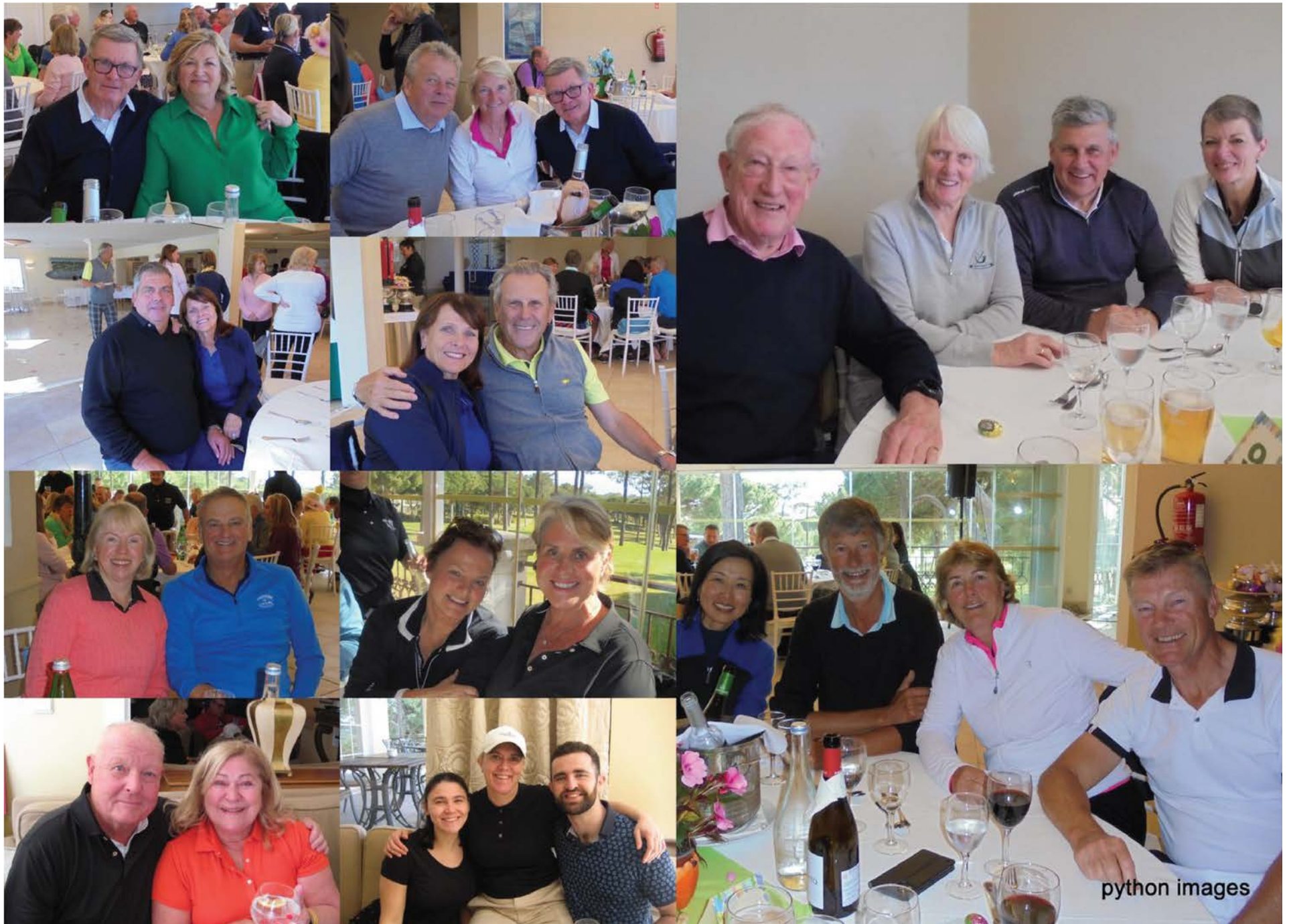
Easter Scramble Lunch