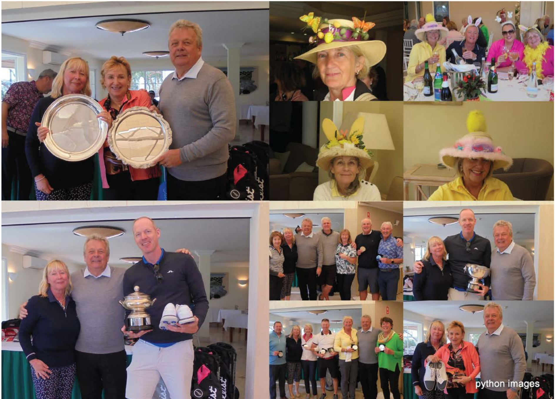
Easter Scramble Prize Presentation