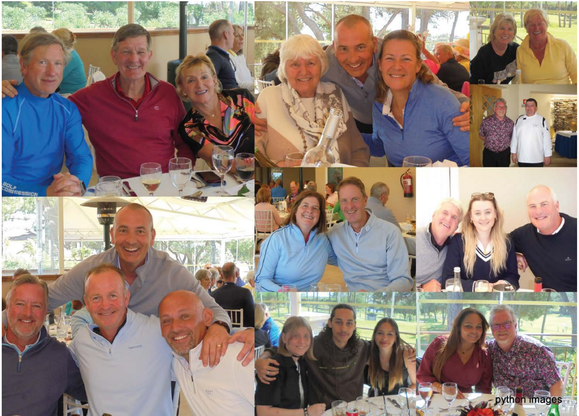
Easter Scramble Lunch