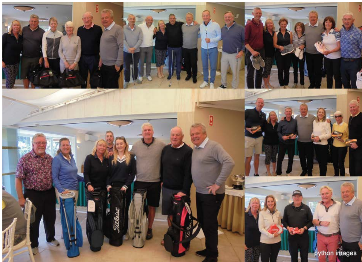
Easter Scramble Prize Winners

I hope to see many of you at the club and wish you all great golfing!