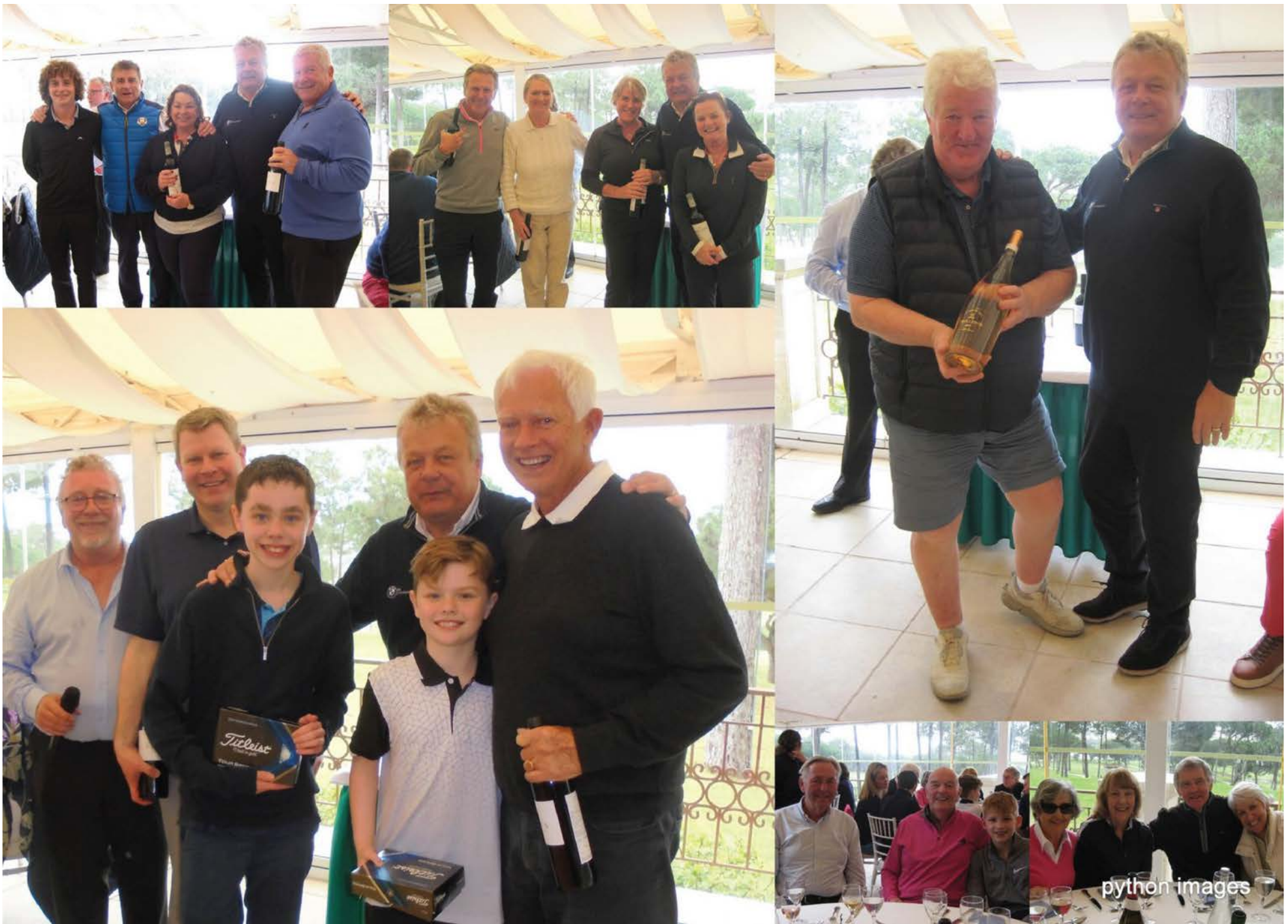
Captain's Drive In 9 Holes Scramble Prize winners