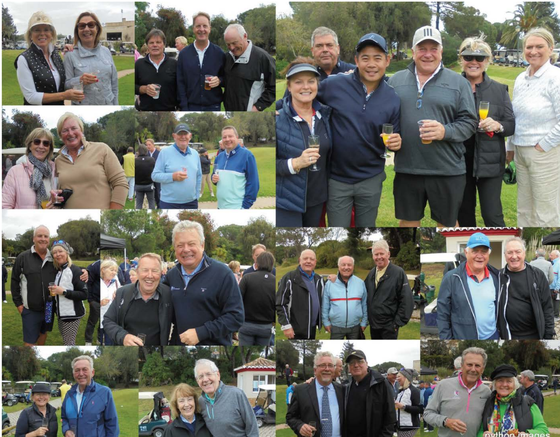
Captain's Drive In