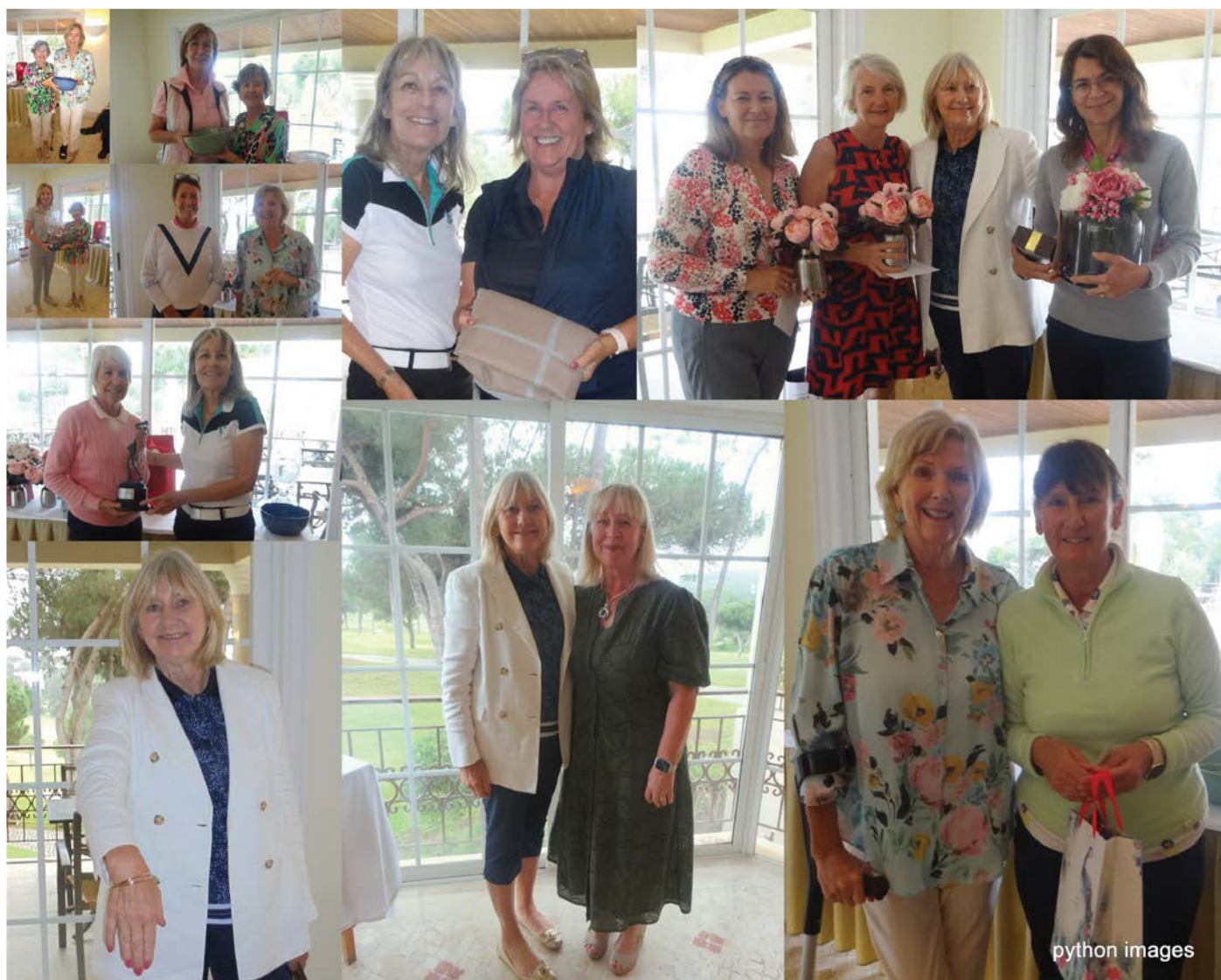
2024 Ladies AGM