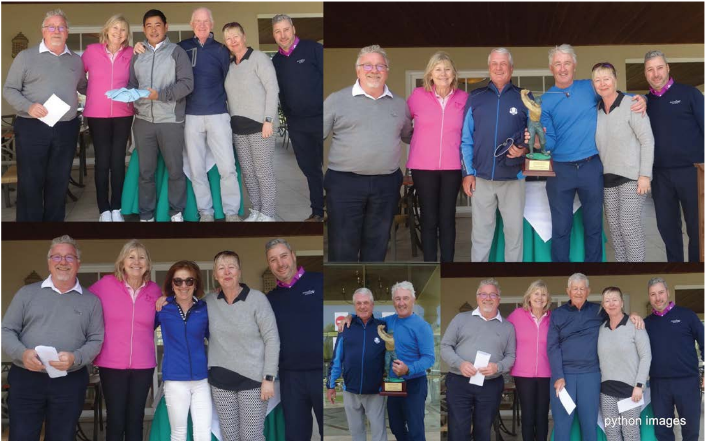
Men's Pairs Match Play Prize Winners

play-play which also has been run over 4 days and sometimes even had 36 holes played in one day, we have decided to run it during the year and play the final 2 rounds over 2 days on 21st & 22nd September 2024. Entries are open until 5th May and early matches will be played between May & September 2024. Make sure you sign in before the 5th May if you wish to enter.