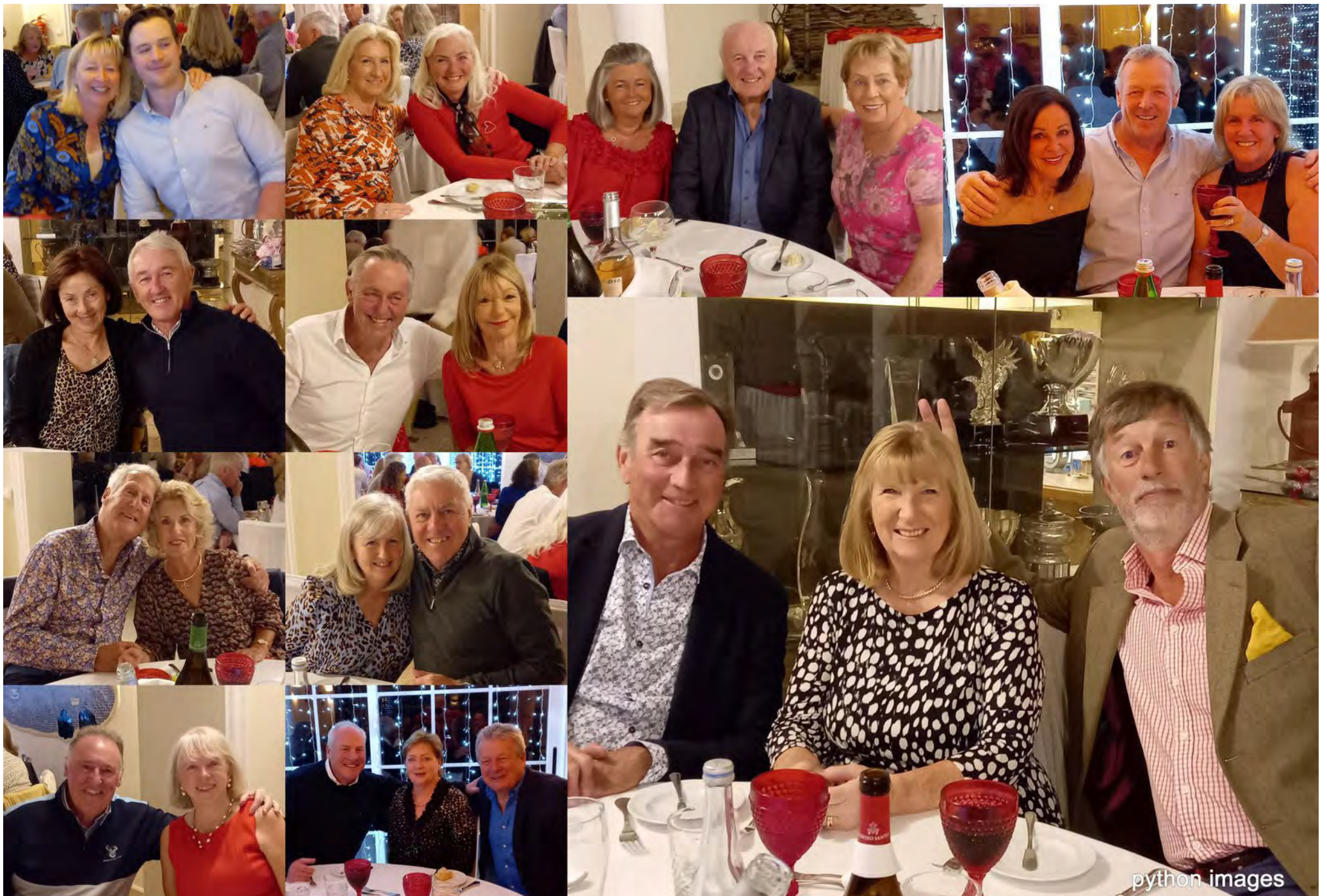
St Valentine's Day Prize Dinner