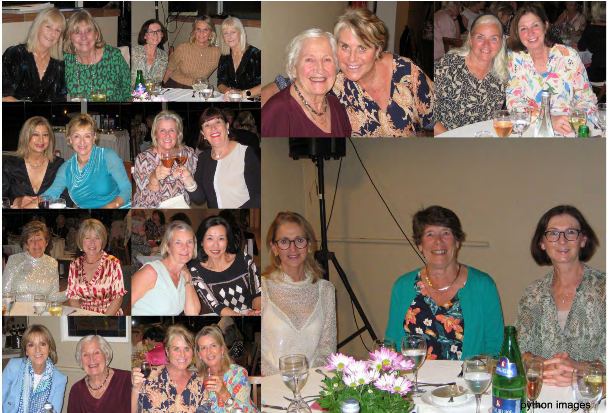
Lady Captain's Day Dinner