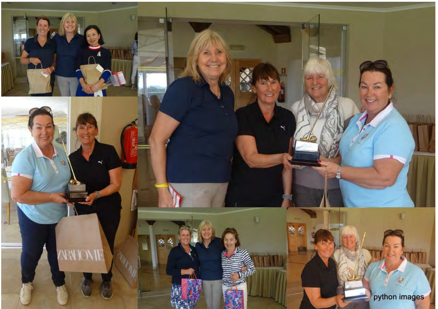
Ladies Foursomes Championship