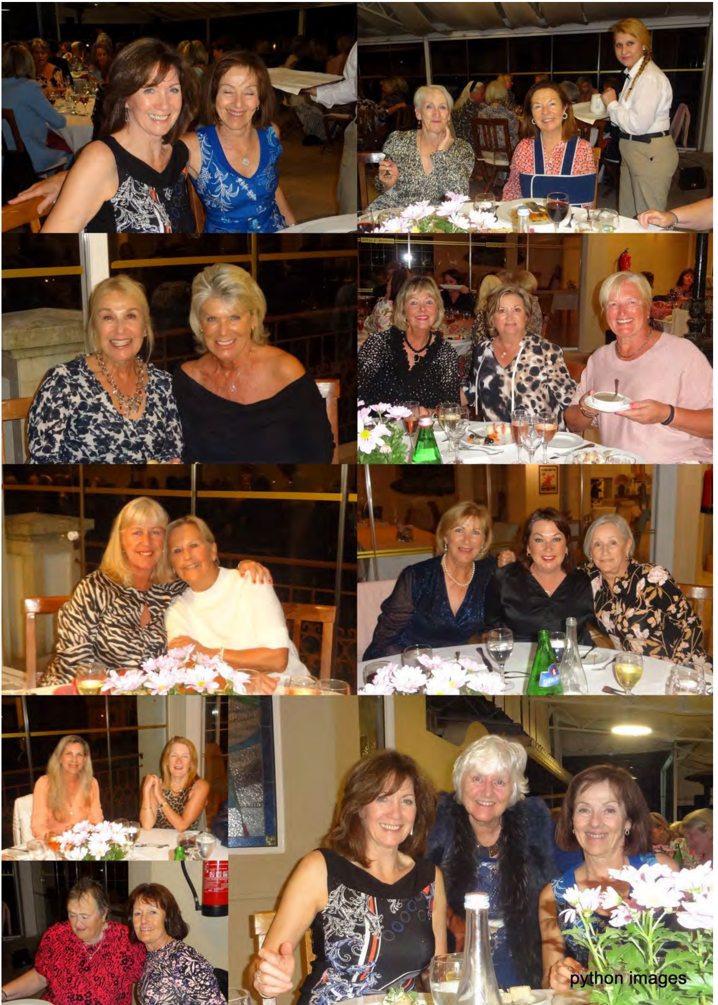
Lady Captain's Day Dinner