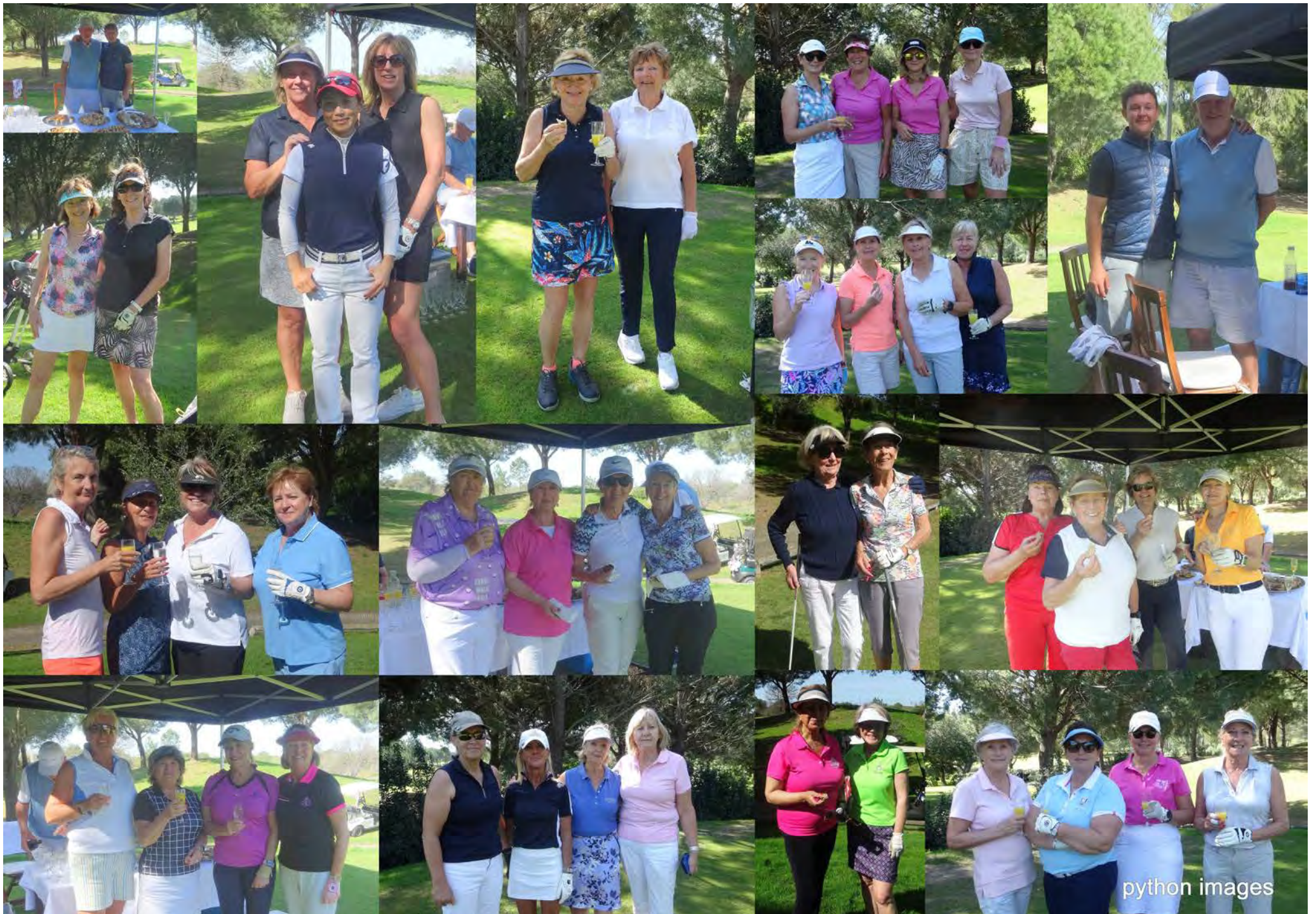
Lady Captain's Day