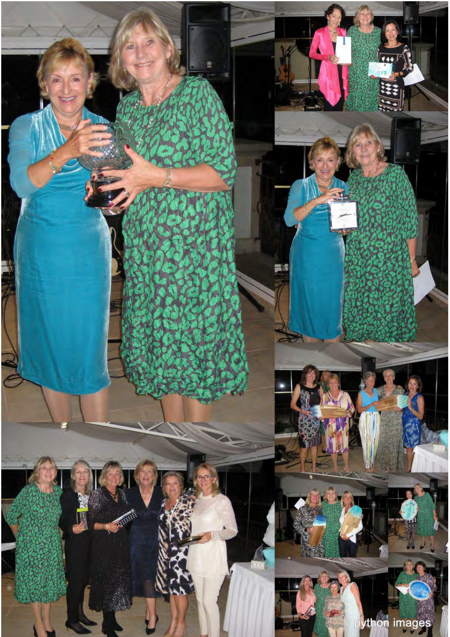
Lady Captain's Day Prize Winners