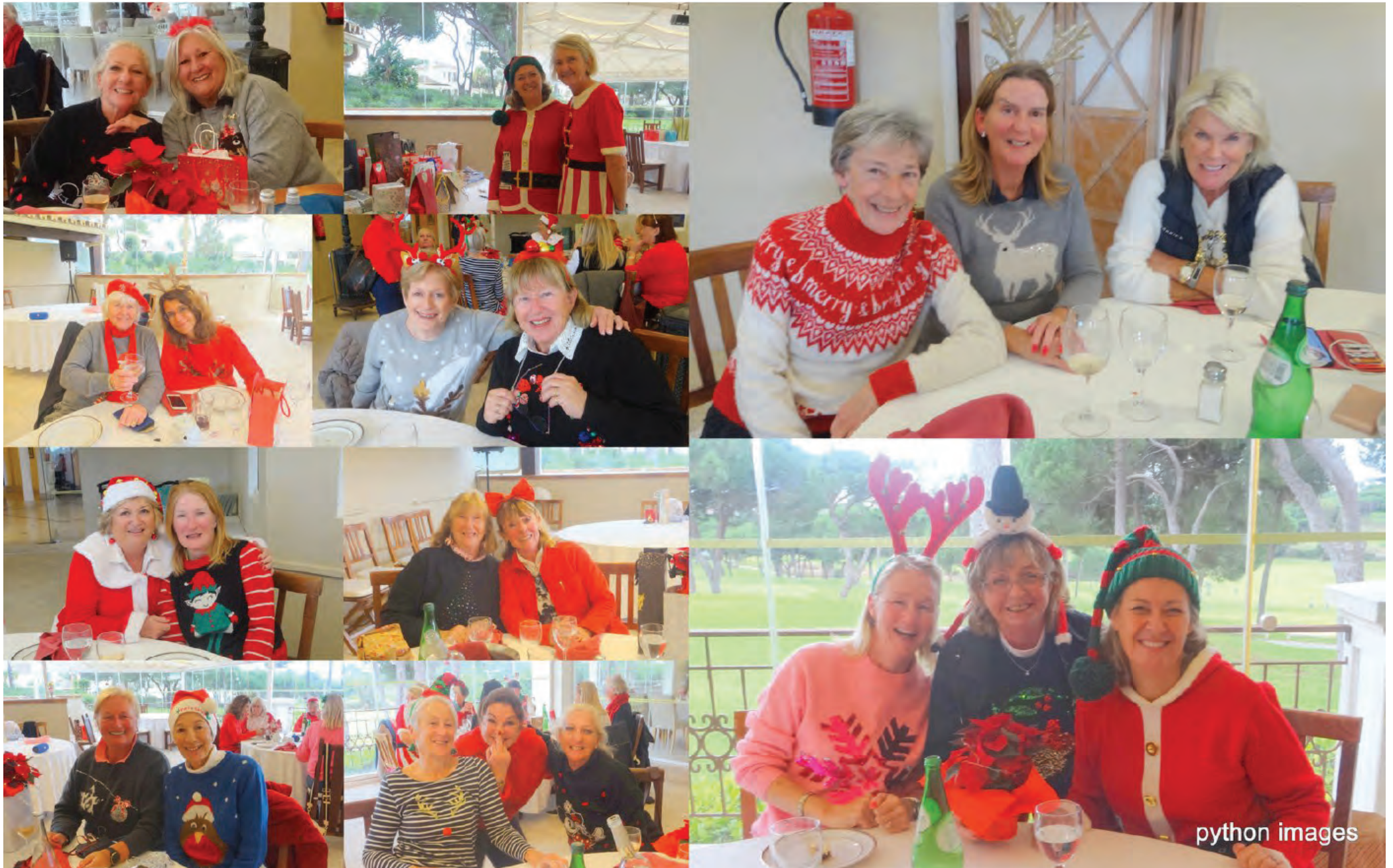
Ladies Christmas Competition