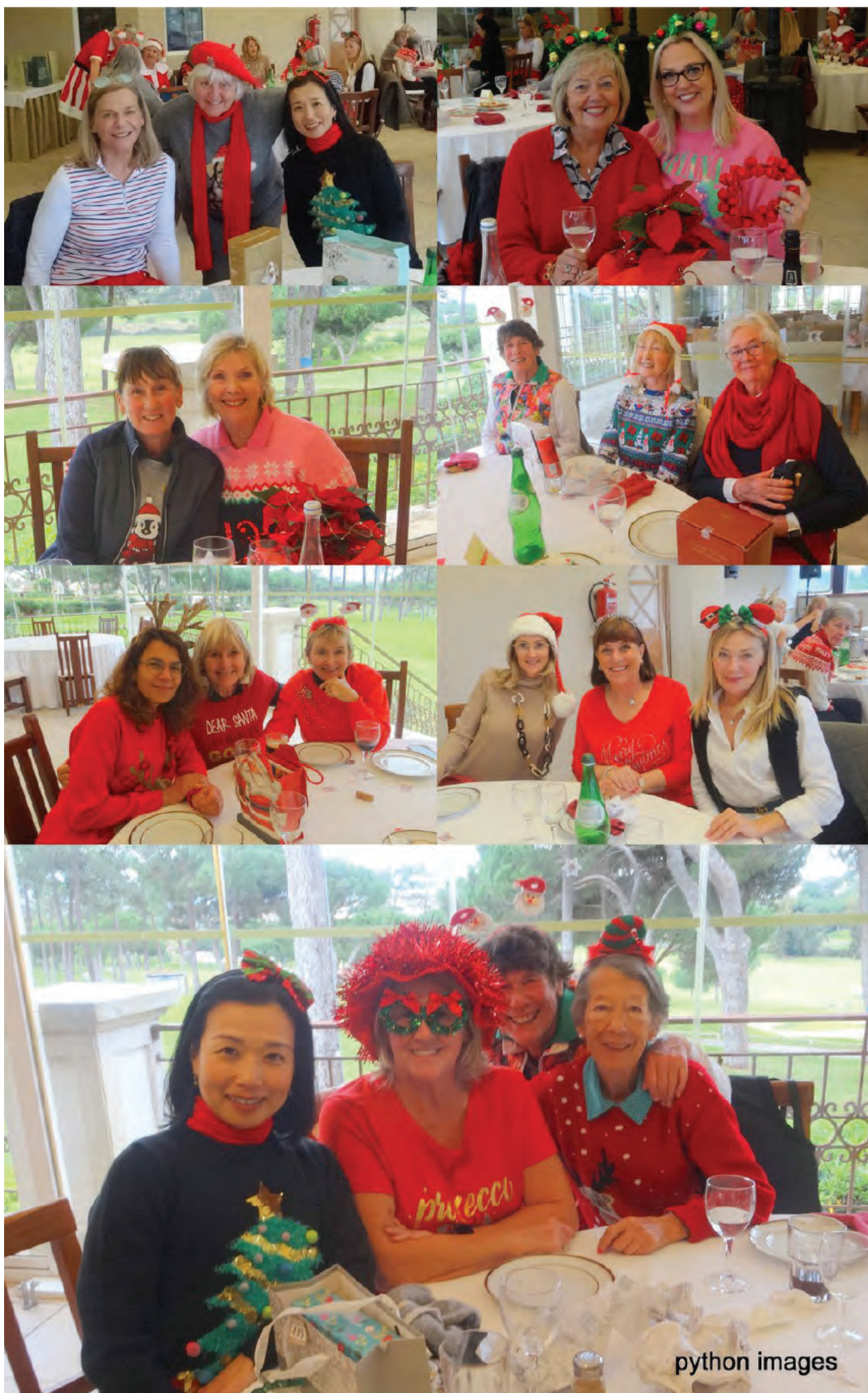
Ladies Christmas Competition