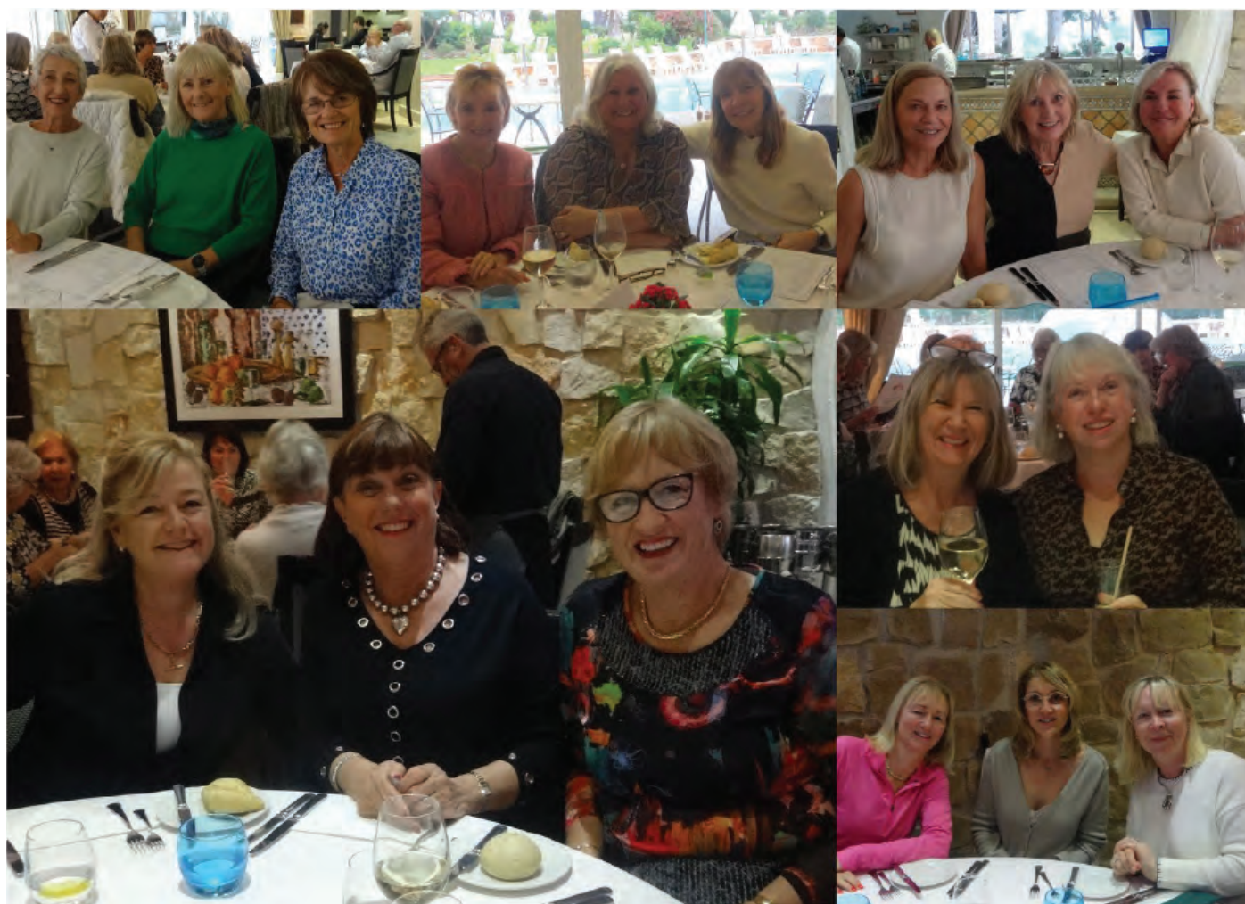
Ladies Social Lunch at Four Seasons Country Club