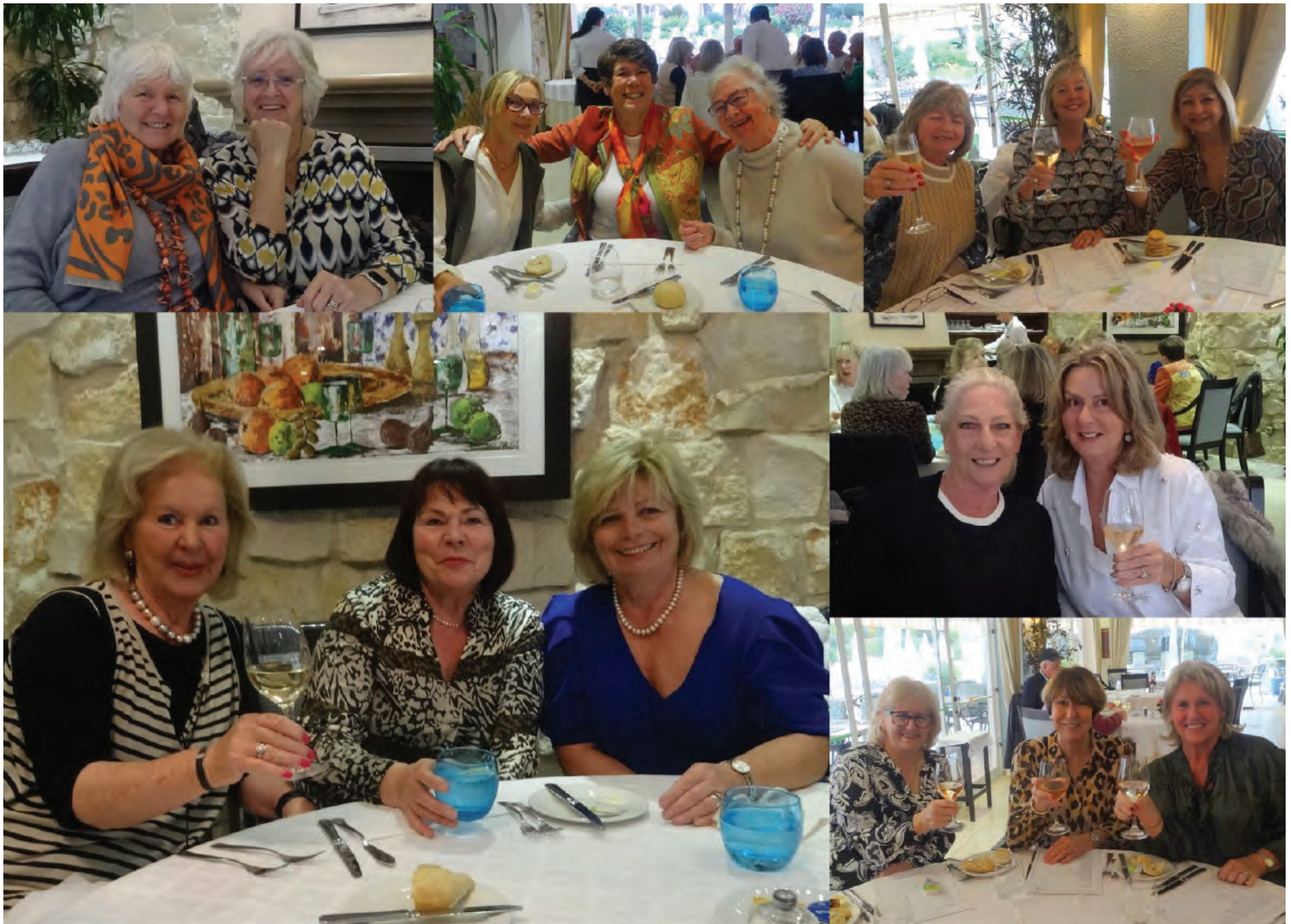
Ladies Social Lunch at Four Seasons Country Club