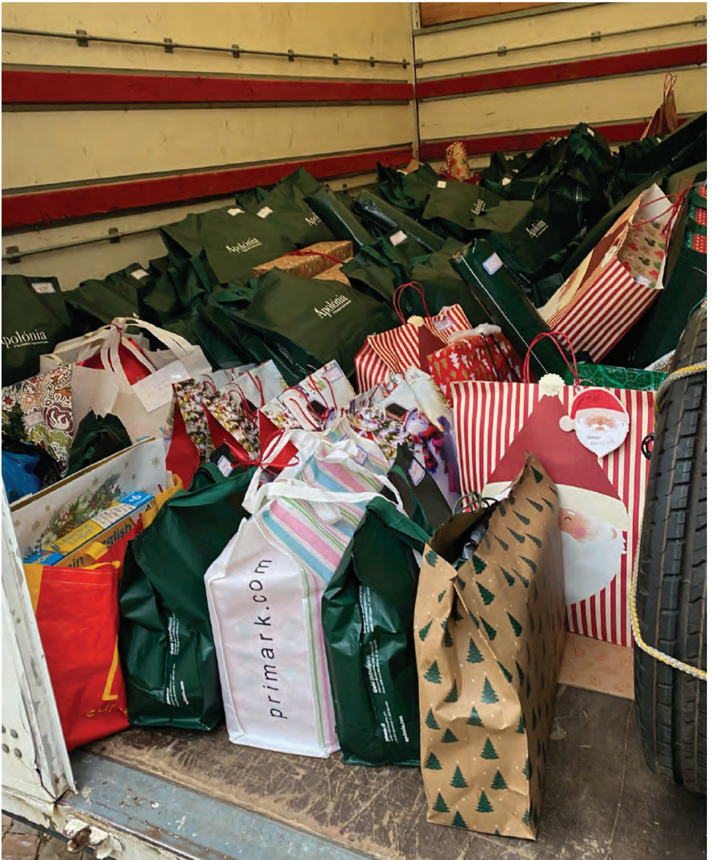
195 Christmas presents were donated to local children