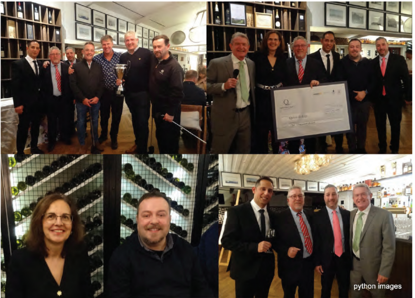
Algarvian Charity Pro Am