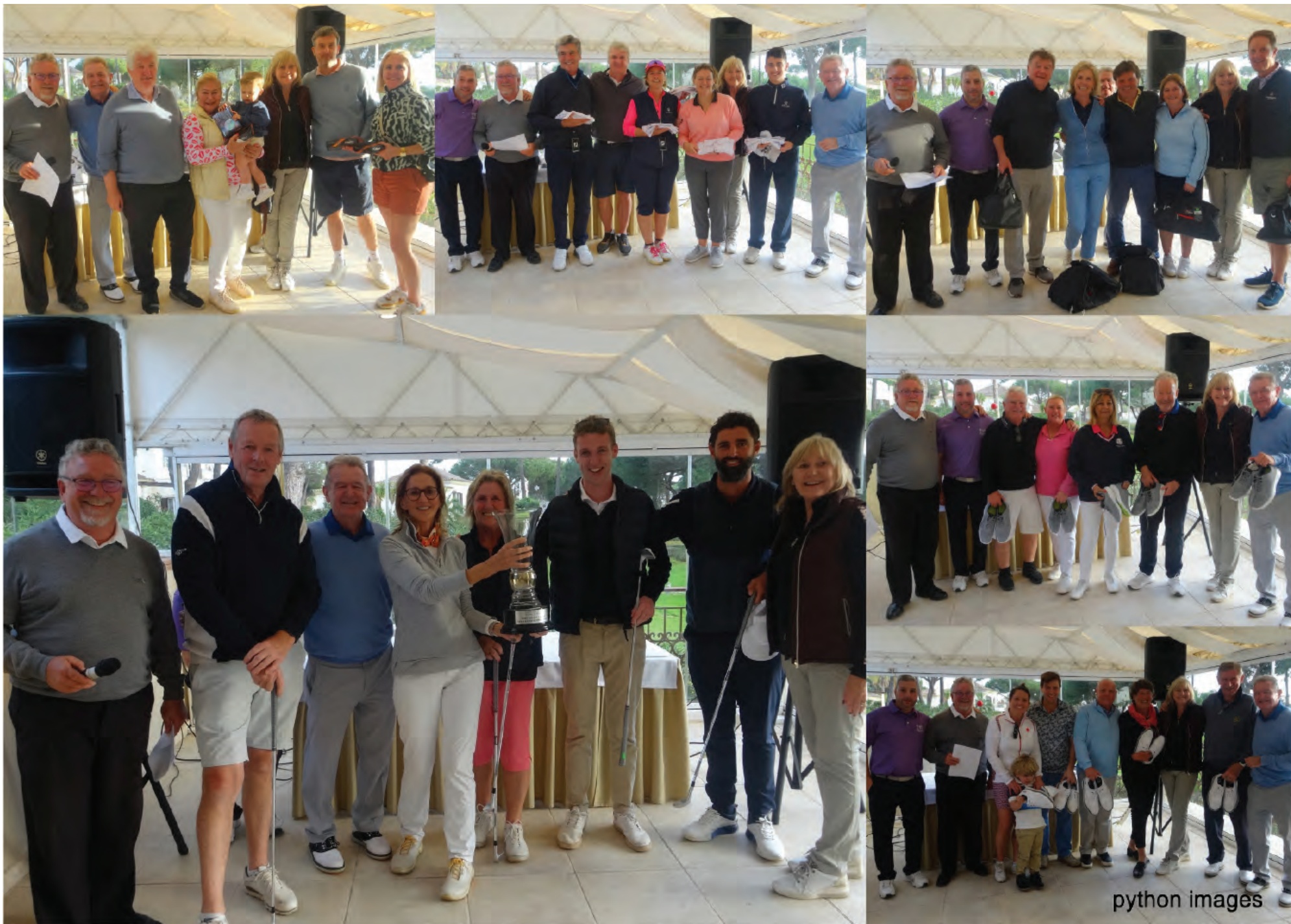
New Year's Scramble Prize Winners