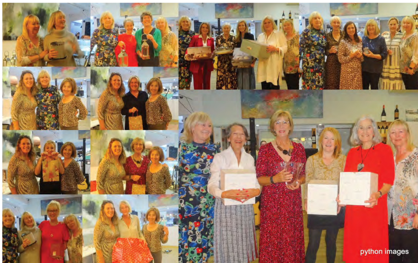
Ladies Annual Dinner