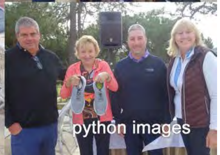
Seniors Championship Prize Winners