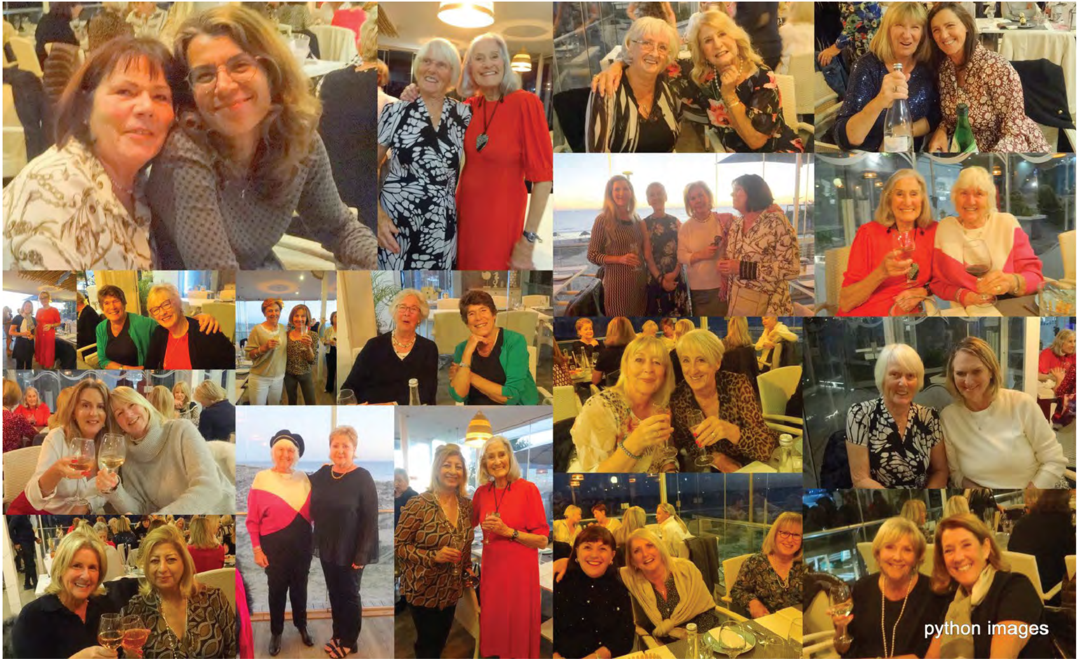
Ladies Annual Dinner