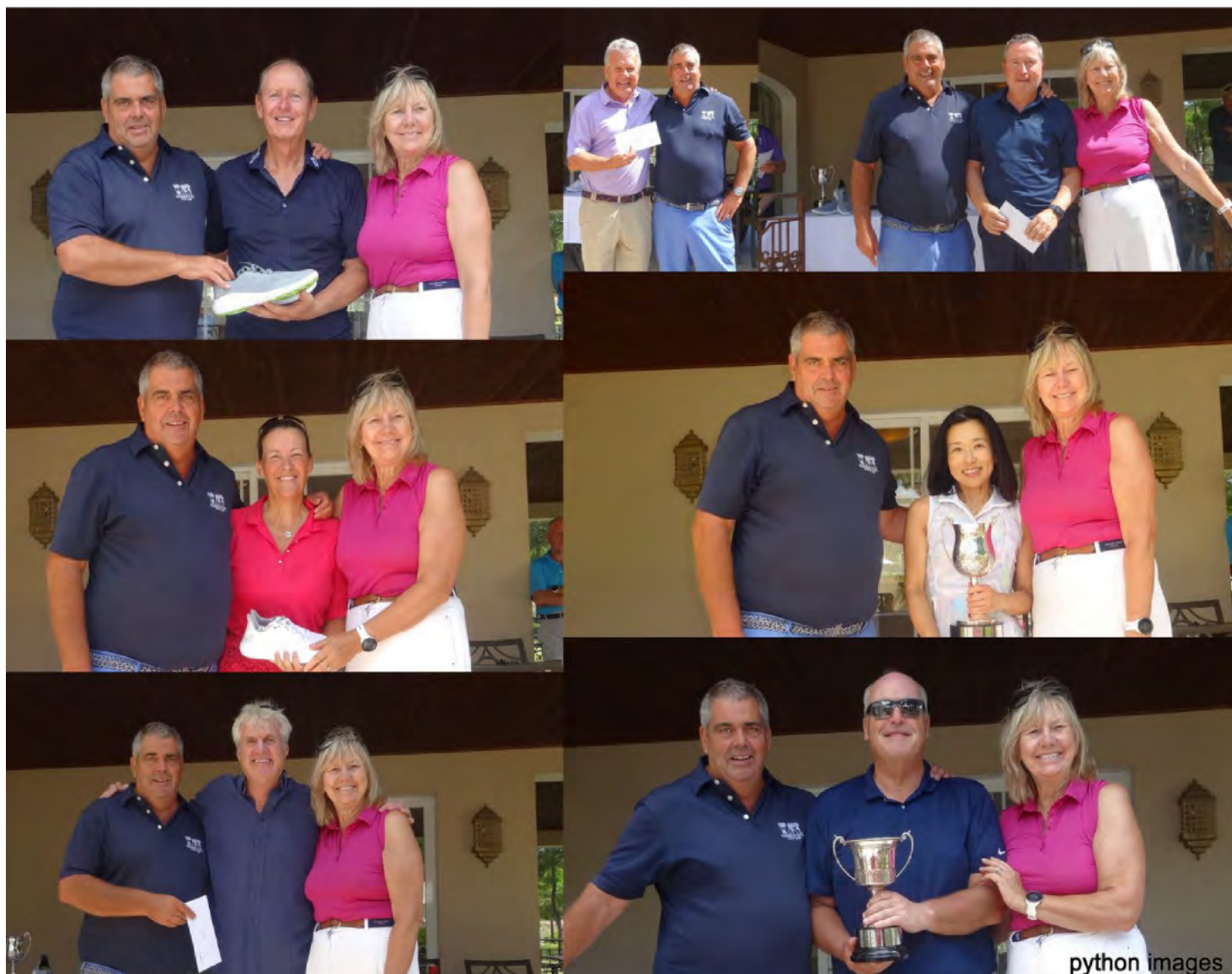
Matchplay Championship Prize Winners