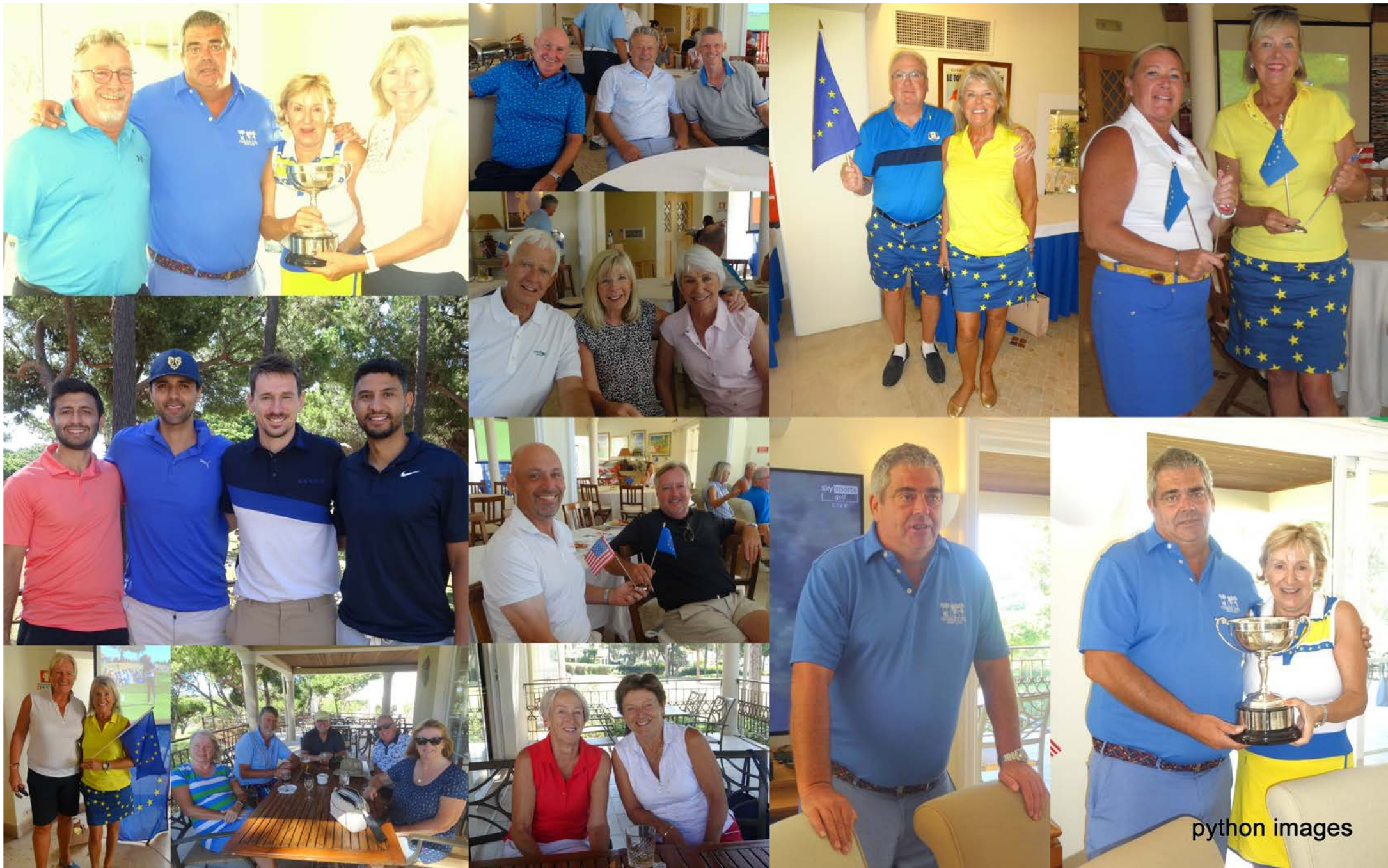
Ryder Cup at Pinheiros Altos