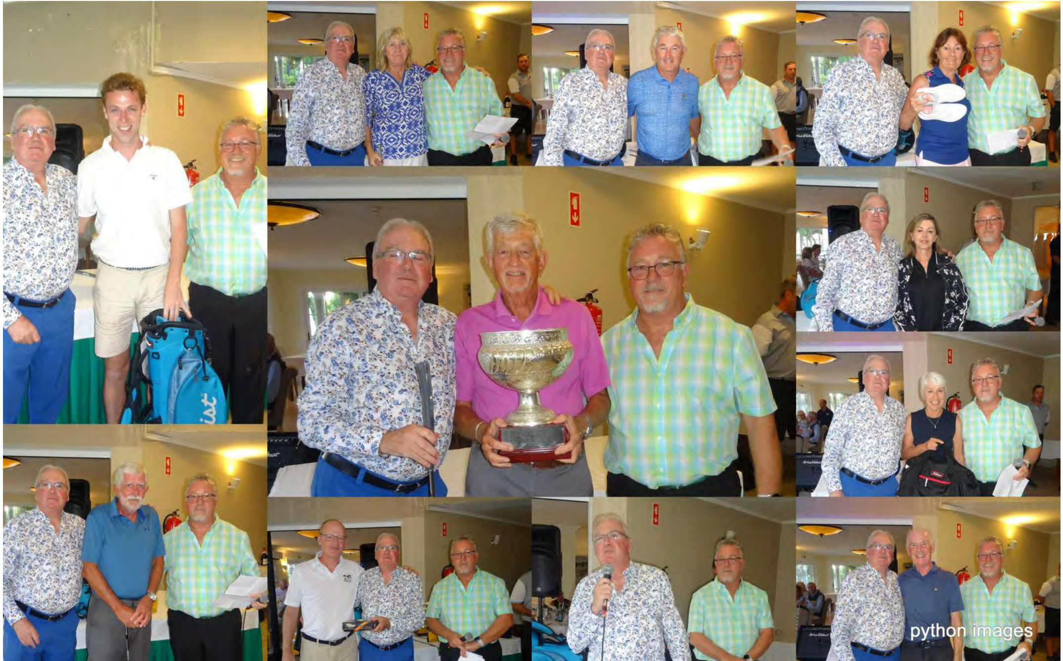
President's Putter Prize Winners