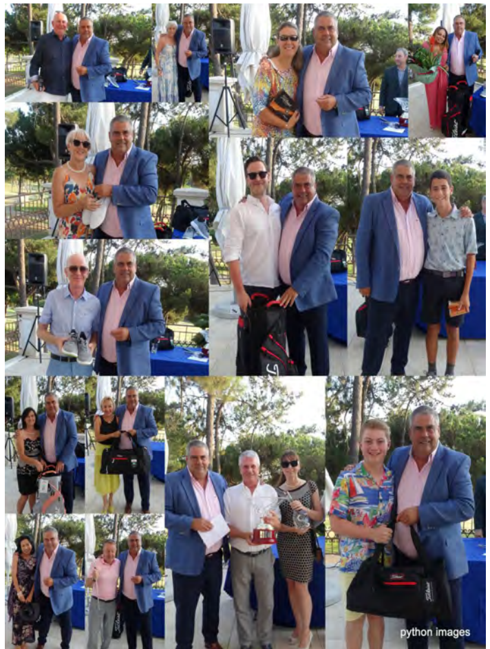
Captain's Day Prize Winners

To all those who are currently away, we send our best wishes for a fantastic time and eagerly anticipate your fast and secure return.