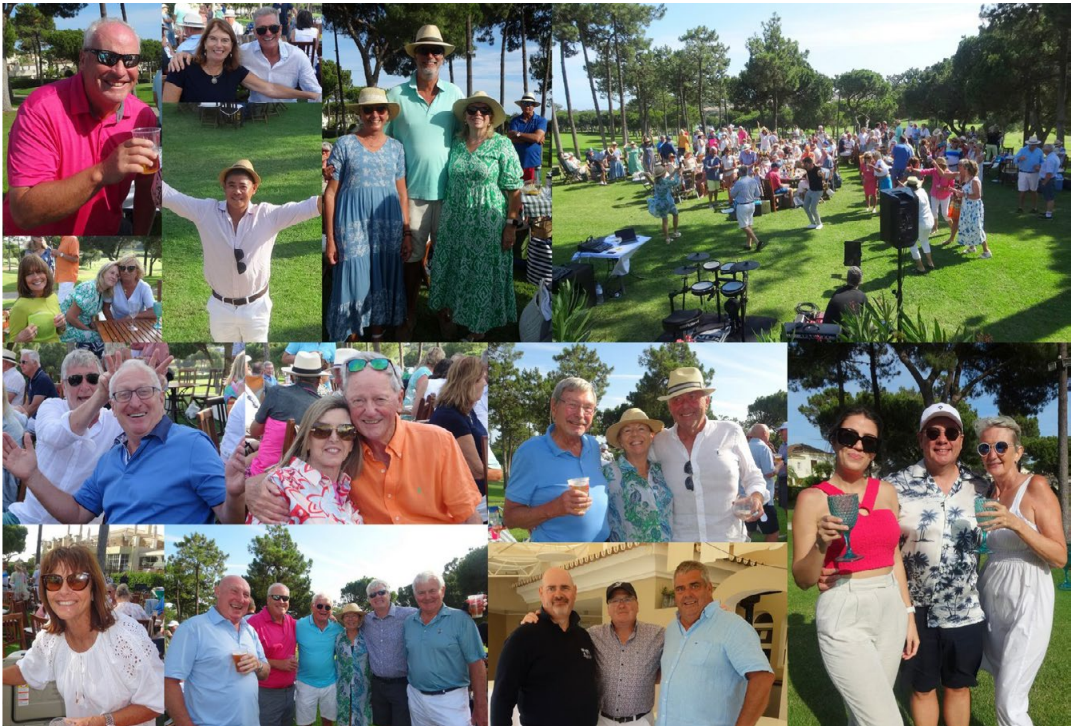
Picnic on the Green