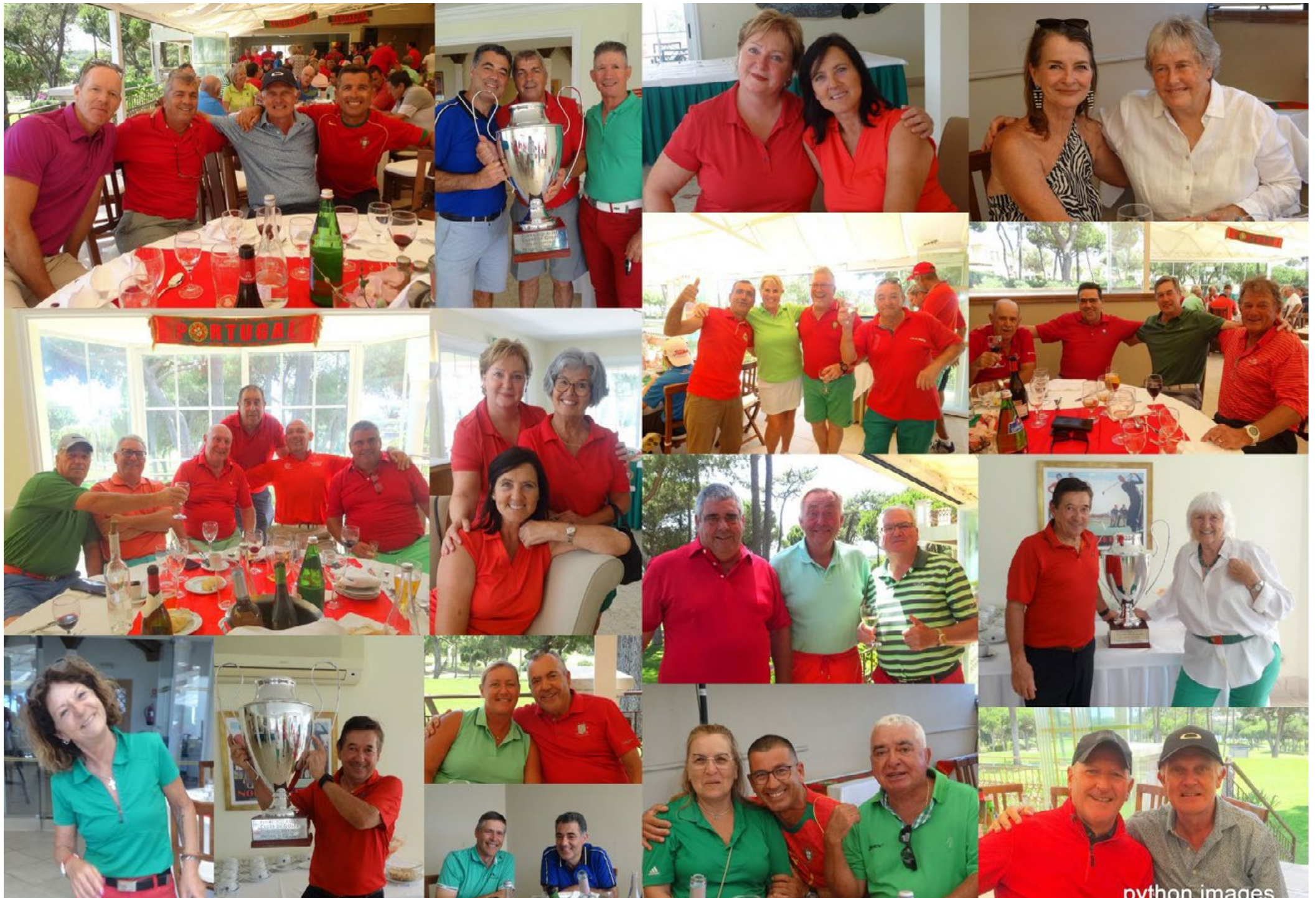
Portuguese Day Celebrations