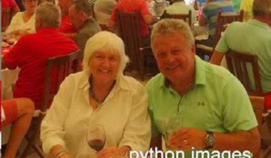
Portuguese Day Celebrations