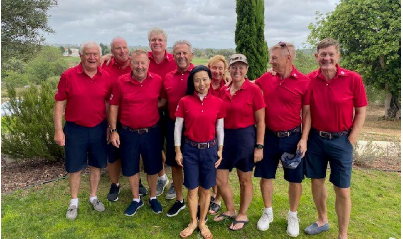
Pinheiros Altos Interclub Team against Silves – 14 th June