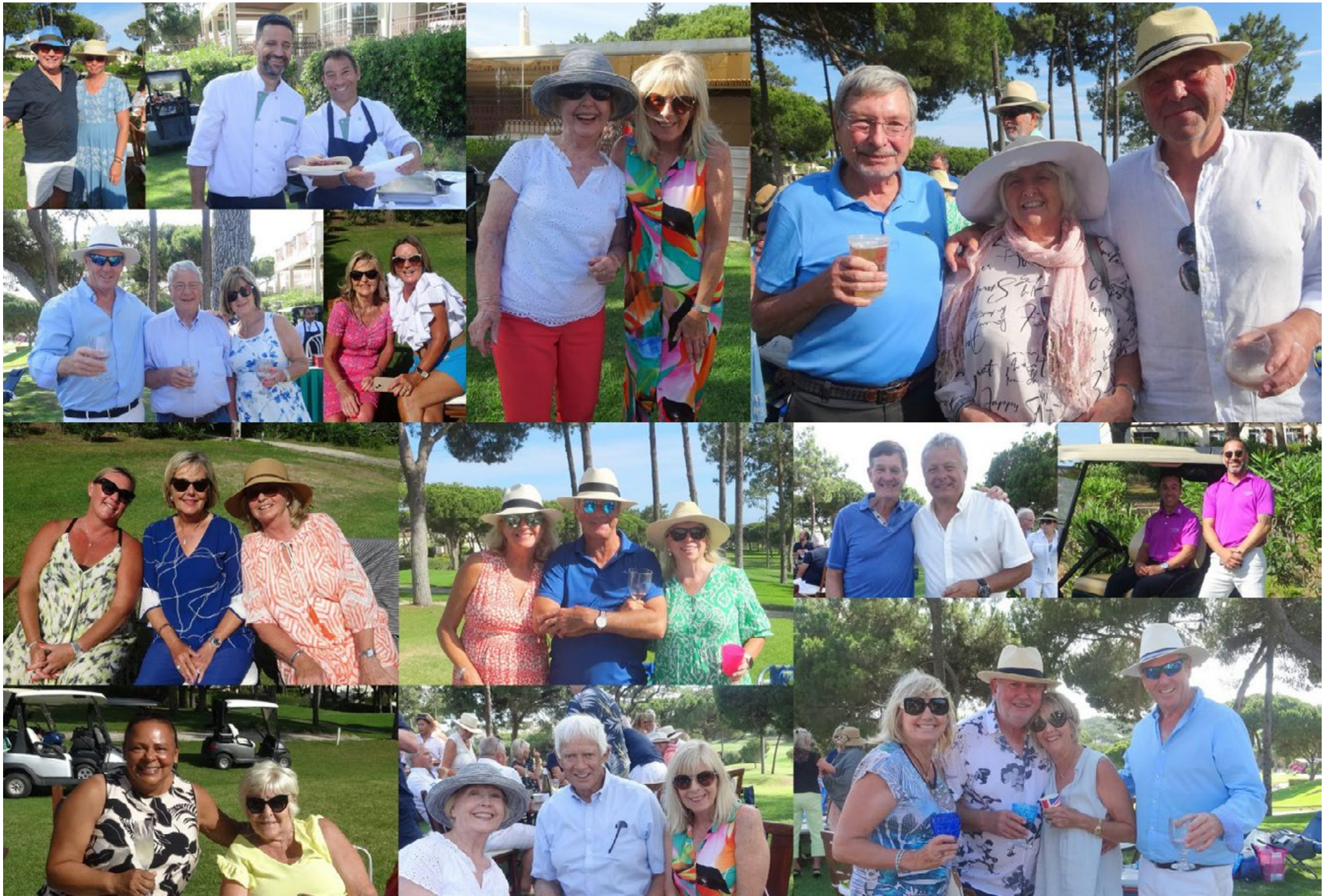
Picnic on the Green