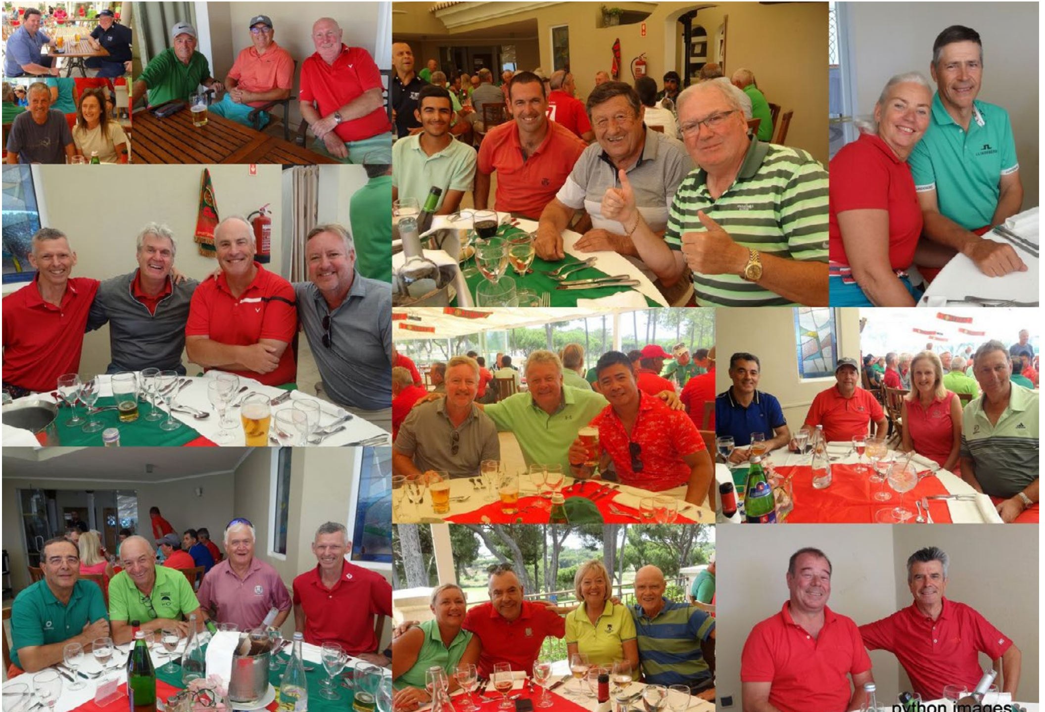
Portuguese Day Celebrations