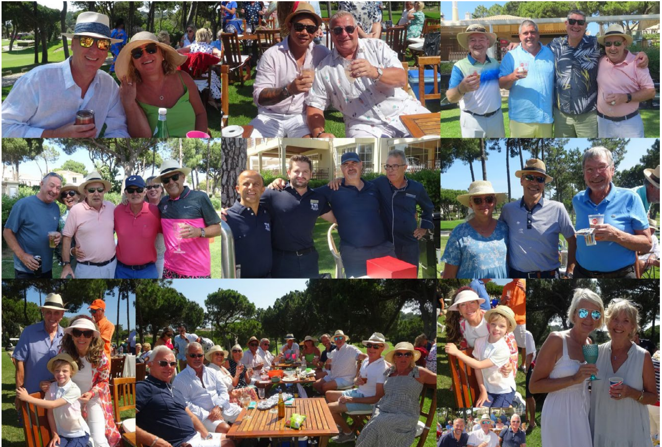
Picnic on the Green