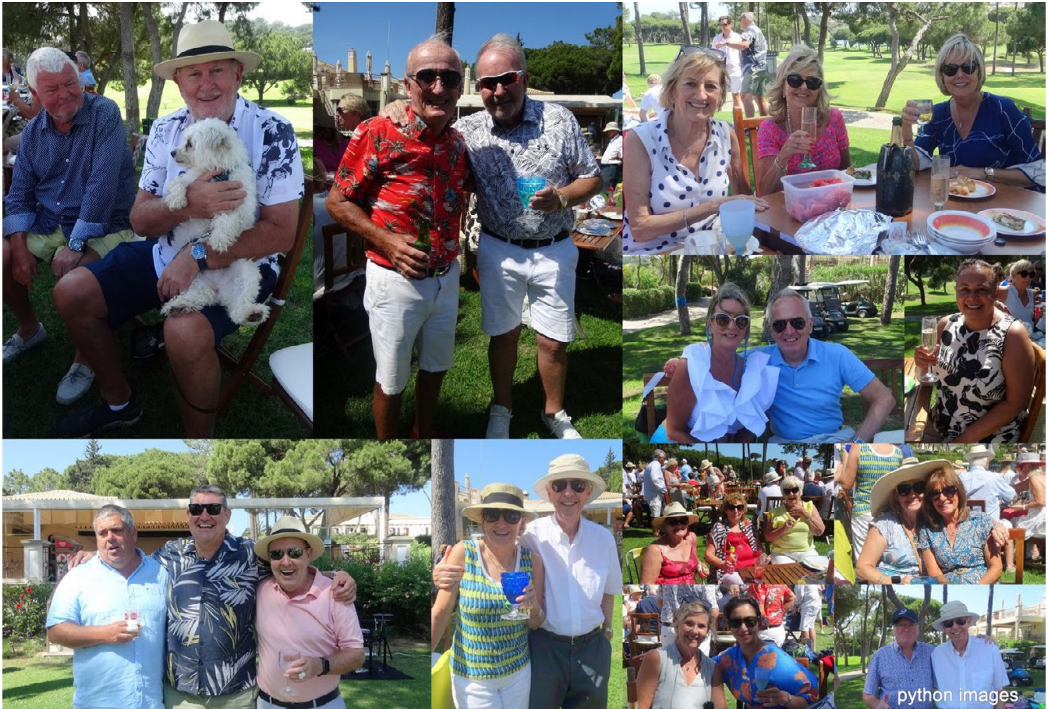
Picnic on the Green