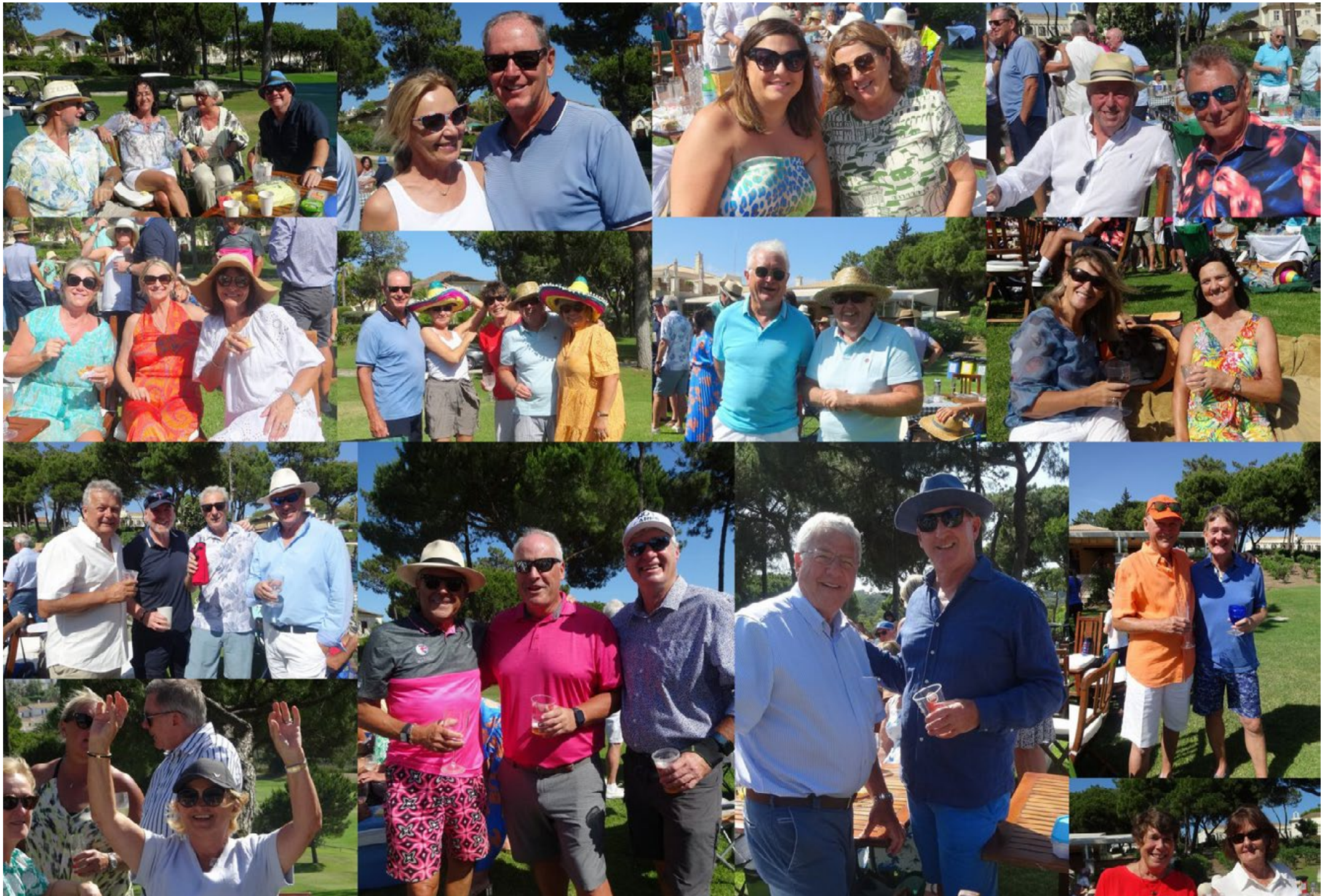
Picnic on the Green