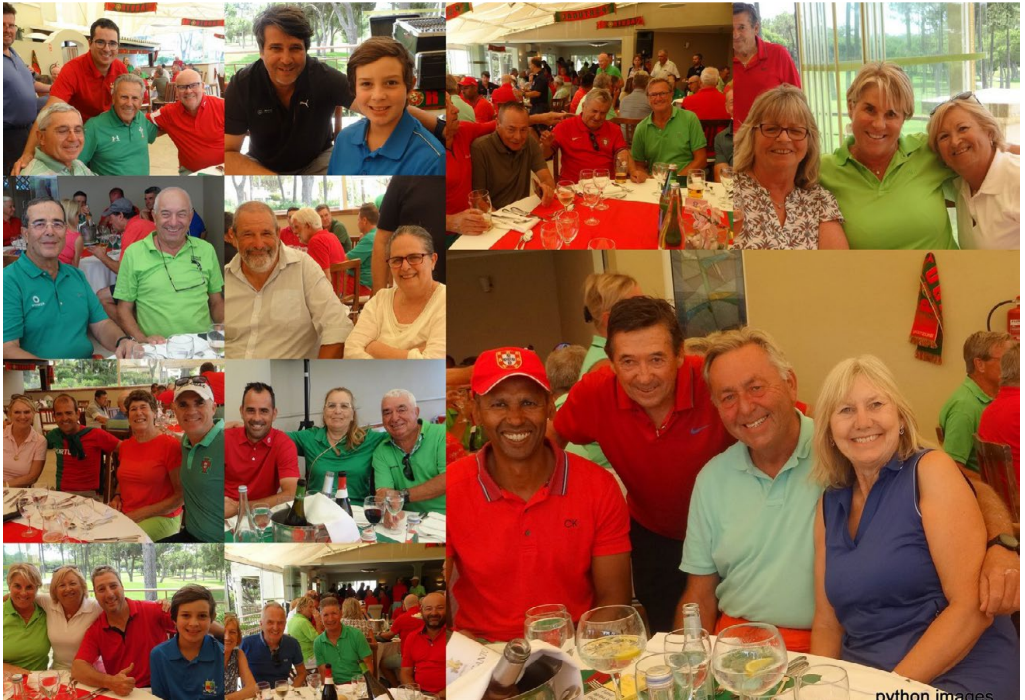
Portuguese Day Celebrations