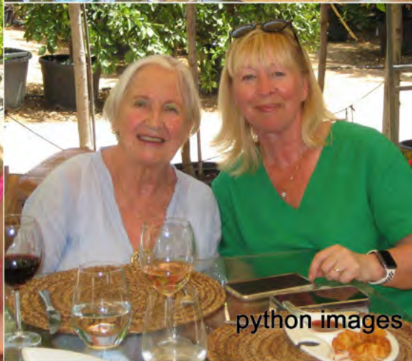
Ladies Social Lunch at Natura