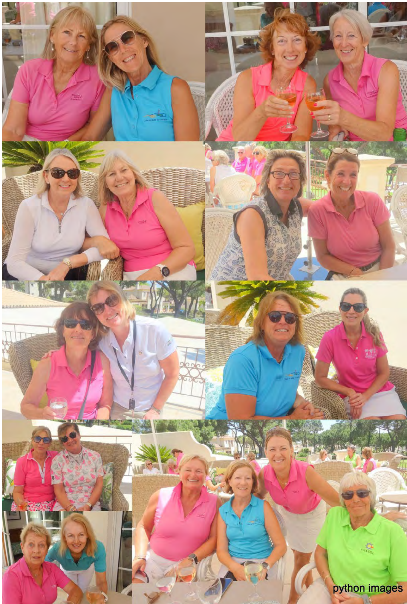
Ladies Invitation Day