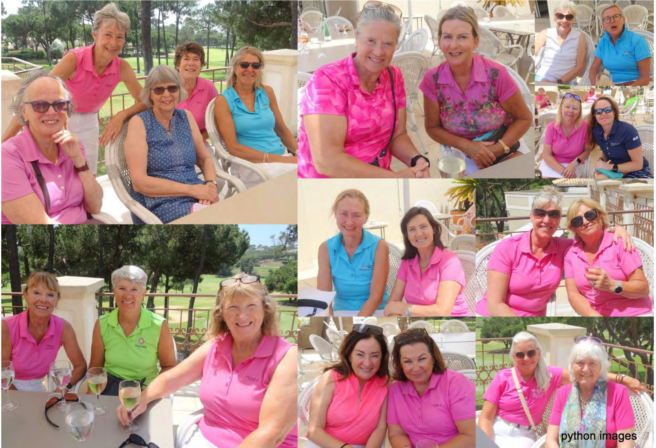
Ladies Invitation Day