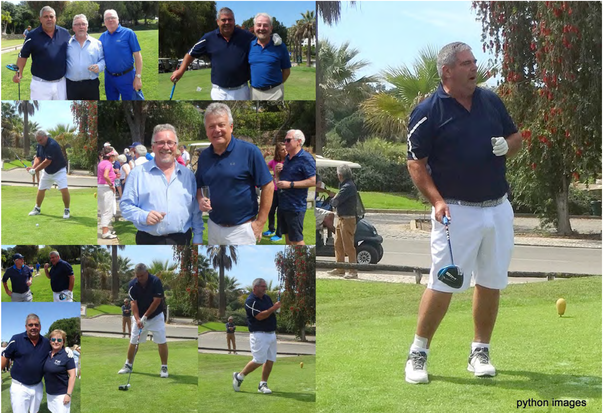
Captain's Drive In