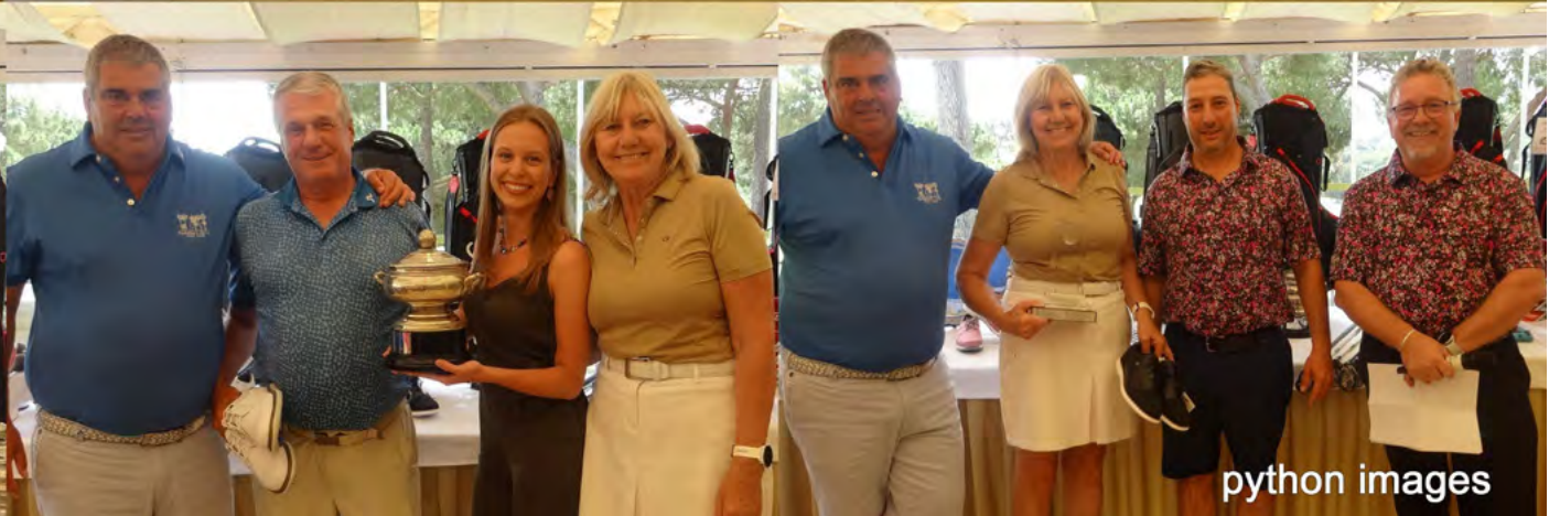
Various Tournaments Prize Winners