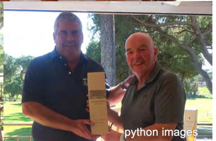
Captain's Drive In Prize Winners