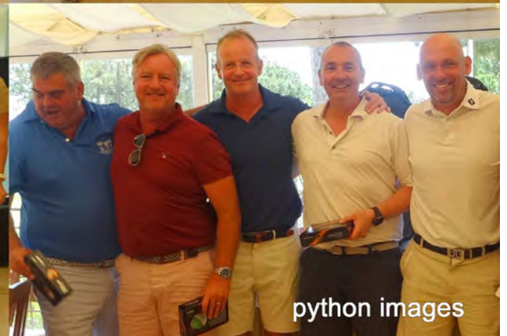
Easter Scramble Prize Winners