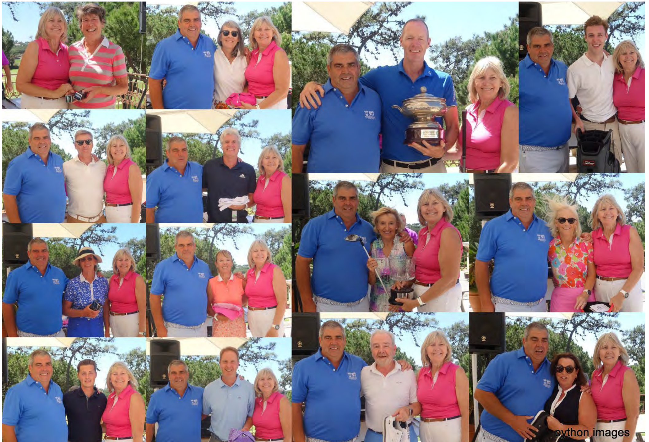
Stroke Play Championship Prize Winners