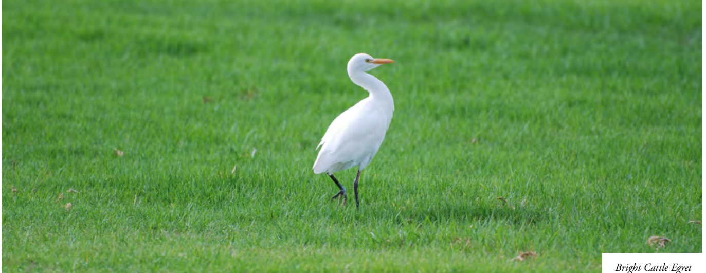
Bright Cattle Egret