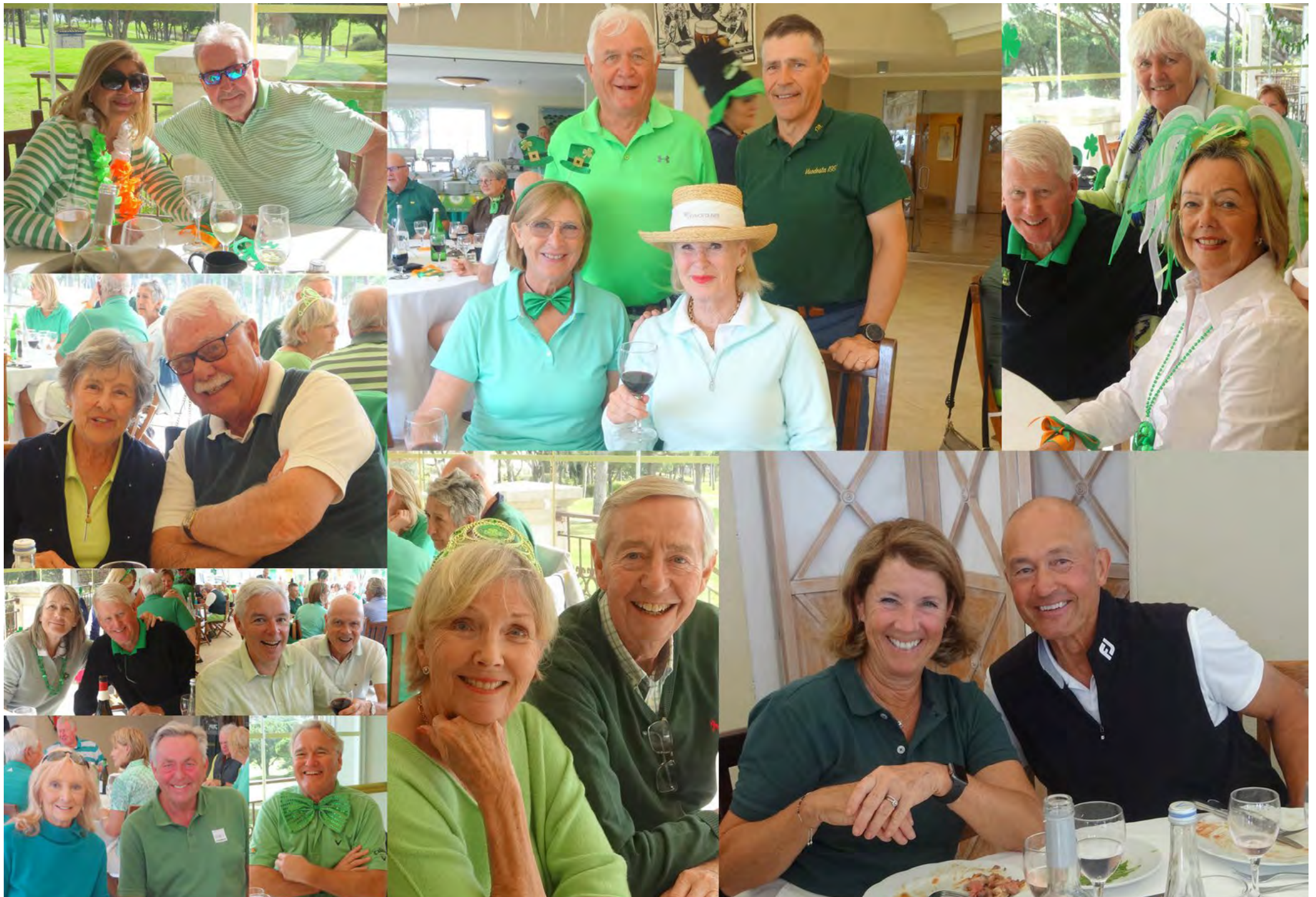
St Patricks Day Wooden Spoon Lunch