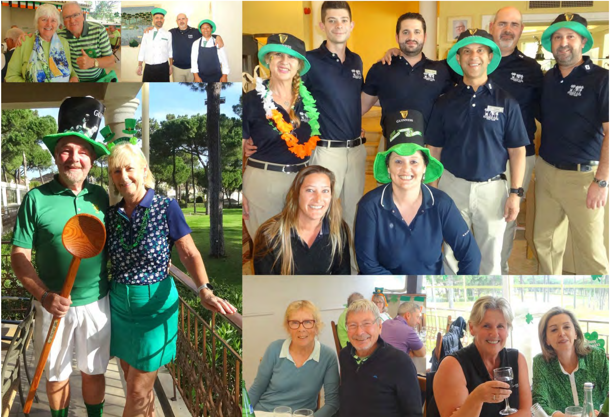
St Patricks Day Wooden Spoon Lunch