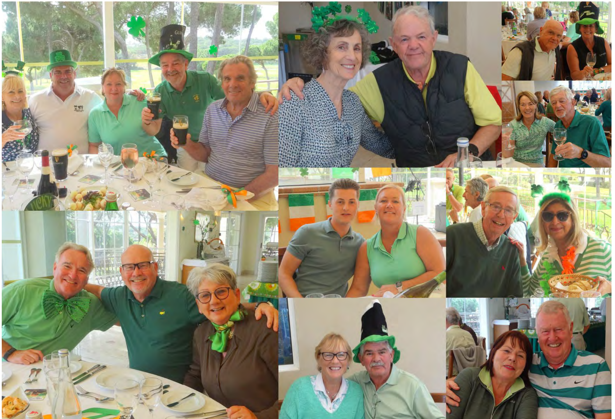
St Patricks Day Wooden Spoon Lunch