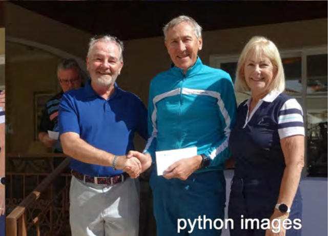
Mens Pairs Matchplay Prize Winners