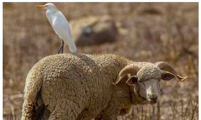
Cattle Egret on sheep

I was out of circulation for a little while and when I got back in January I was promptly informed by other members that our swans had disappeared. One theory was that they had ended up at Christmas dinners. Another possibility was that packs of stray dogs are increasingly seen after dusk. One thing is for sure, they've gone.