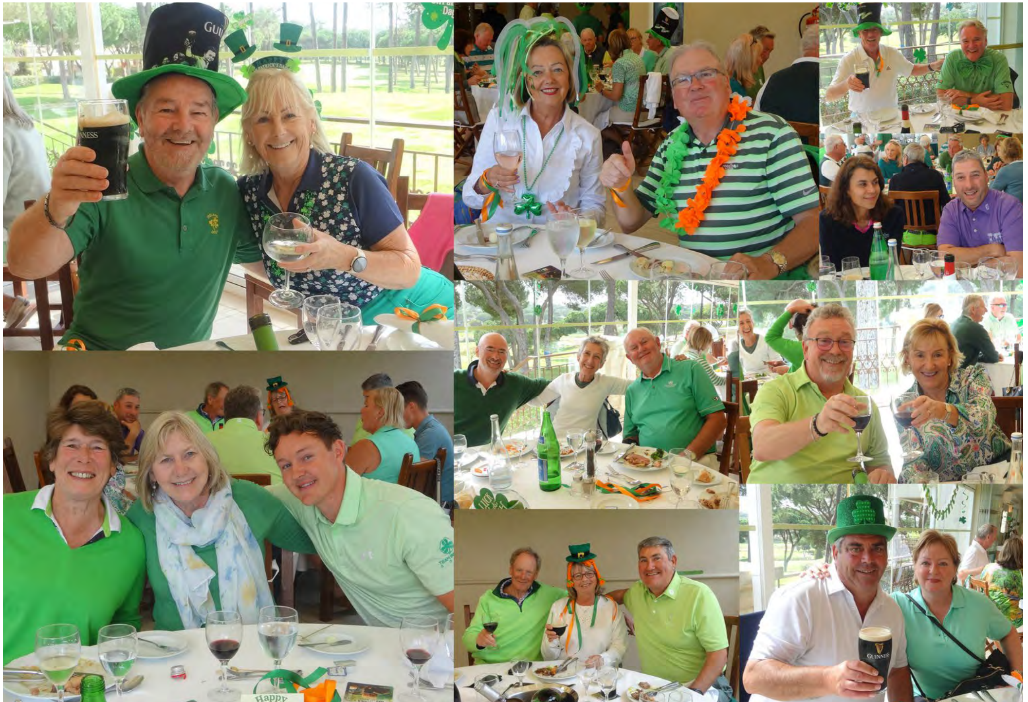
St Patricks Day Wooden Spoon Lunch