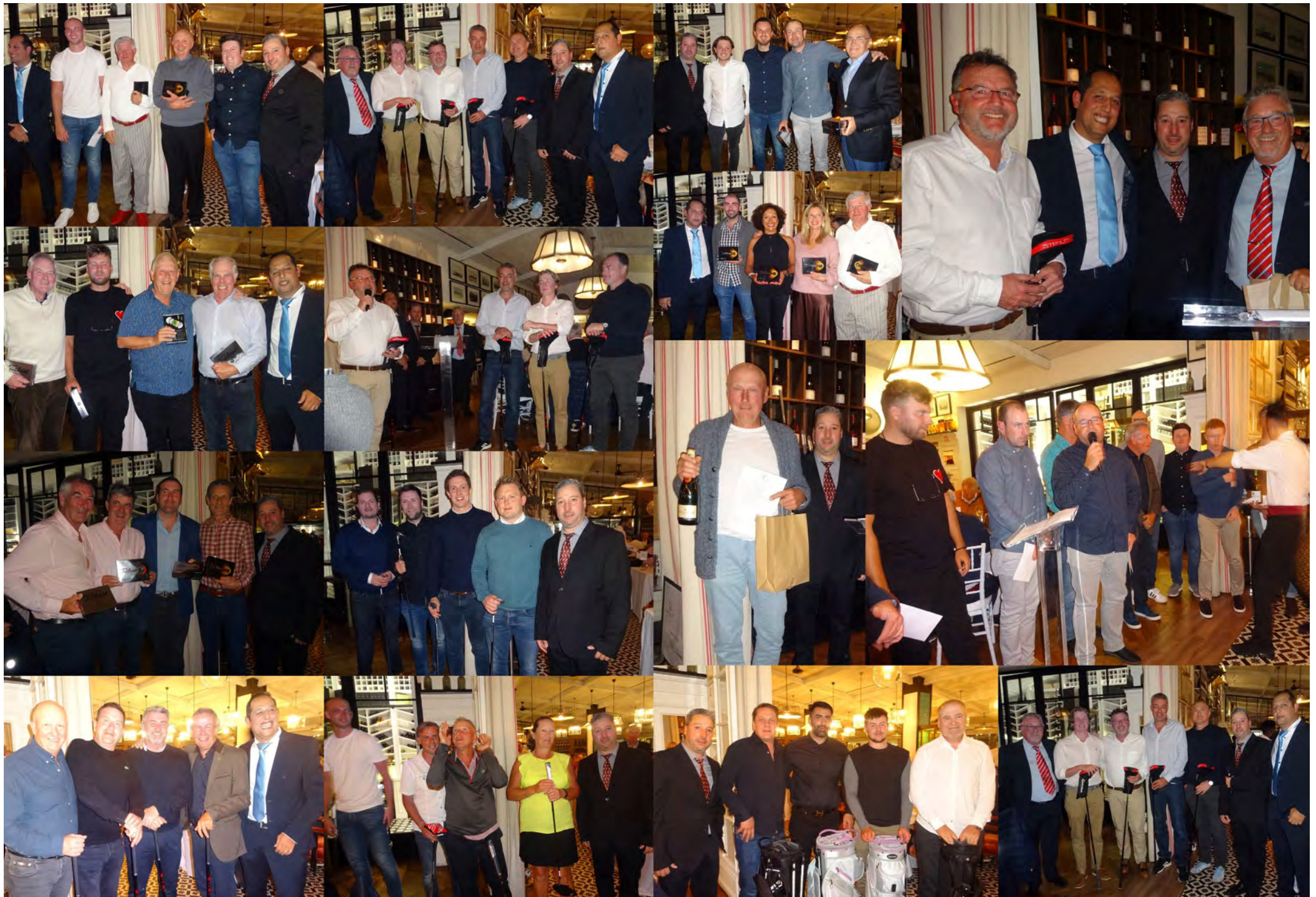
Algarvian Charity Pro Am Prize Winners