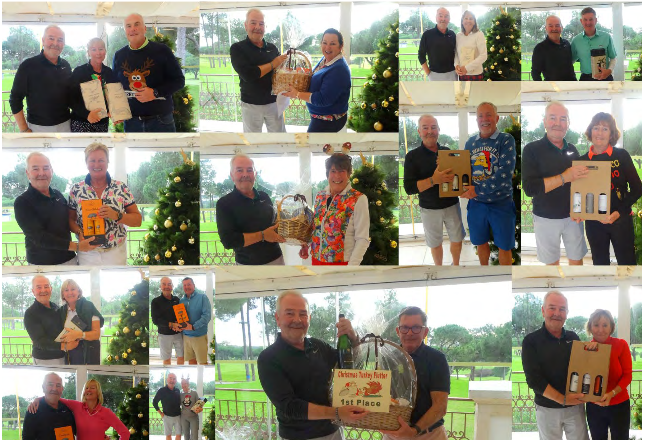
Christmas Turkey Flutter Prize Winners