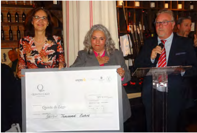
Apatris 21 receiving the donation cheque of €7.000,00