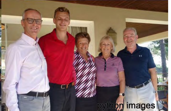
Boxing Day Prize Winners