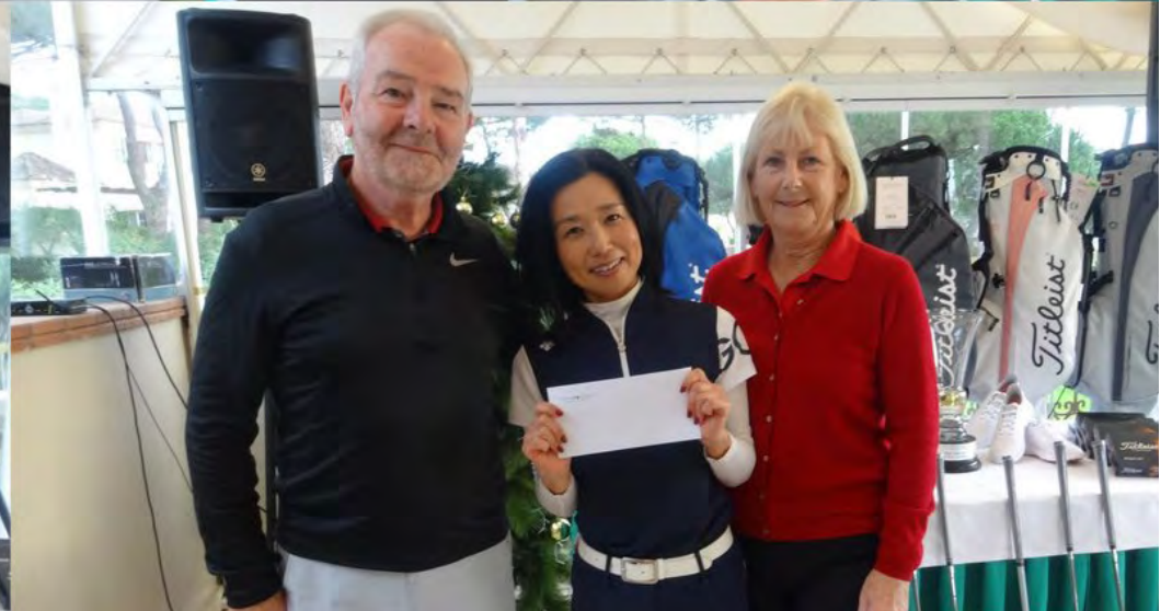
2022 Eclectic Competition Prize Winners