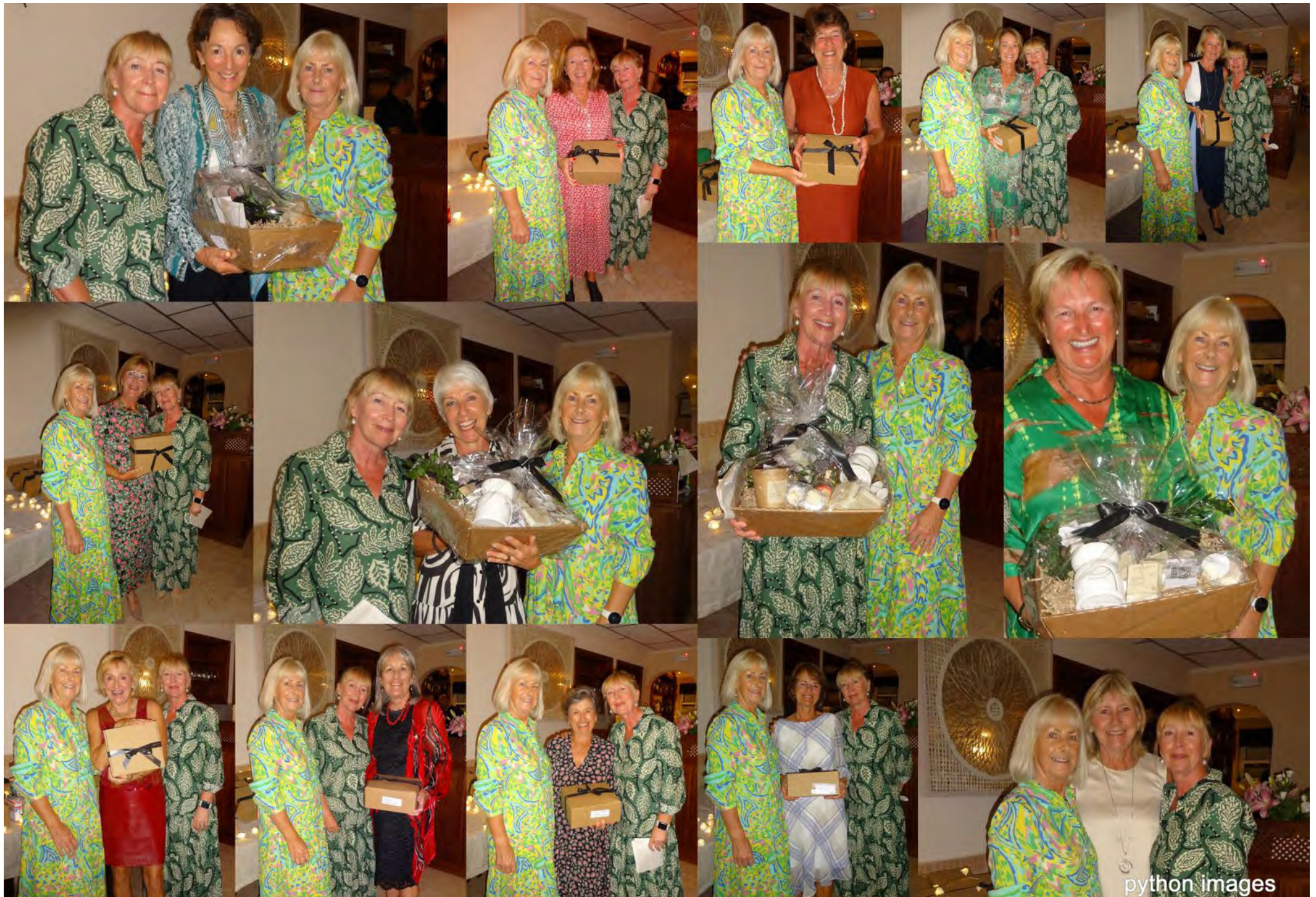
Lady Captain's Day Prize Winners