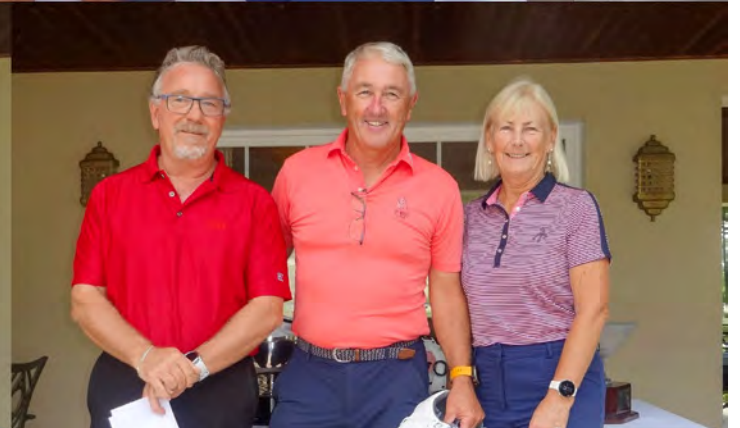
Seniors Championship prize winners