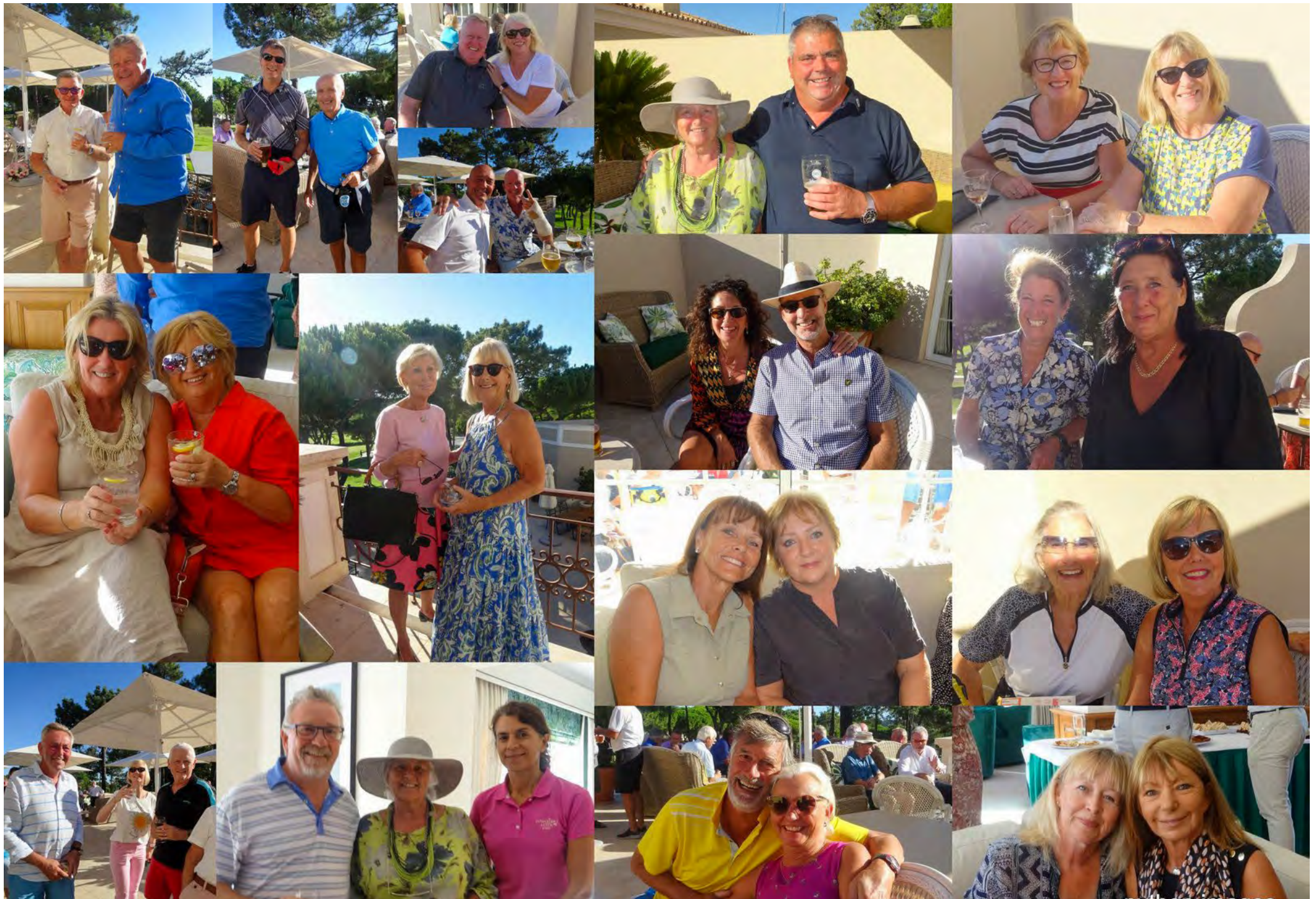
Members Lounge Opening