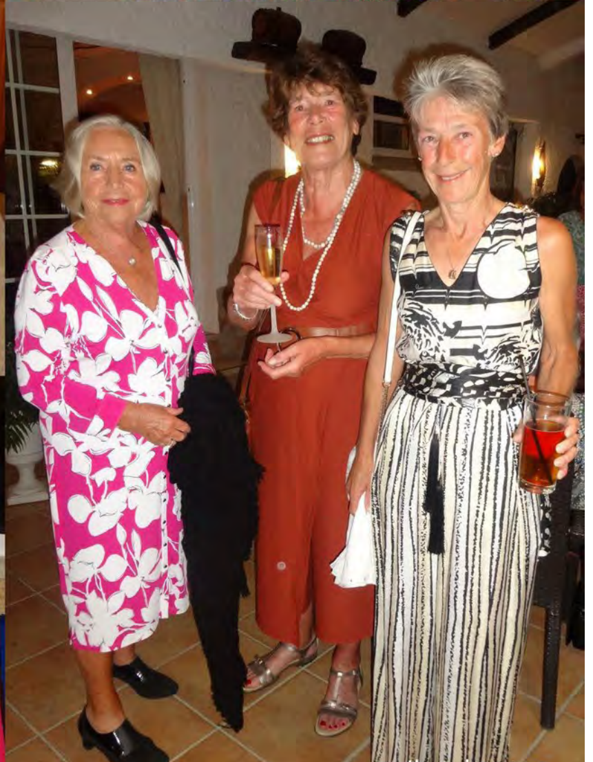
Ladies Annual Dinner