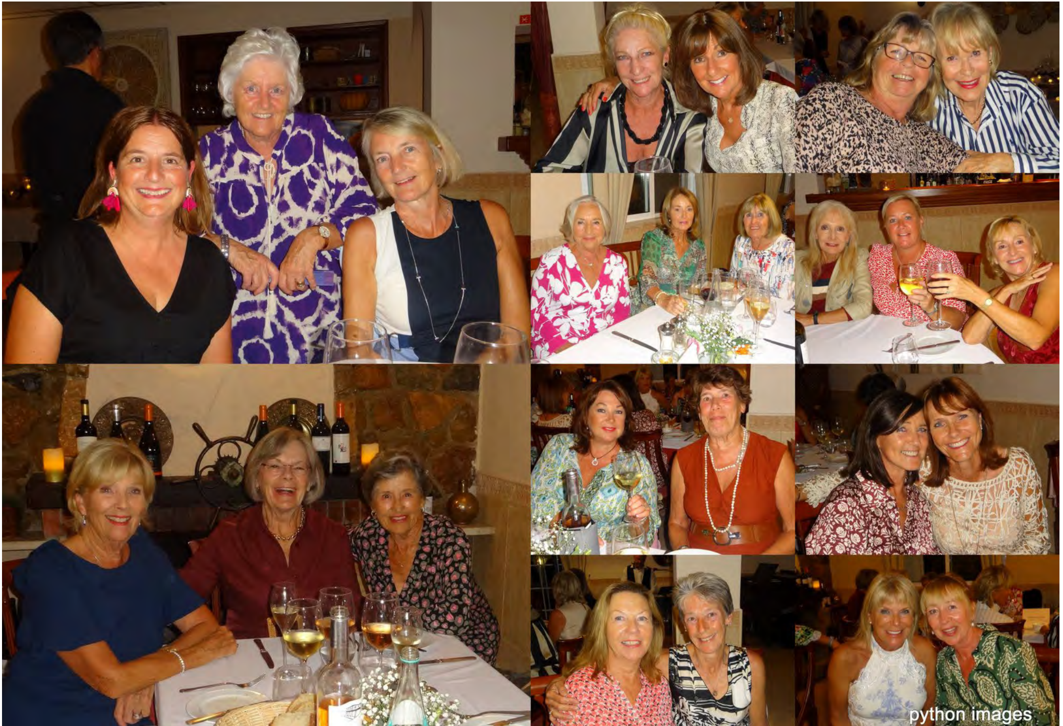
Ladies Annual Dinner