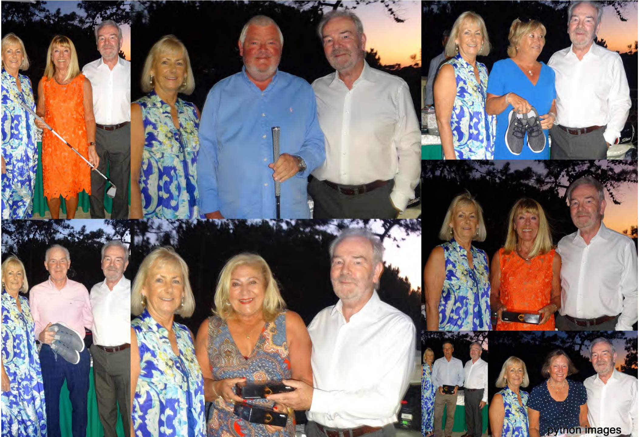
Captain's Day Prize Winners