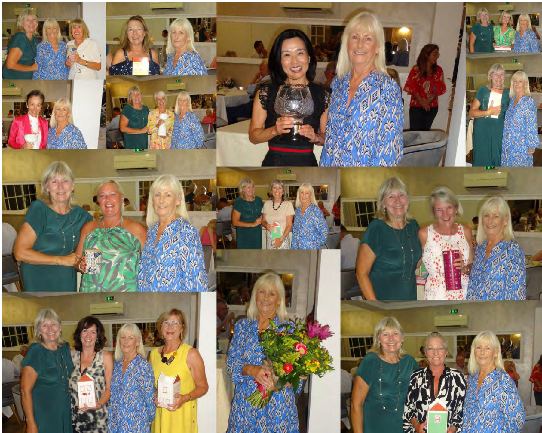
Lady Captain's Day Prize Winners