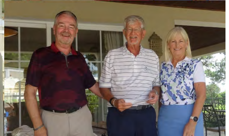
Matchplay Championship Prize Winners