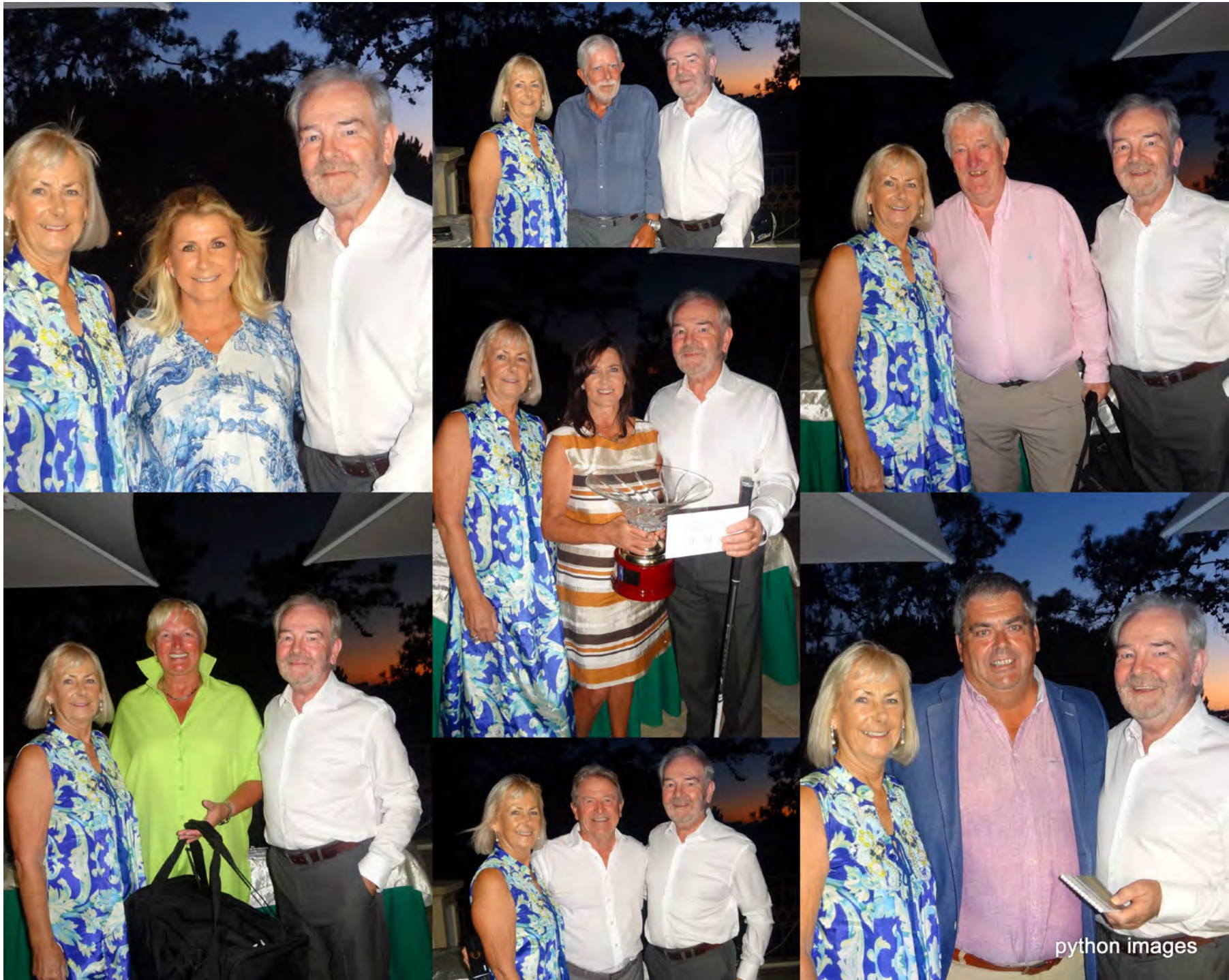
Captain's Day Prize Winners