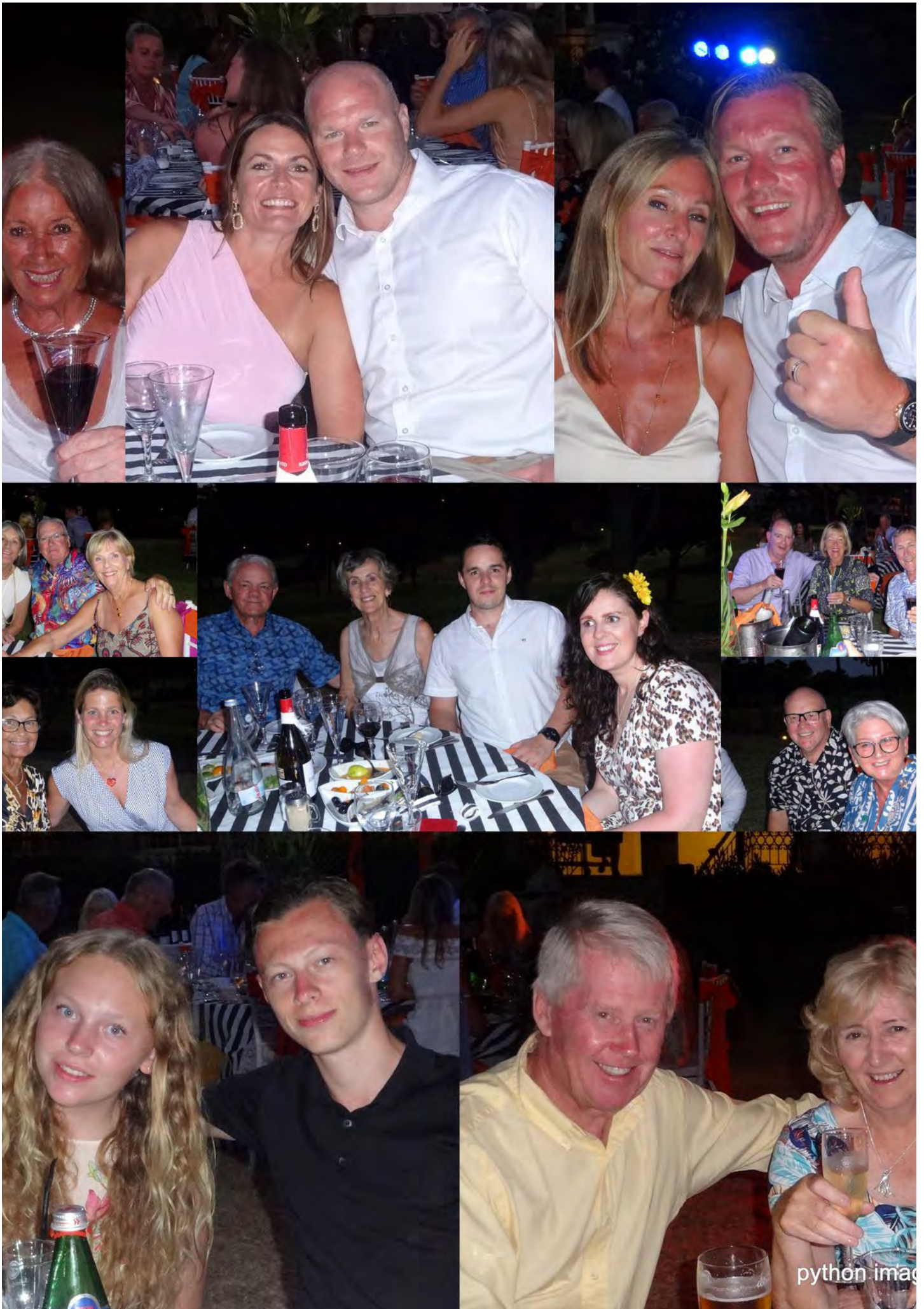
Members Gala Week & Sunshine Classic Gala Dinner