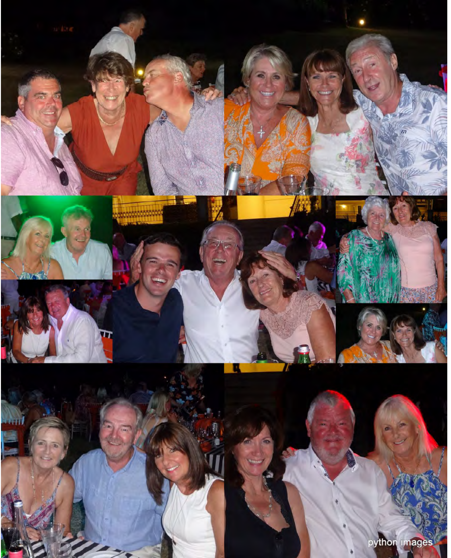
Members Gala Week & Sunshine Classic Gala Dinner