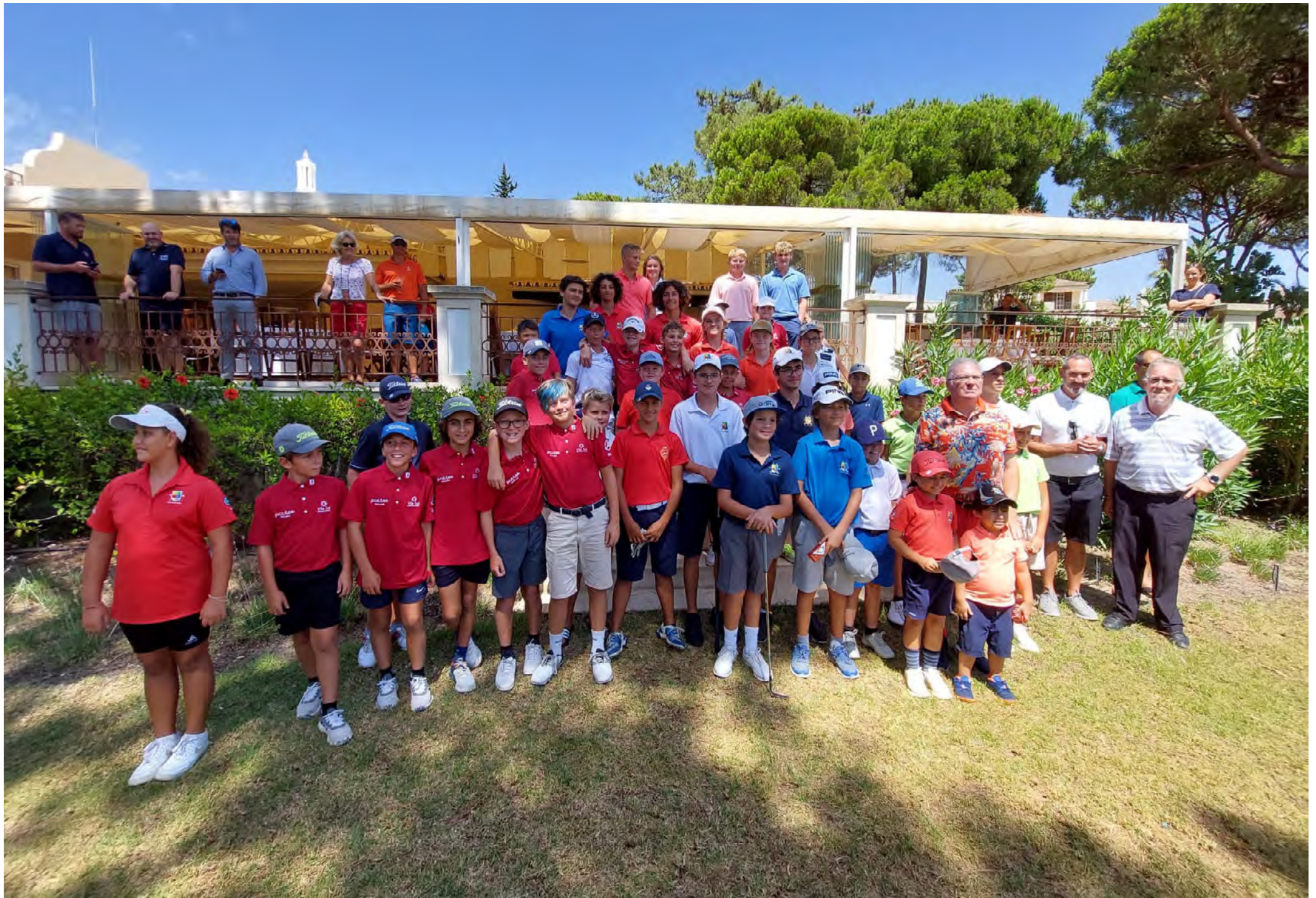
Junior Open 2022