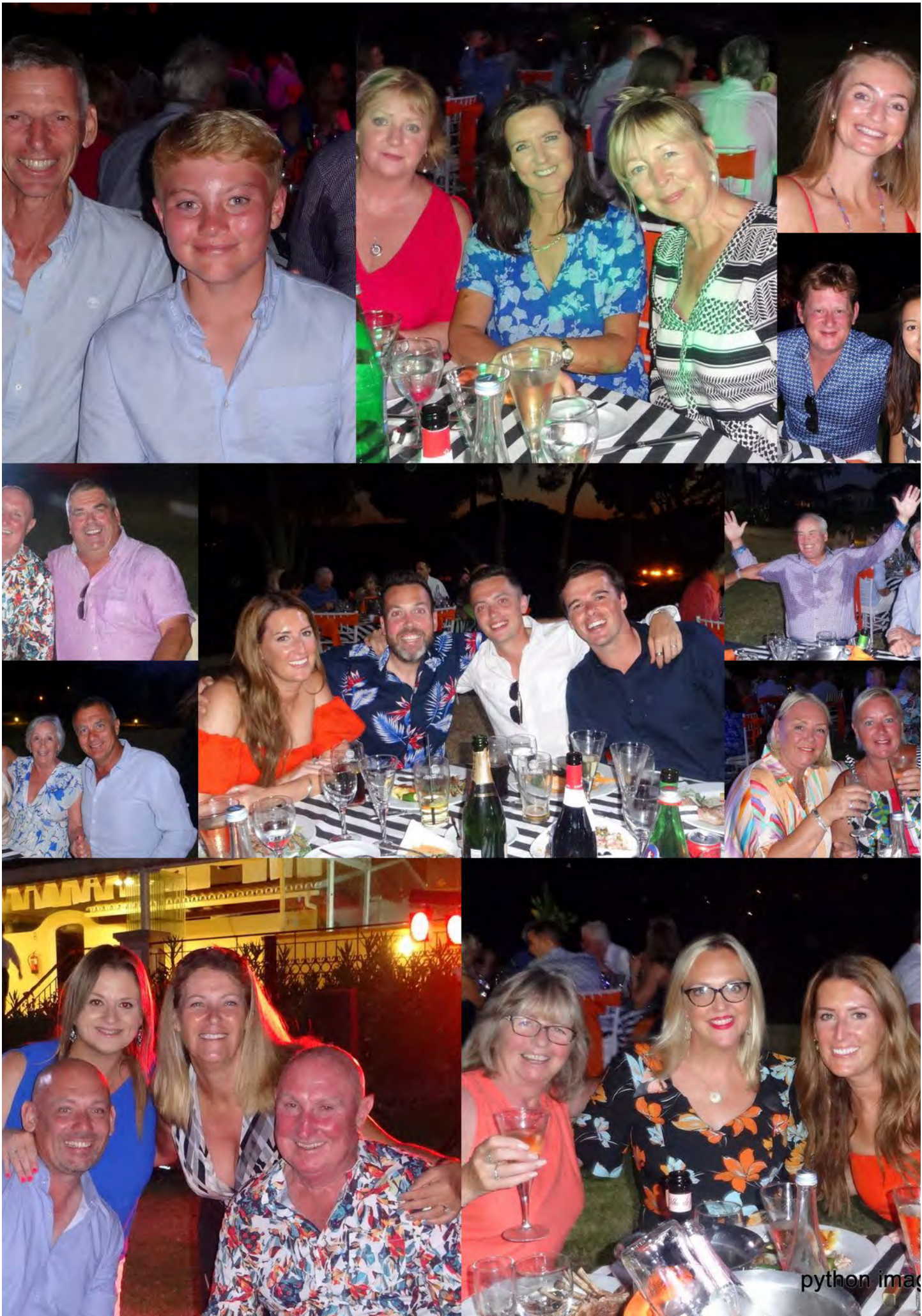
Members Gala Week & Sunshine Classic Gala Dinner