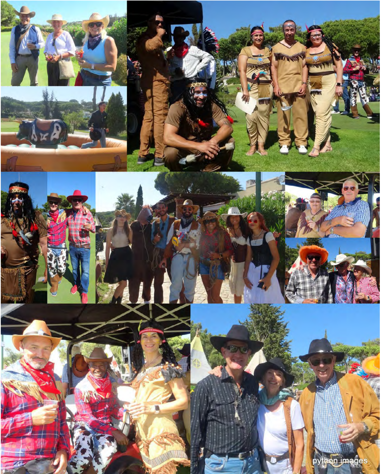
Back to the Wild West Shoot out