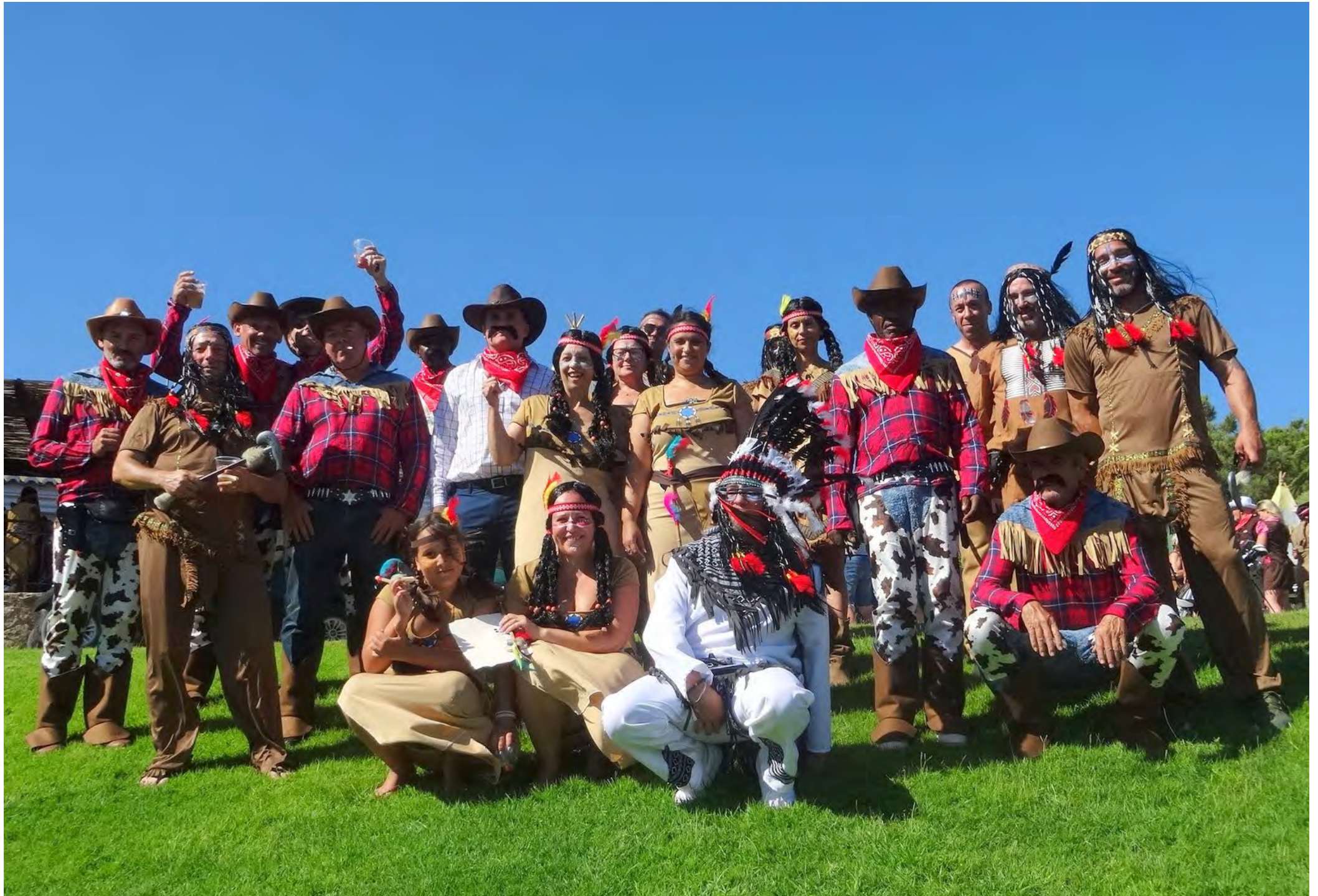
Back to the Wild West Shoot out – The Staff