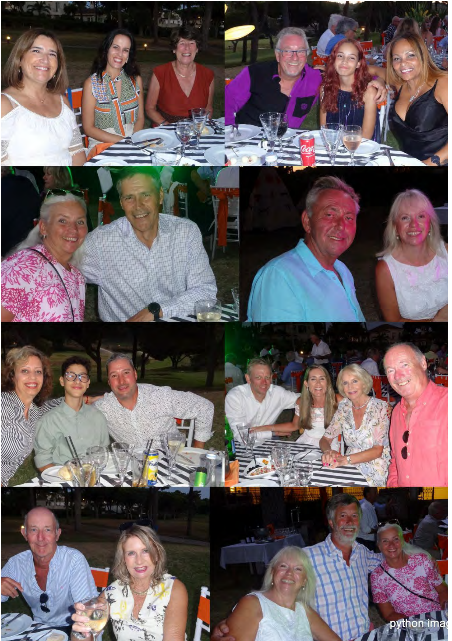
Members Gala Week & Sunshine Classic Gala Dinner