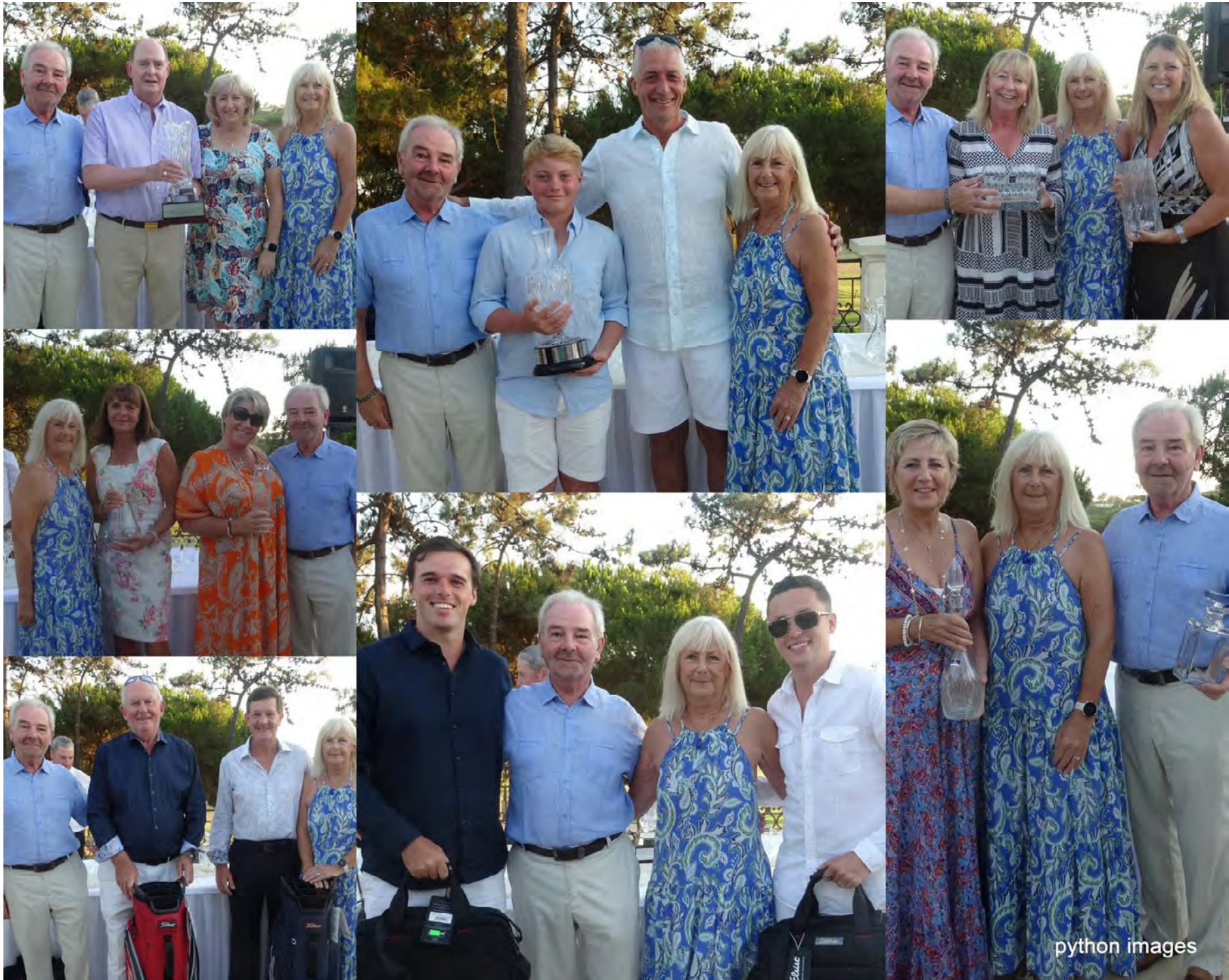
Members Gala Week & Sunshine Classic Prize Winners