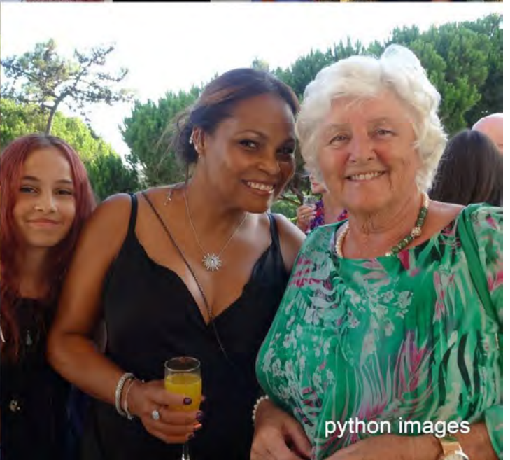
Members Gala Week & Sunshine Classic Gala Dinner