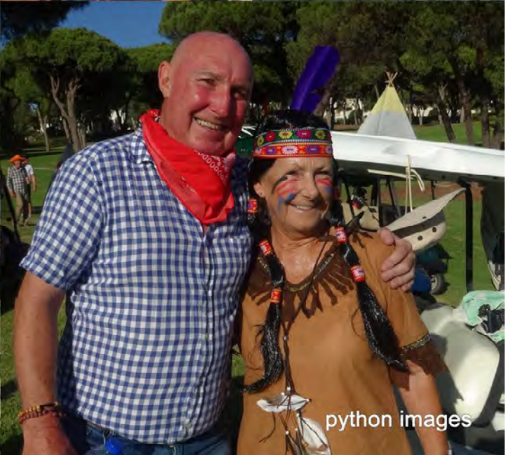
Back to the Wild West Shoot out