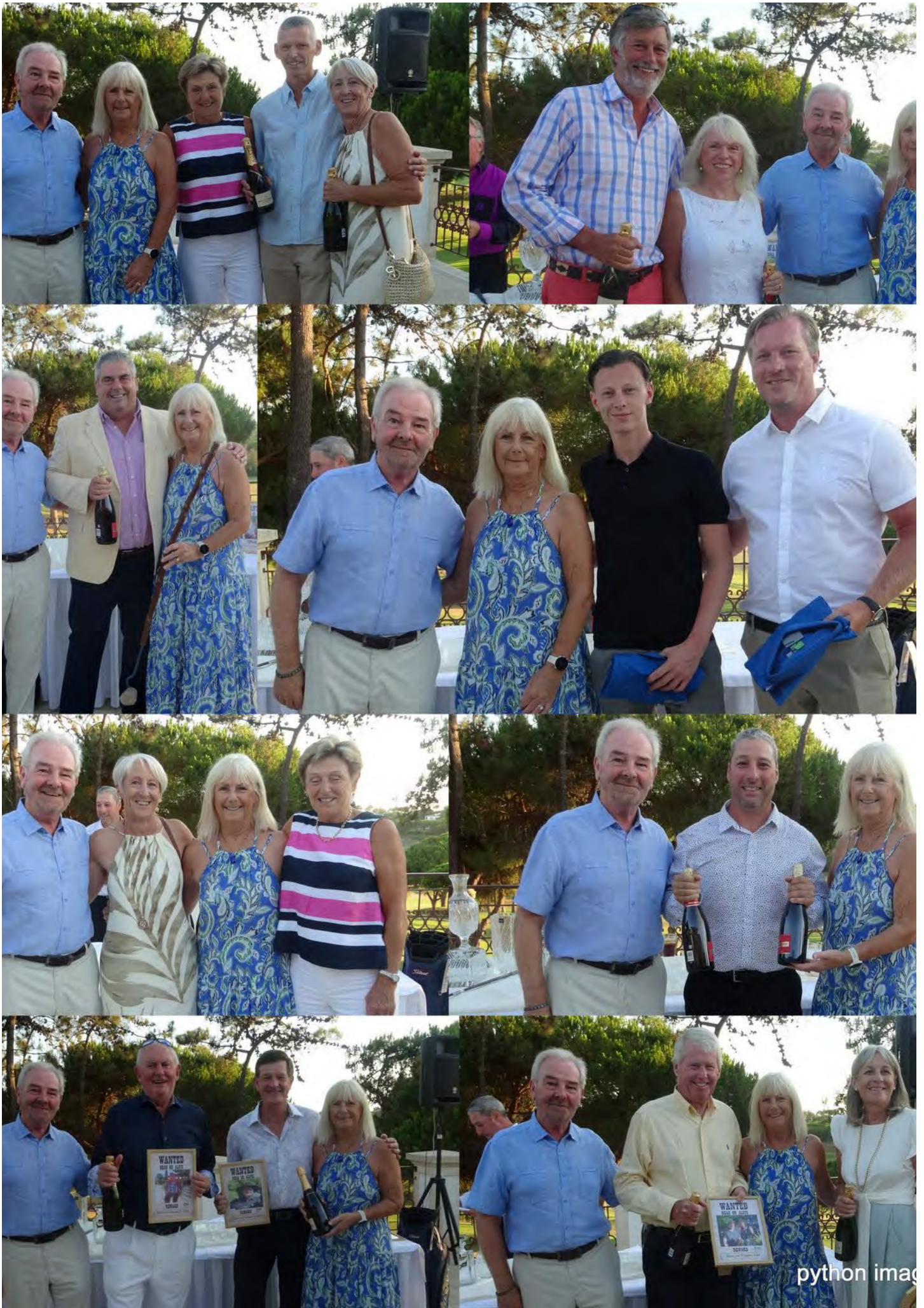
Members Gala Week & Sunshine Classic Prize Winners