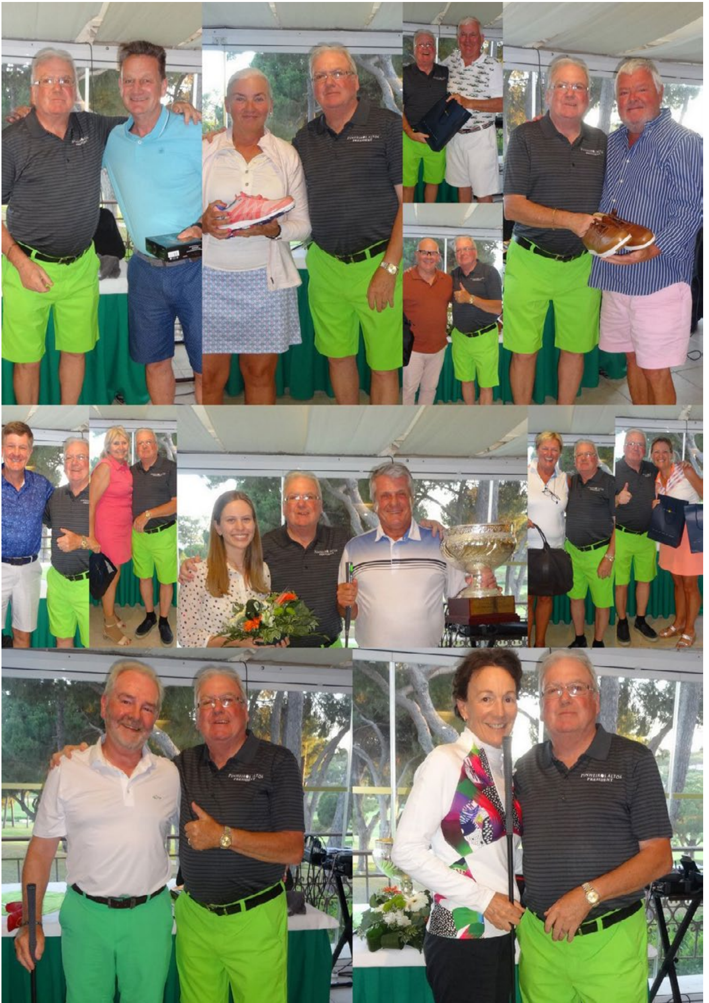
President's Day Prize Winners