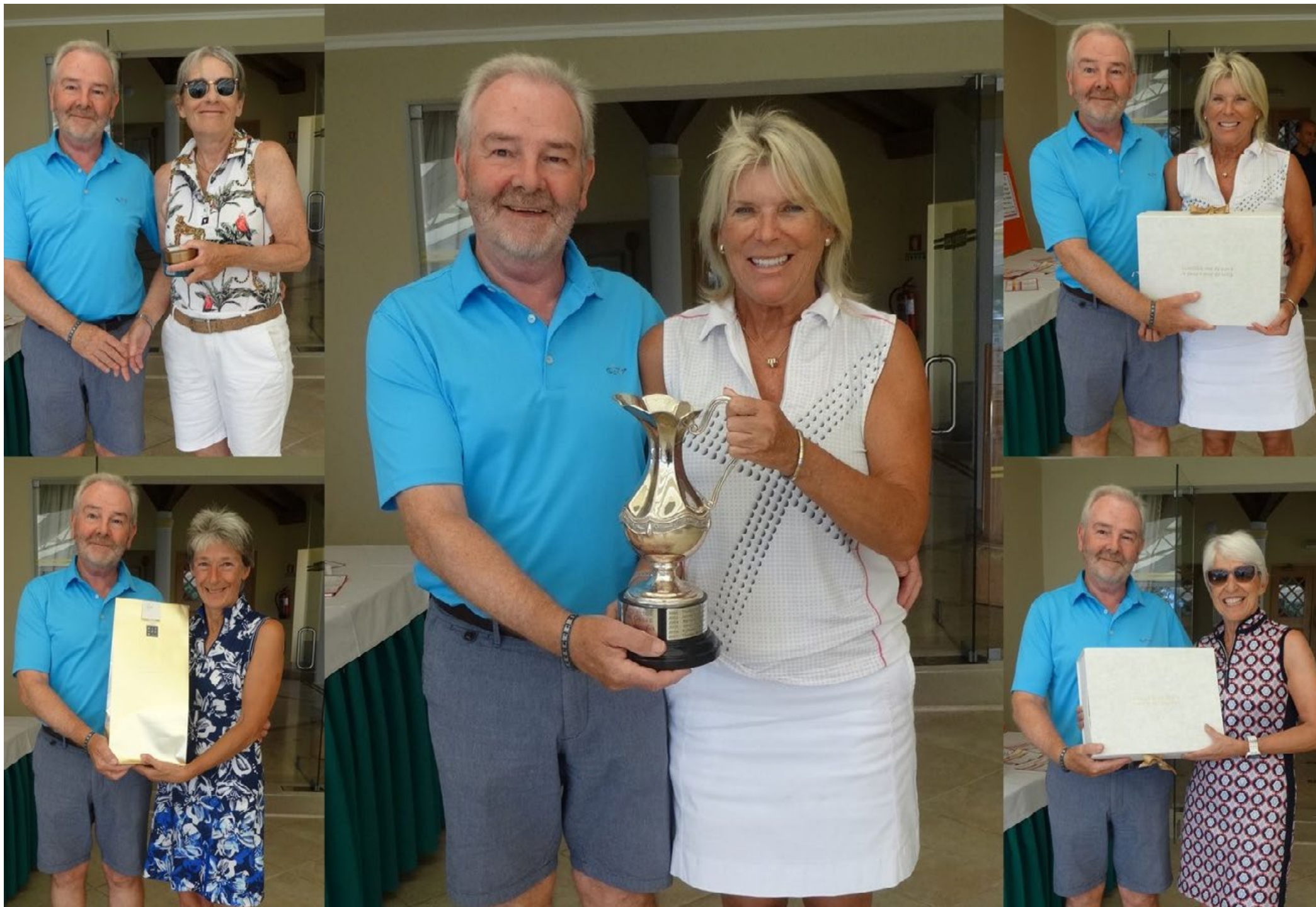
Past Lady Captain's Day Prize Winners