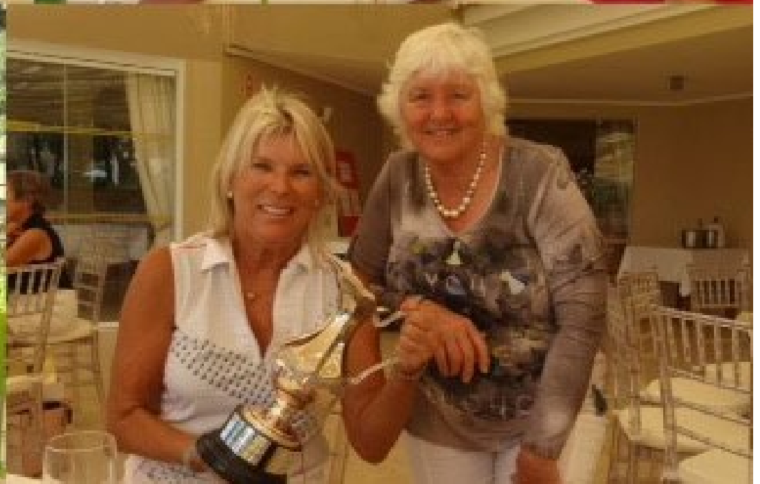
Past Lady Captain's Day