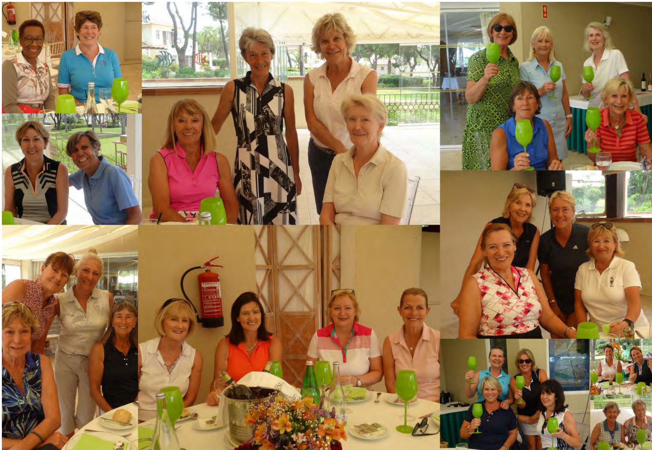
Ladies Invitation Day