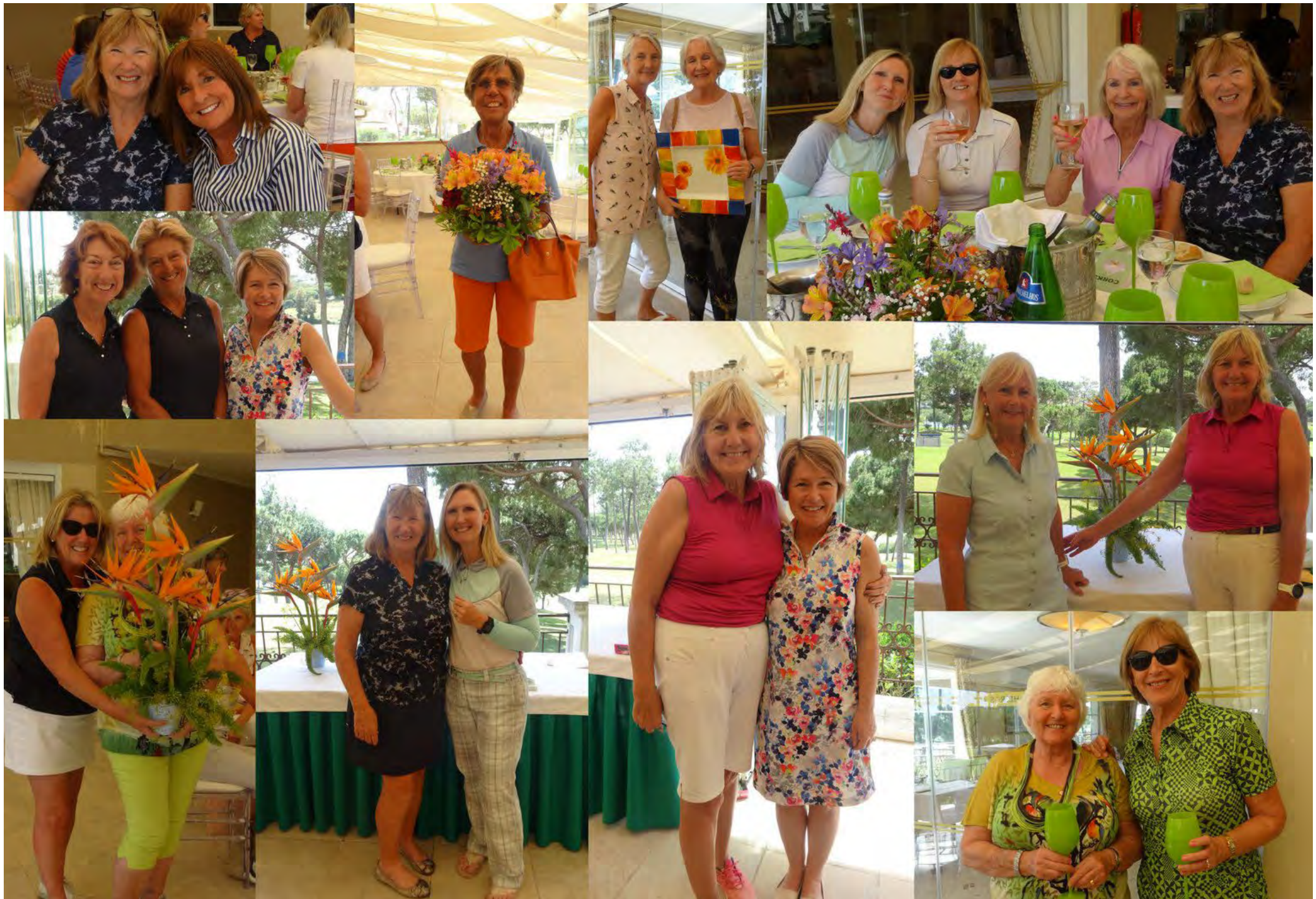
Ladies Invitation Day