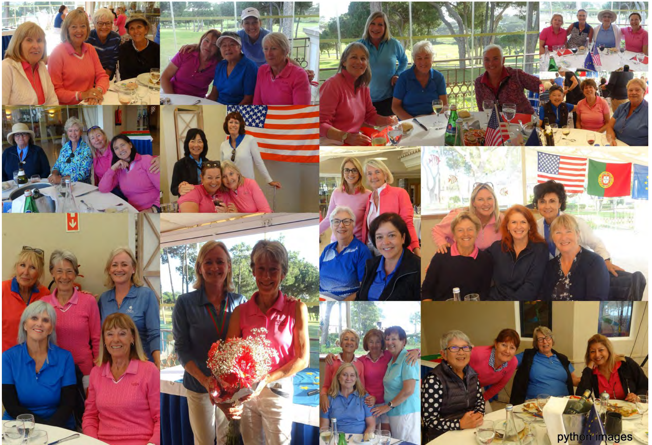
PA Ladies V USA Team