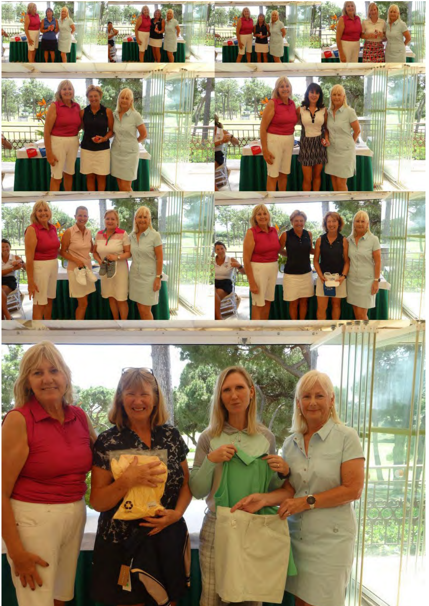
Ladies Invitation Day Prize Winners