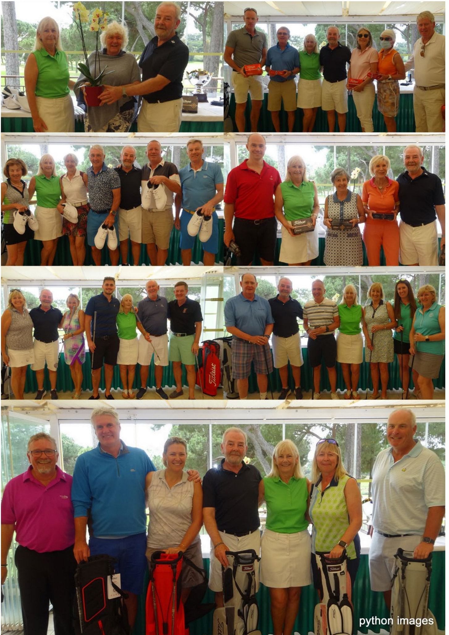
Easter Scramble – Various Events Prize Winners