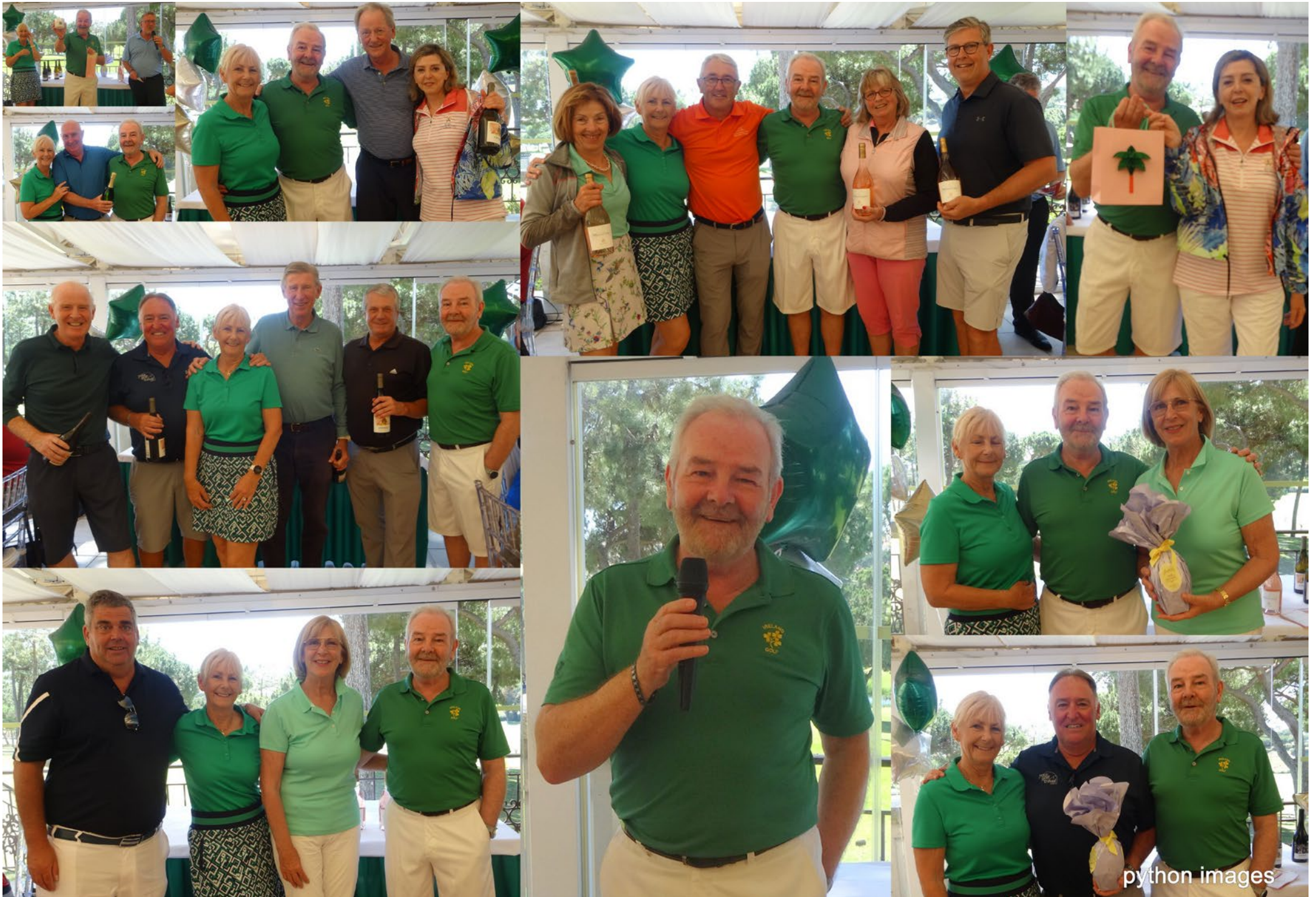
Captains Drive In Prize Winners