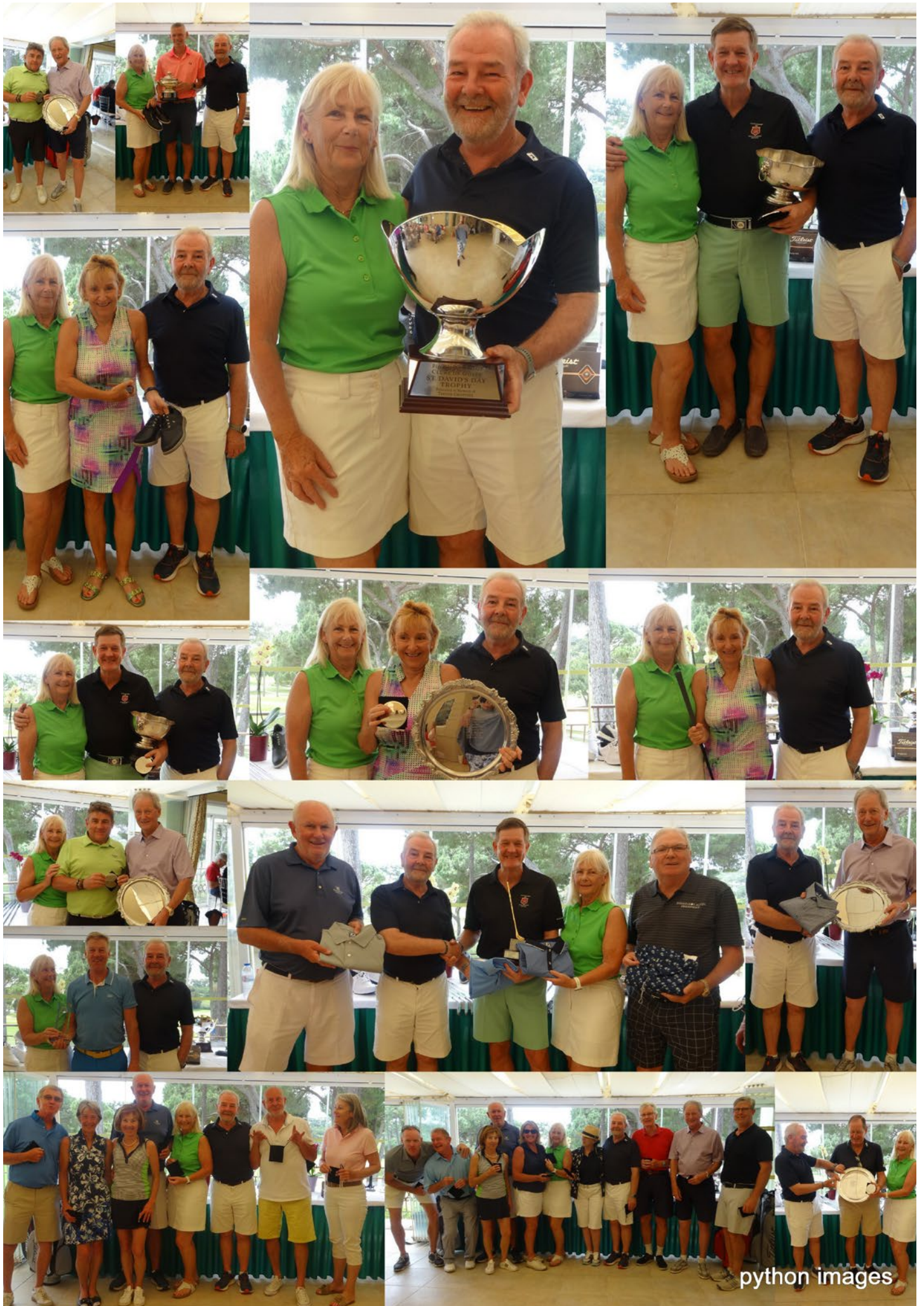
Easter Scramble – Various Events Prize Winners