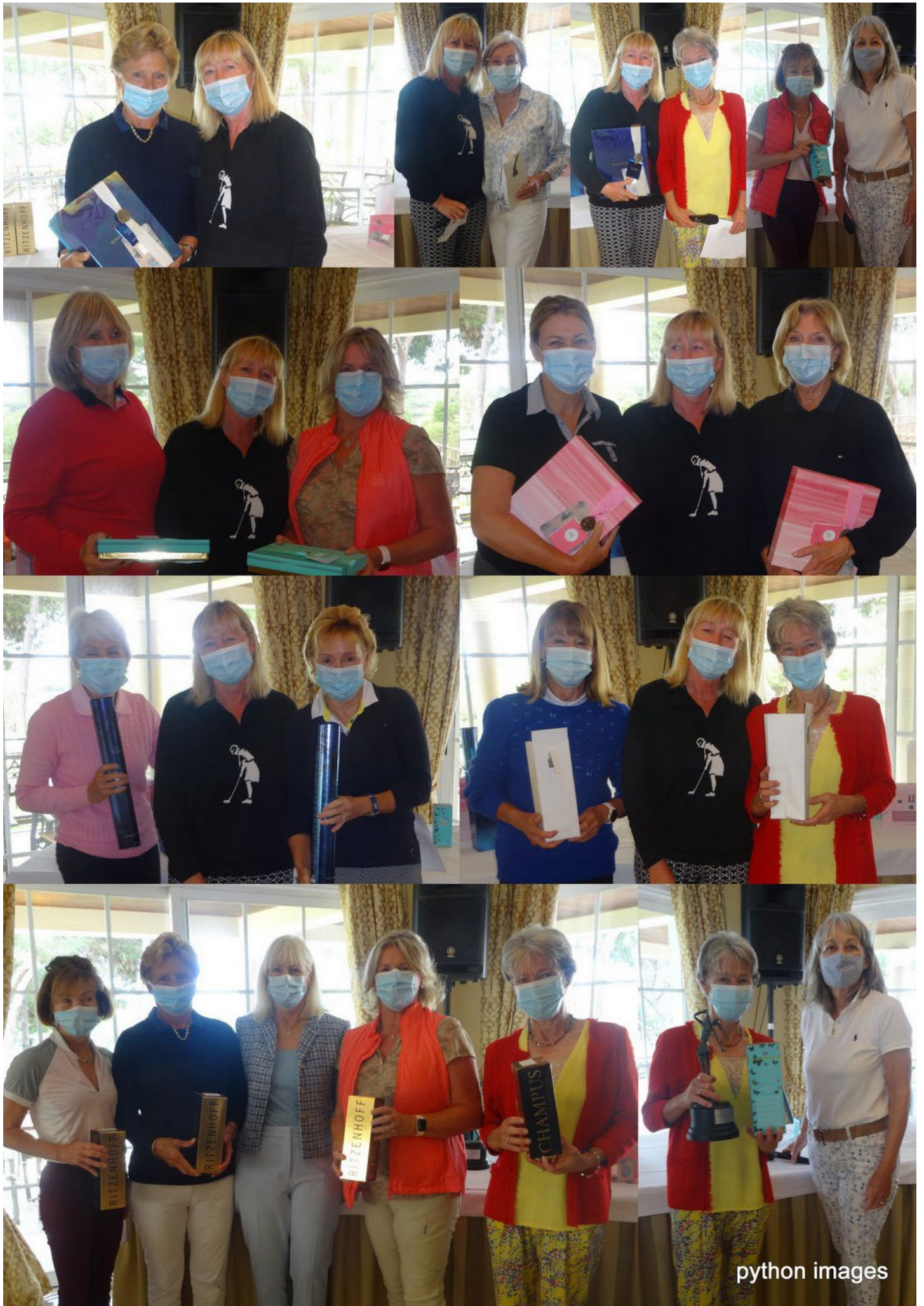
Ladies AGM Prize Giving