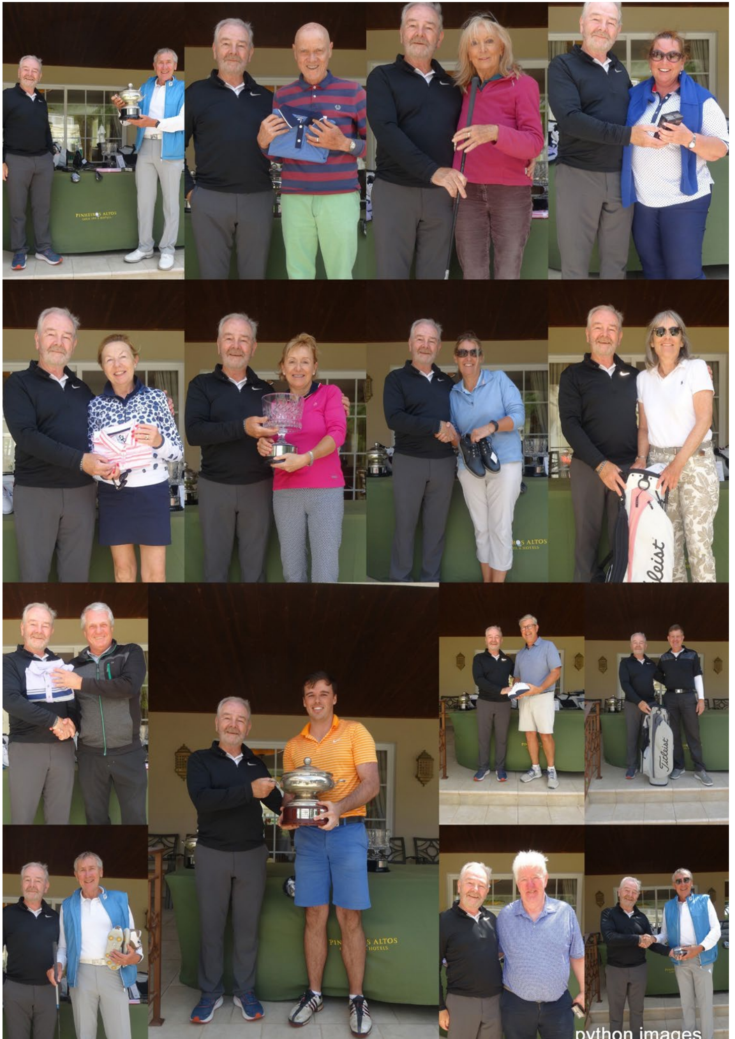
Easter Scramble – Various Events Prize Winners