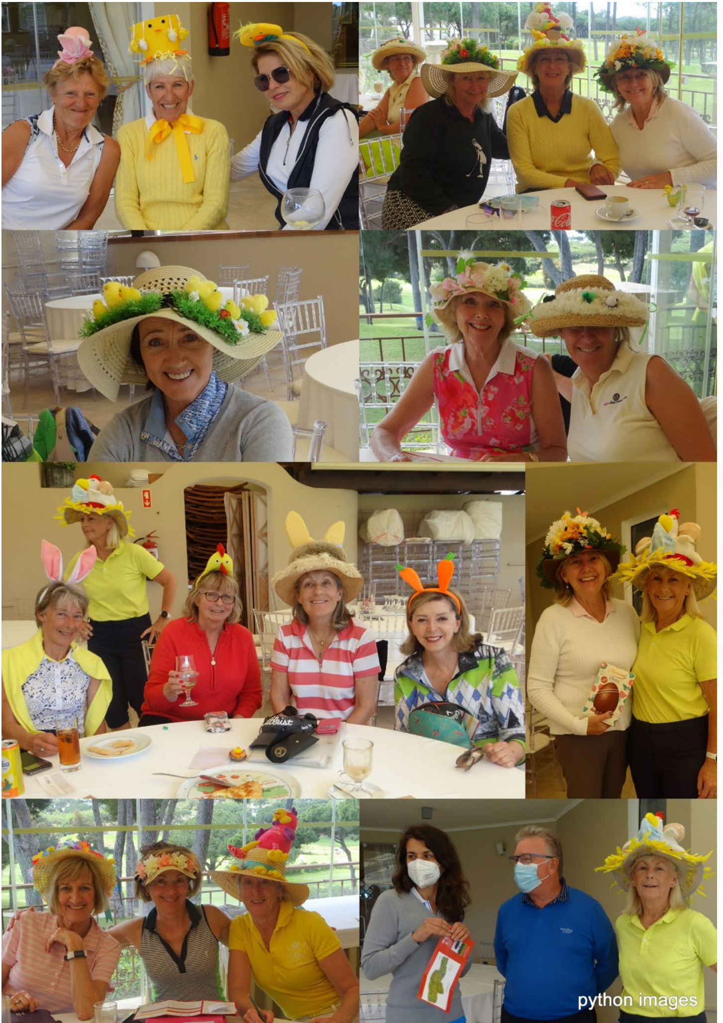
Ladies Easter Bonnet