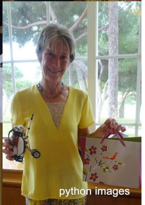
Ladies AGM Thank you gifts