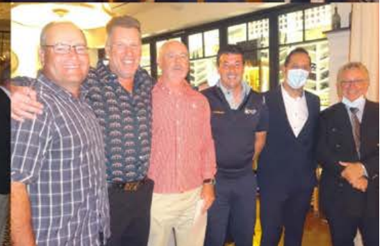
Charity Pro Am Winners