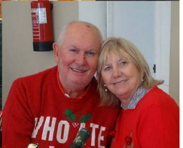
Christmas Turkey Flutter