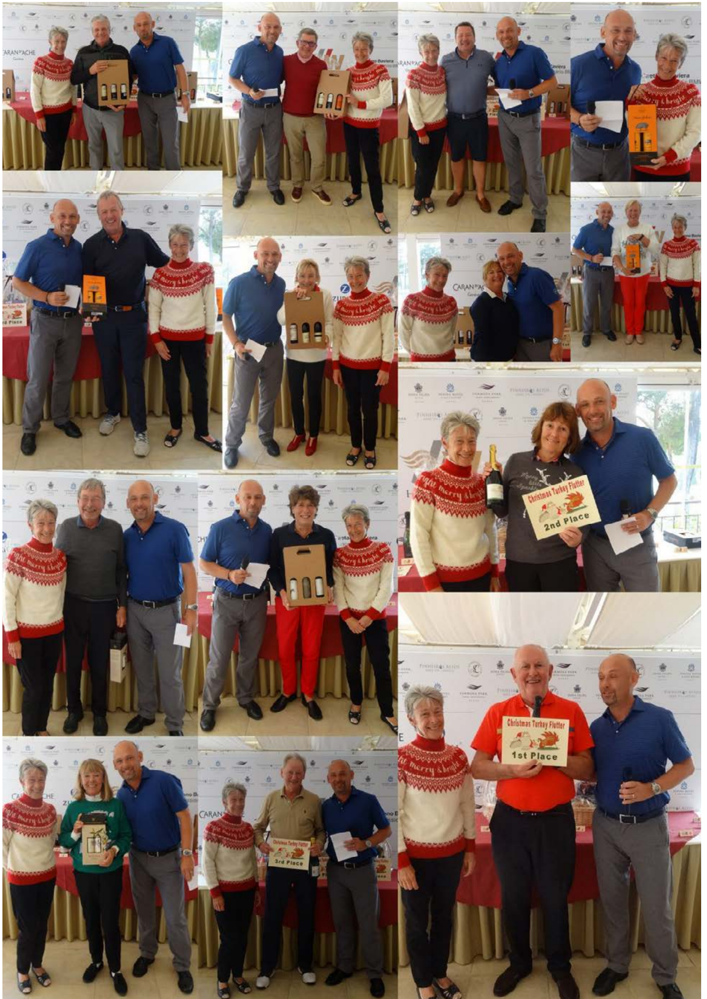
Christmas Turkey Flutter Prize Winners