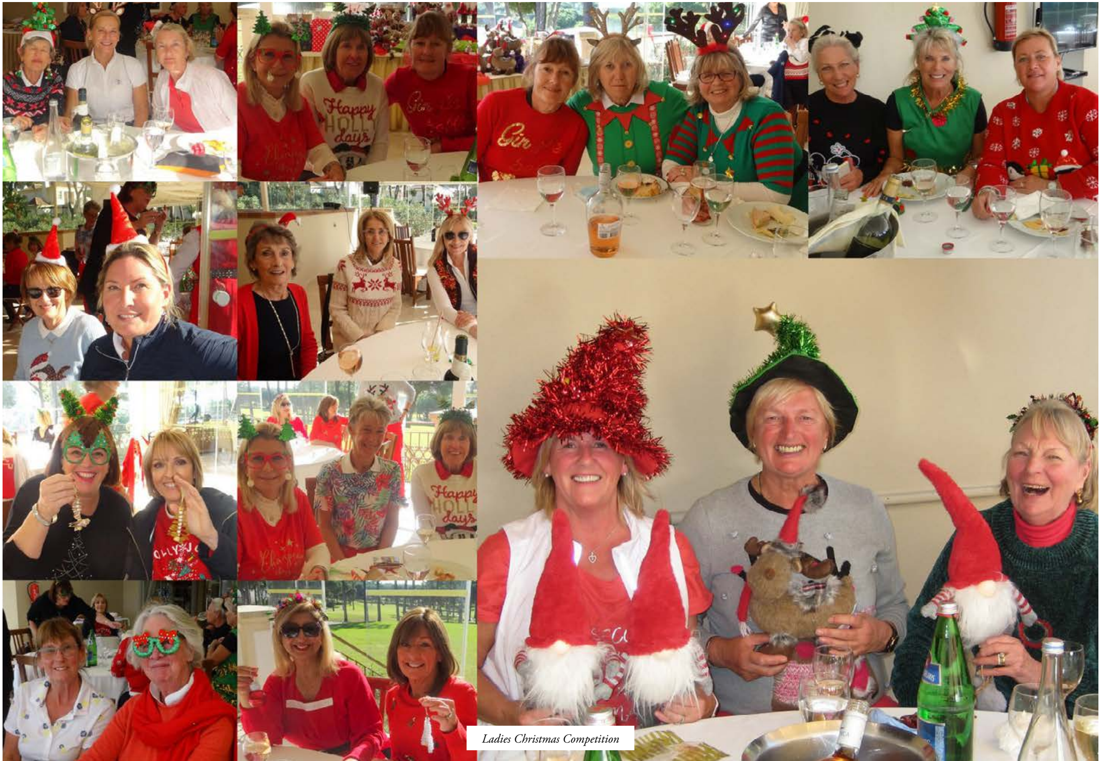
Ladies Christmas Competition