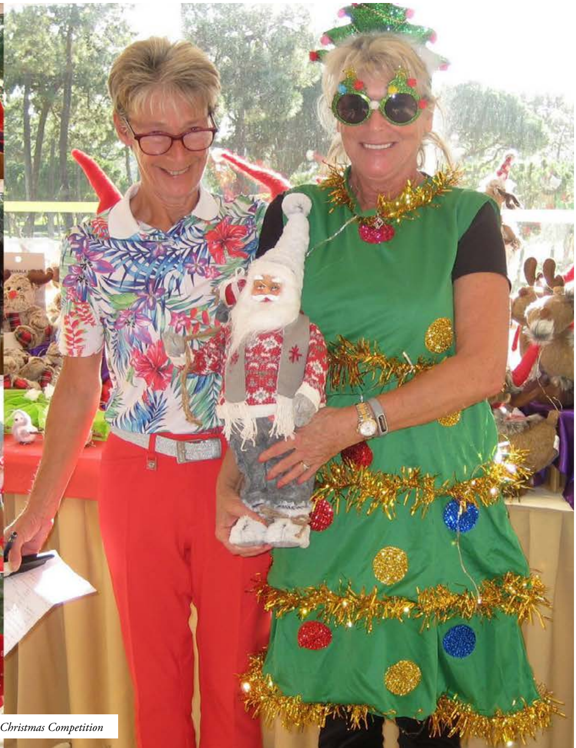
Ladies Christmas Competition