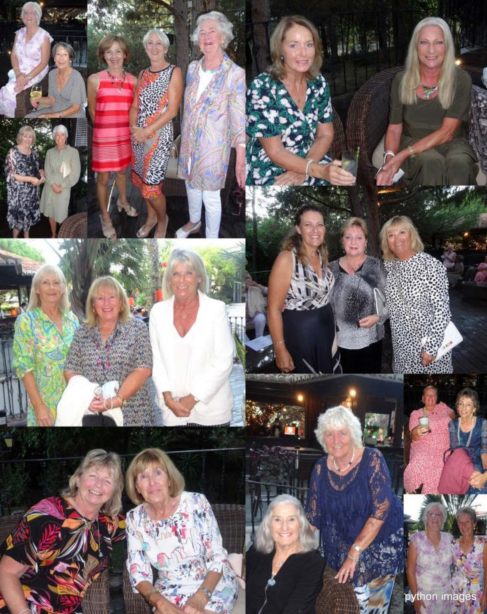
Lady Captains Day