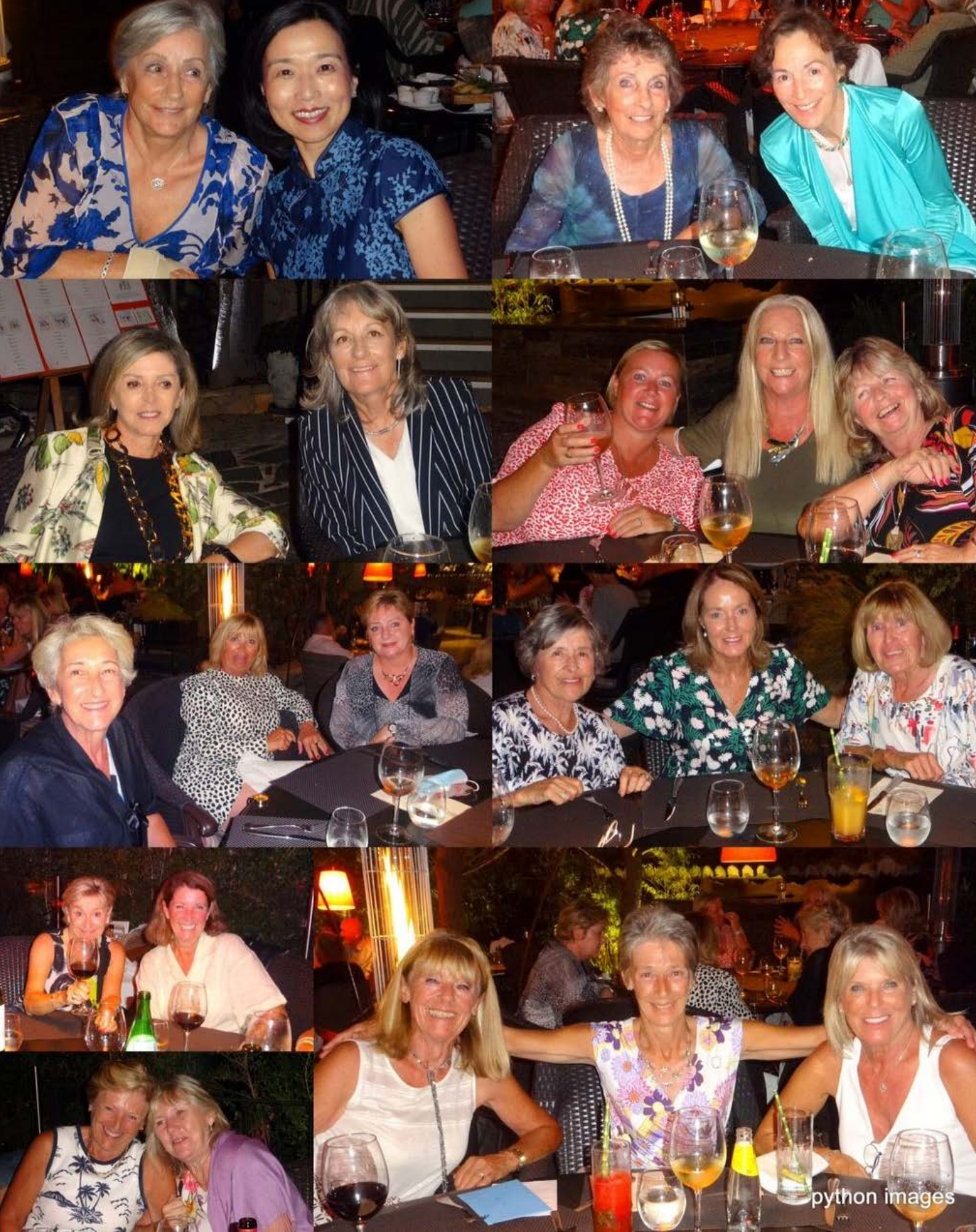
Lady Captains Day