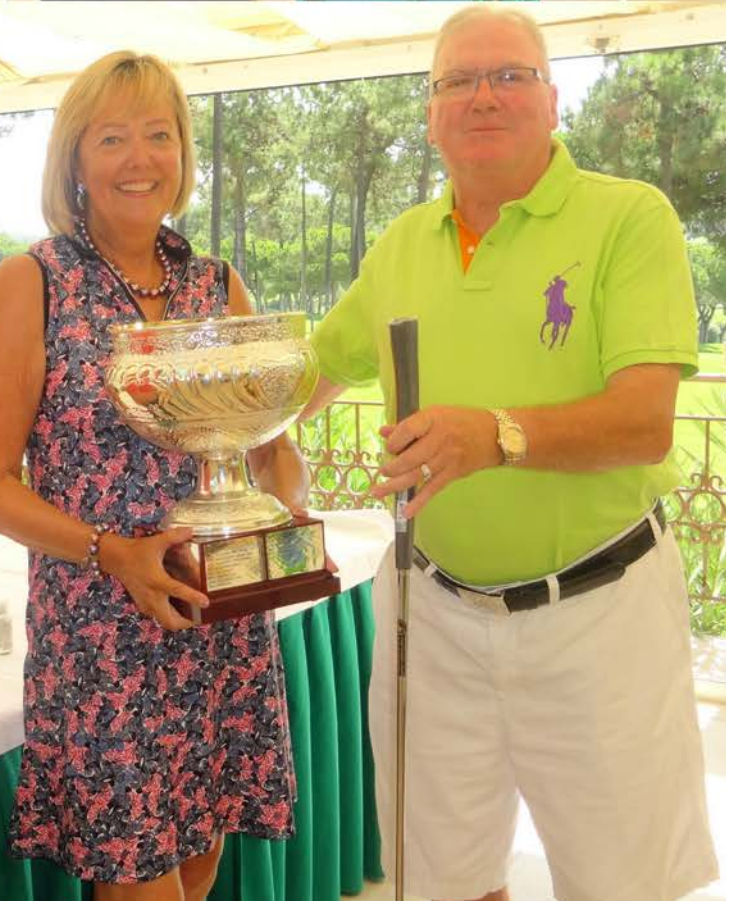
President's Day Prize Winners