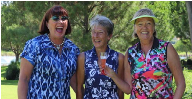
One of the three balls even colour co ordinated with me 😊