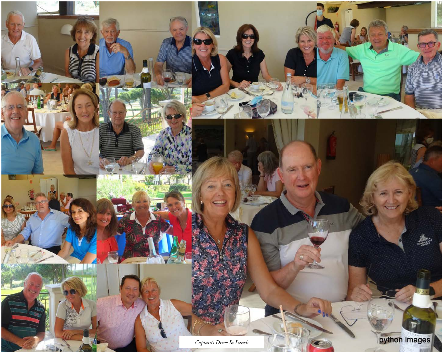
Captain's Drive In Lunch