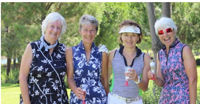
Great to have some of our newer ladies joining in ... and my partner in crime was there to support as always...