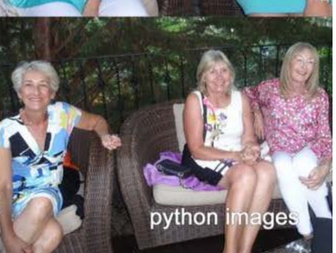
Lady Captains Dinner