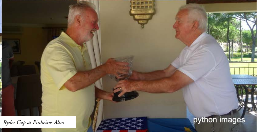
Ryder Cup at Pinheiros Altos