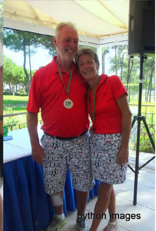
Captain's Drive In Prize Winners