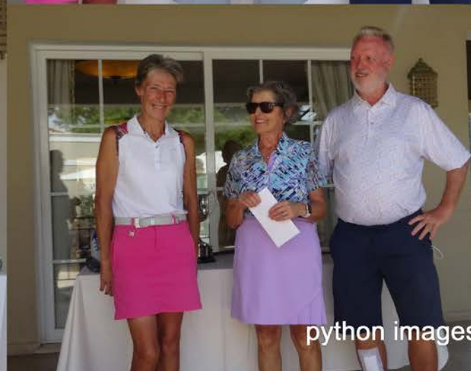
Matchplay Championship Prize Winners