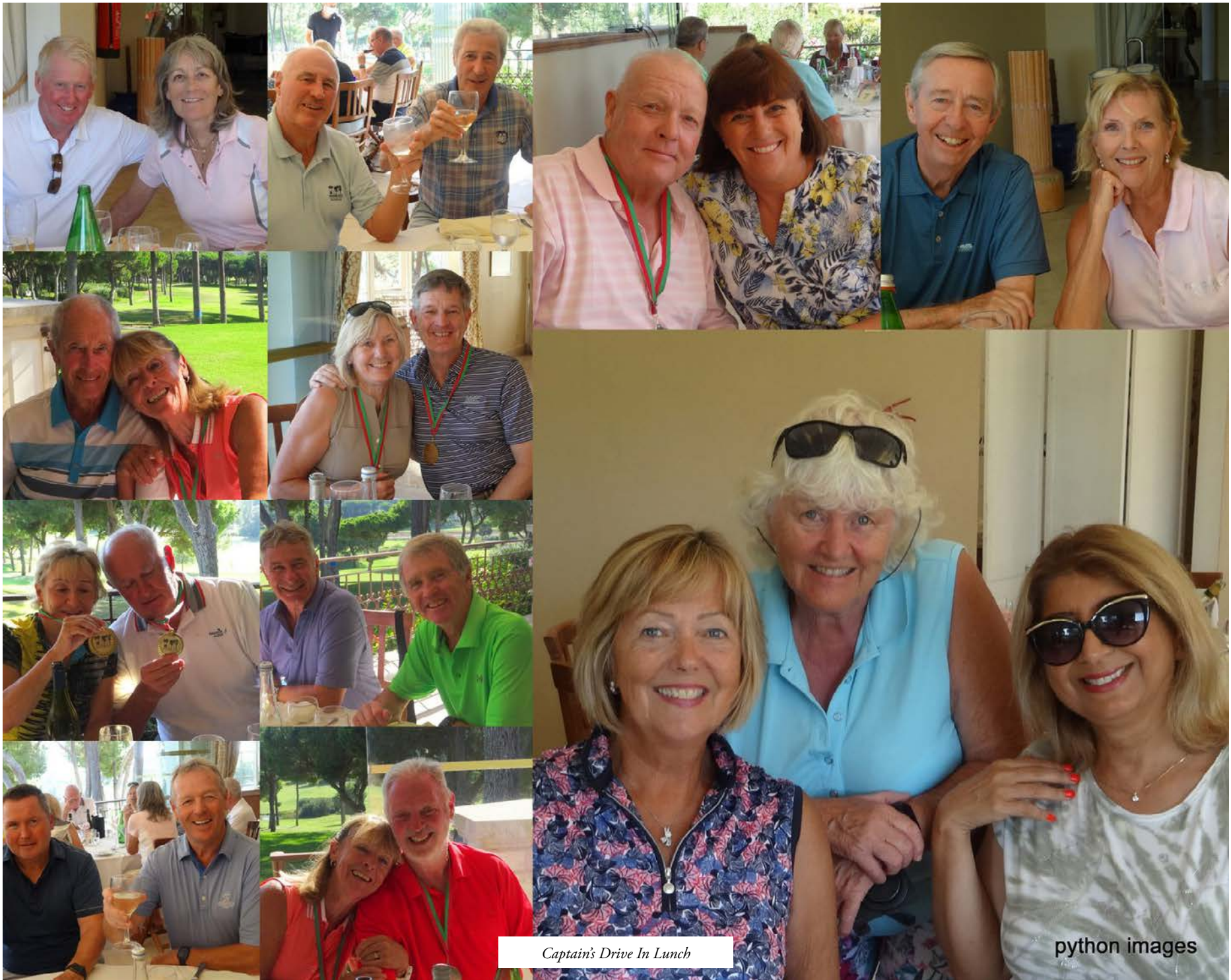
Captain's Drive In Lunch