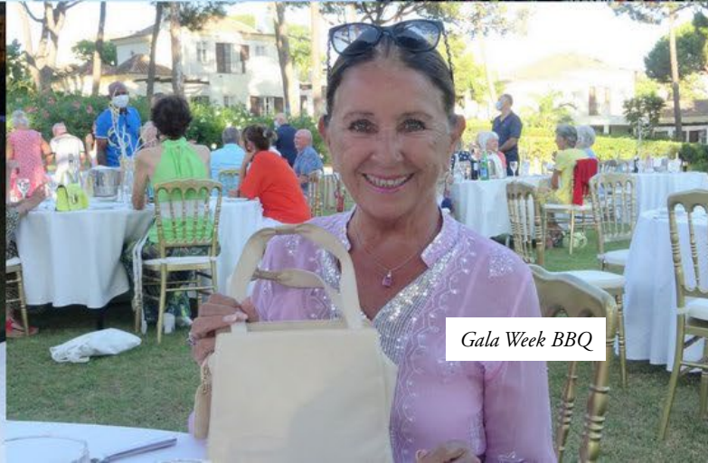
Gala Week BBQ