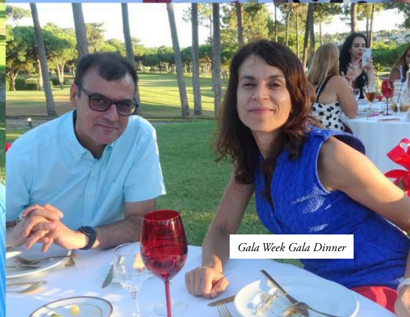
Gala Week Gala Dinner