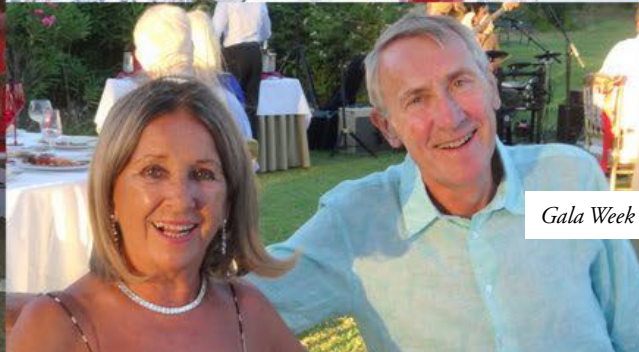
Gala Week Gala Dinner