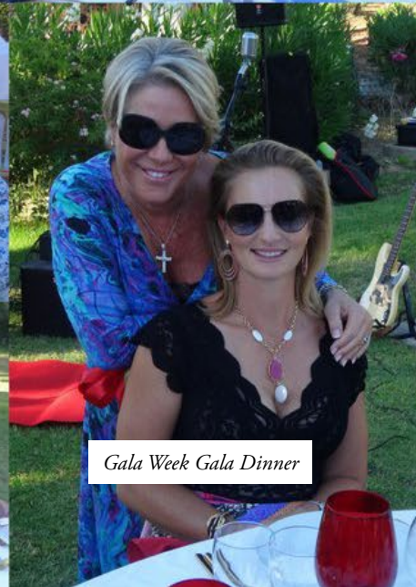
Gala Week Gala Dinner