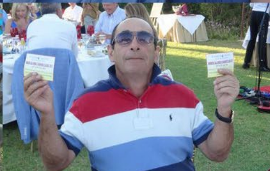
Gala Week Gala Dinner