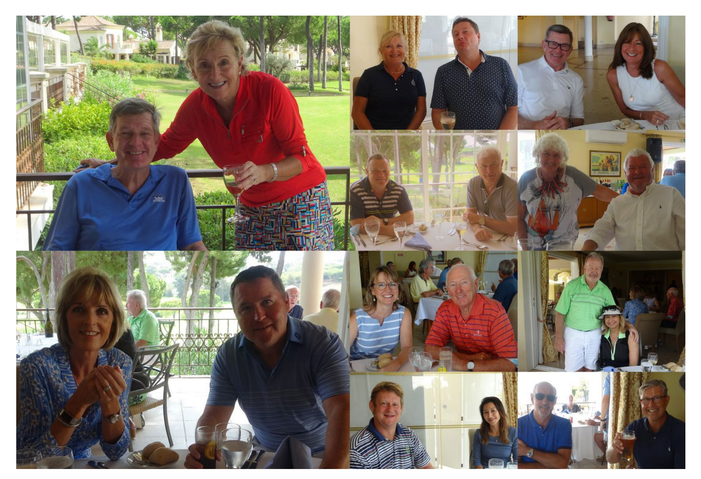
President 's Day