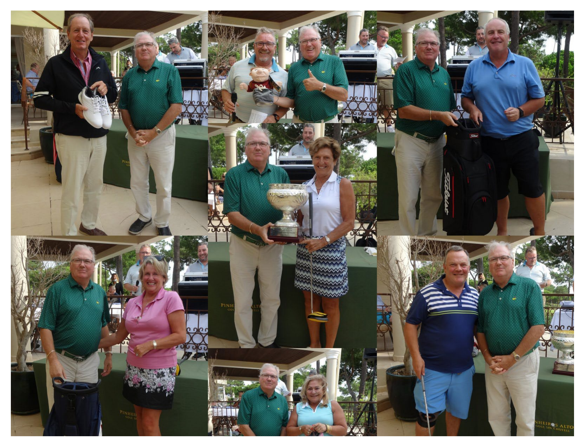
President's Day Prize Winners