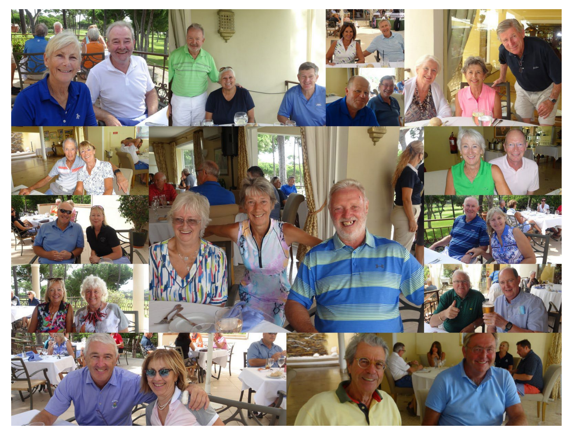
President 's Day