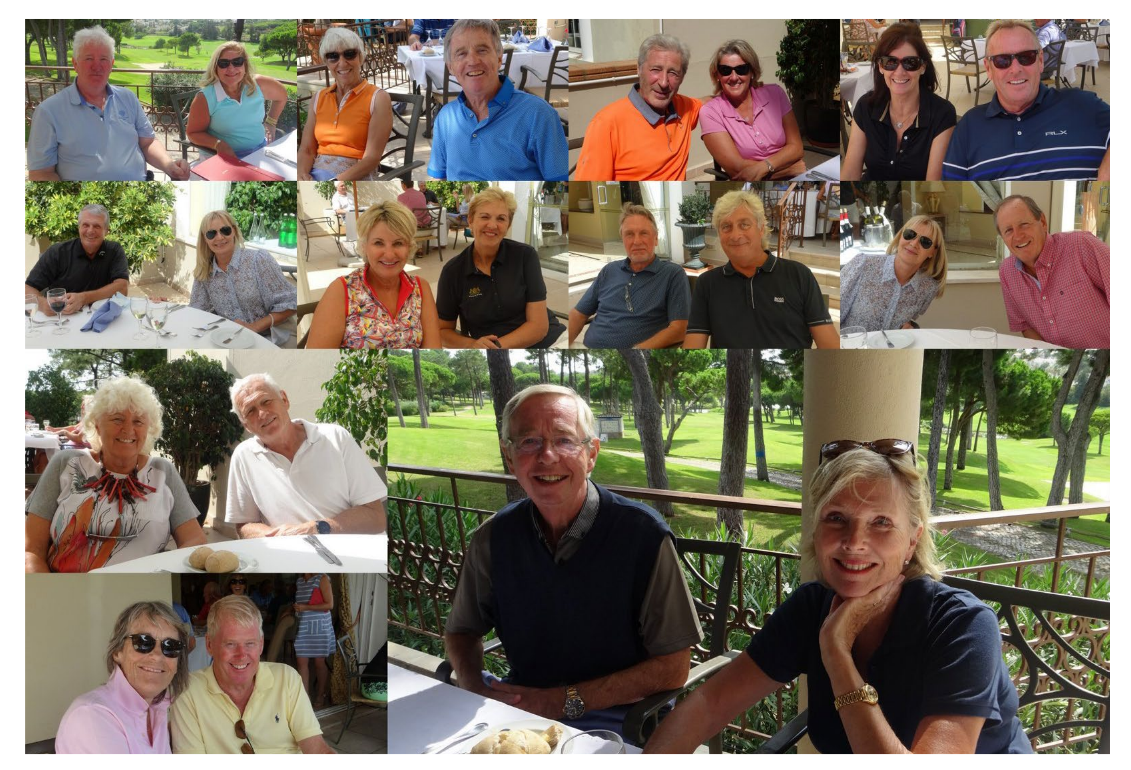
President 's Day