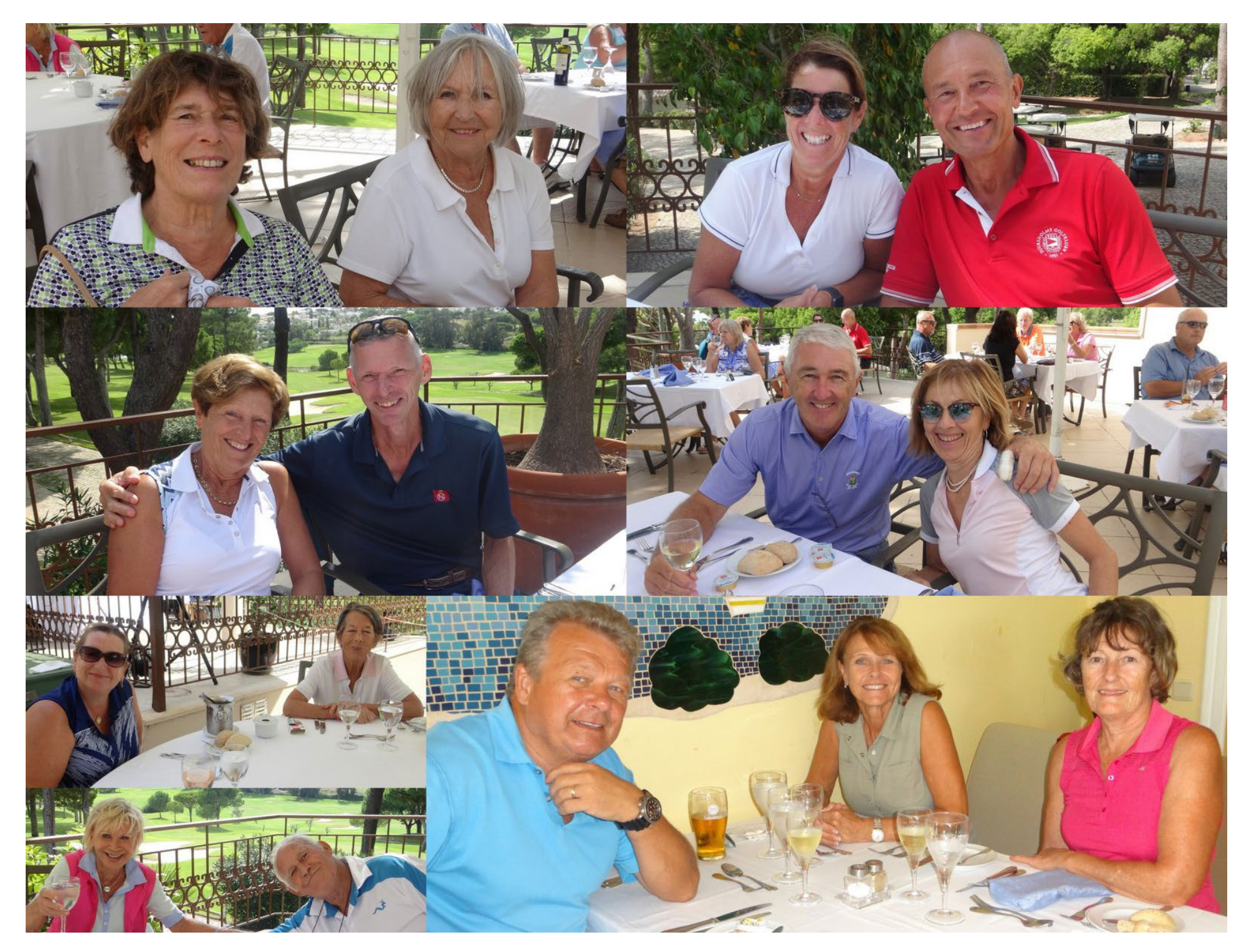
President 's Day