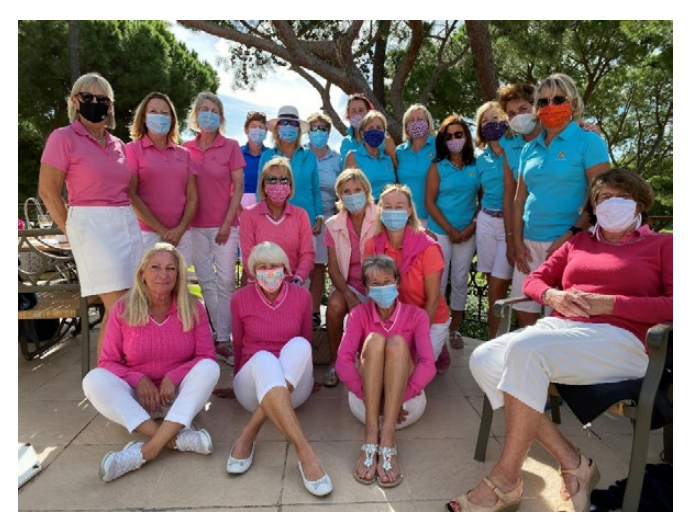
Vilasol and PA Ladies After the Game but Before Lunch!

When we played them away in September we lost 4 out of our 5 matches, but happily our great team reversed the result at home and we won 4 out of our 5 matches.