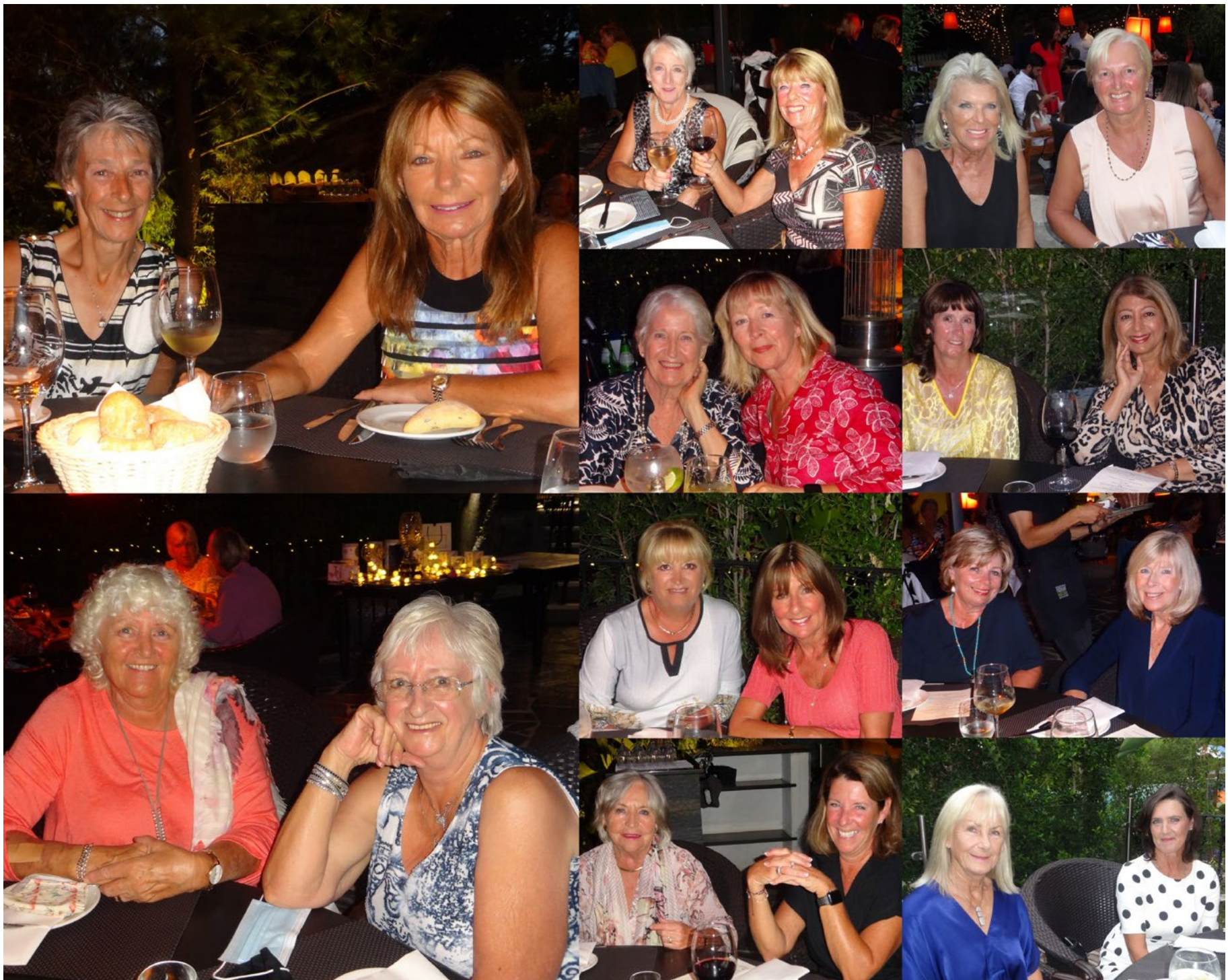
Lady Captains Dinner