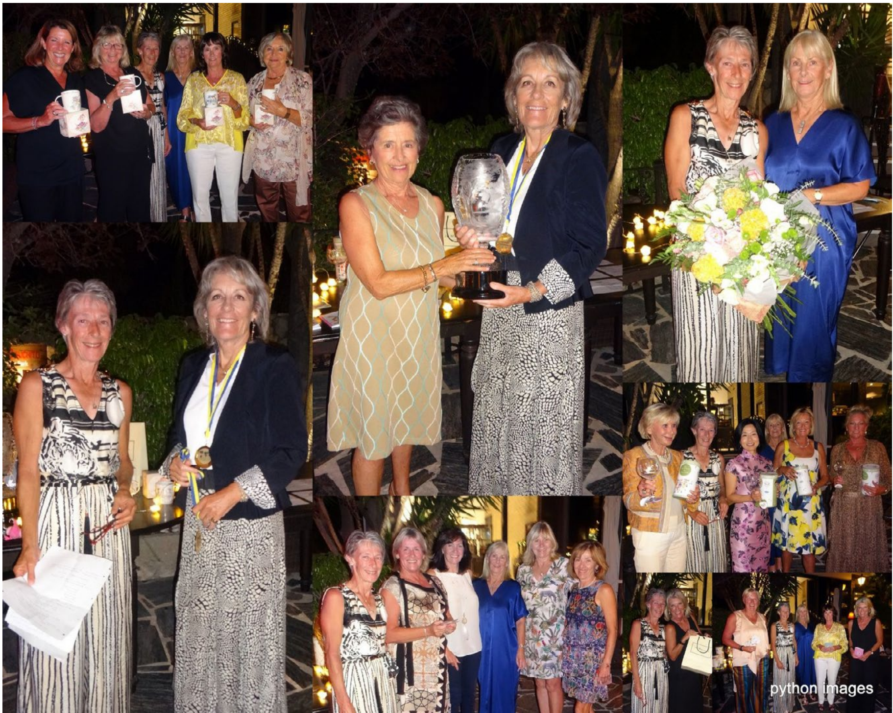
Lady Captains Dinner