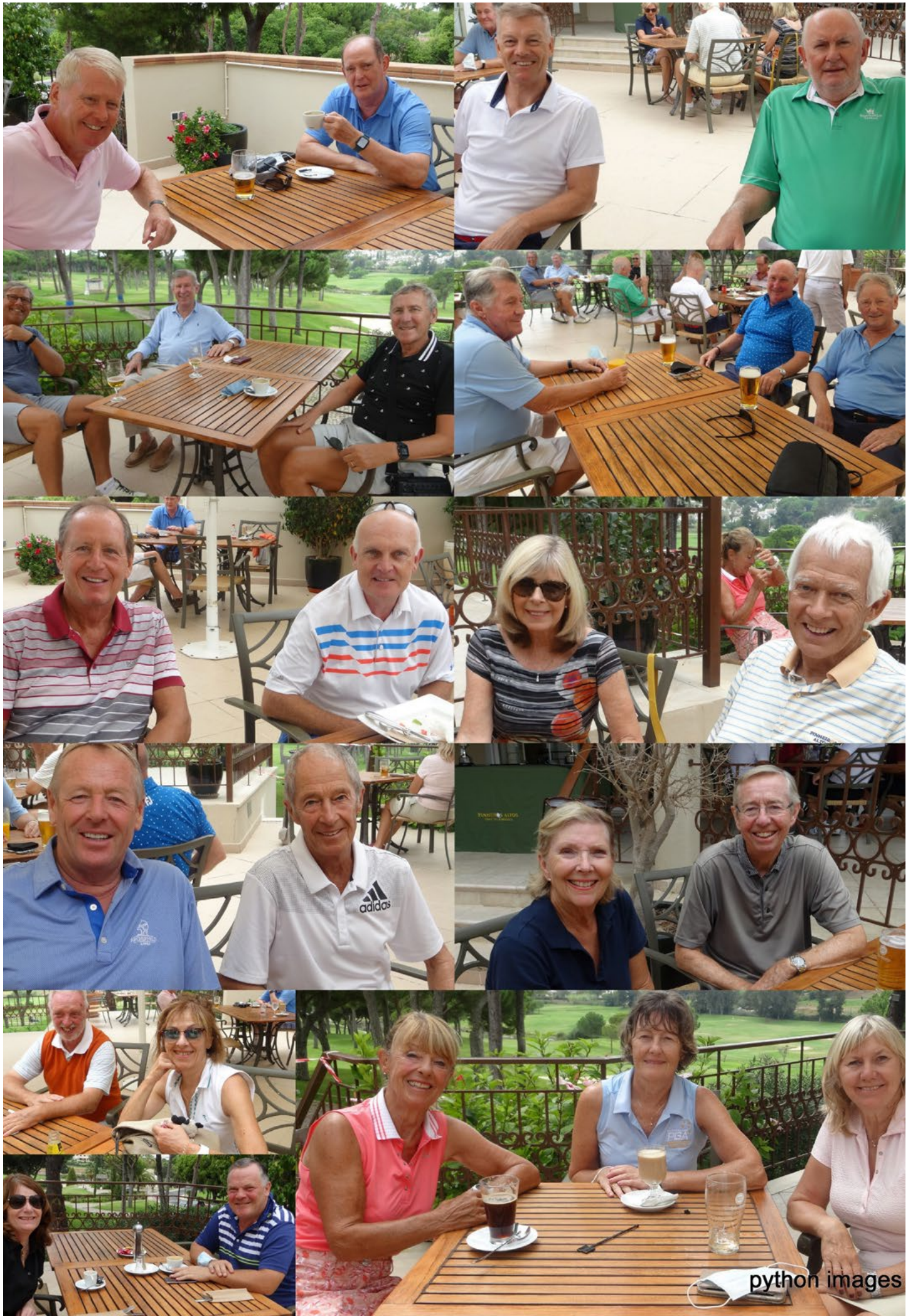
Matchplay Championship participants.