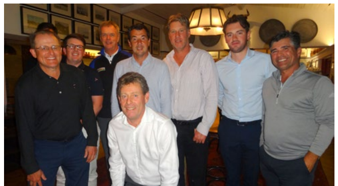
Algarvian Charity Pro Am Pros 's top winners