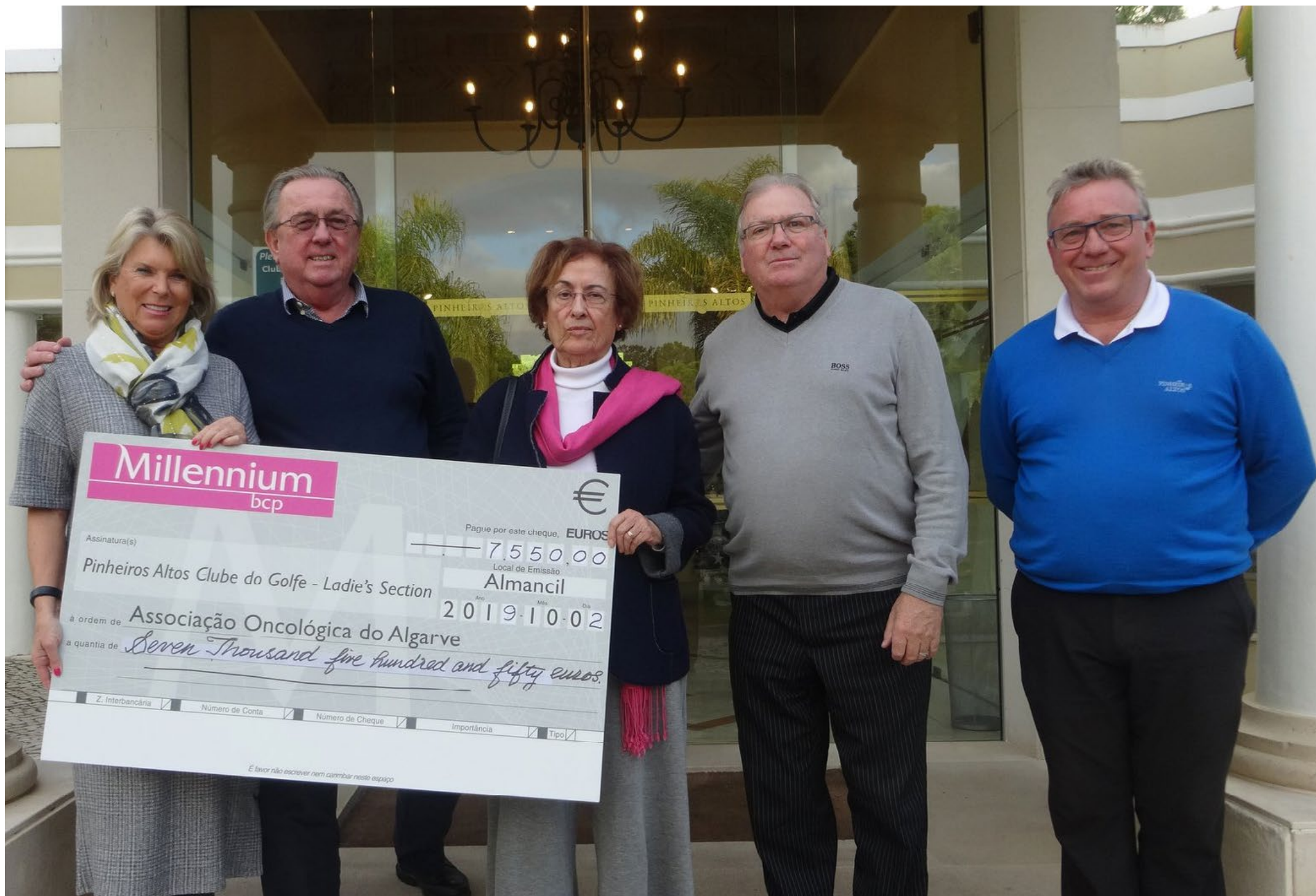
Captains, President and Golf Director presenting the amount of €7,550.00 to the President of Associação Oncológica do Algarve