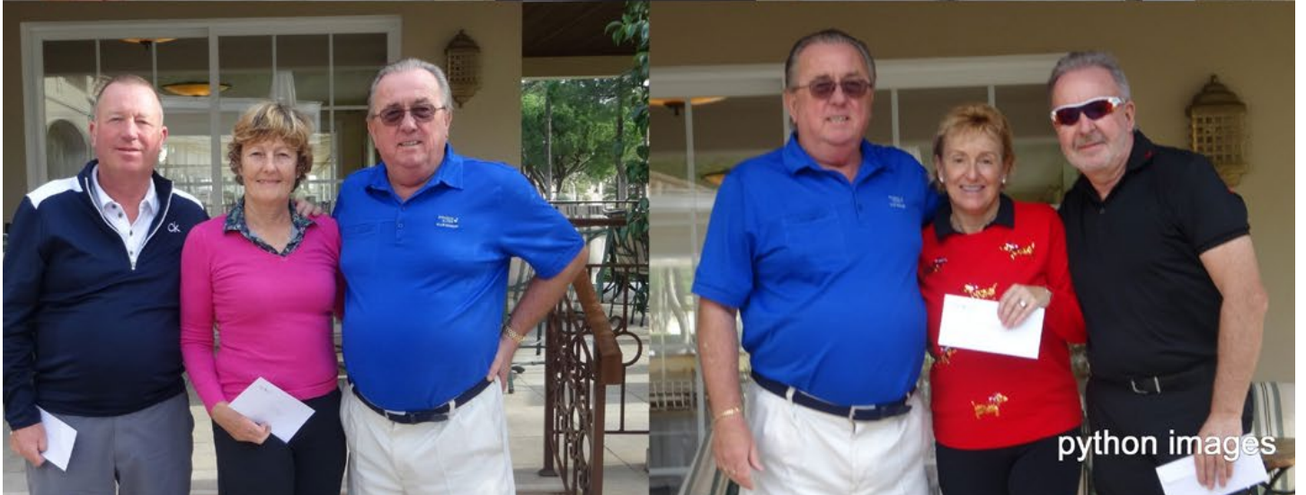
Boxing Day Prize Winners