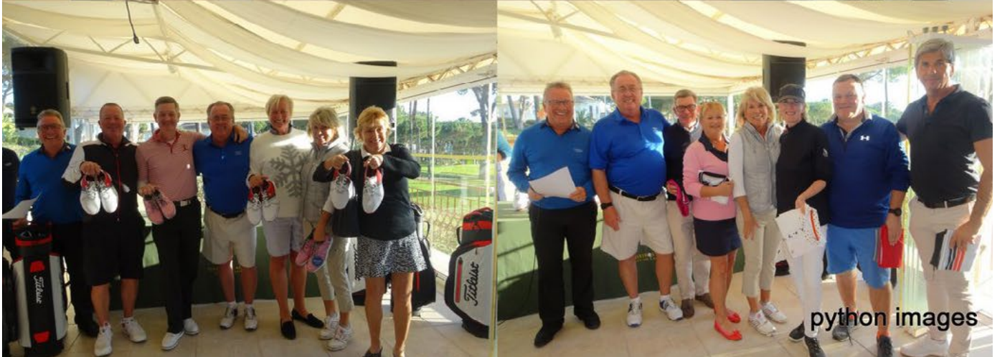
New Year's Scramble Prize Winners