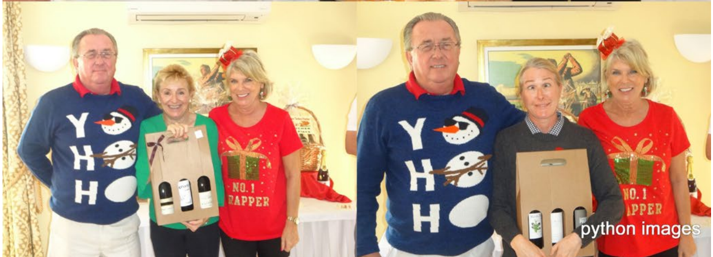
Christmas Turkey Flutter Prize Winners