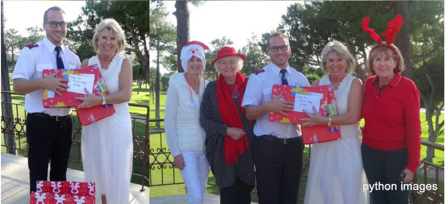
Ladies Christmas Celebrations