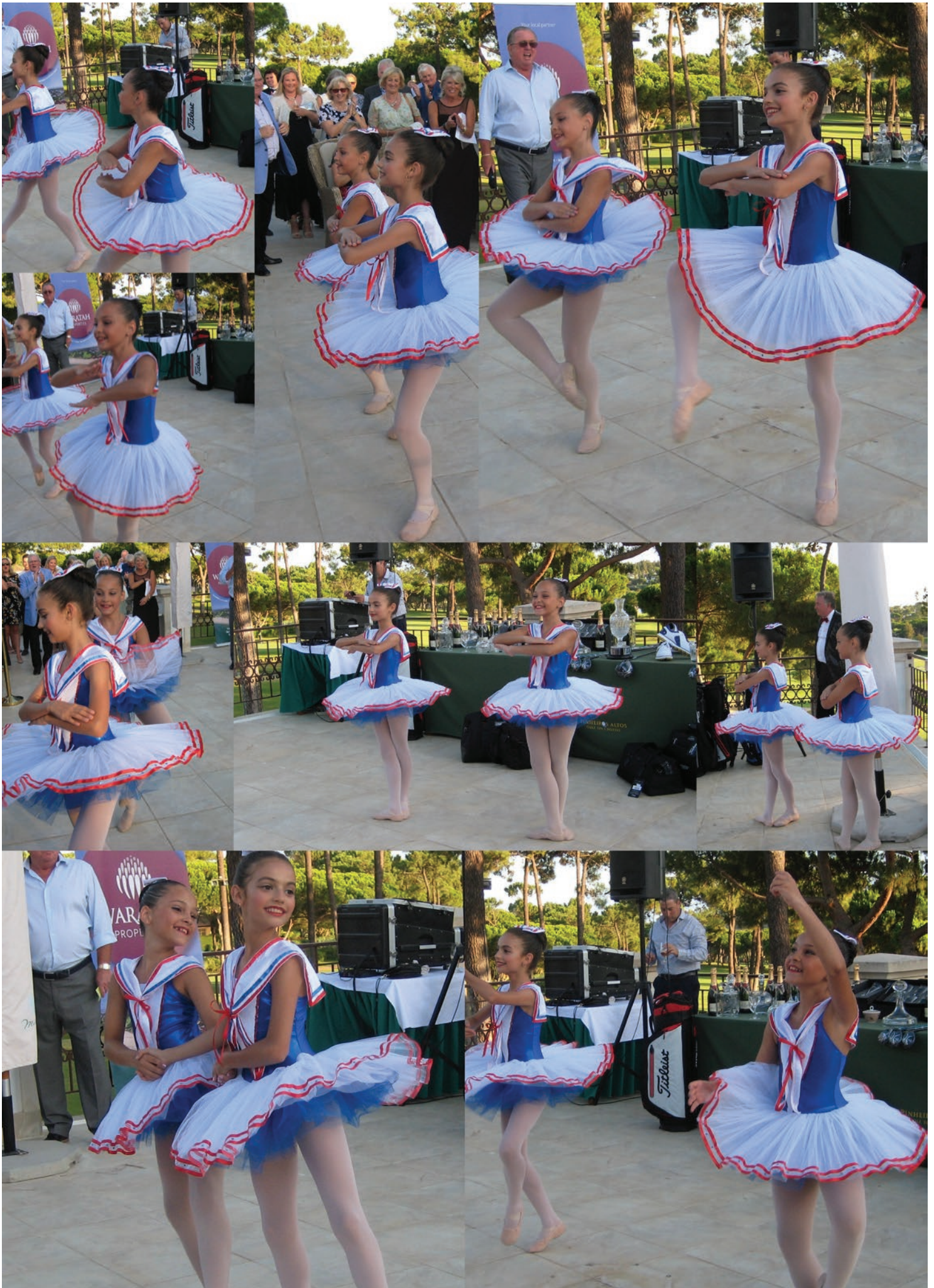
Gala Week 2019 – Gala Dinner