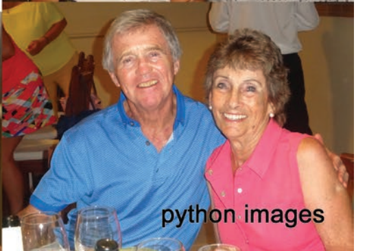
President's Day Incorporating Seniors Championship Dinner