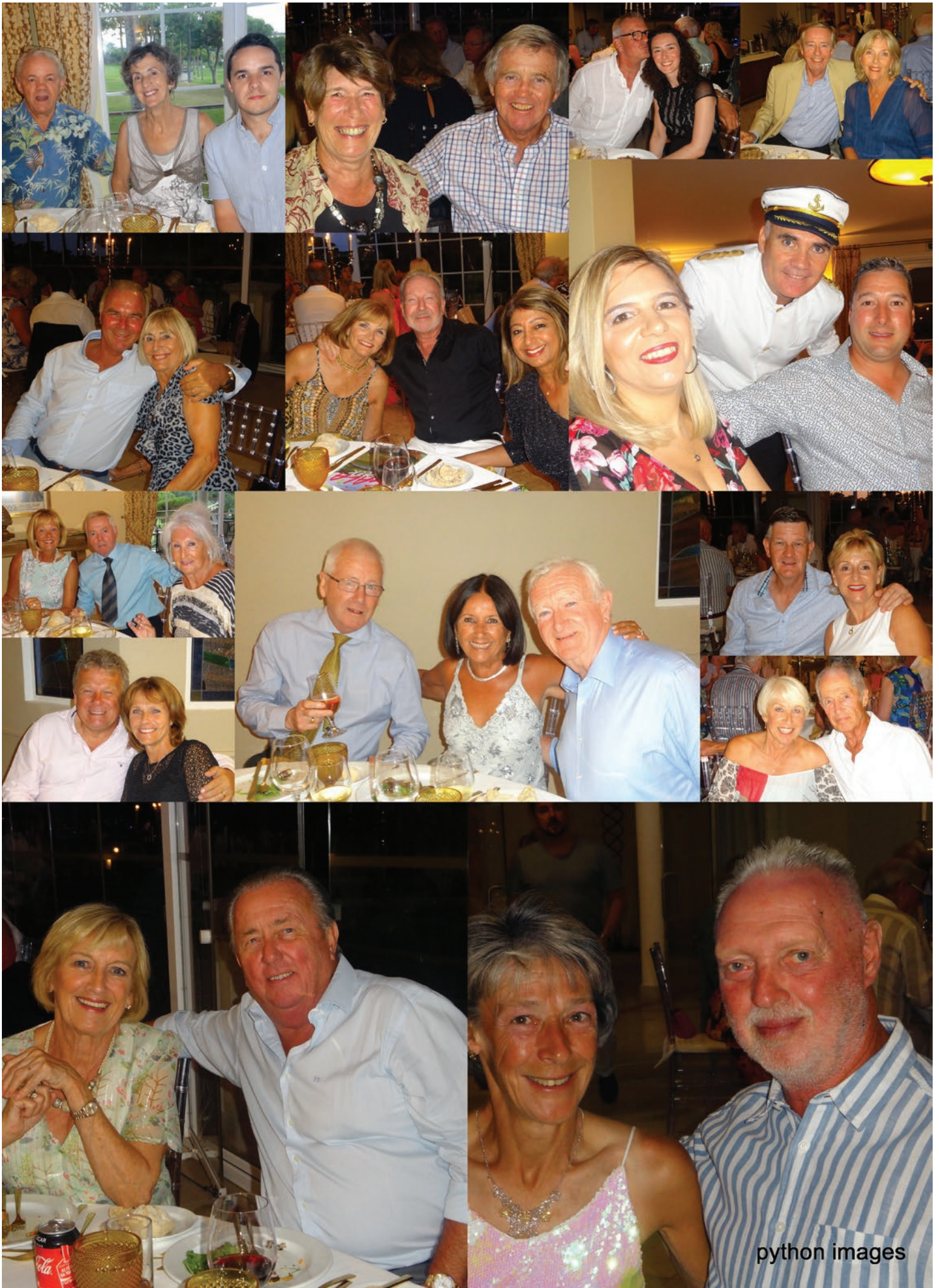
Gala Week 2019 – Gala Dinner