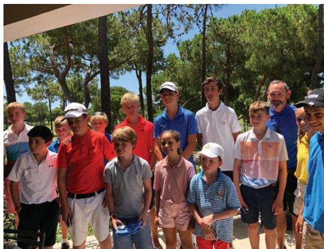
Junior Open participants