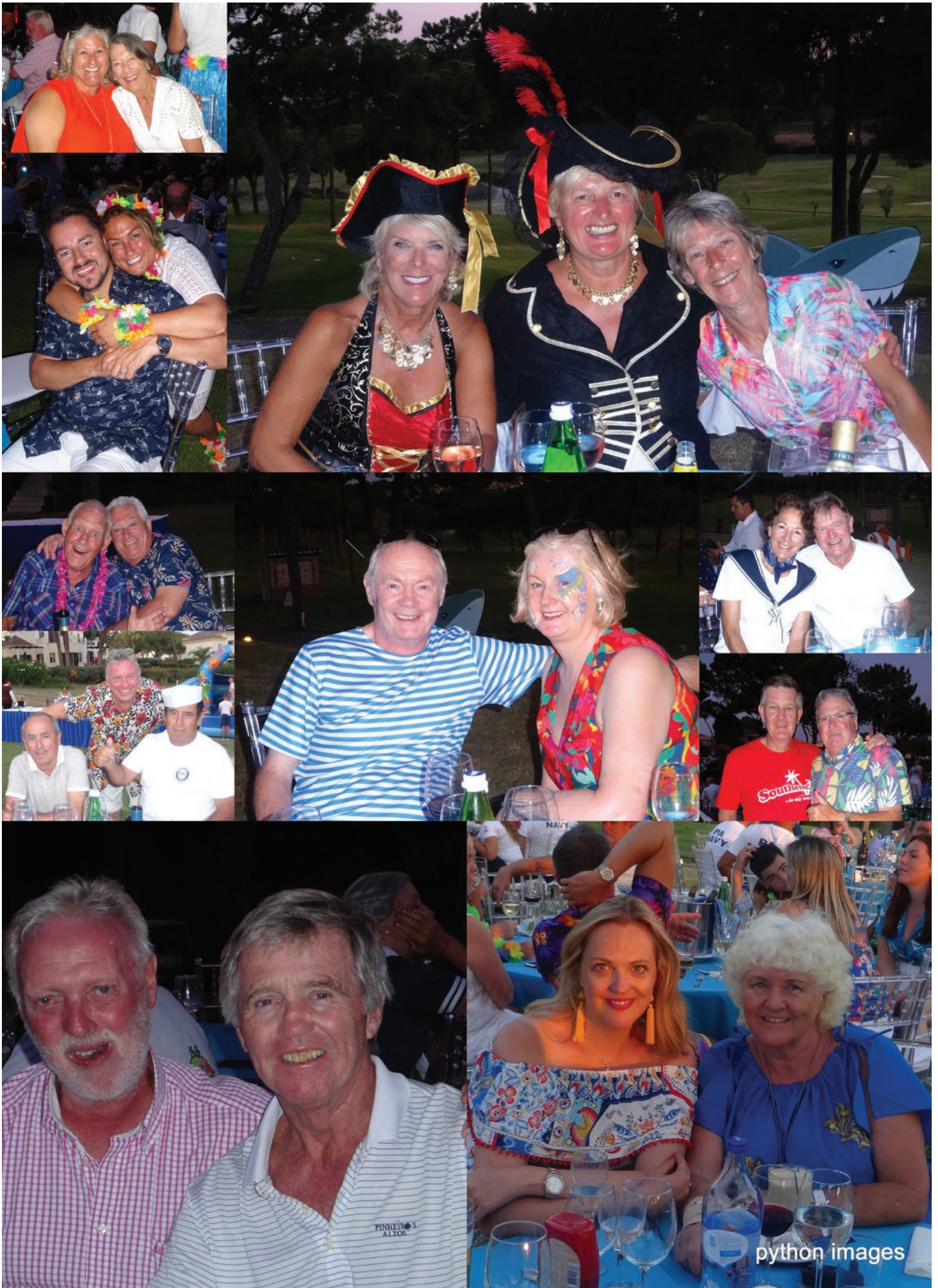
Sea and the Seashore Shoot Out