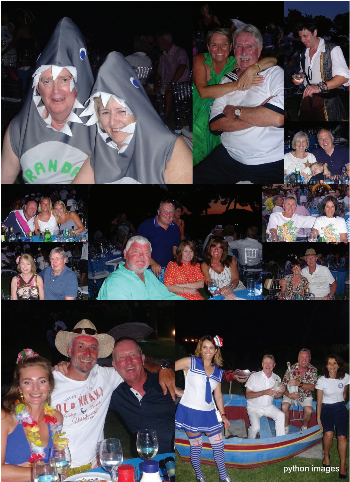
Sea and the Seashore Shoot Out