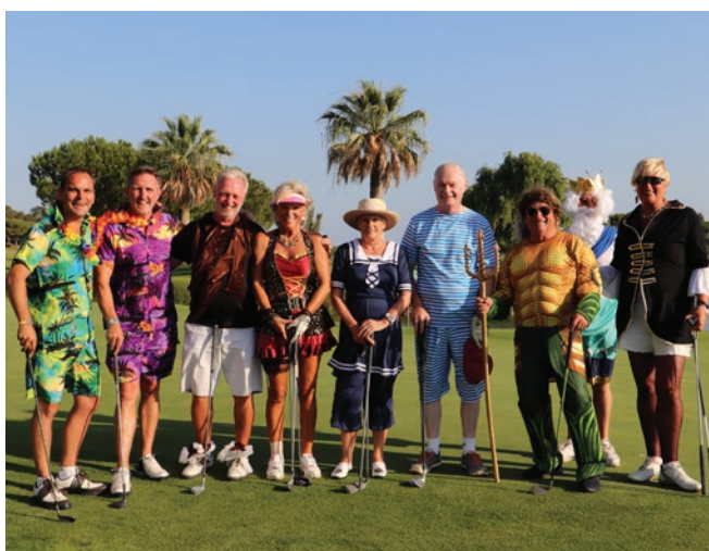
Shoot out finalists