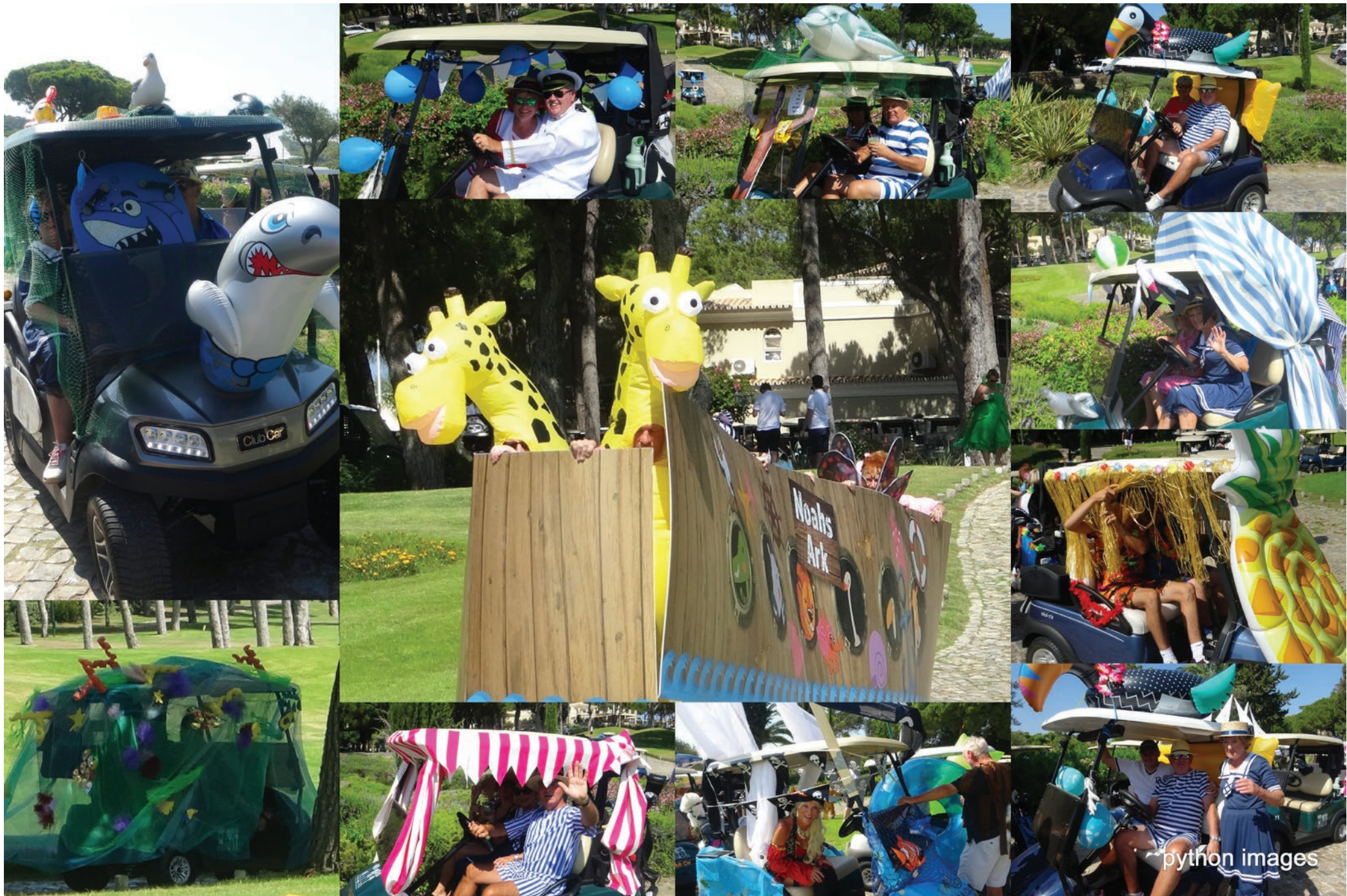
Sea and the Seashore Shoot Out