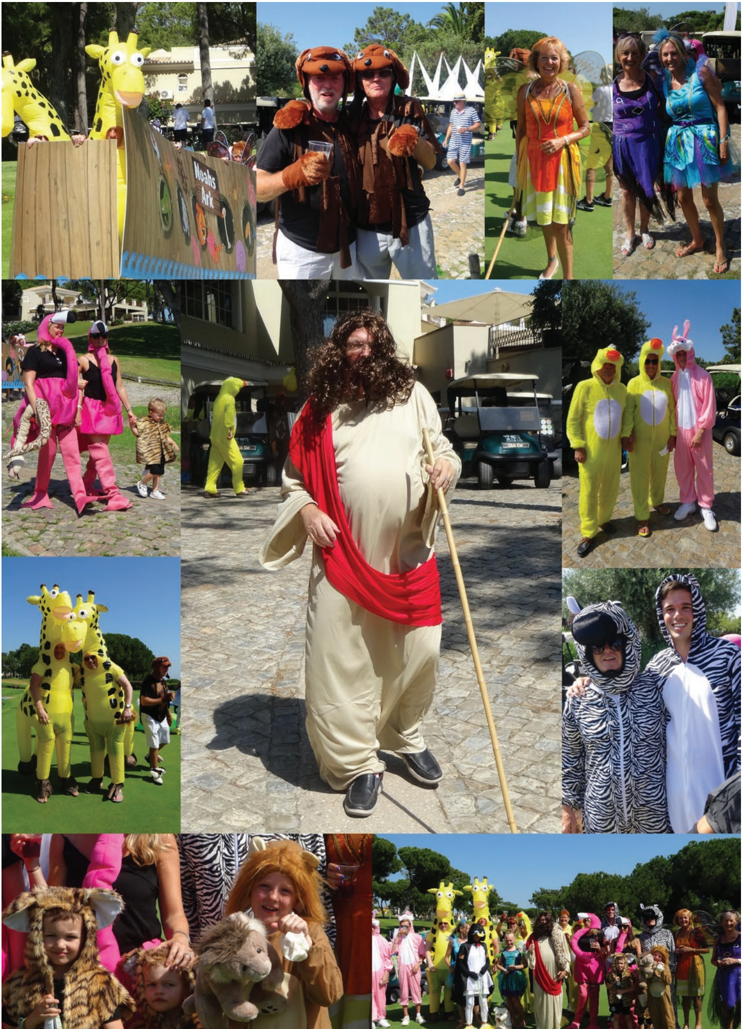
Sea and the Seashore Shoot Out