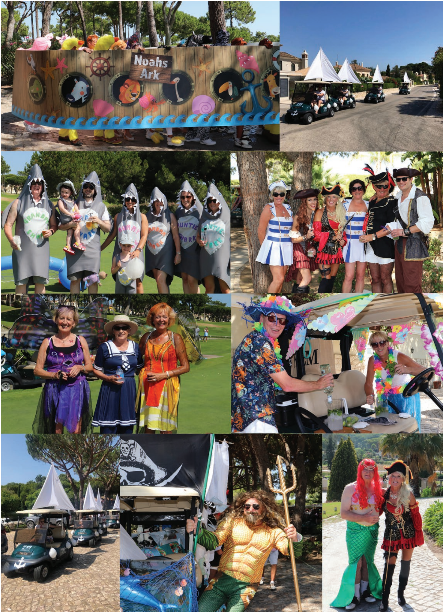
Sea and the Seashore Shoot Out