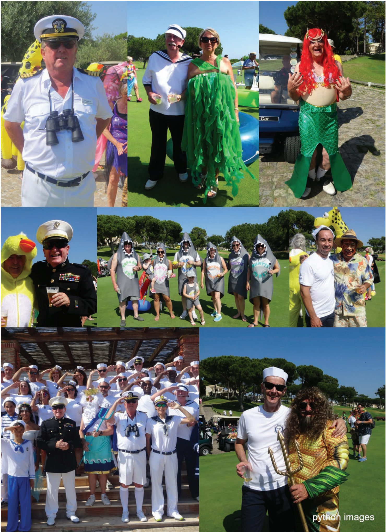
Sea and the Seashore Shoot Out