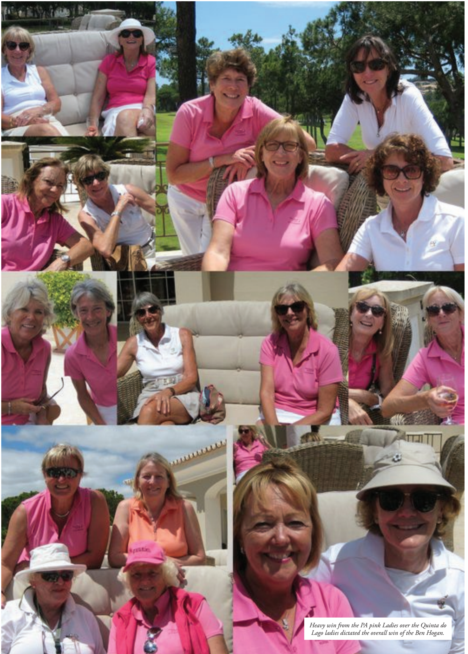
Heavy win from the PA pink Ladies over the Quinta do Lago ladies dictated the overall win of the Ben Hogan.