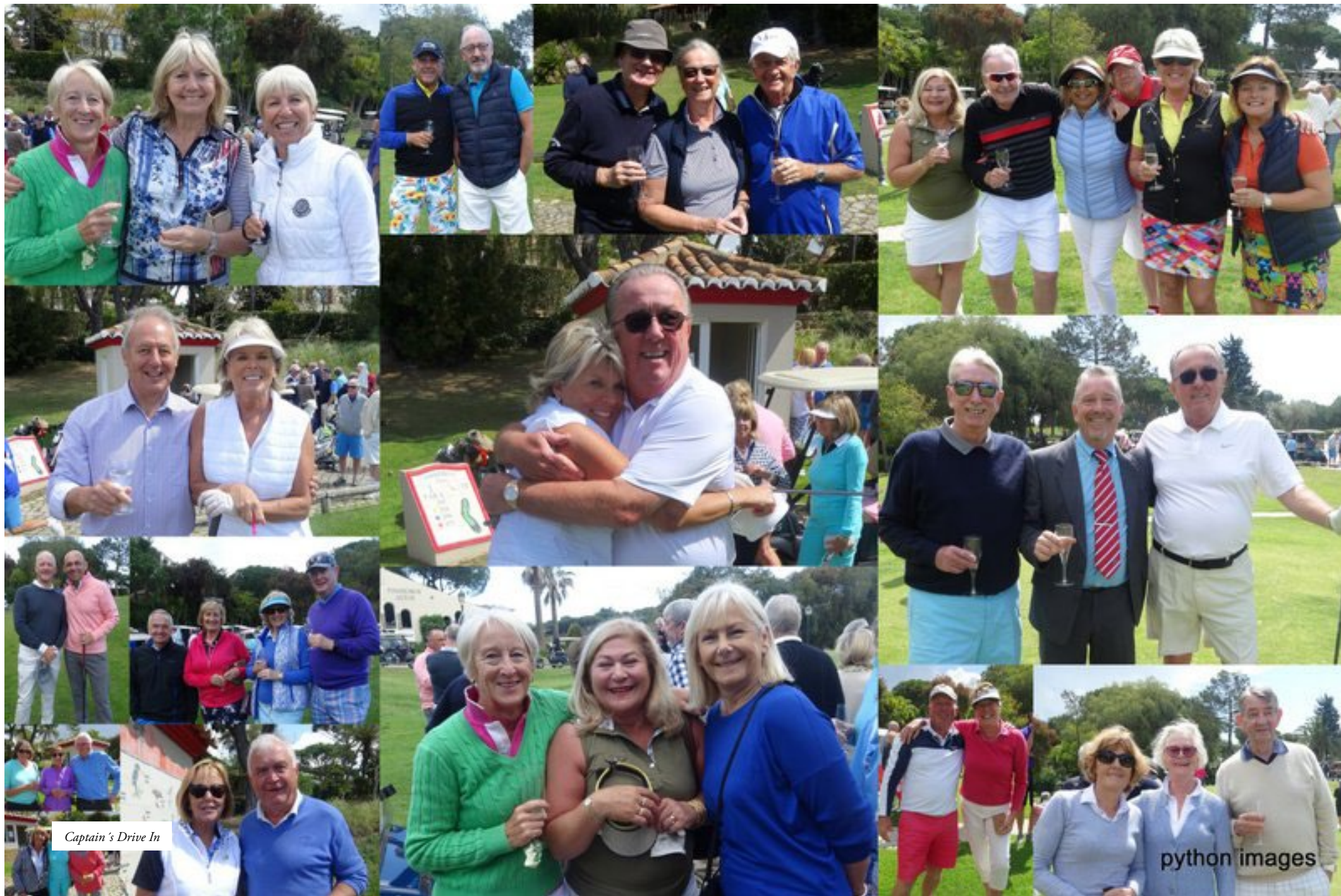
Captain's Drive In