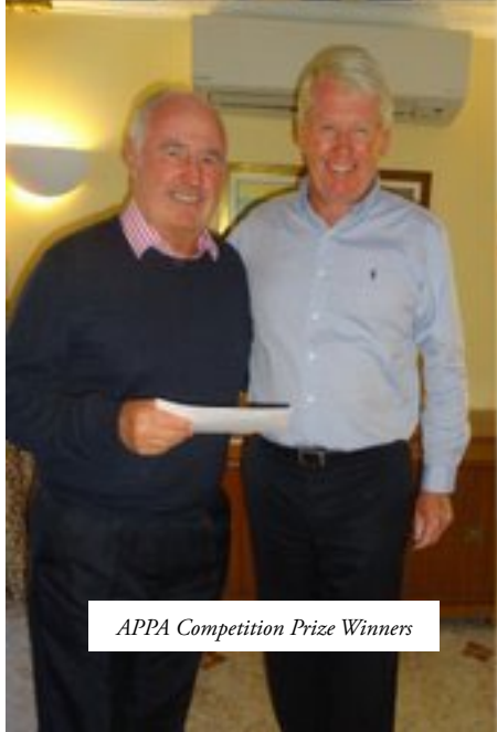
APPA Competition Prize Winners