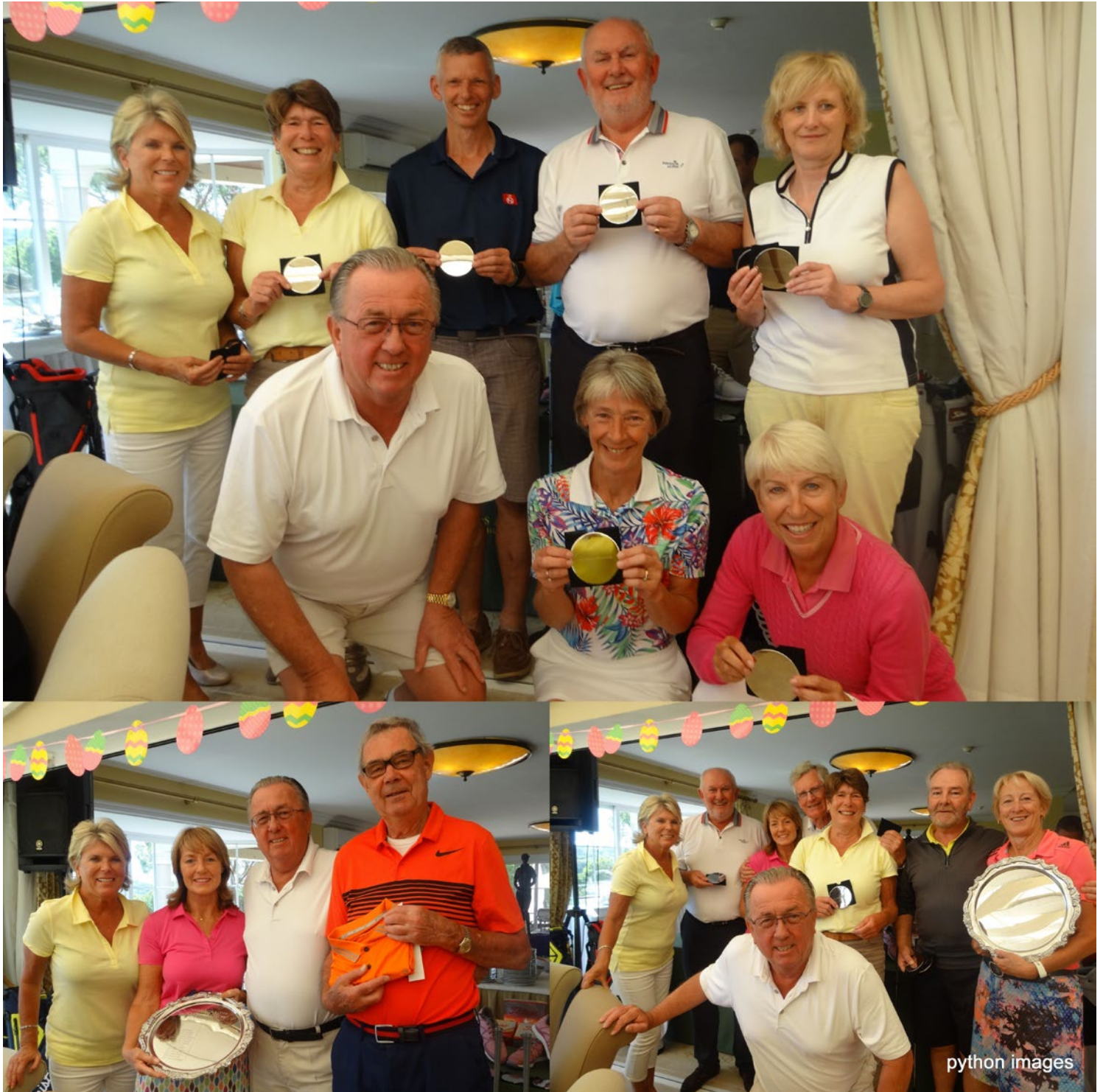
Medal and Stableford Winners