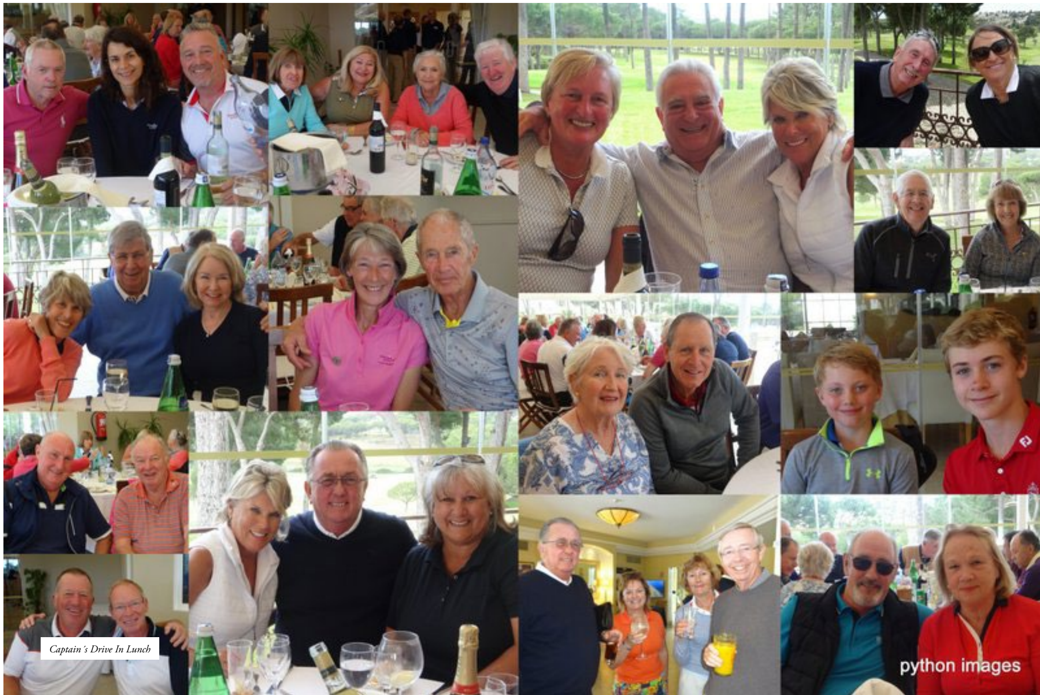
Captain's Drive In Lunch