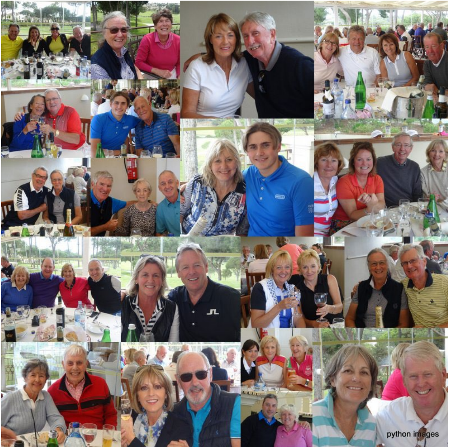
Captain's Drive In Lunch