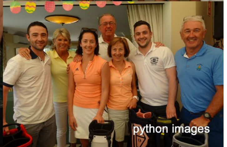
Easter Scramble Prize Winners