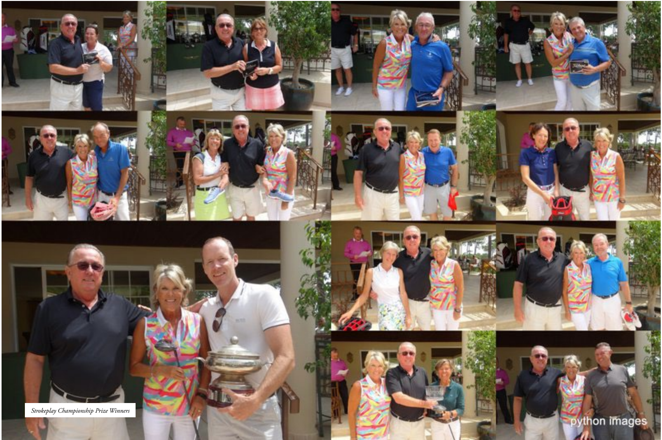
Strokeplay Championship Prize Winners