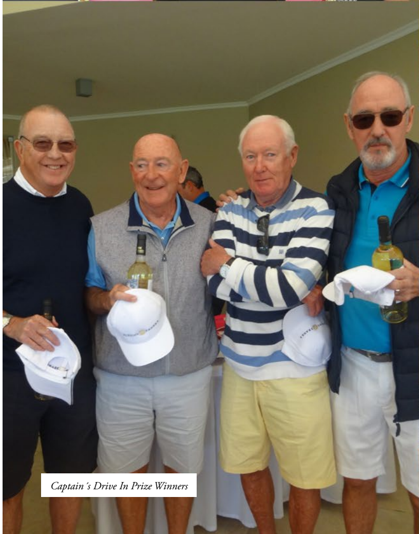
Captain's Drive In Prize Winners