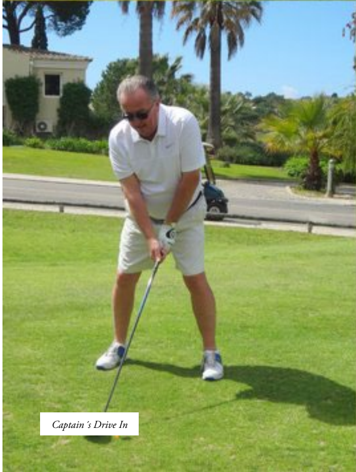
Captain's Drive In