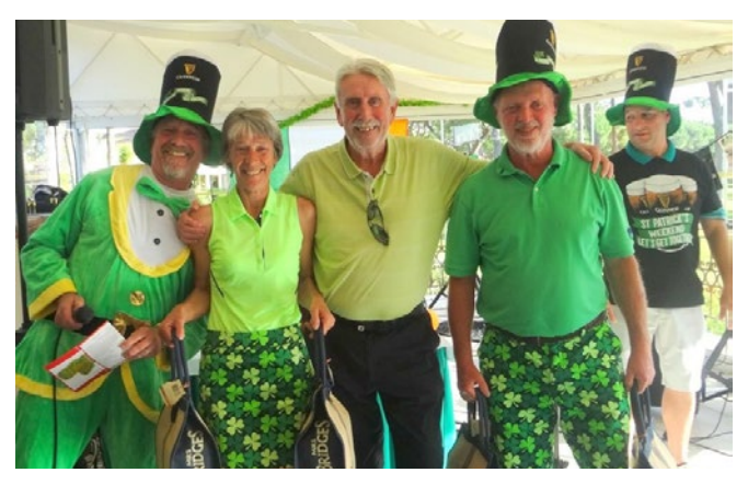
St Patricks Day Winners