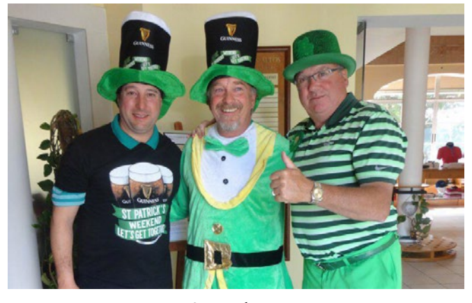
St Patricks Day