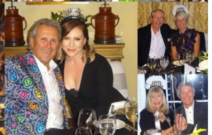
New Year's Eve Celebrations