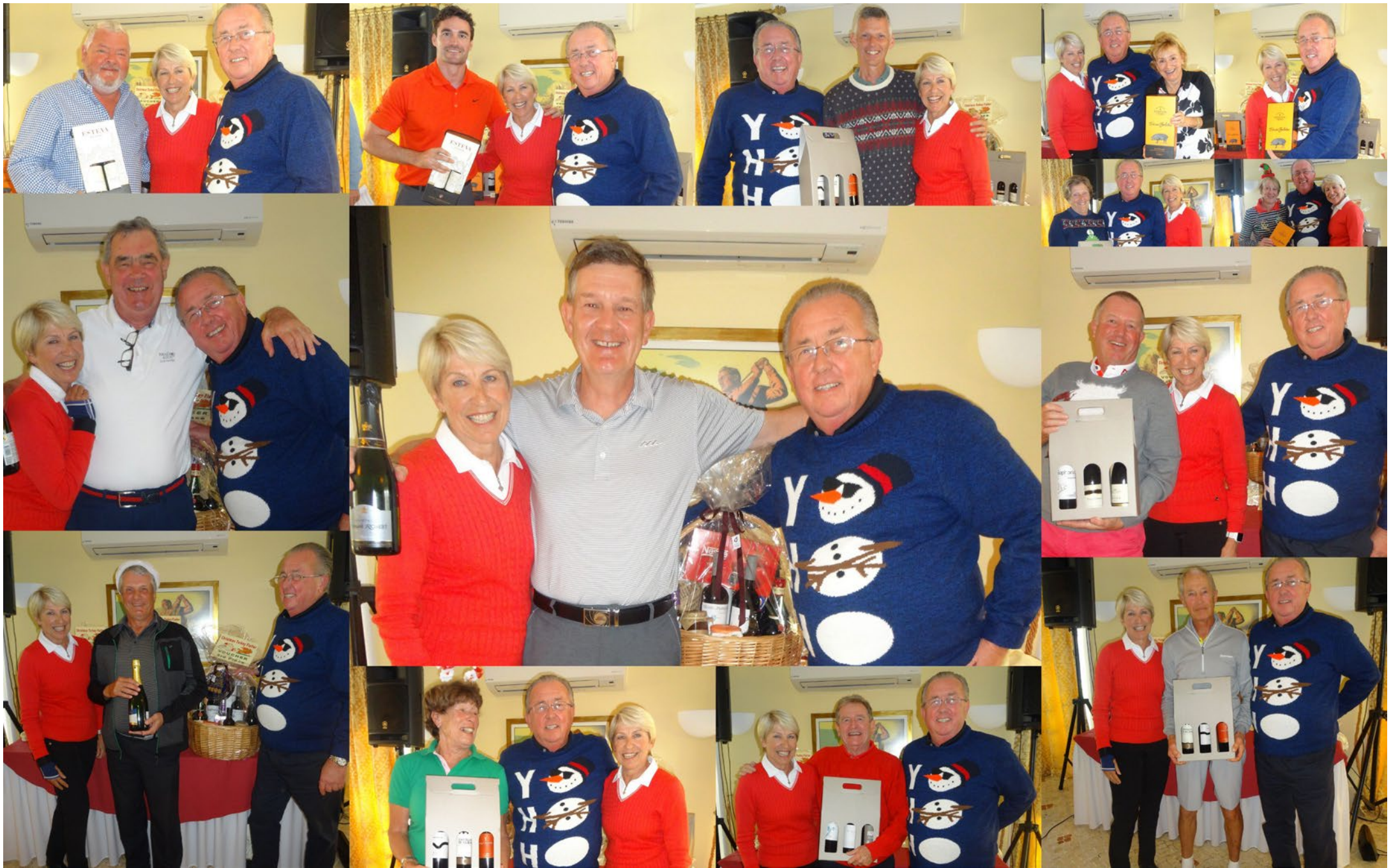
Christmas Turkey Flutter prize winners