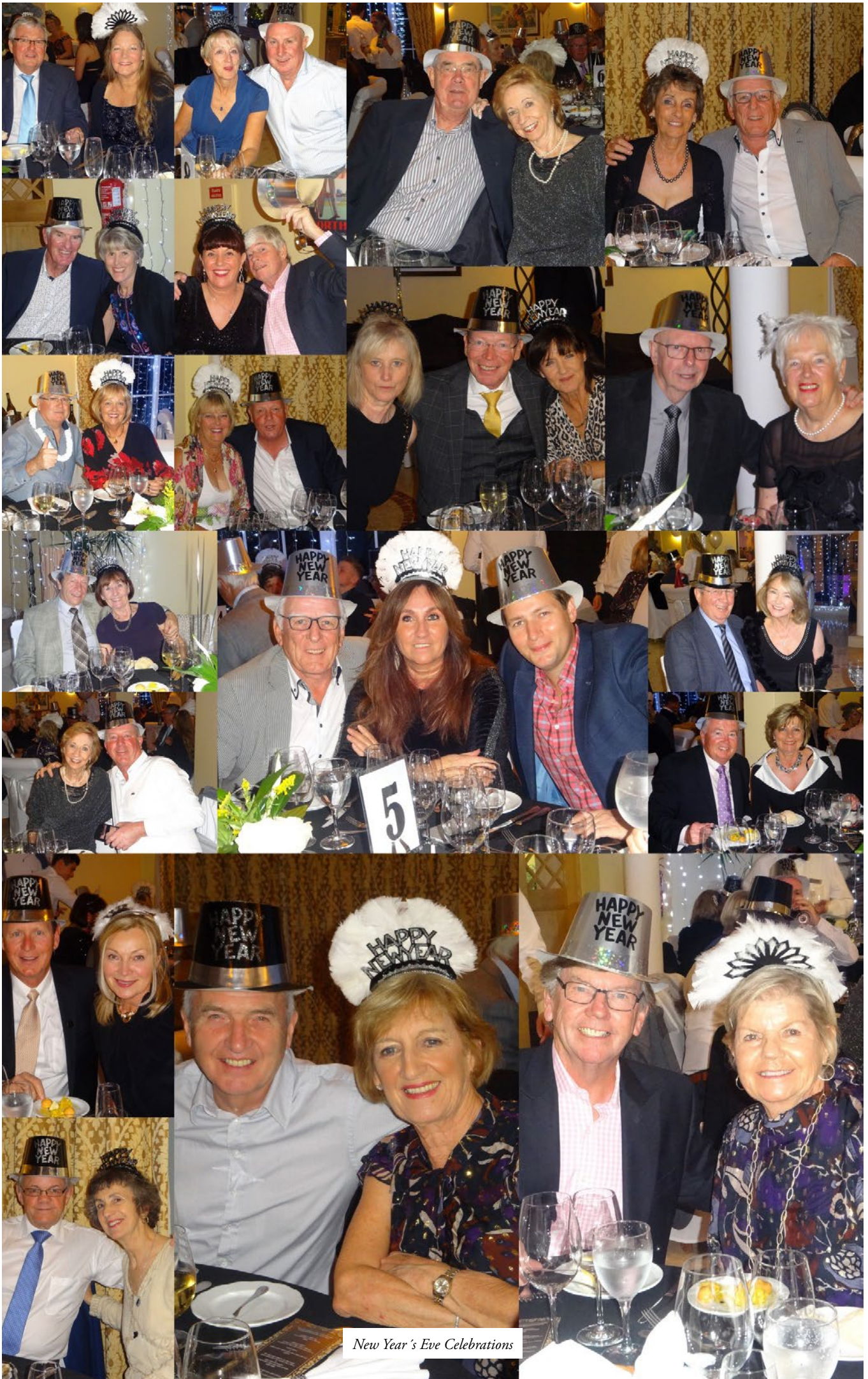
New Year's Eve Celebrations