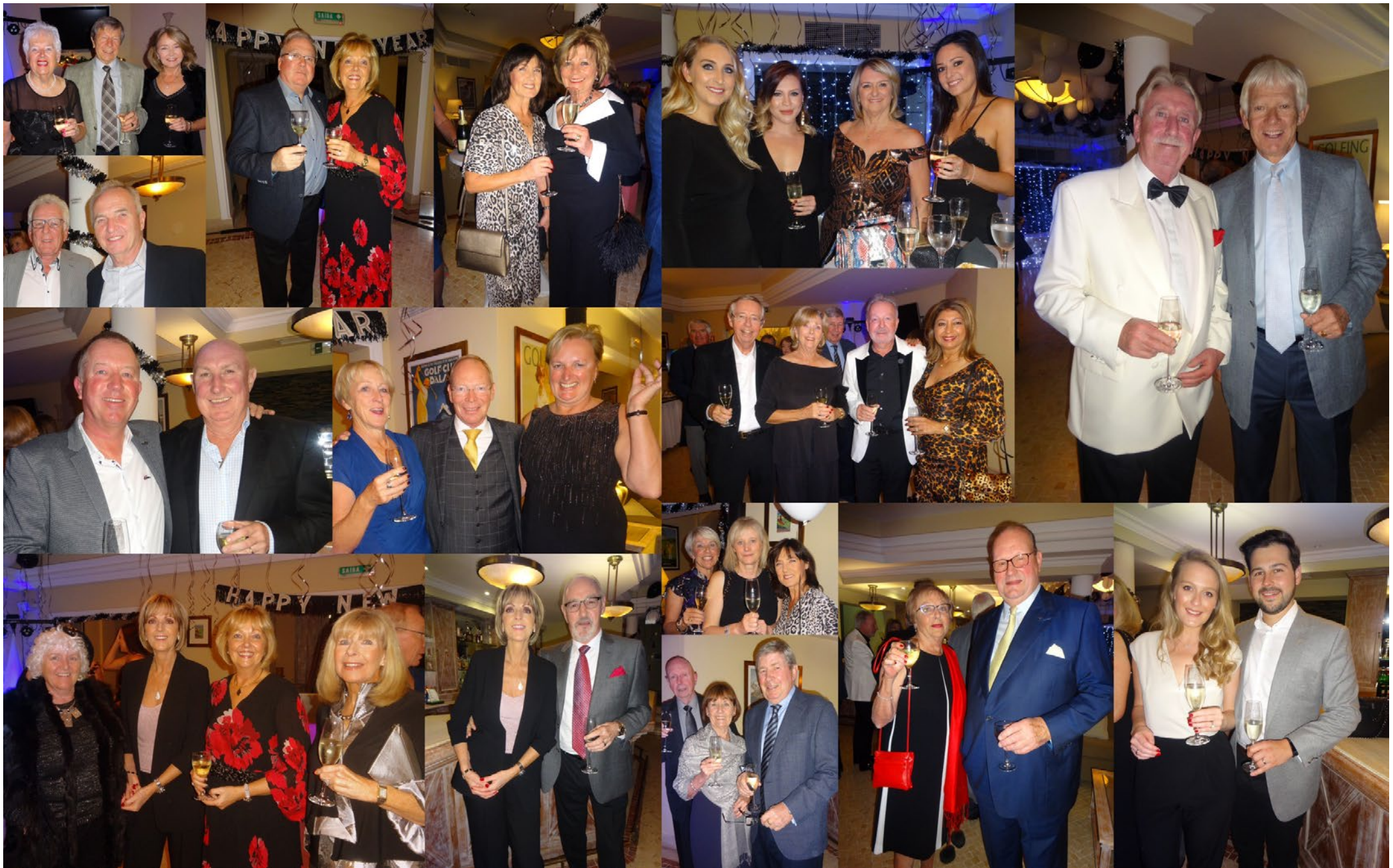
New Year's Eve Celebrations