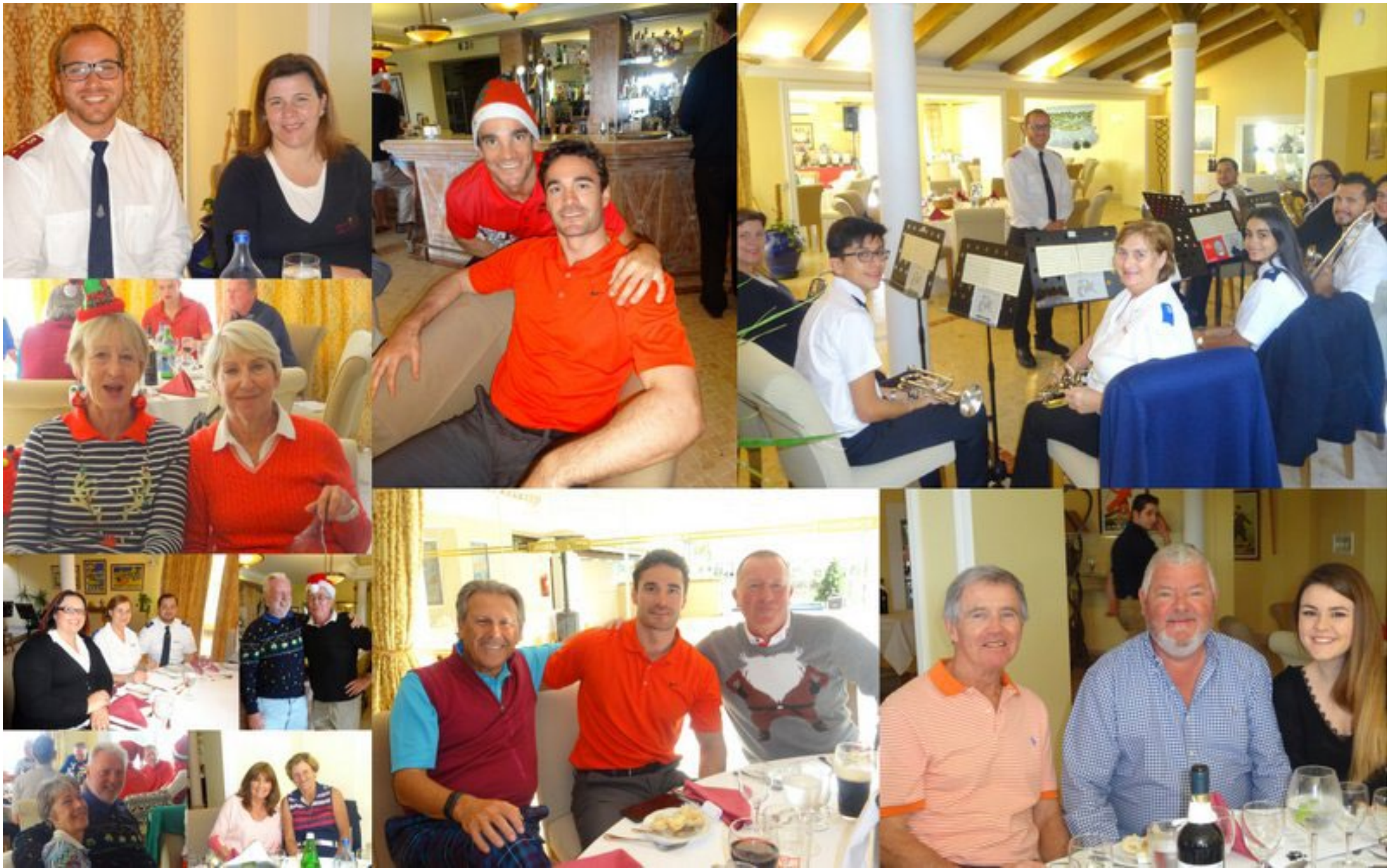
Christmas Turkey Flutter