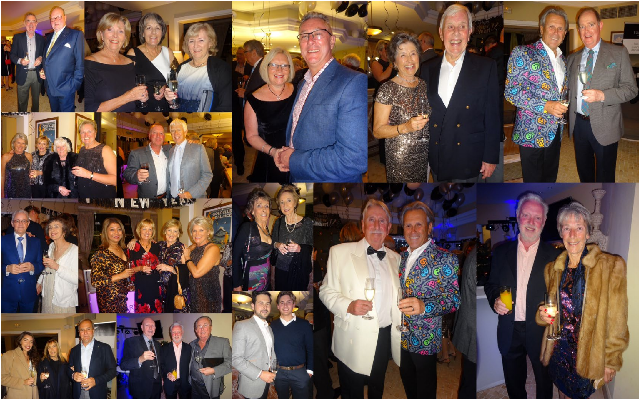
New Year's Eve Celebrations