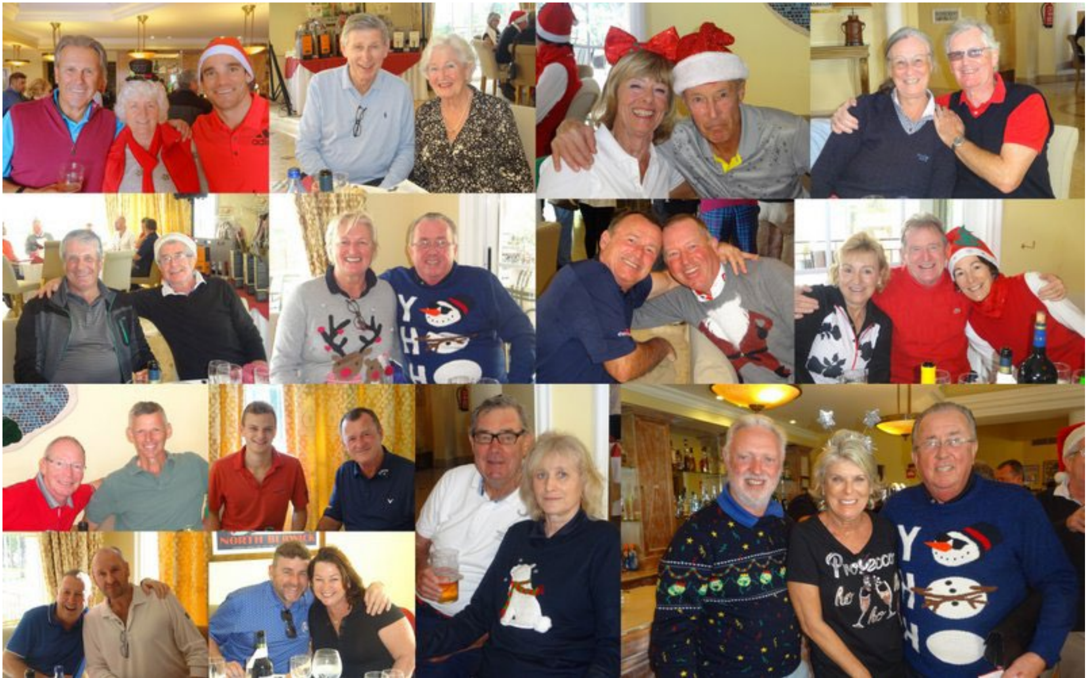
Christmas Turkey Flutter