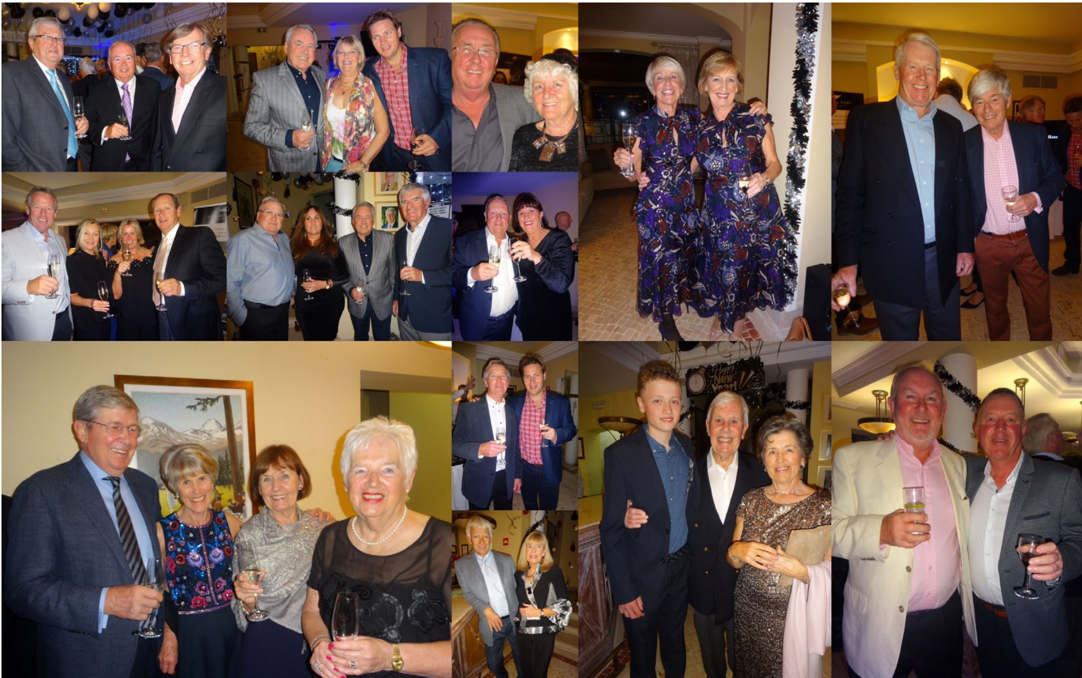
New Year's Eve Celebrations