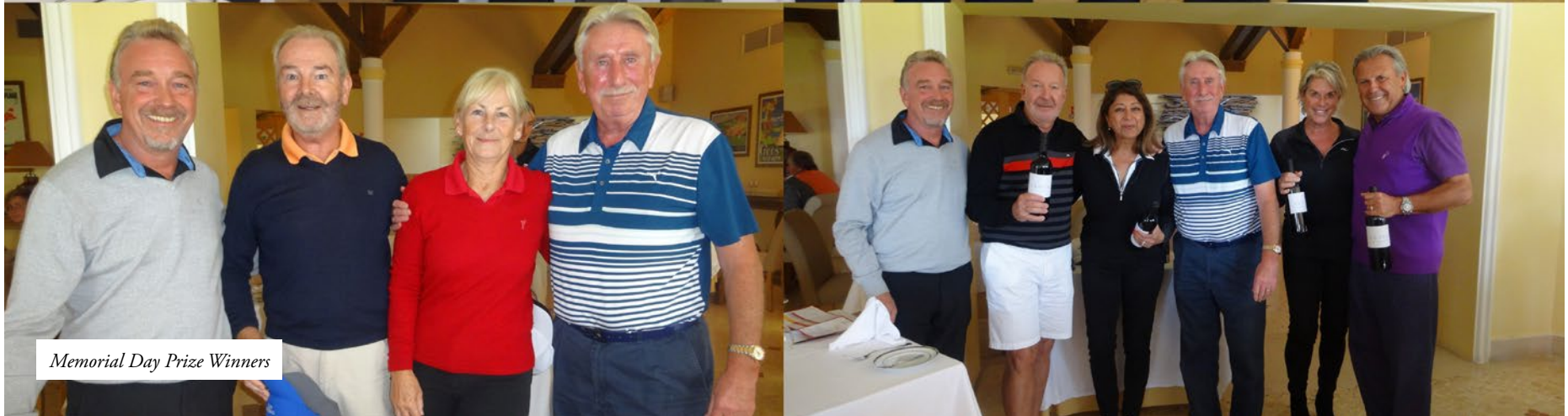
Memorial Day Prize Winners