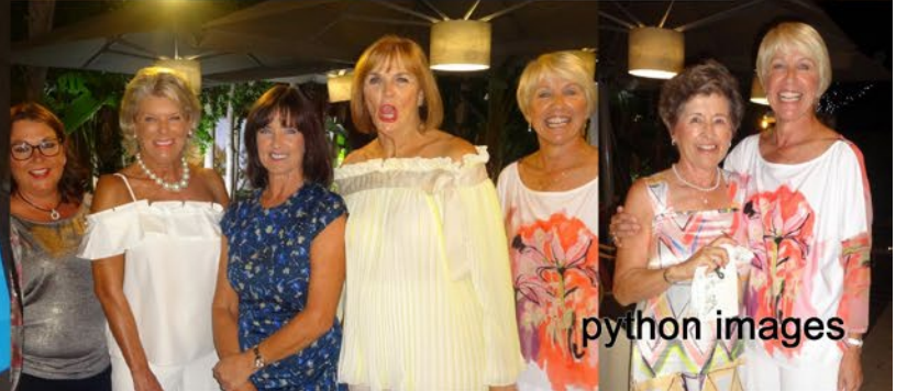
Ladies Annual Dinner Prize Winners