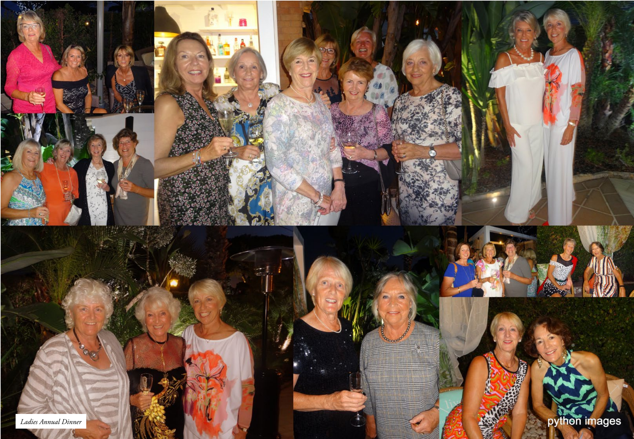
Ladies Annual Dinner