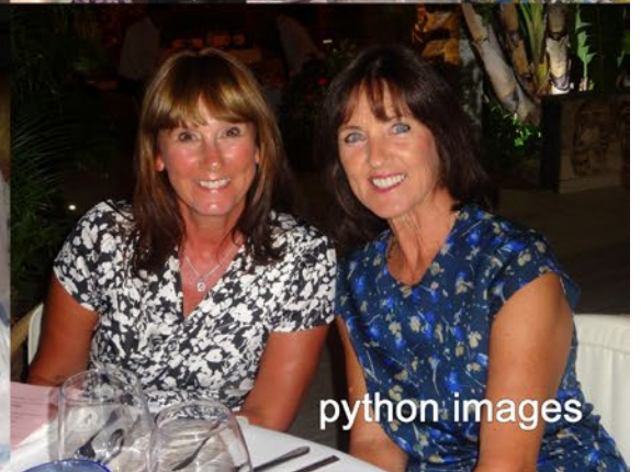
Ladies Annual Dinner