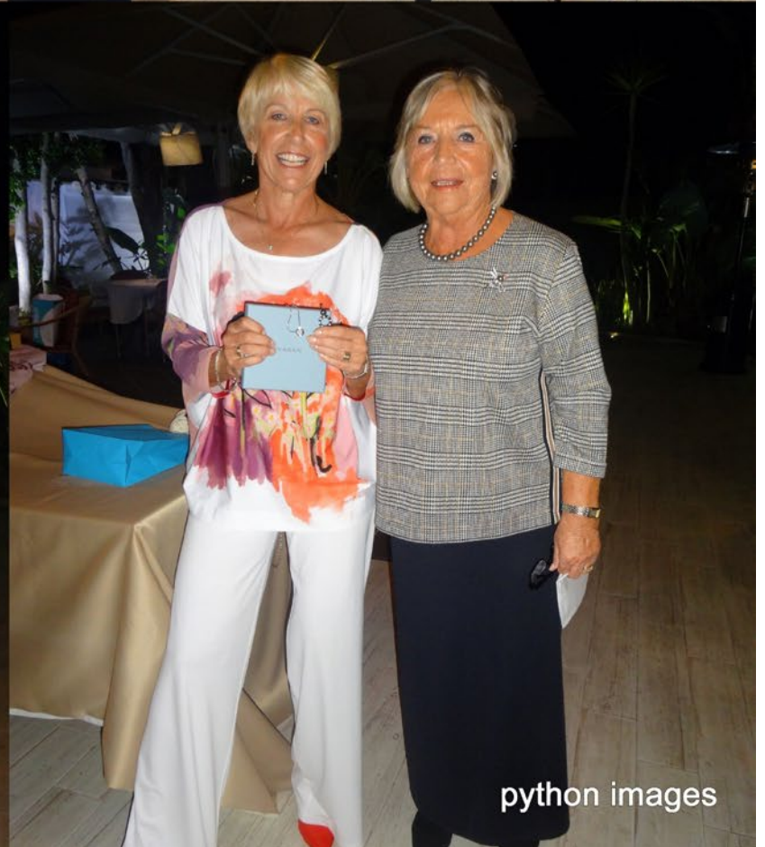
Ladies Annual Dinner Eclectic Winners