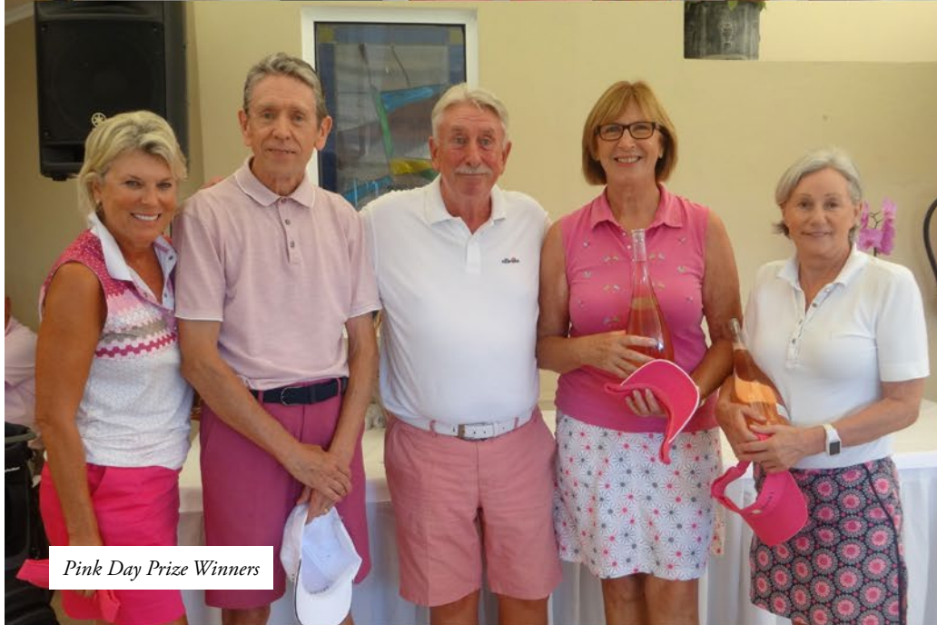
Pink Day Prize Winners