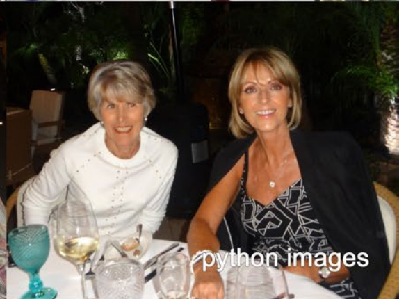
Ladies Annual Dinner