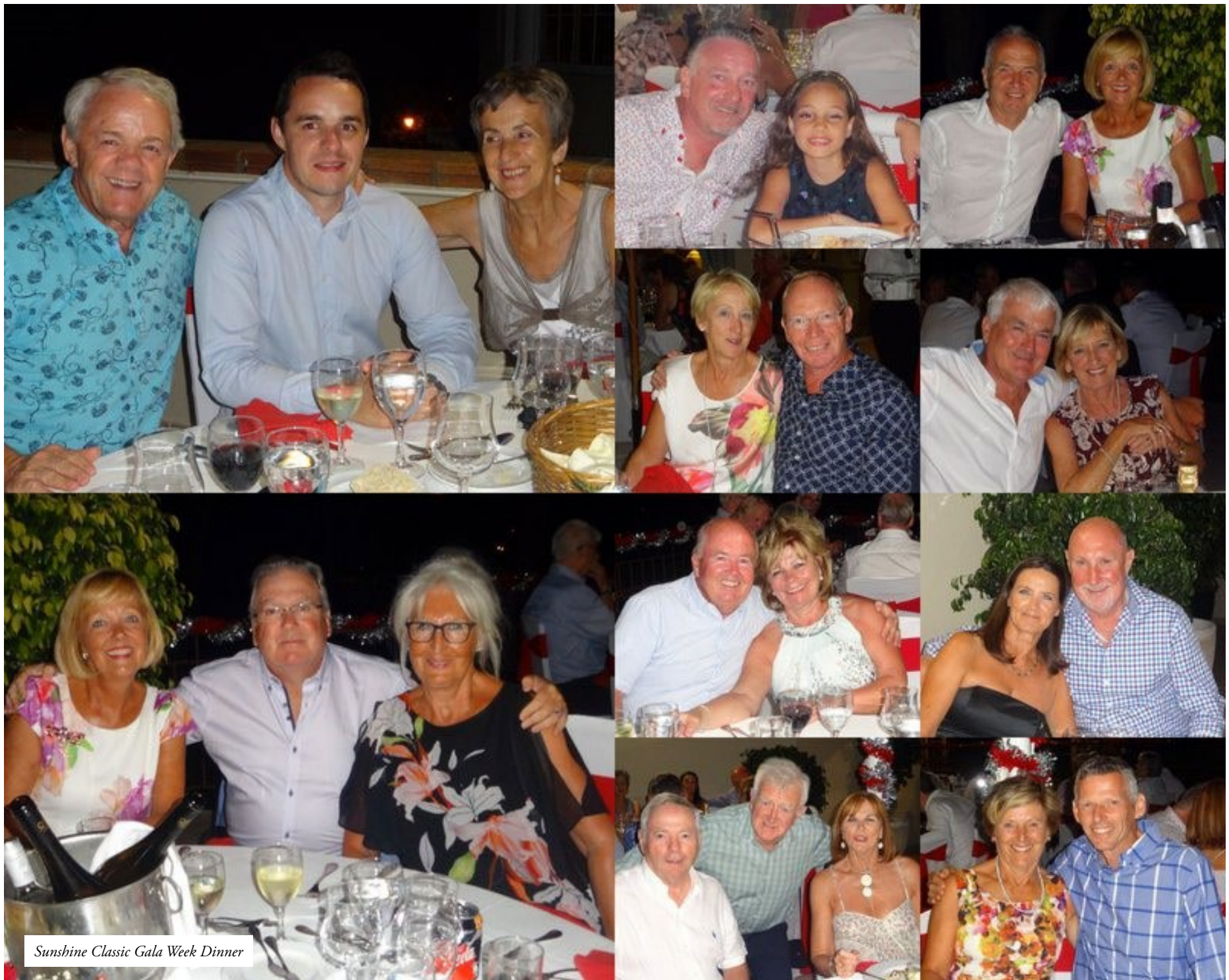
Sunshine Classic Gala Week Dinner