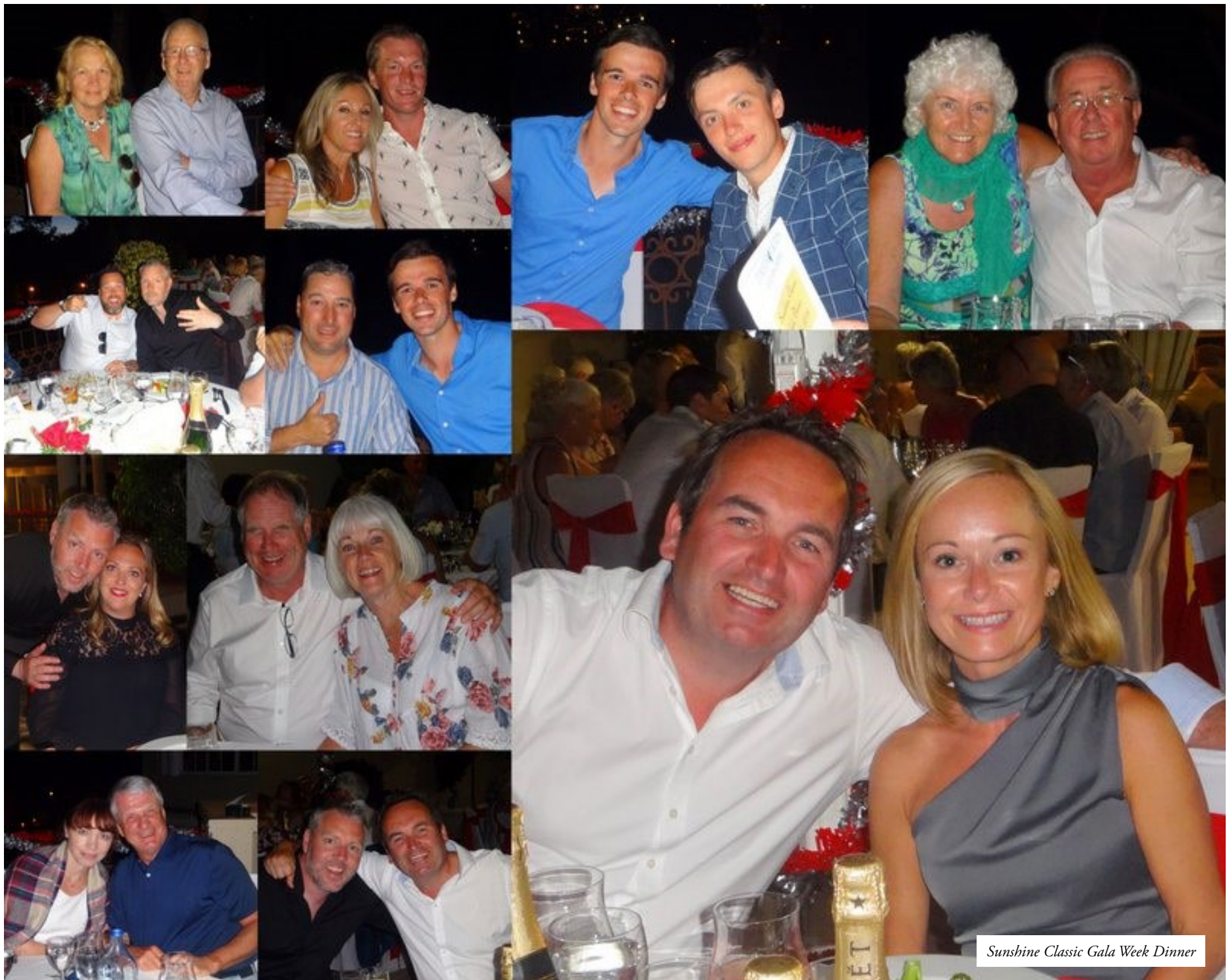
Sunshine Classic Gala Week Dinner