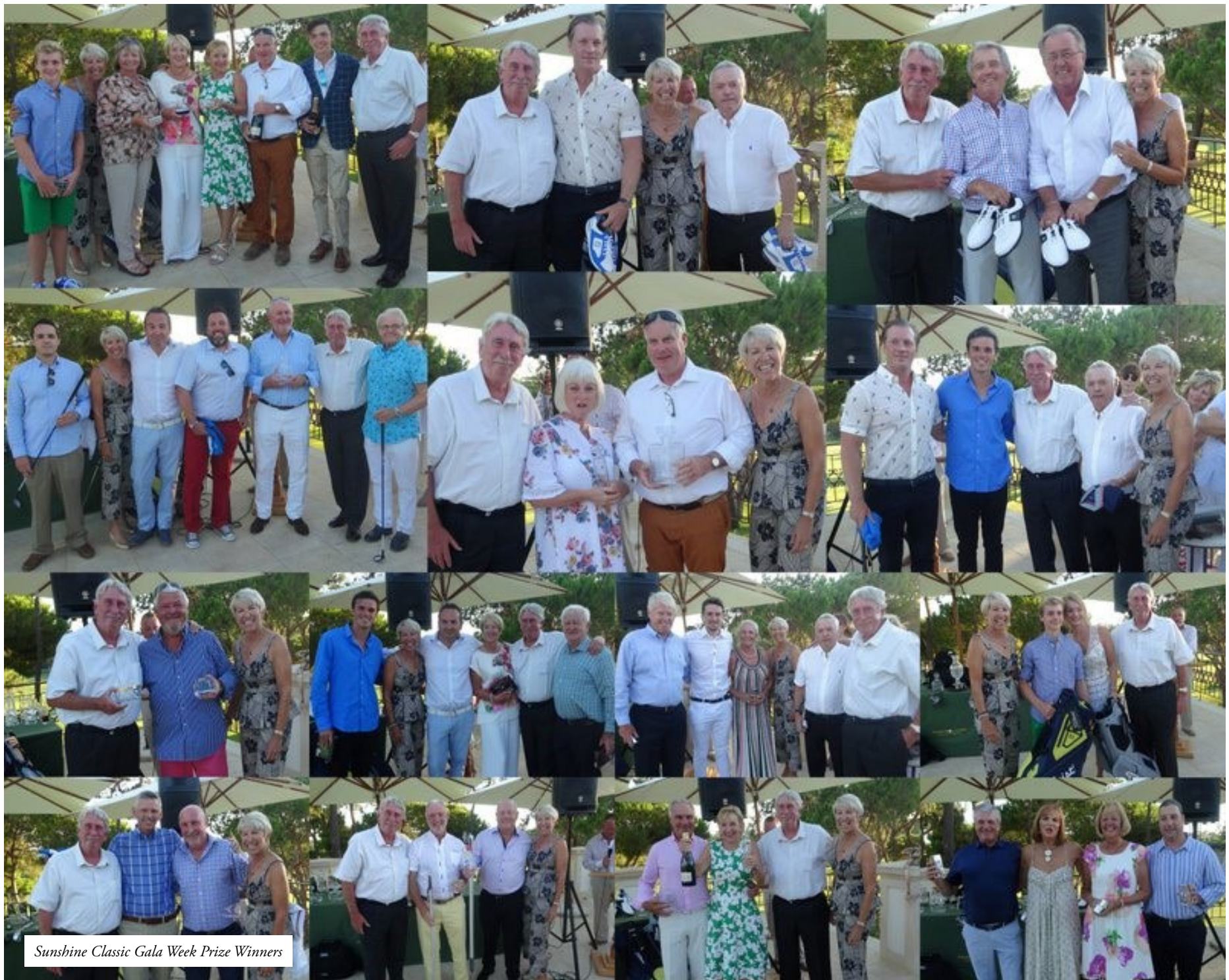
Sunshine Classic Gala Week Prize Winners