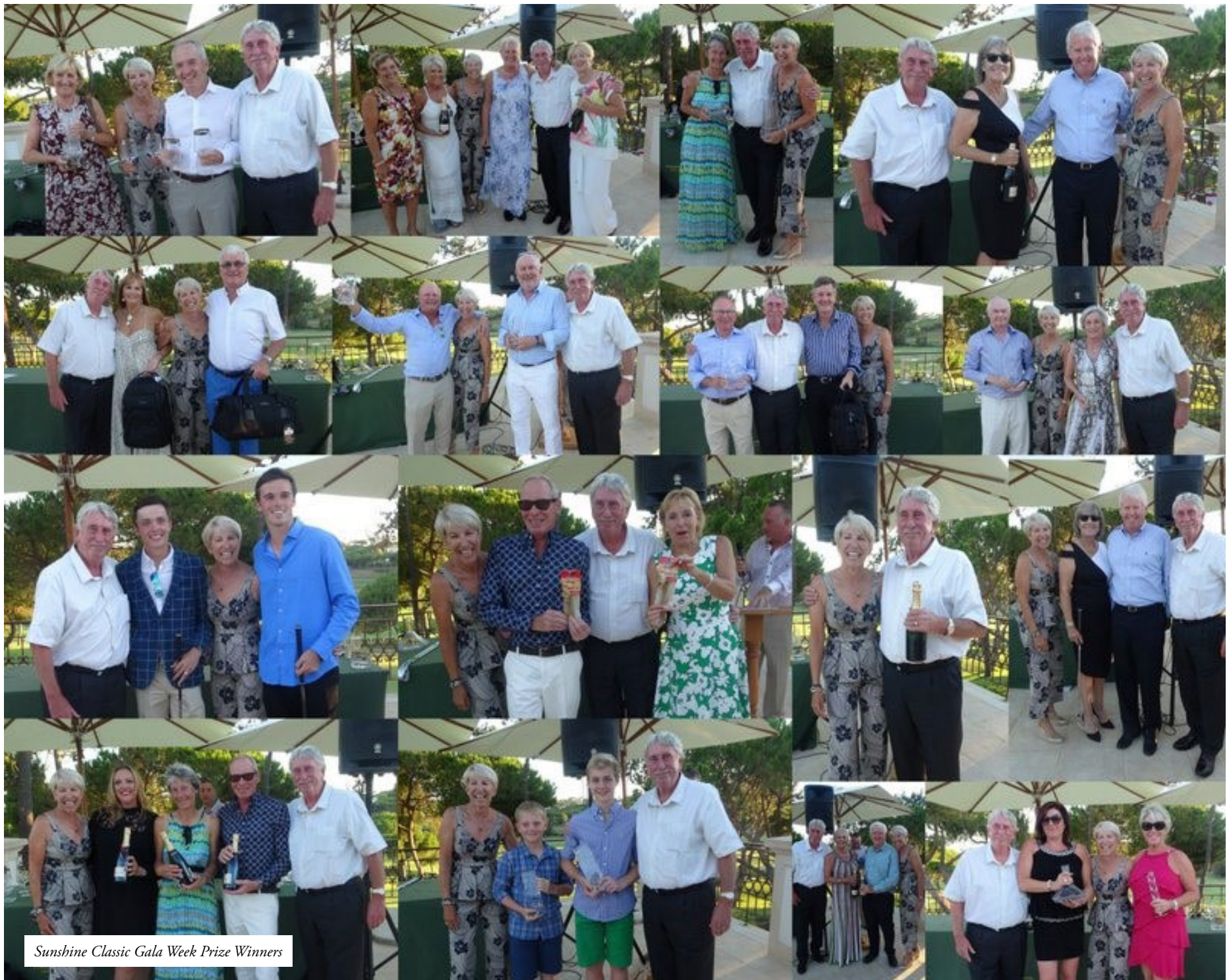
Sunshine Classic Gala Week Prize Winners