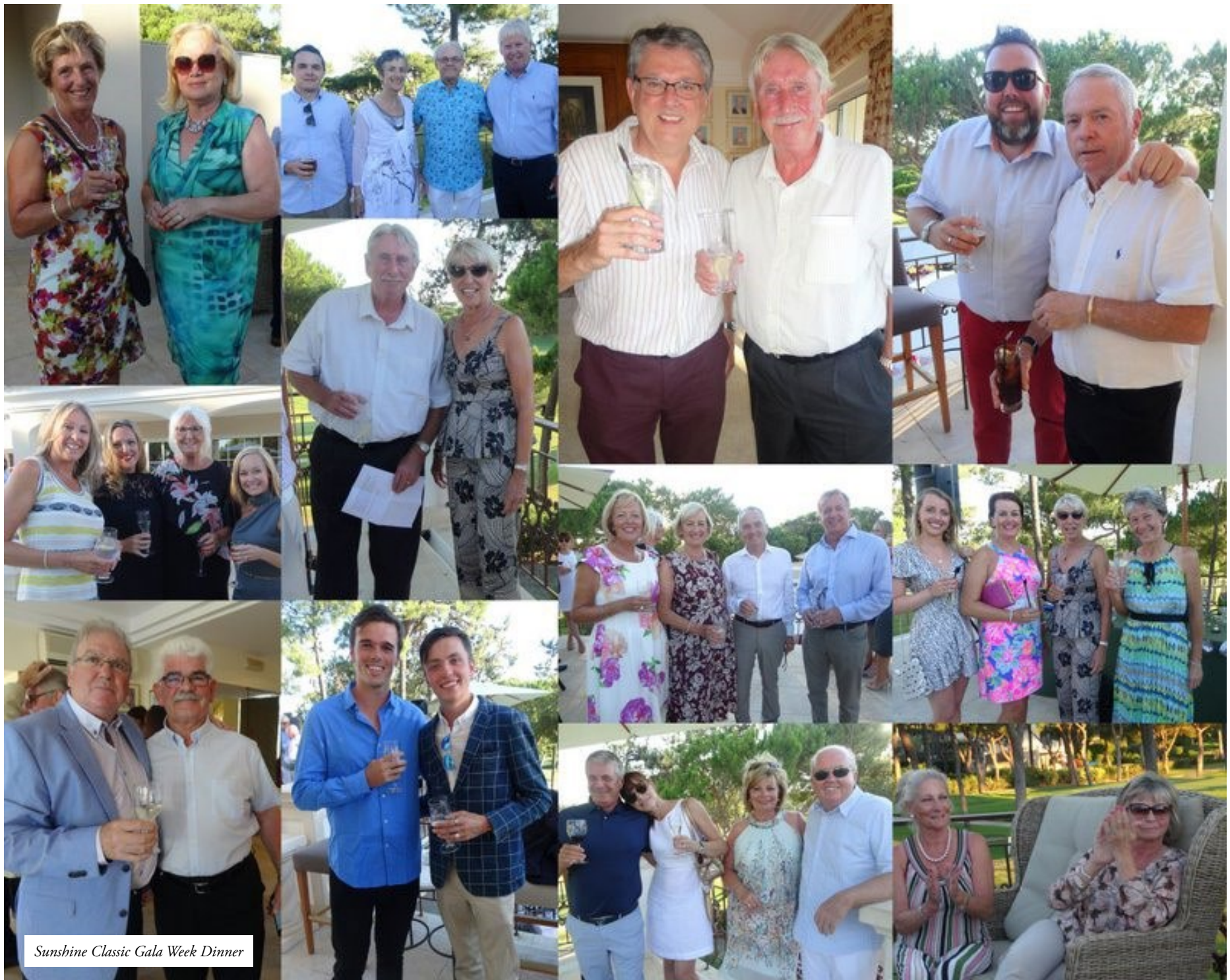
Sunshine Classic Gala Week Dinner