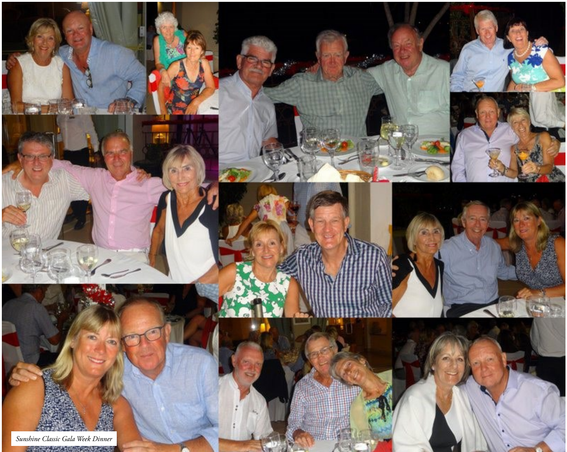
Sunshine Classic Gala Week Dinner