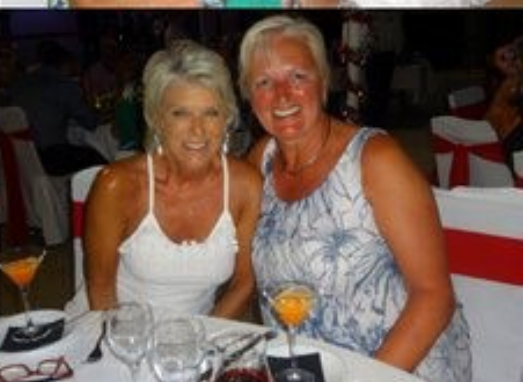
Sunshine Classic Gala Week Dinner