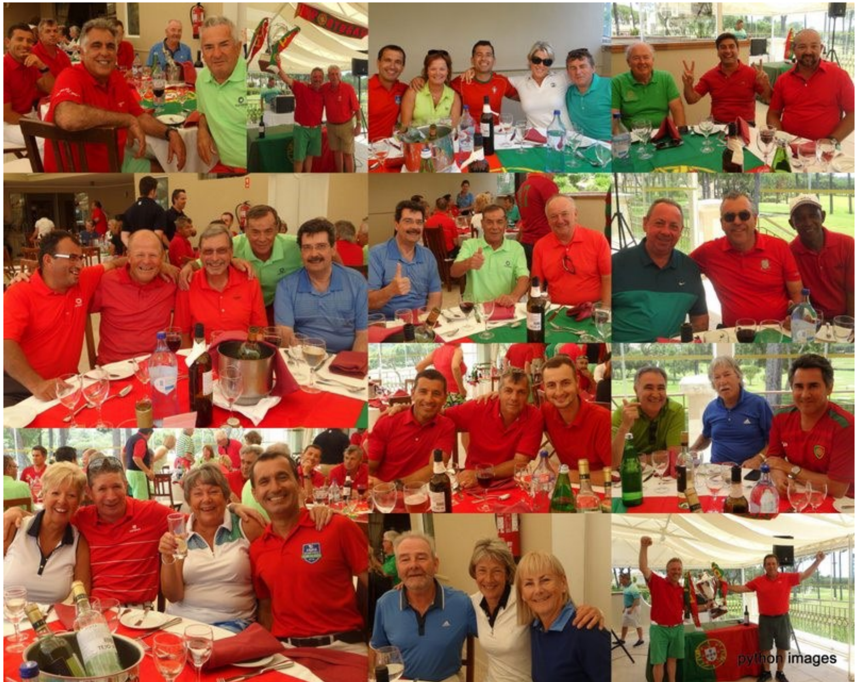
Portugal V Rest of the World Celebrations