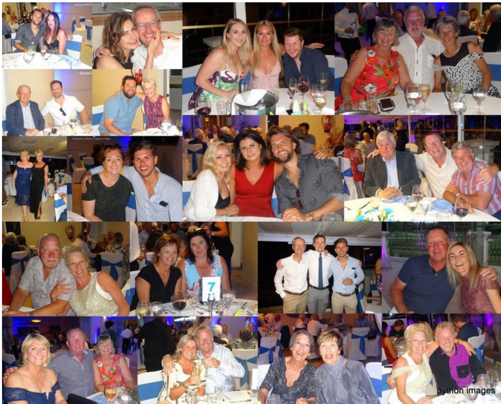
Captain's Day Dinner