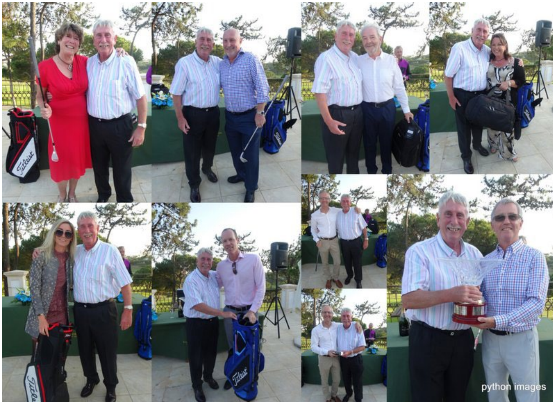
Captain's Day Prize Winners