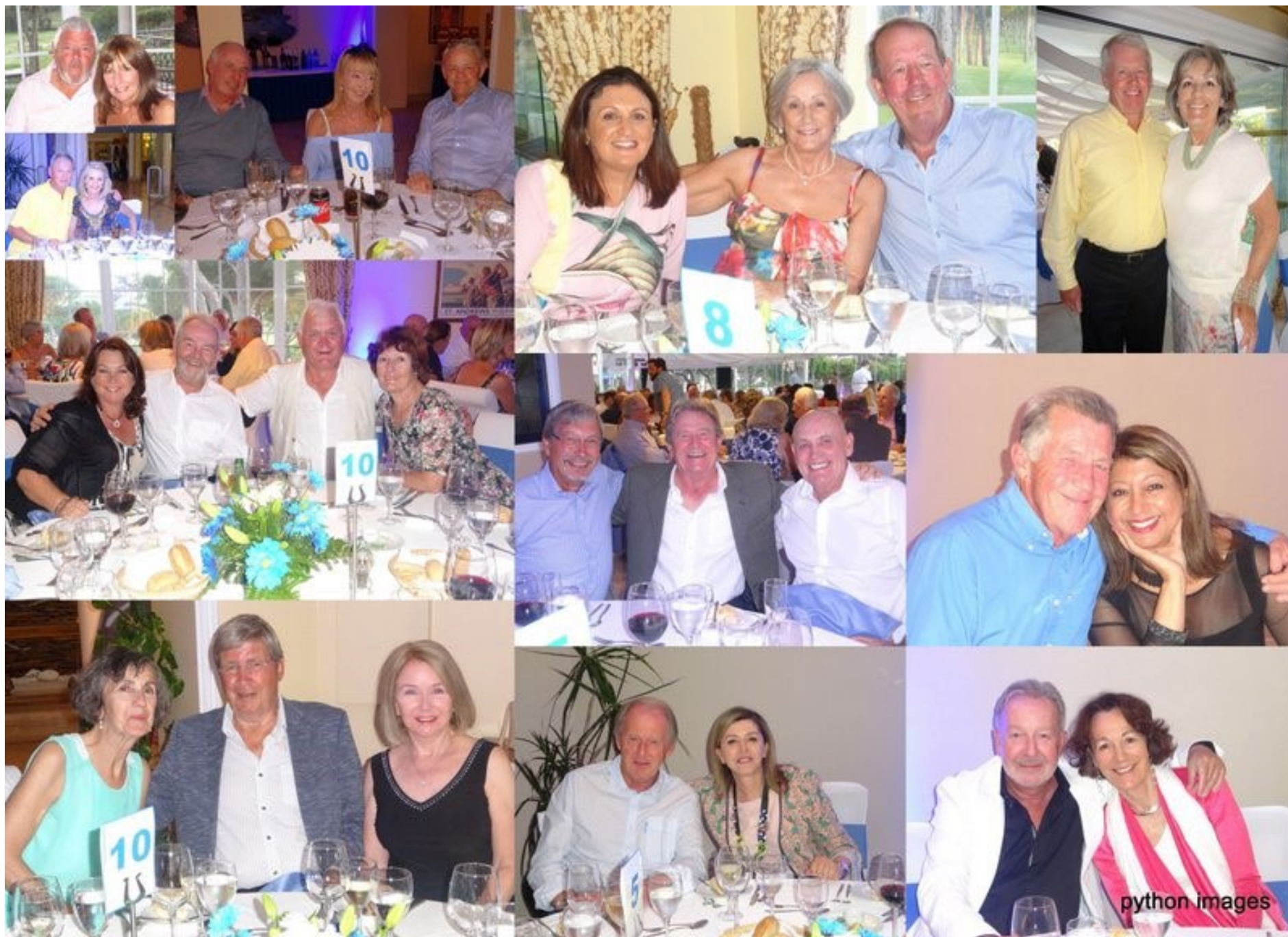
Captain's Day Dinner