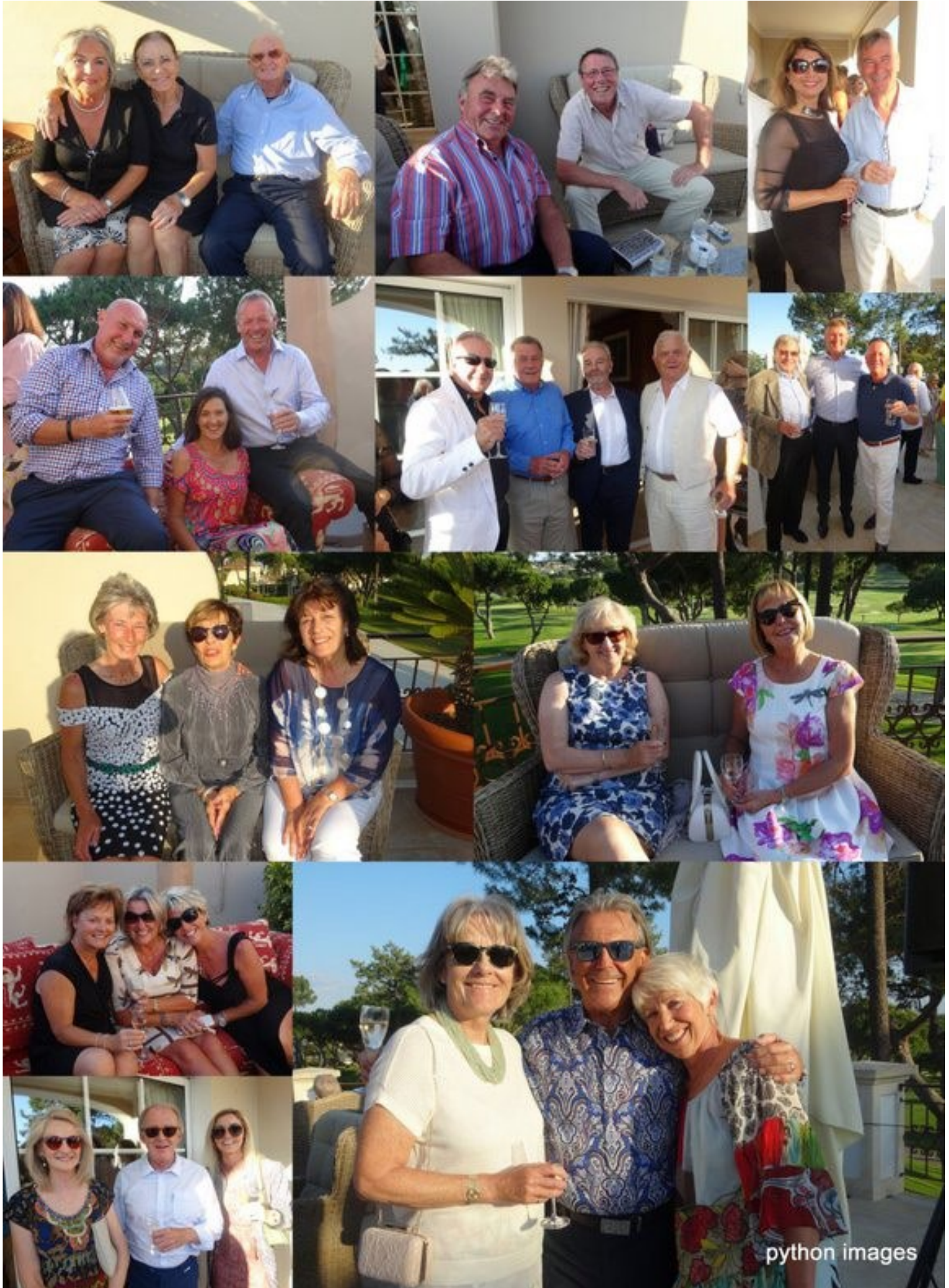
Captain's Day Dinner