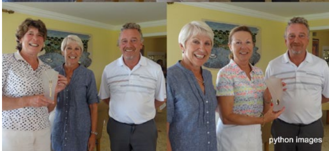
Past Lady Captains' Prize winners