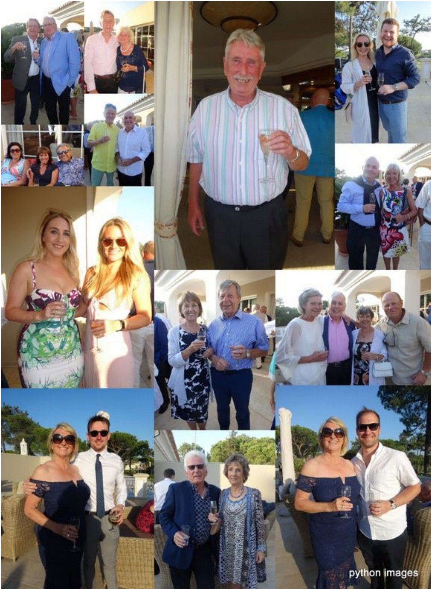
Captain's Day Dinner