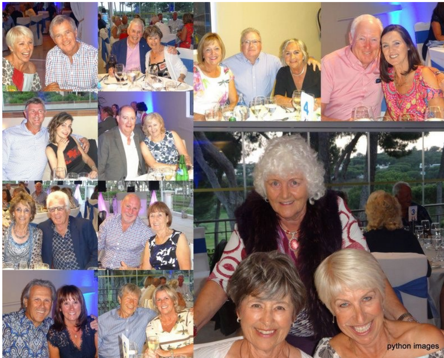
Captain's Day Dinner