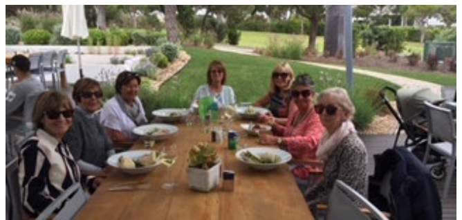
Ladies having lunch at Pure