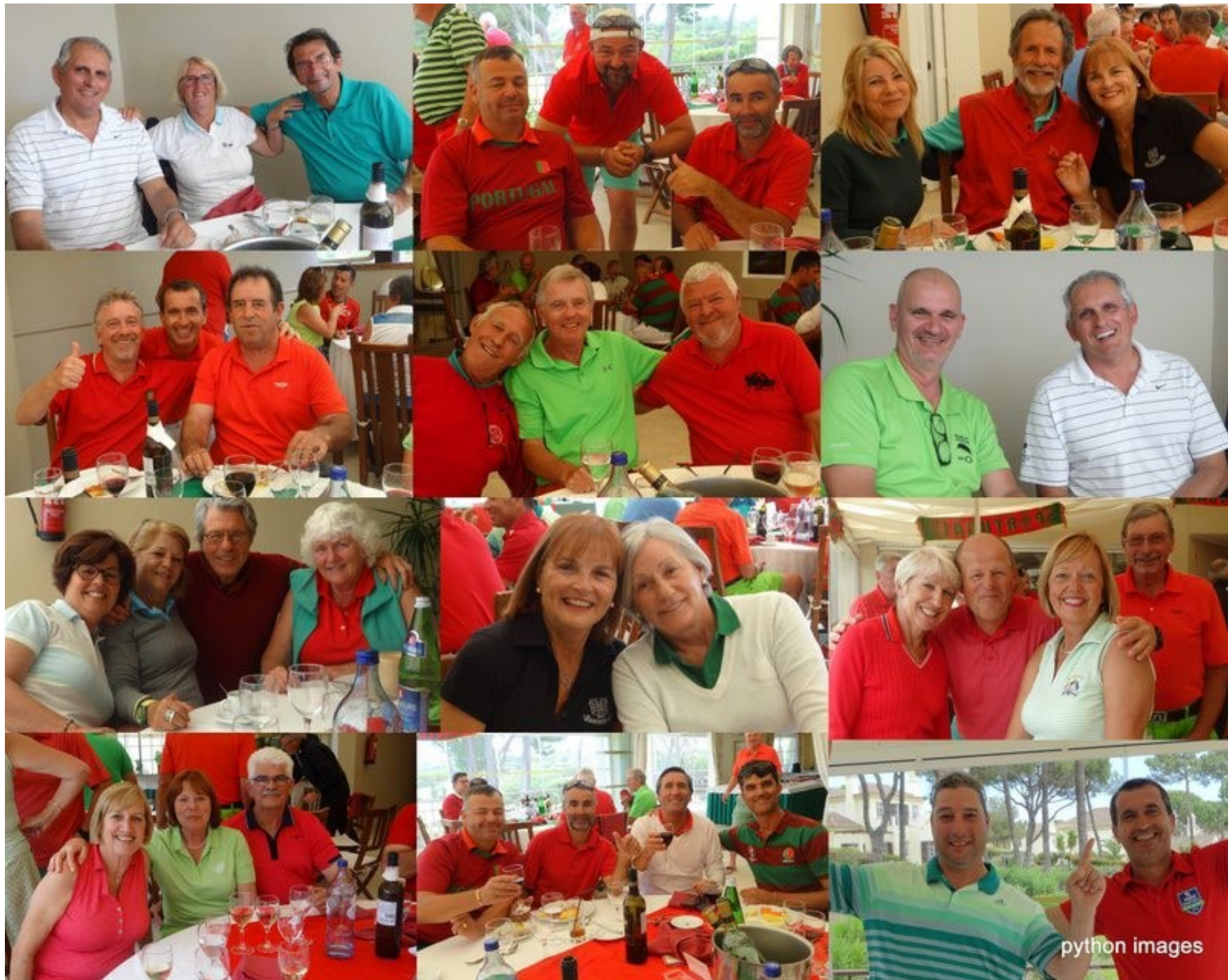
Portugal V Rest of the World Celebrations