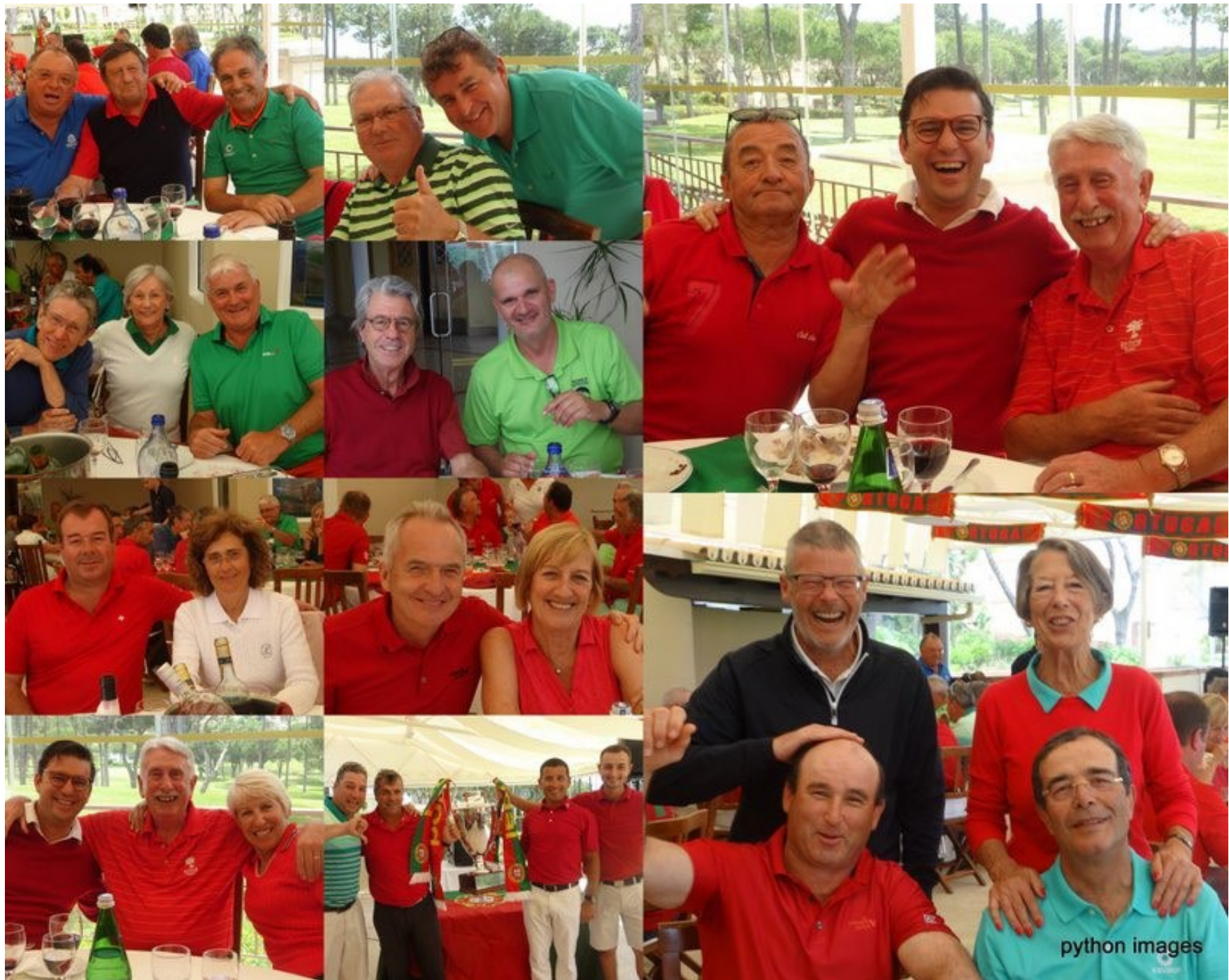
Portugal V Rest of the World Celebrations