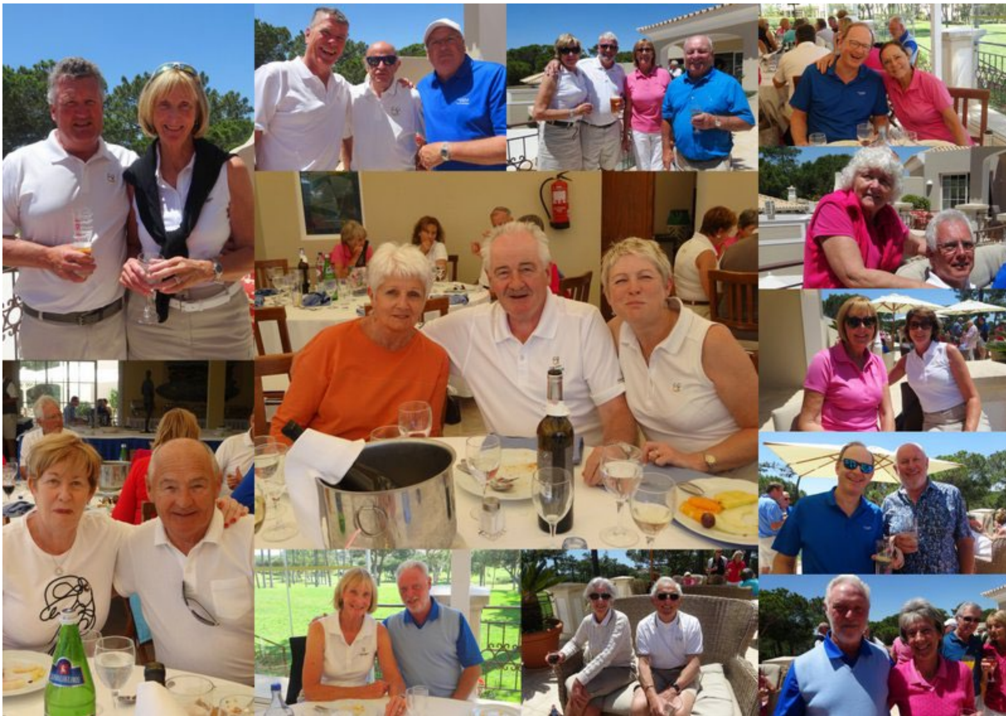
The Ben Hogan Trophy Lunch