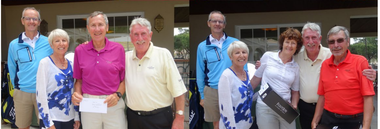
Mixed Pairs Matchplay