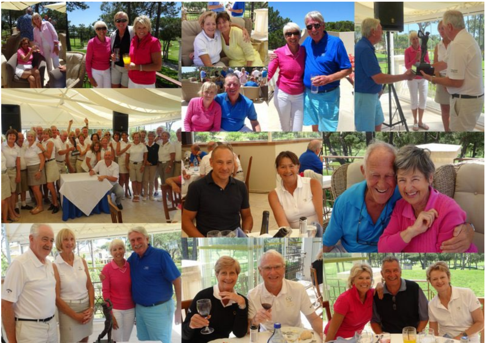
The Ben Hogan Trophy Lunch