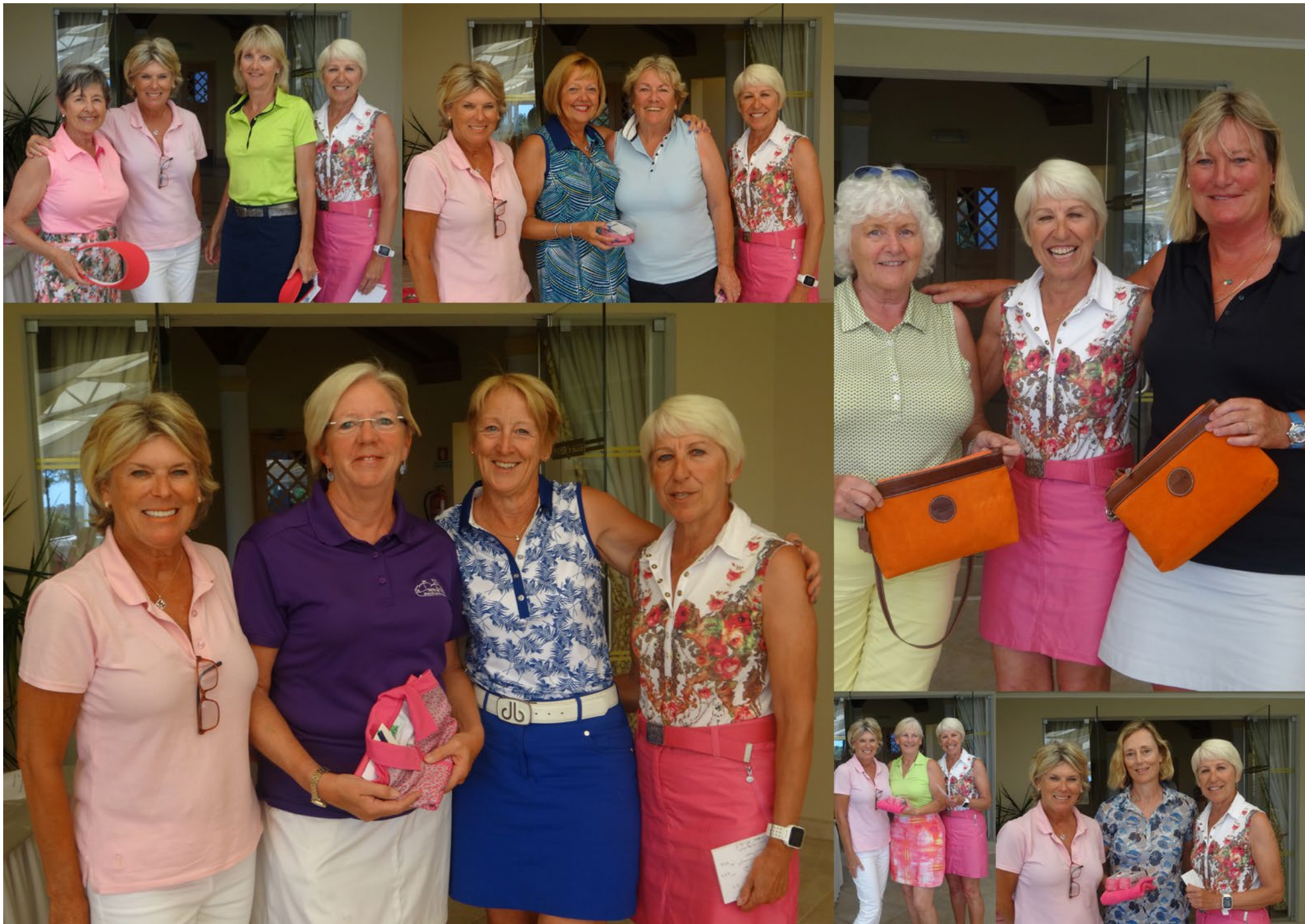
Ladies Invitation Day