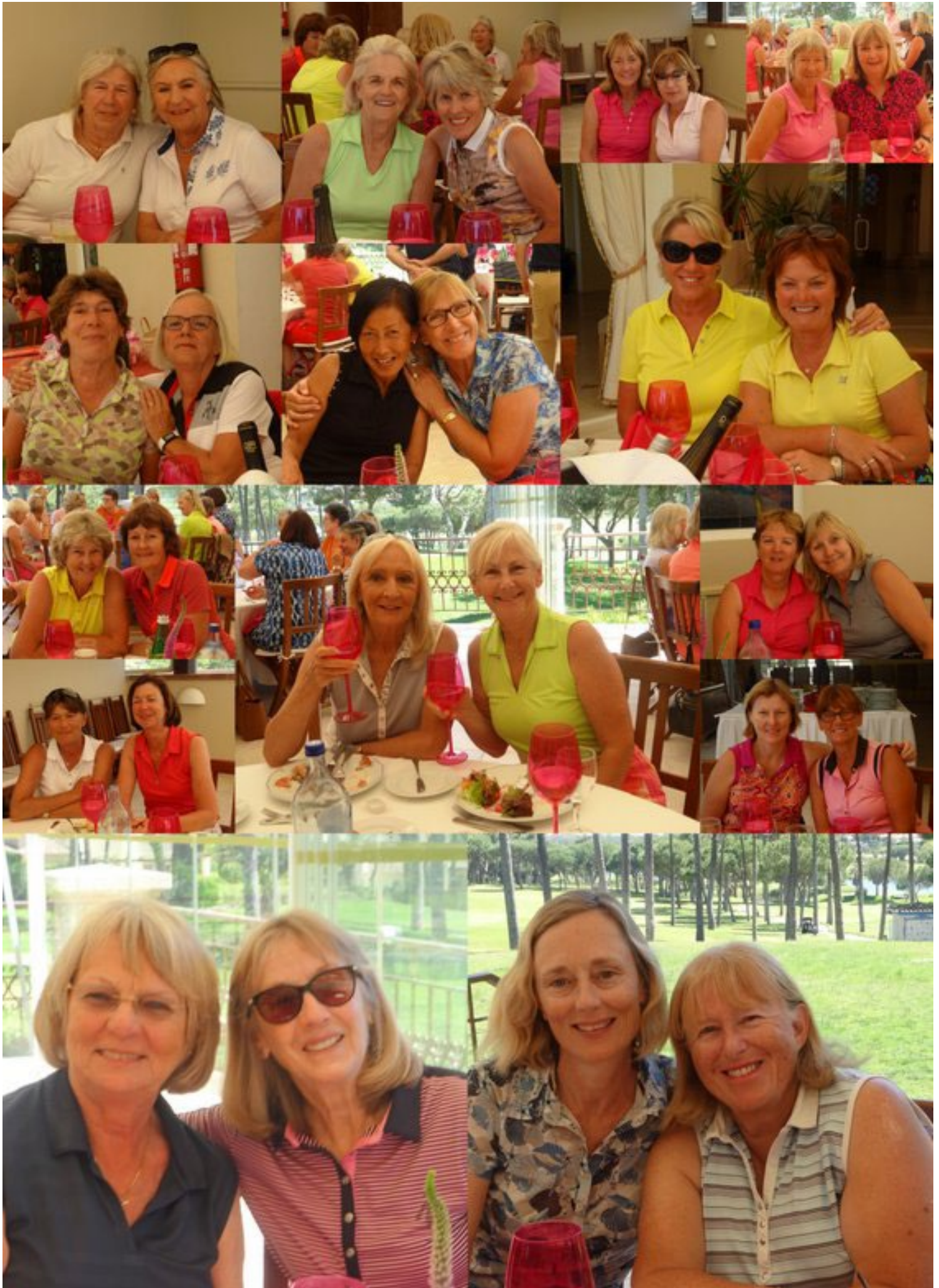
Ladies Invitation Day