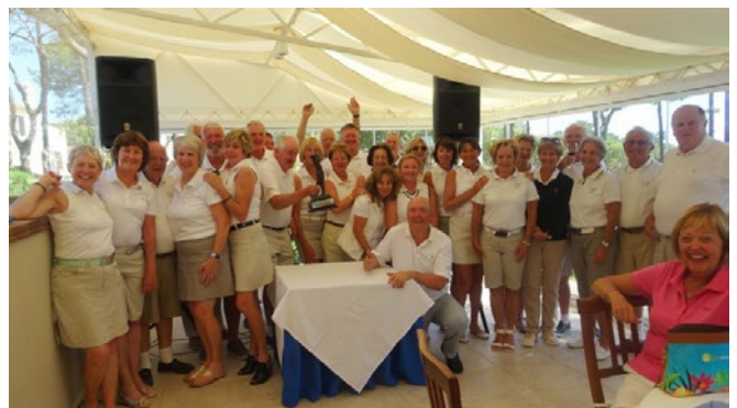
Quinta do Lago Team