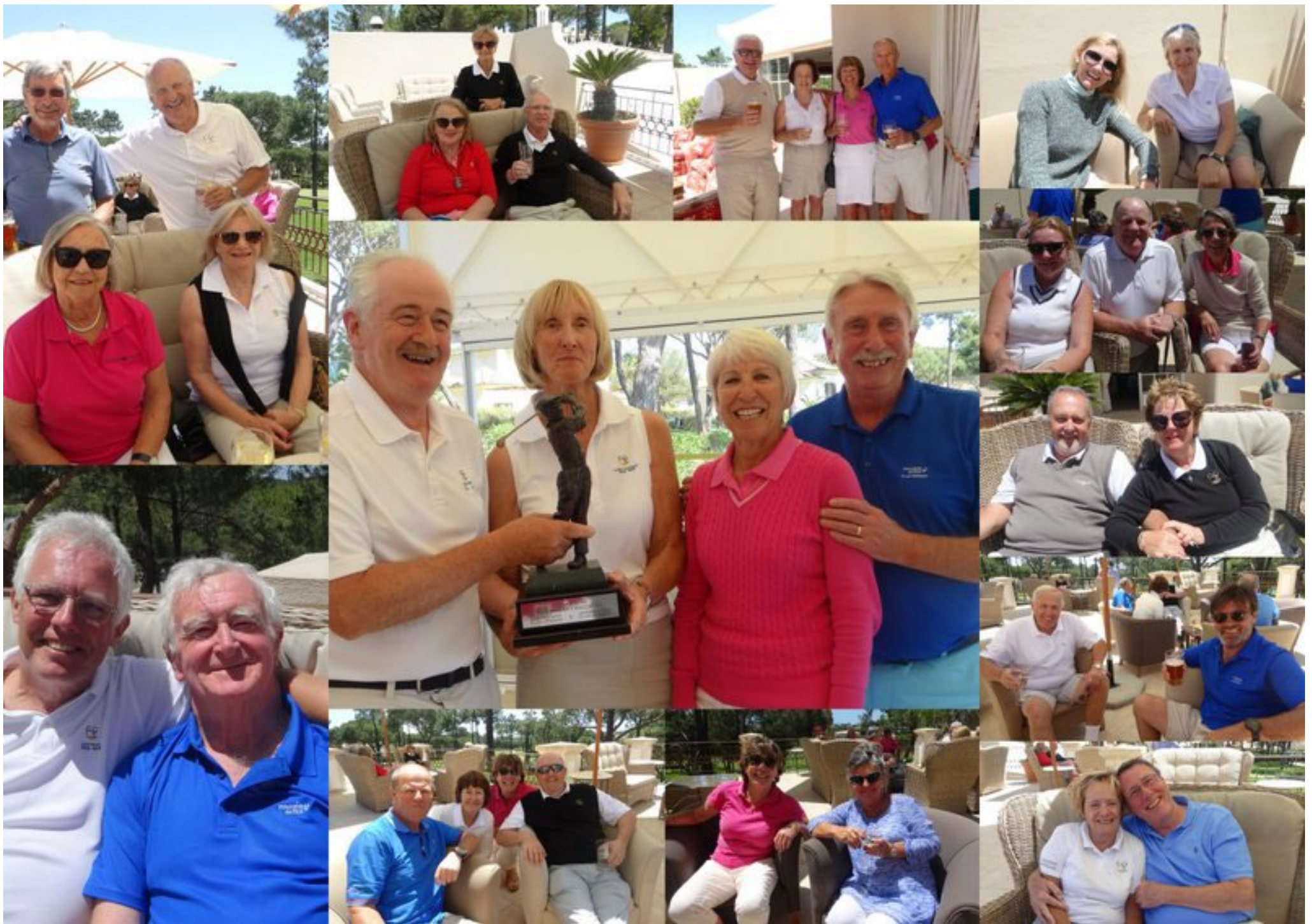
The Ben Hogan Trophy Lunch