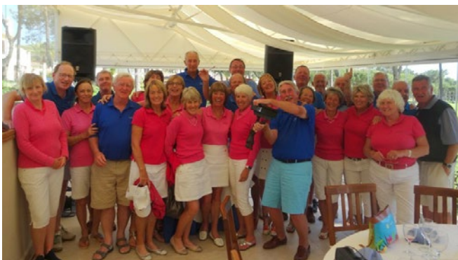
Pinheiros Altos Team