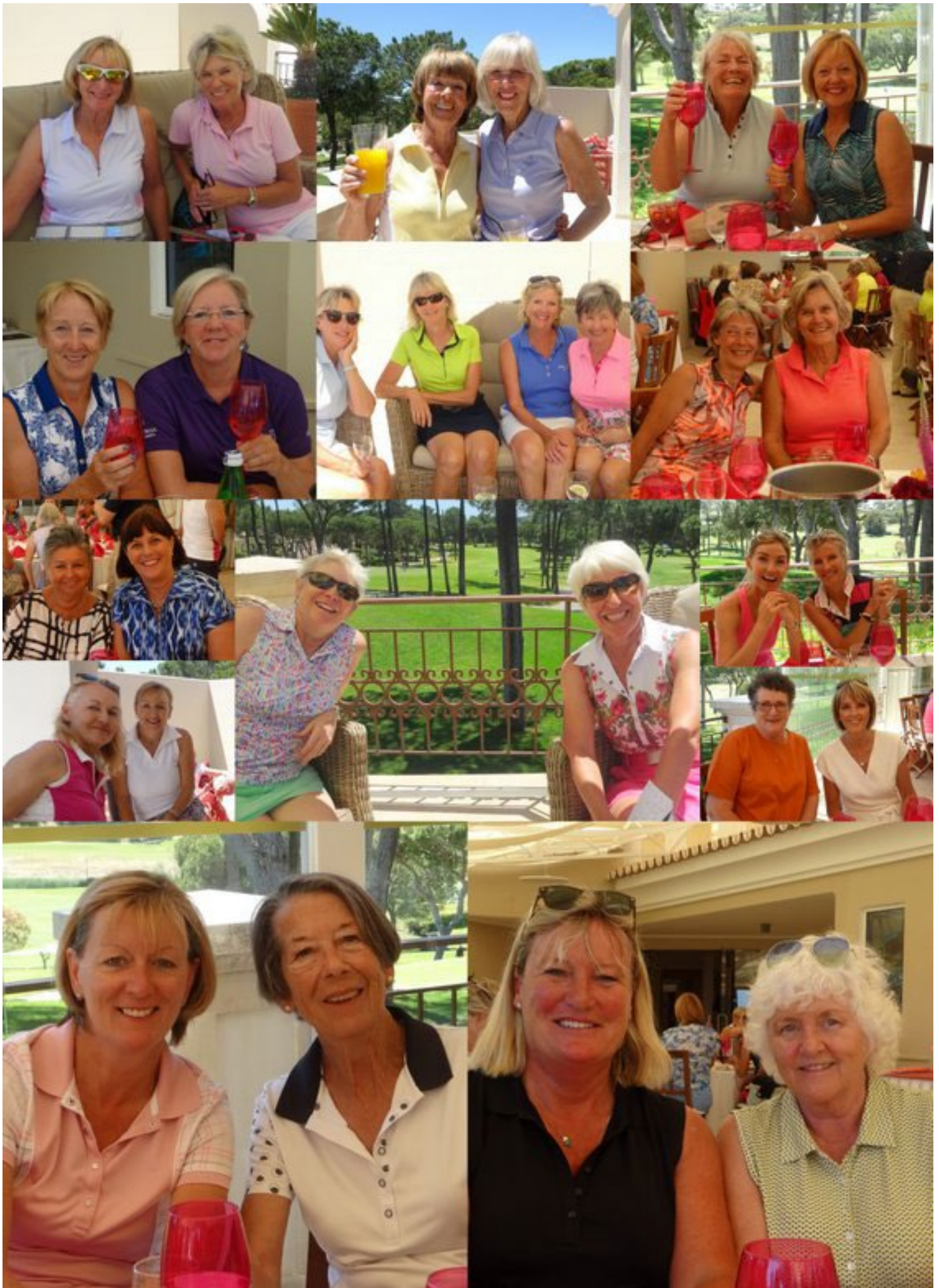
Ladies Invitation Day