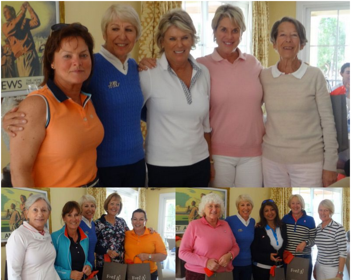
Lady Captain's Drive In 9 Hole competition winners