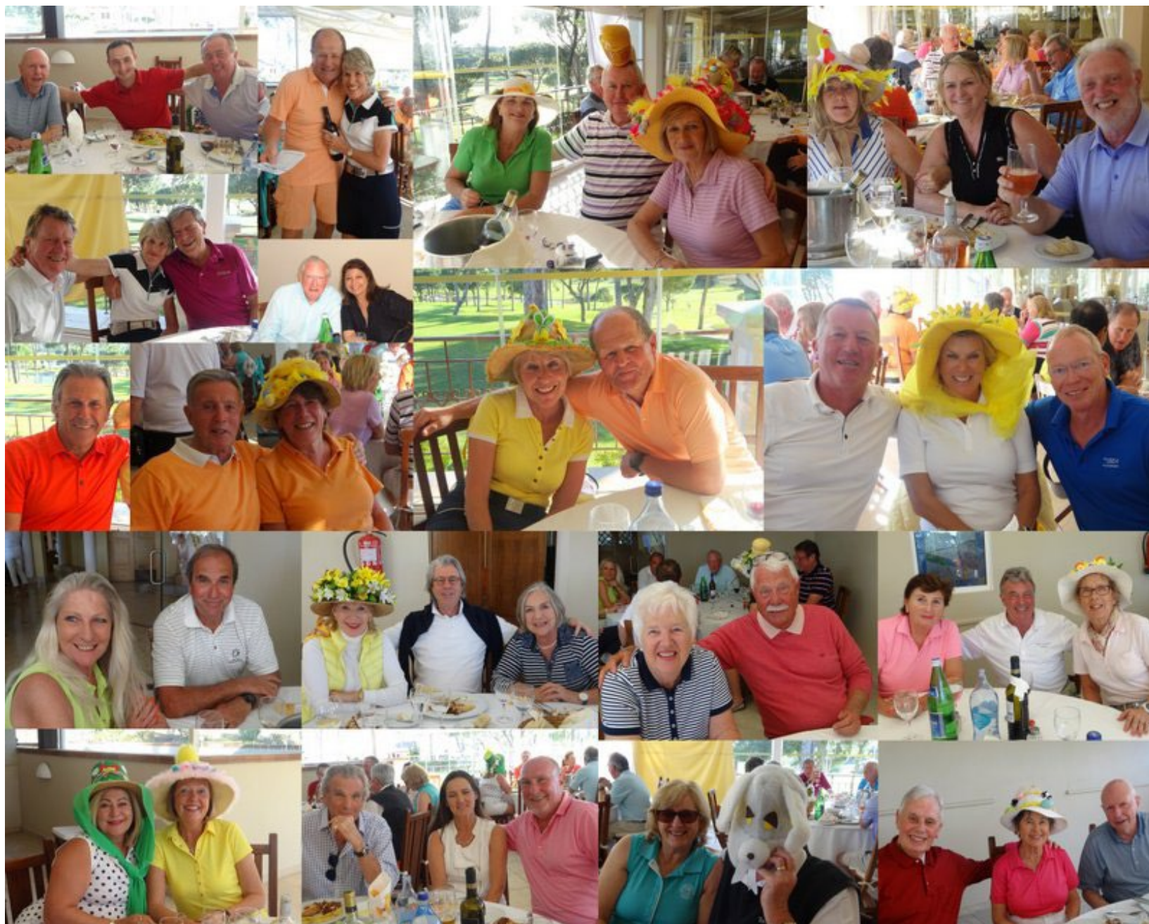
Ladies V Cloggies and Easter Hat Competition Lunch