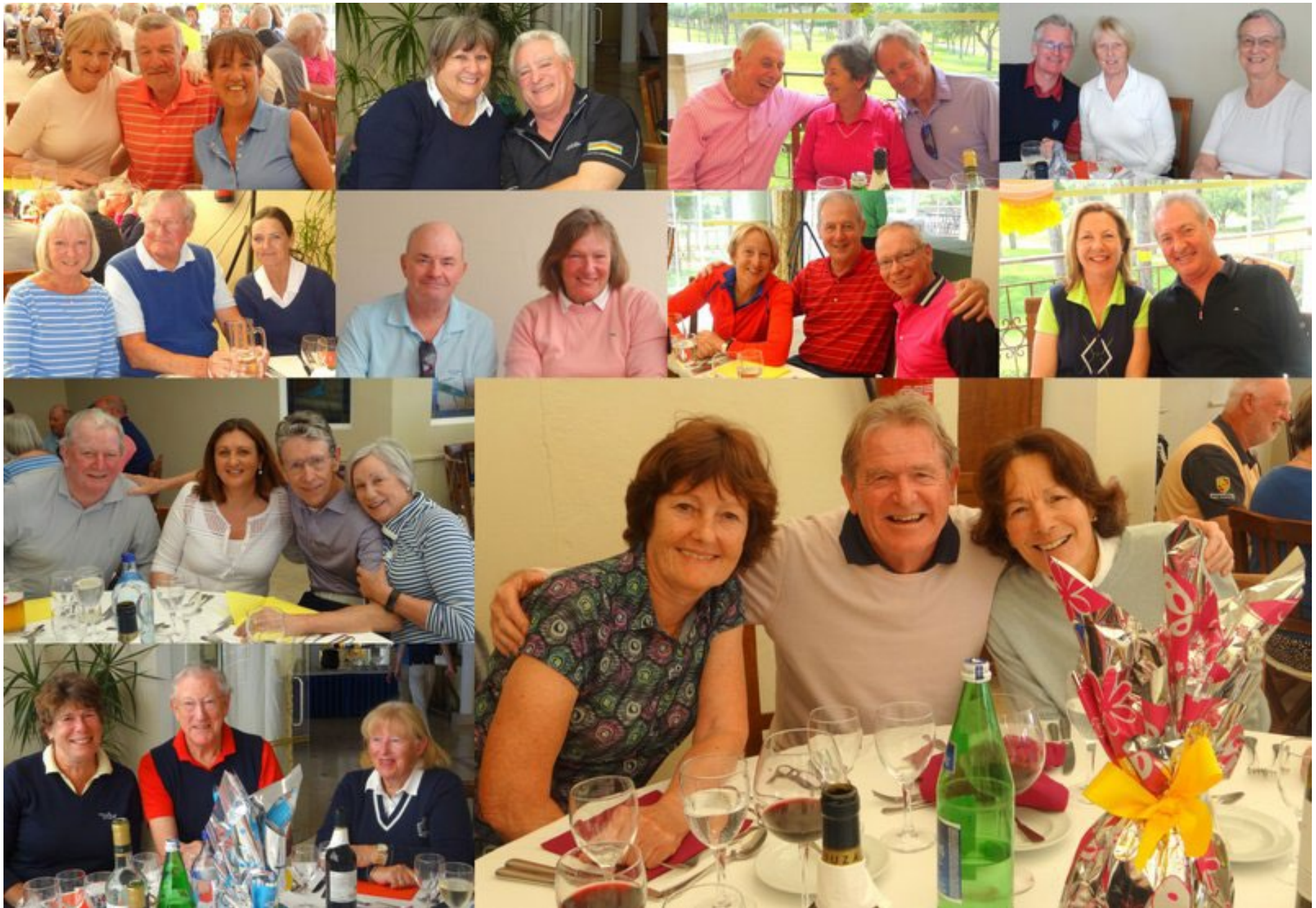
Easter Scramble Lunch