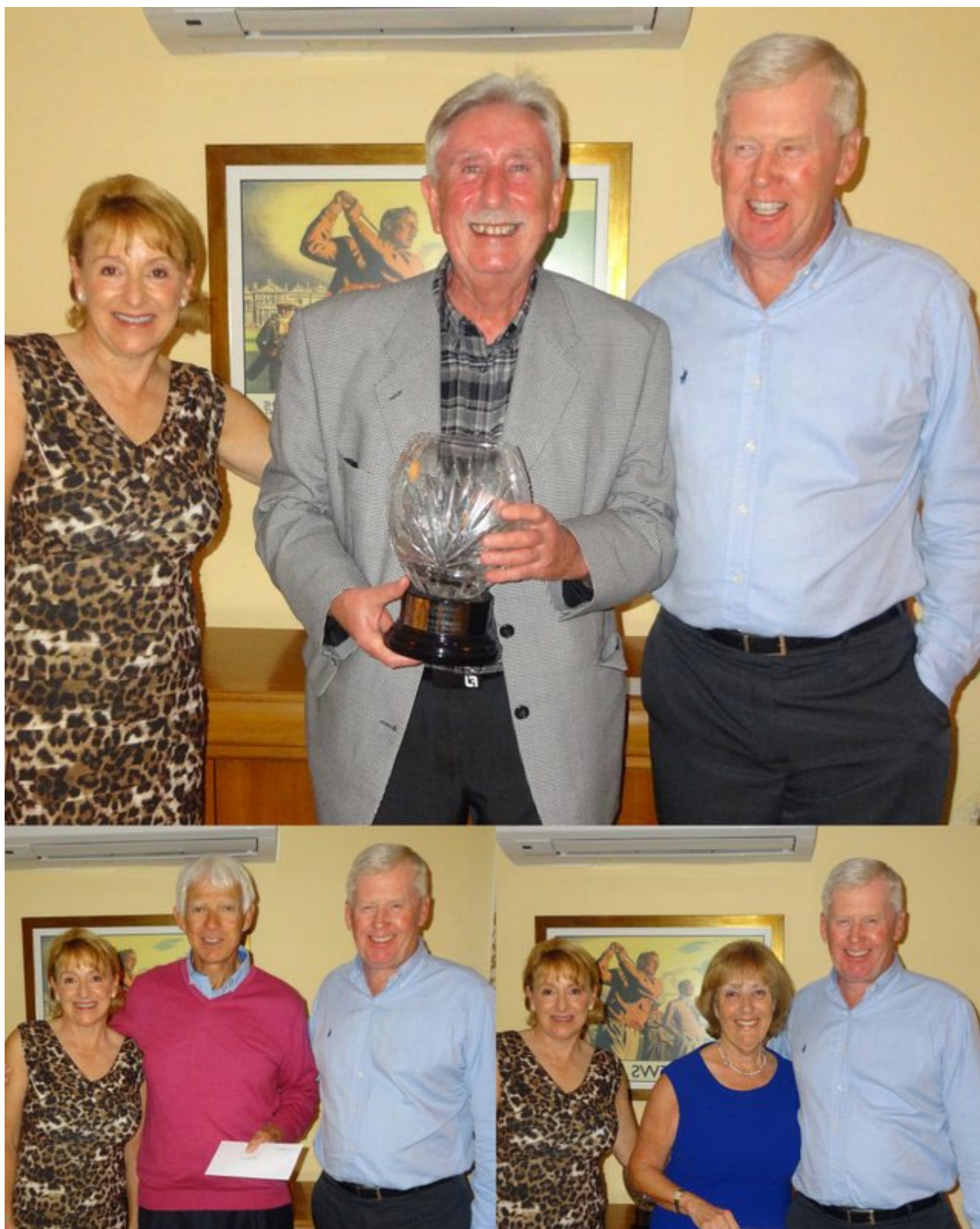
APPA Competition Prize Winners