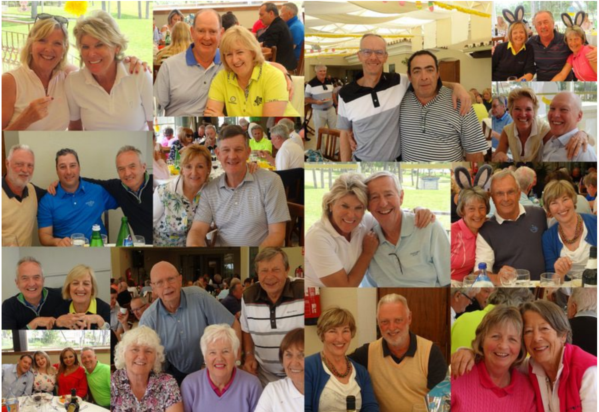
Easter Scramble Lunch