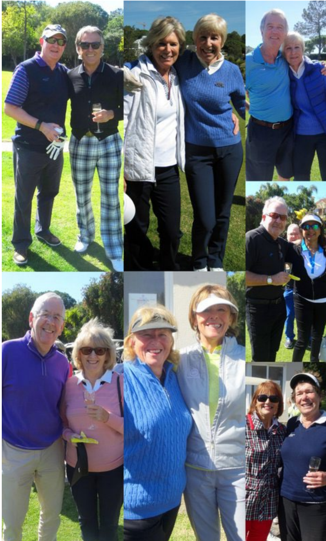
Lady Captain's Drive In