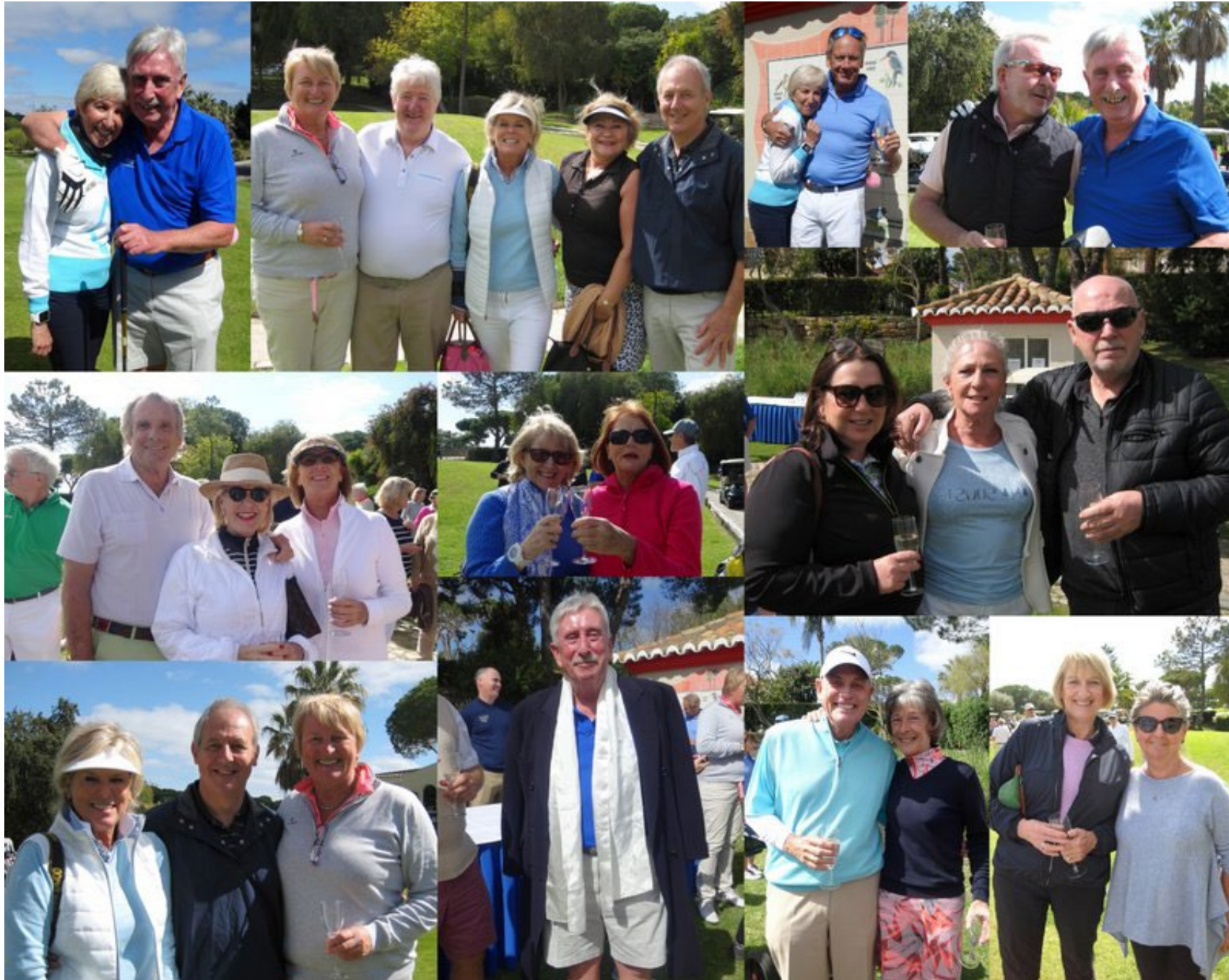
Captain's Drive In