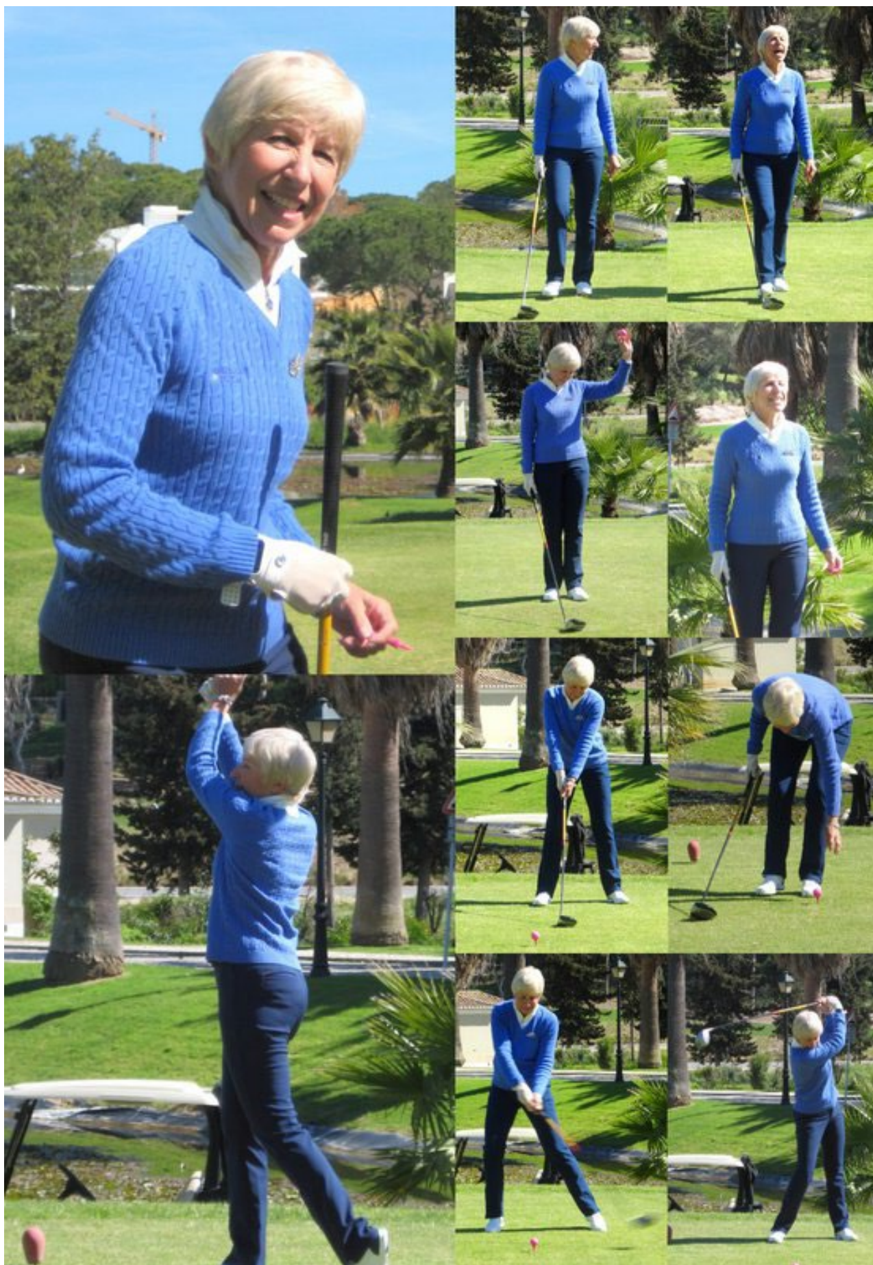
Lady Captain's Drive In