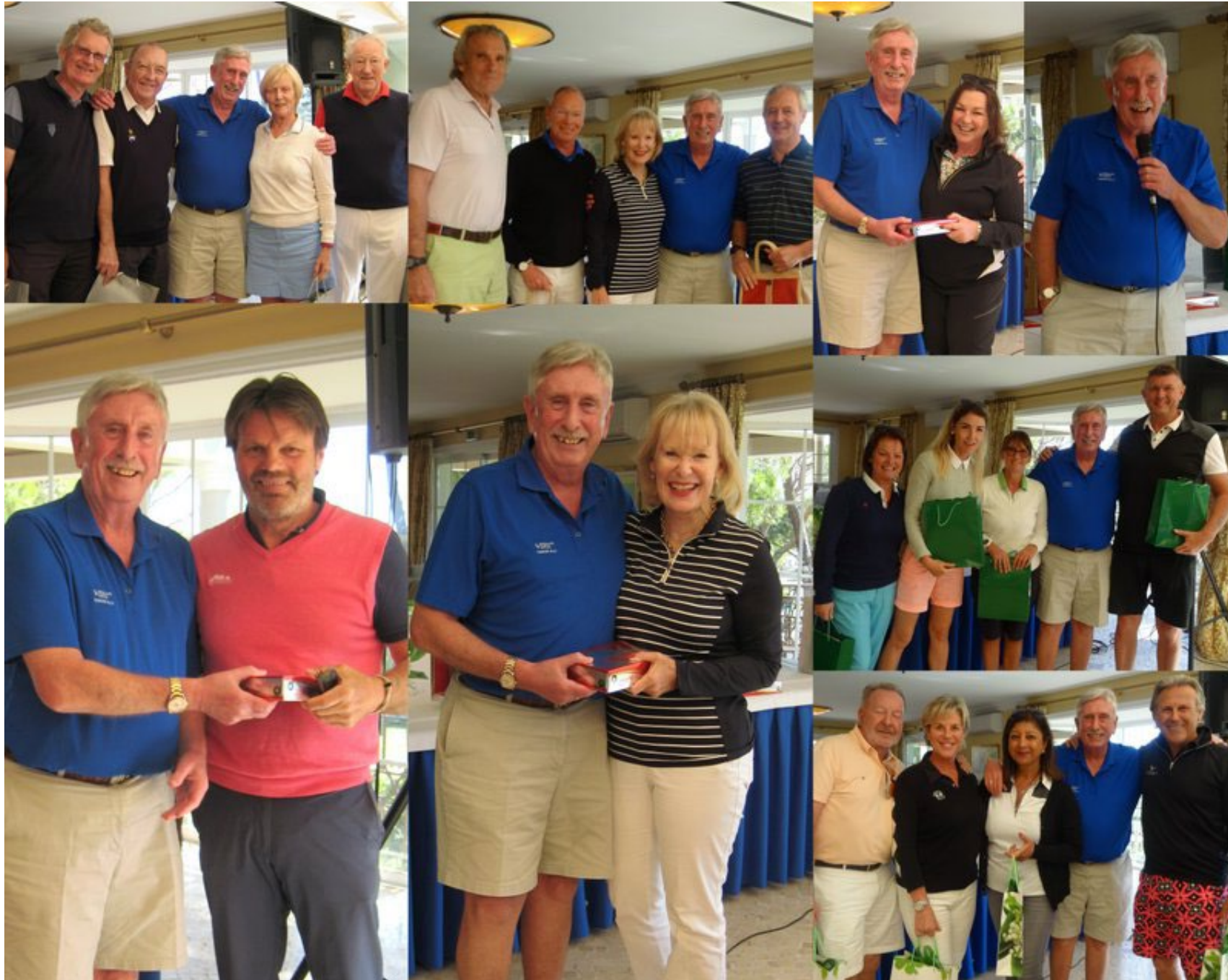
Captain's Drive In Prize Winner