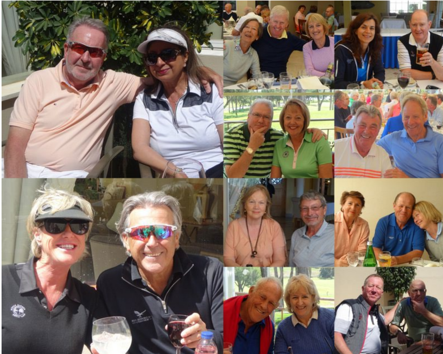
Captain's Drive In Lunch