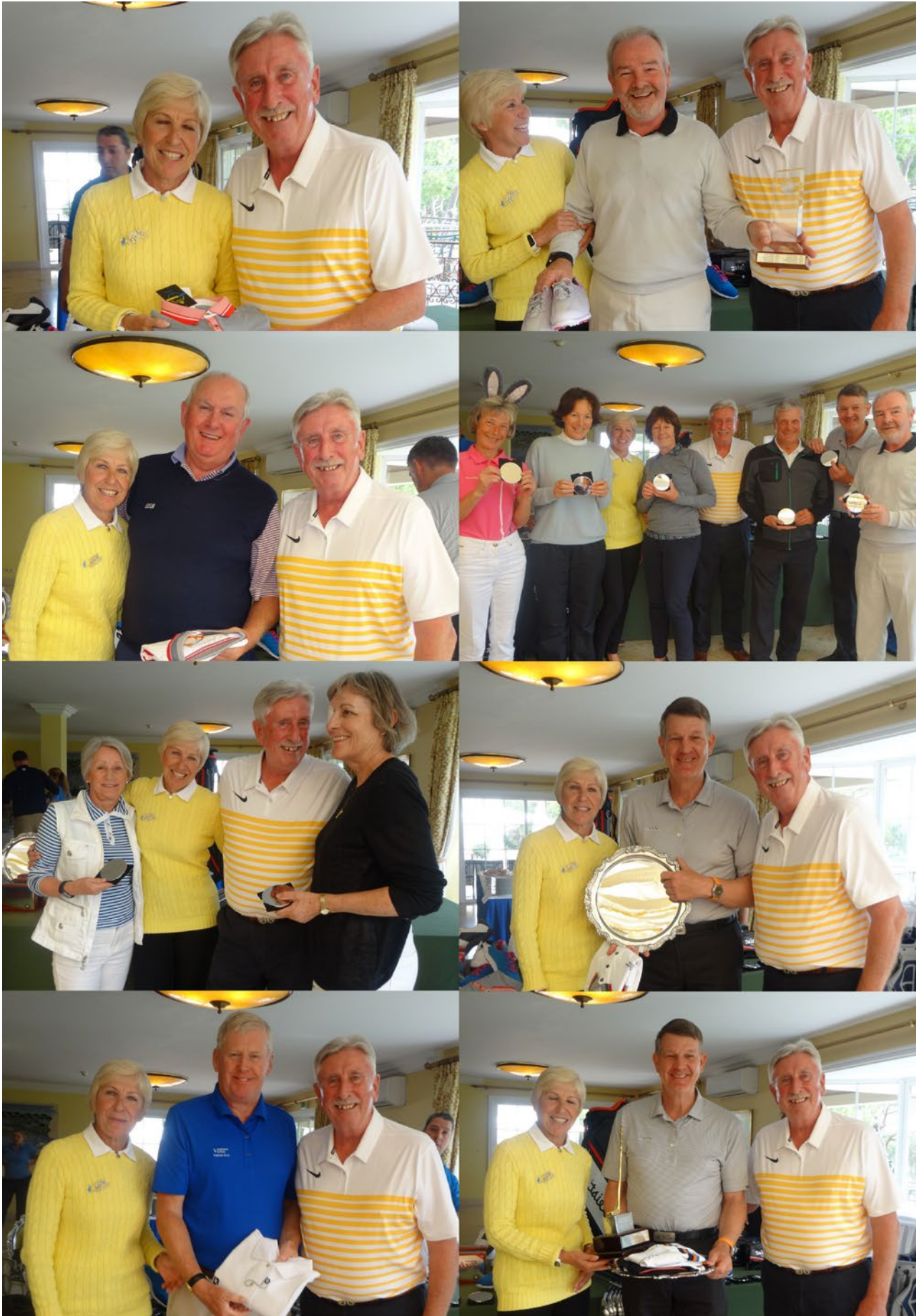
Yearly Competition Winners