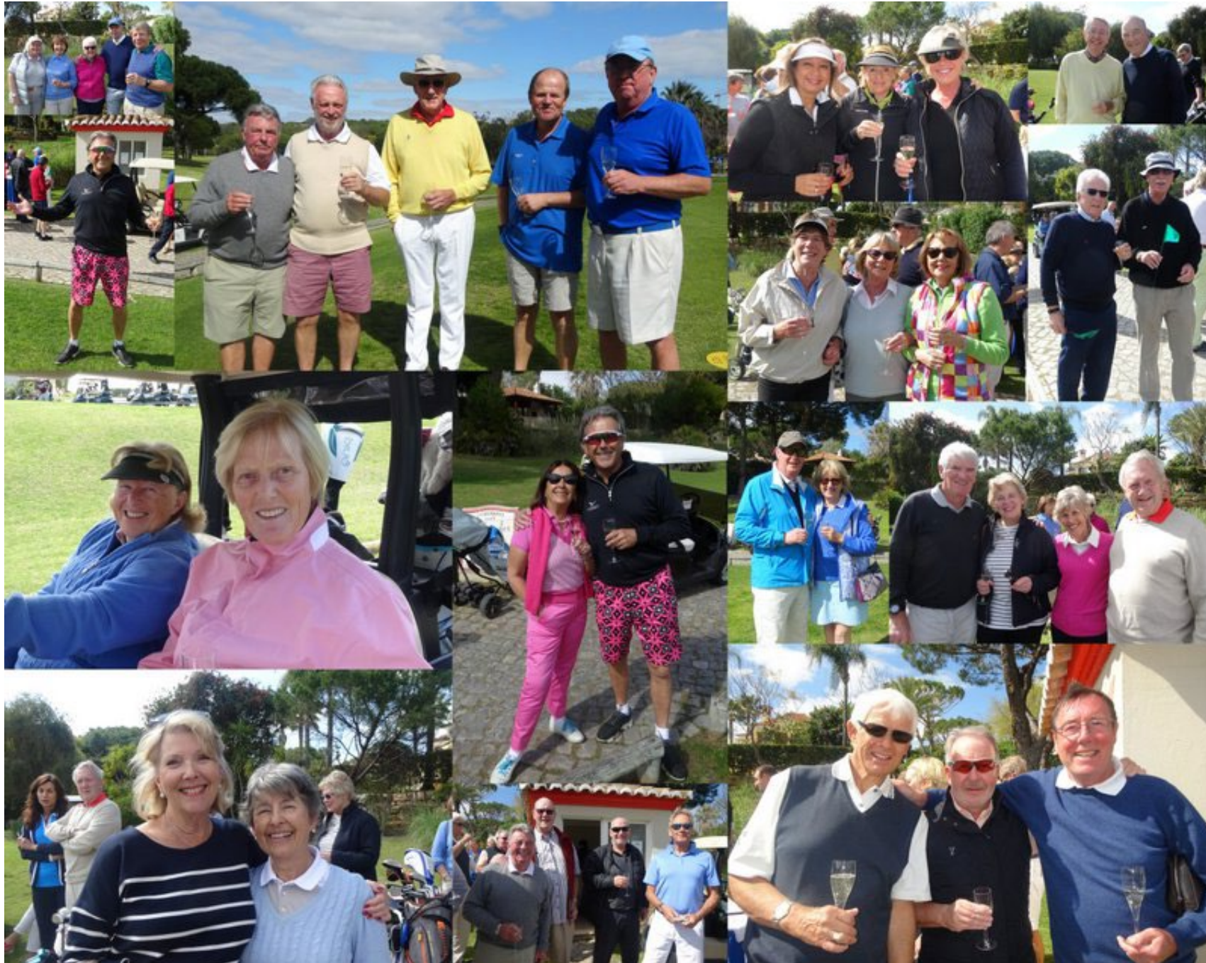
Captain's Drive In