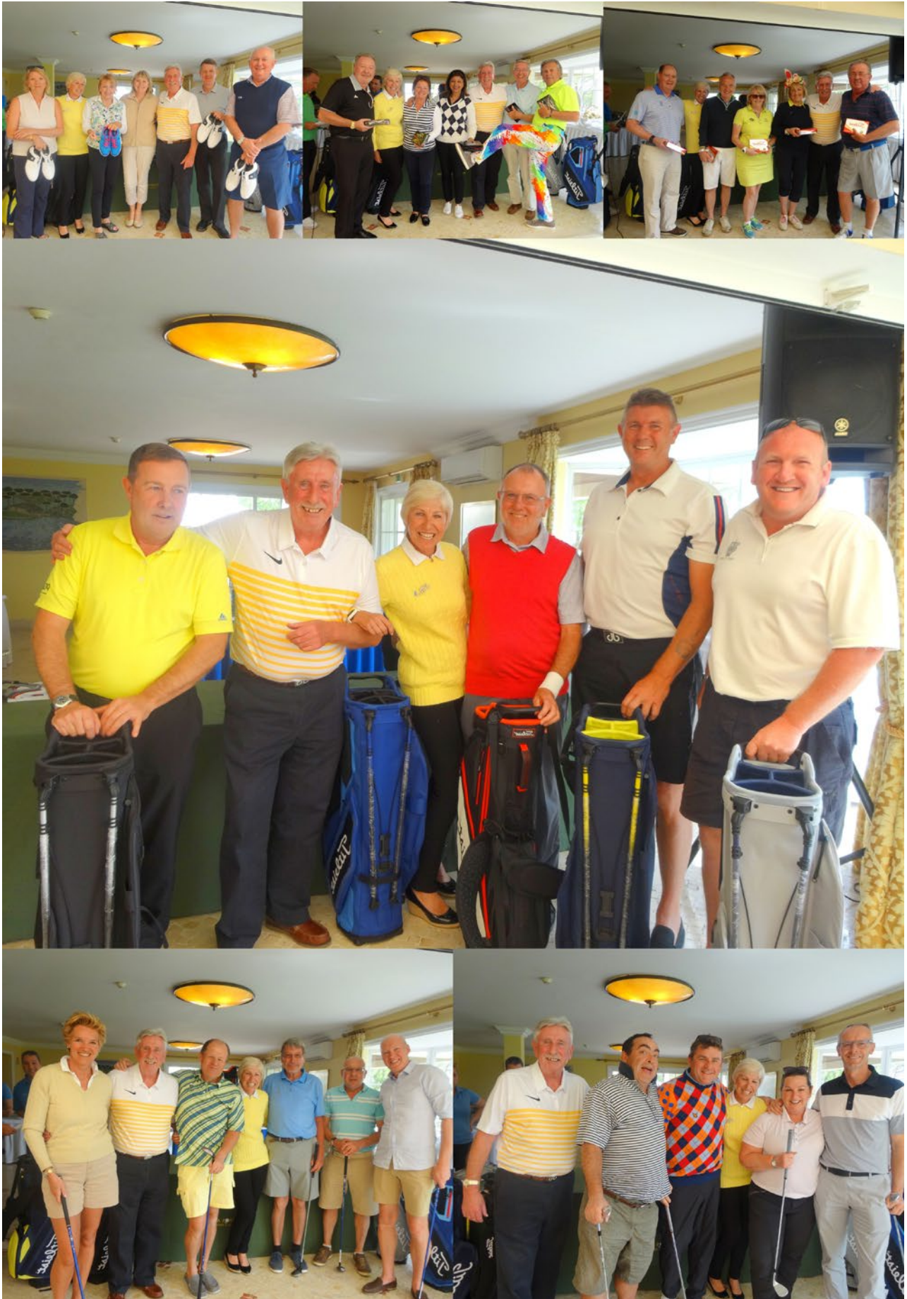
Easter Scramble Prize Winners