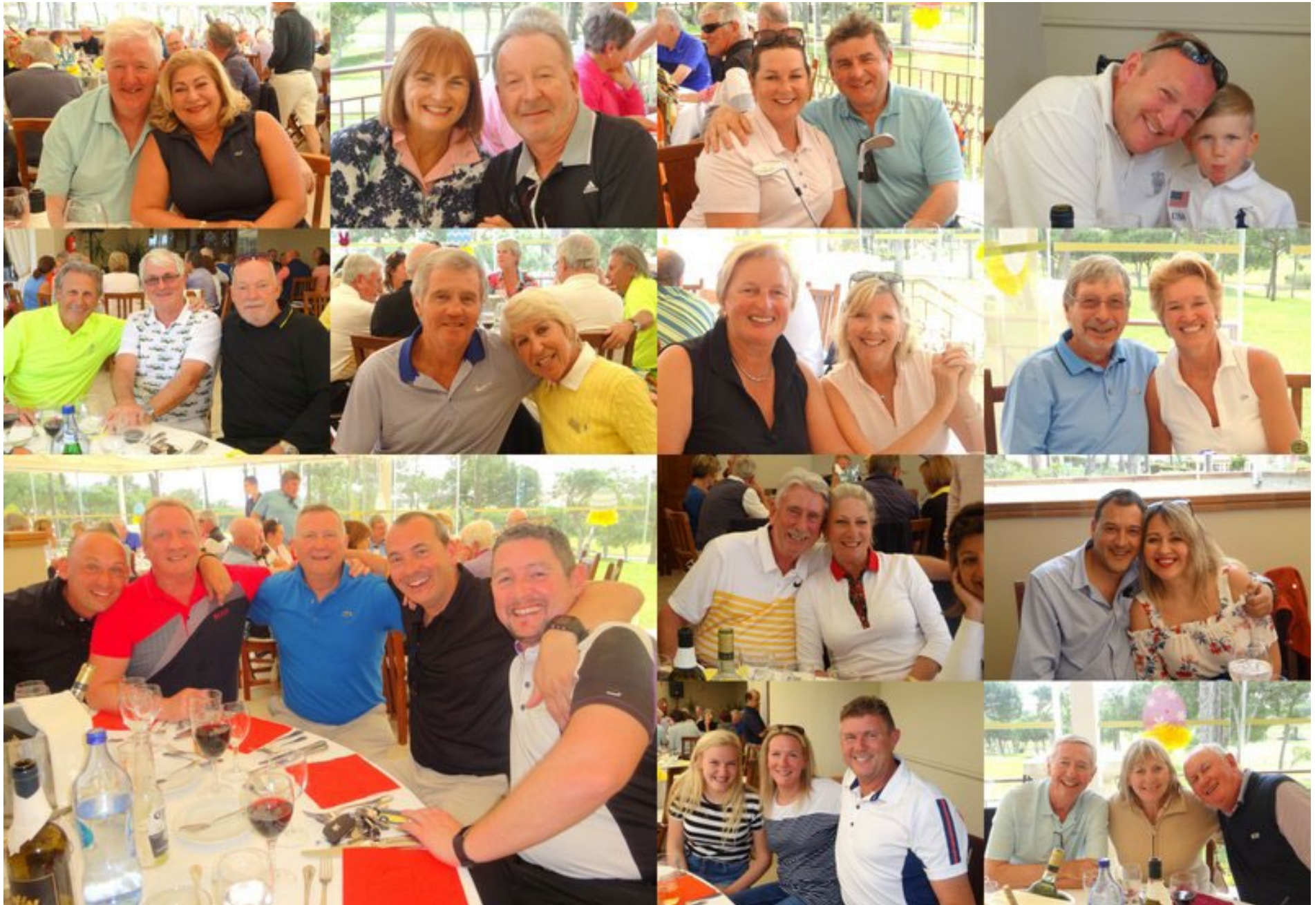
Easter Scramble Lunch