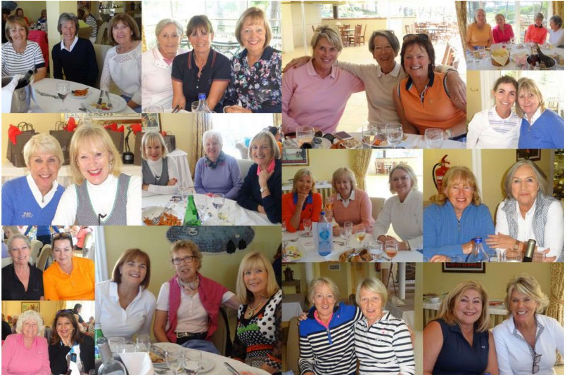
Lady Captain's Drive In Lunch