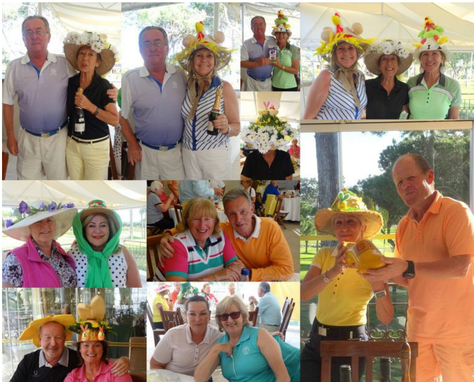
Ladies V Cloggies and Easter Hat Competition Lunch