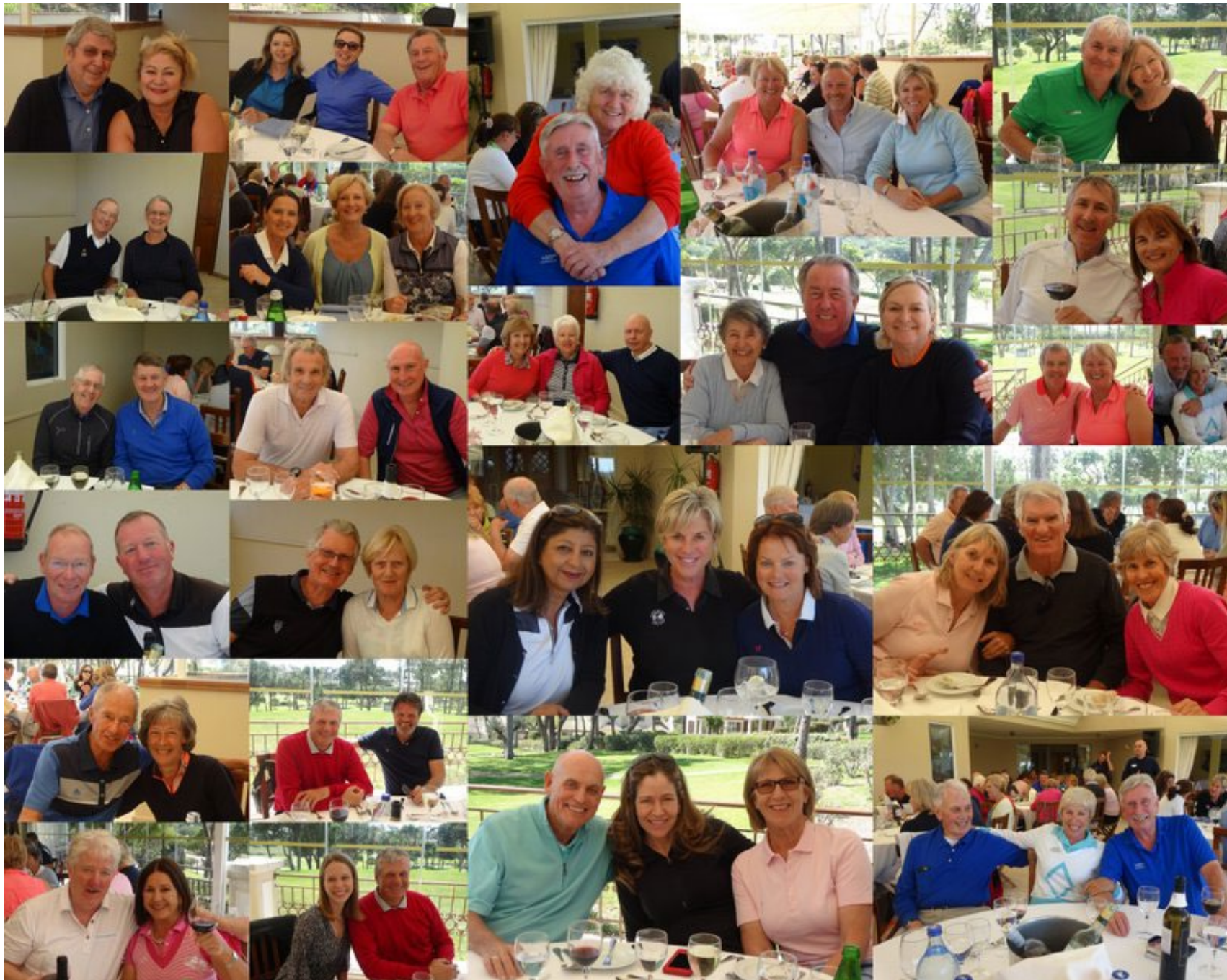
Captain's Drive In Lunch