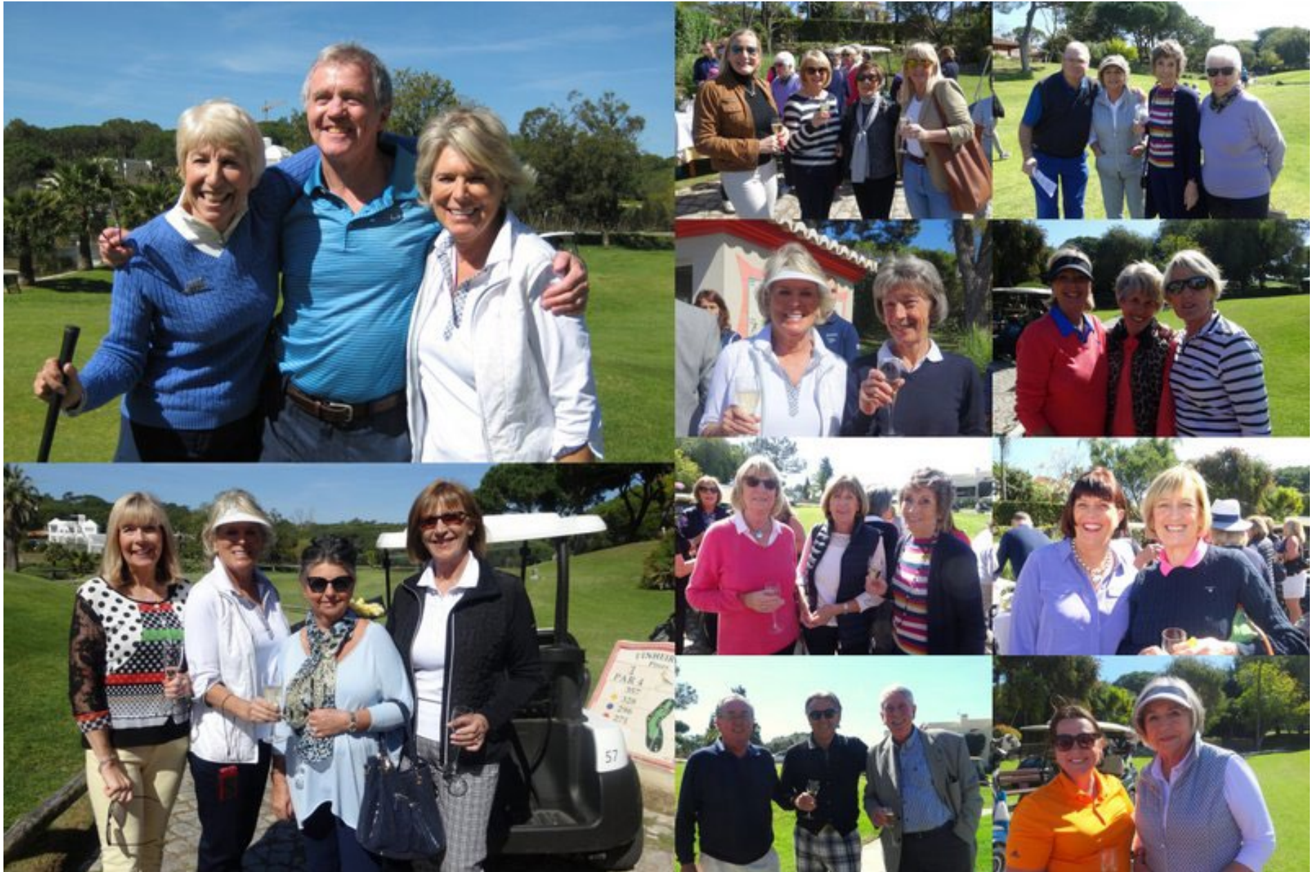
Lady Captain's Drive In