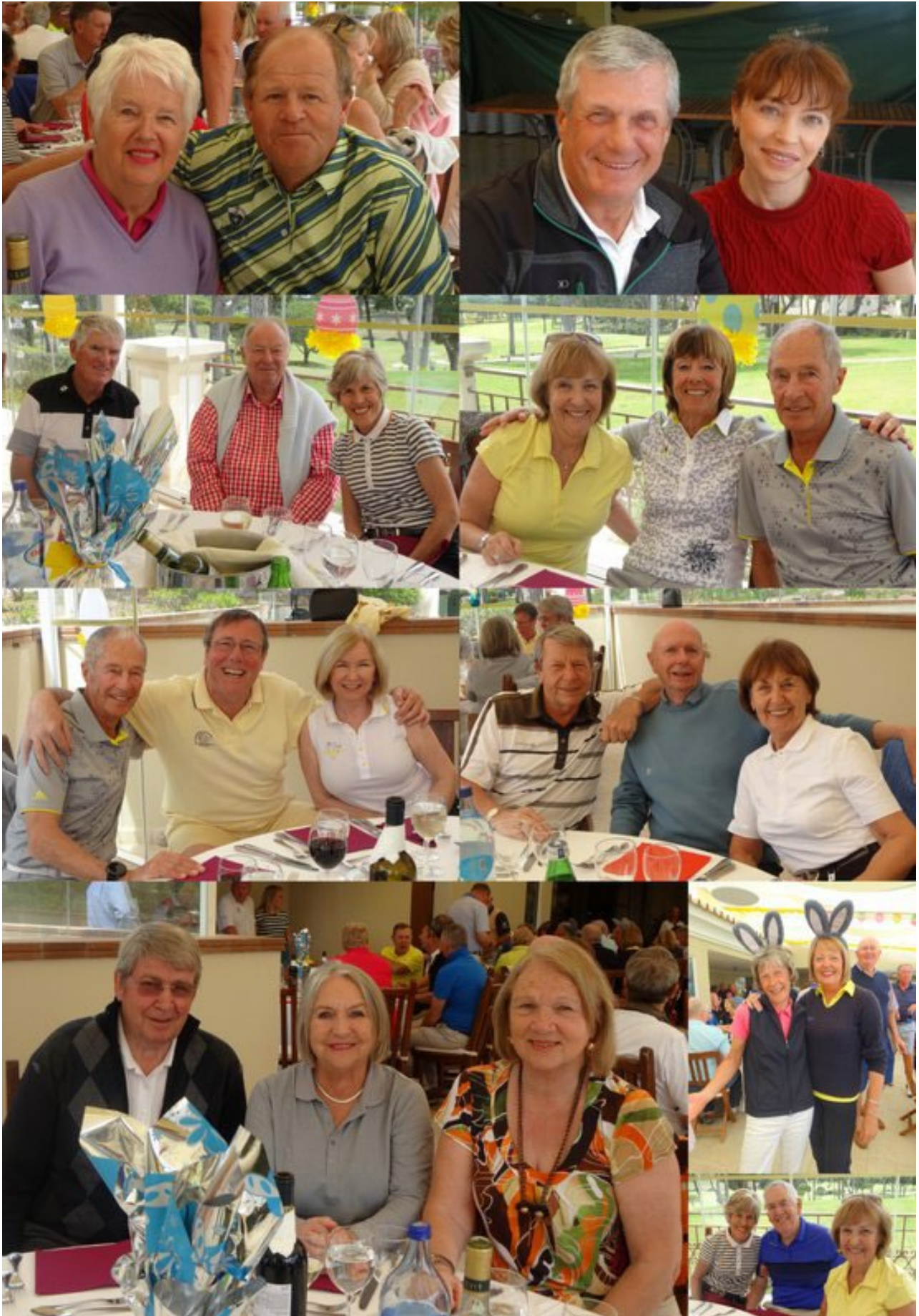
Easter Scramble Lunch