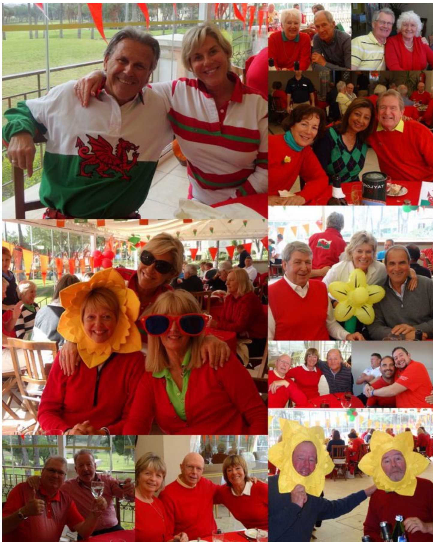
St David's Day celebrations