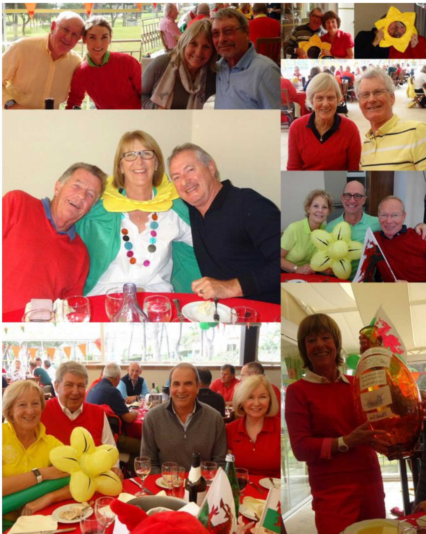
St David's Day celebrations