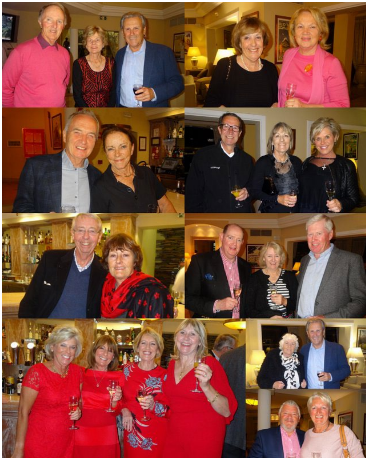
St Valentine's Day celebrations