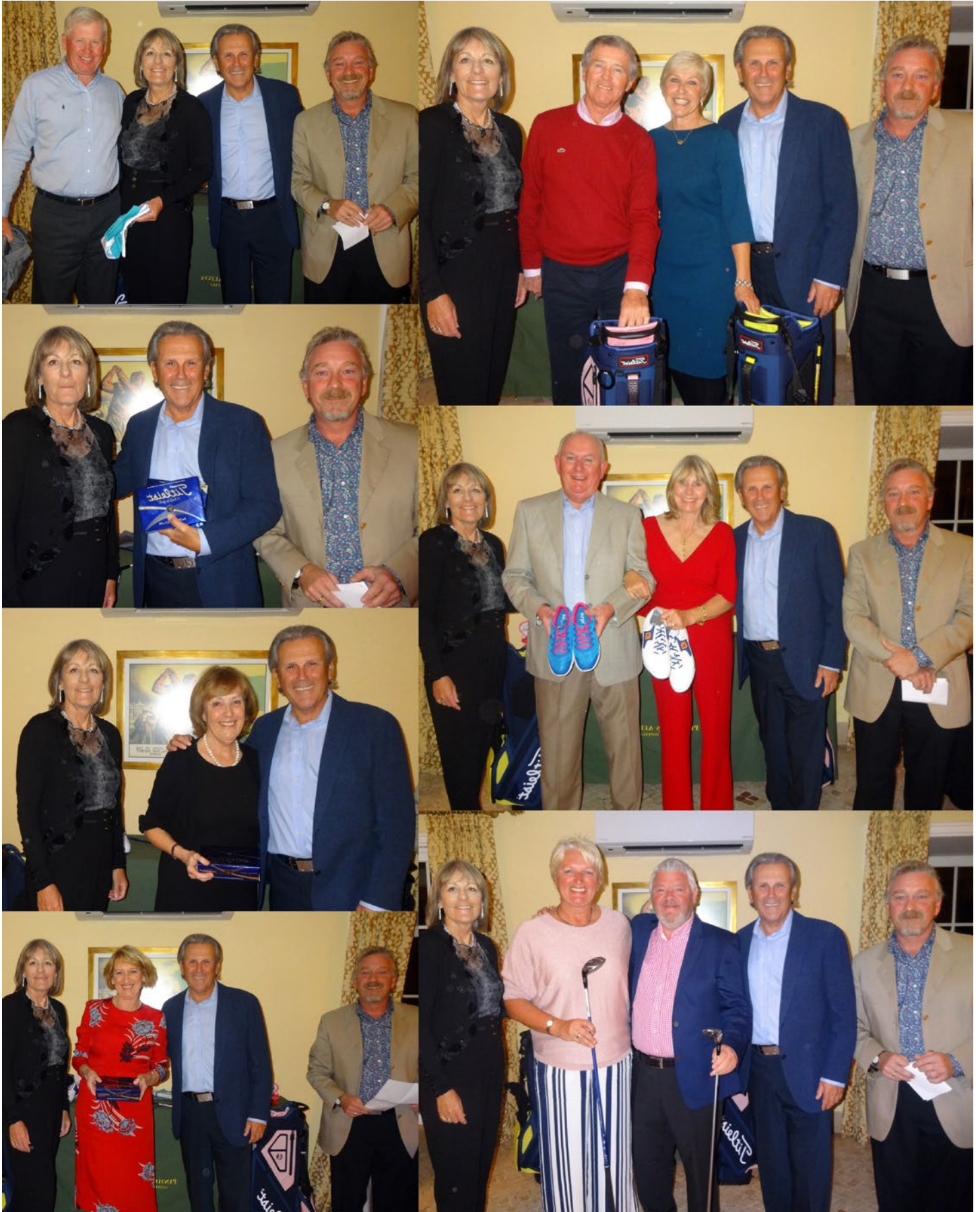
St Valentine's Competition Prize Winners