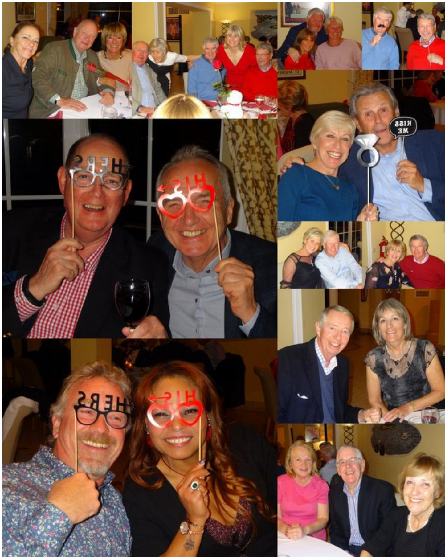
St Valentine's Day celebrations