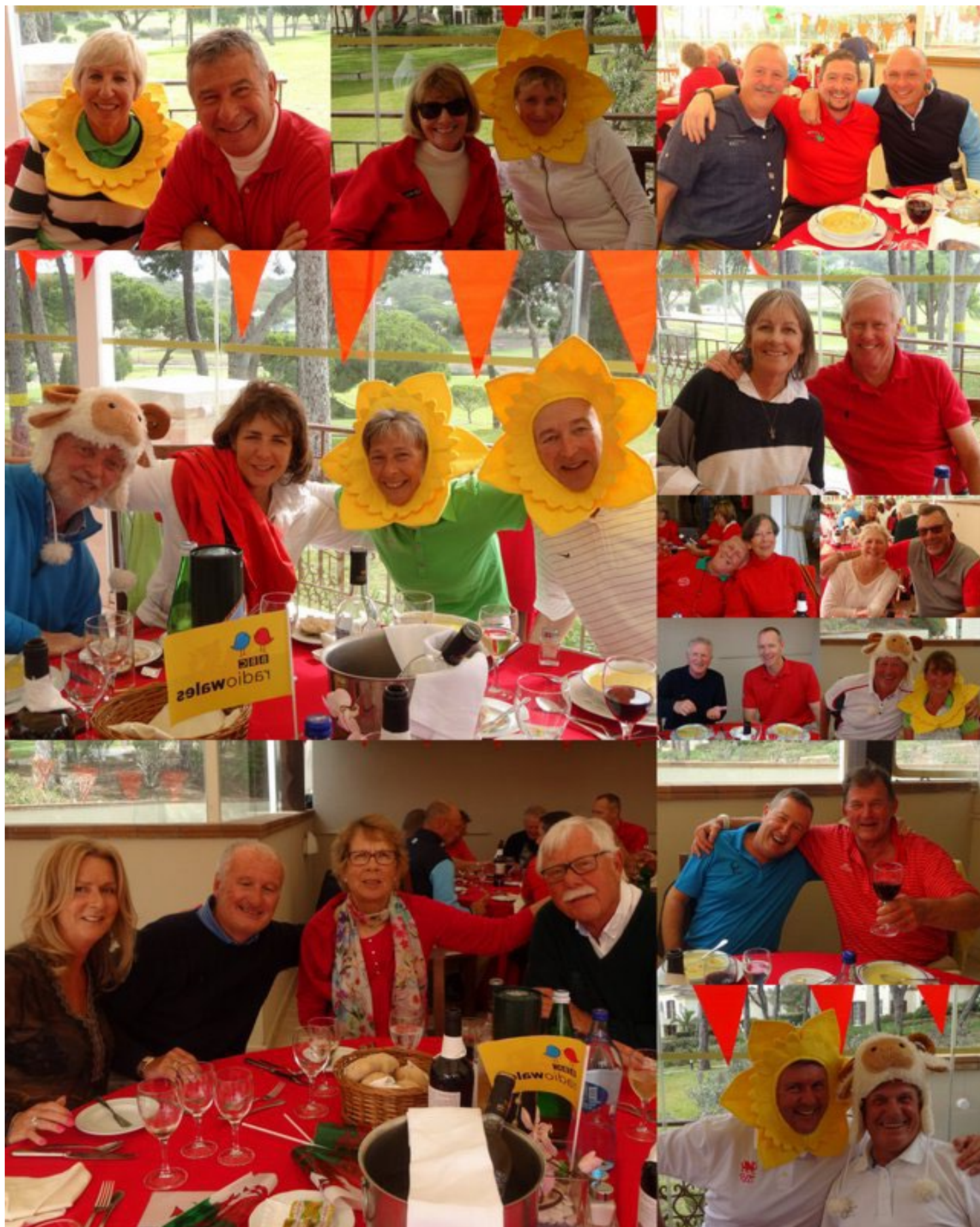
St David's Day celebrations