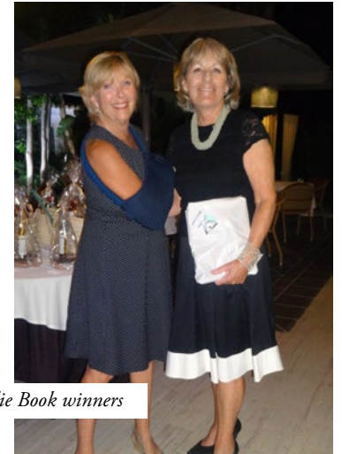
Birdie Book winners