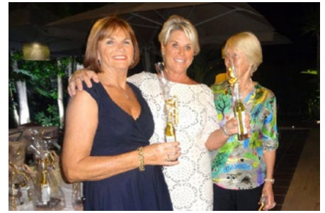
Day competition winners