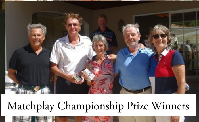
Matchplay Championship Prize Winners