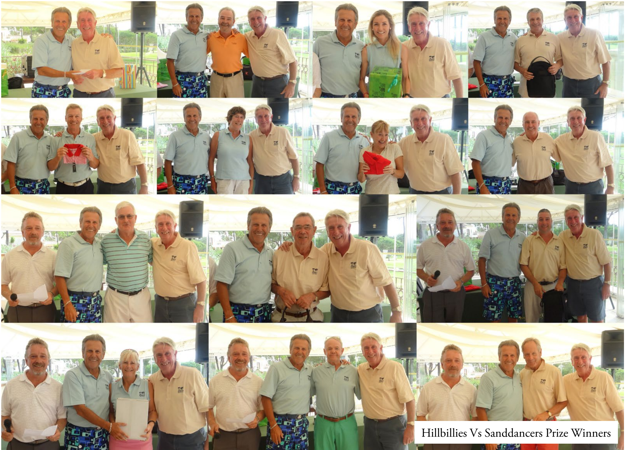
Hillbillies Vs Sanddancers Prize Winners