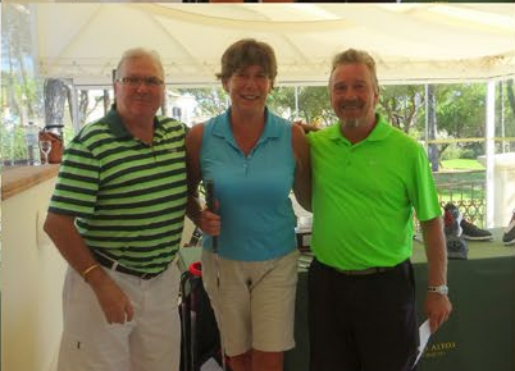
President's Day and Seniors Championship Prize Winners