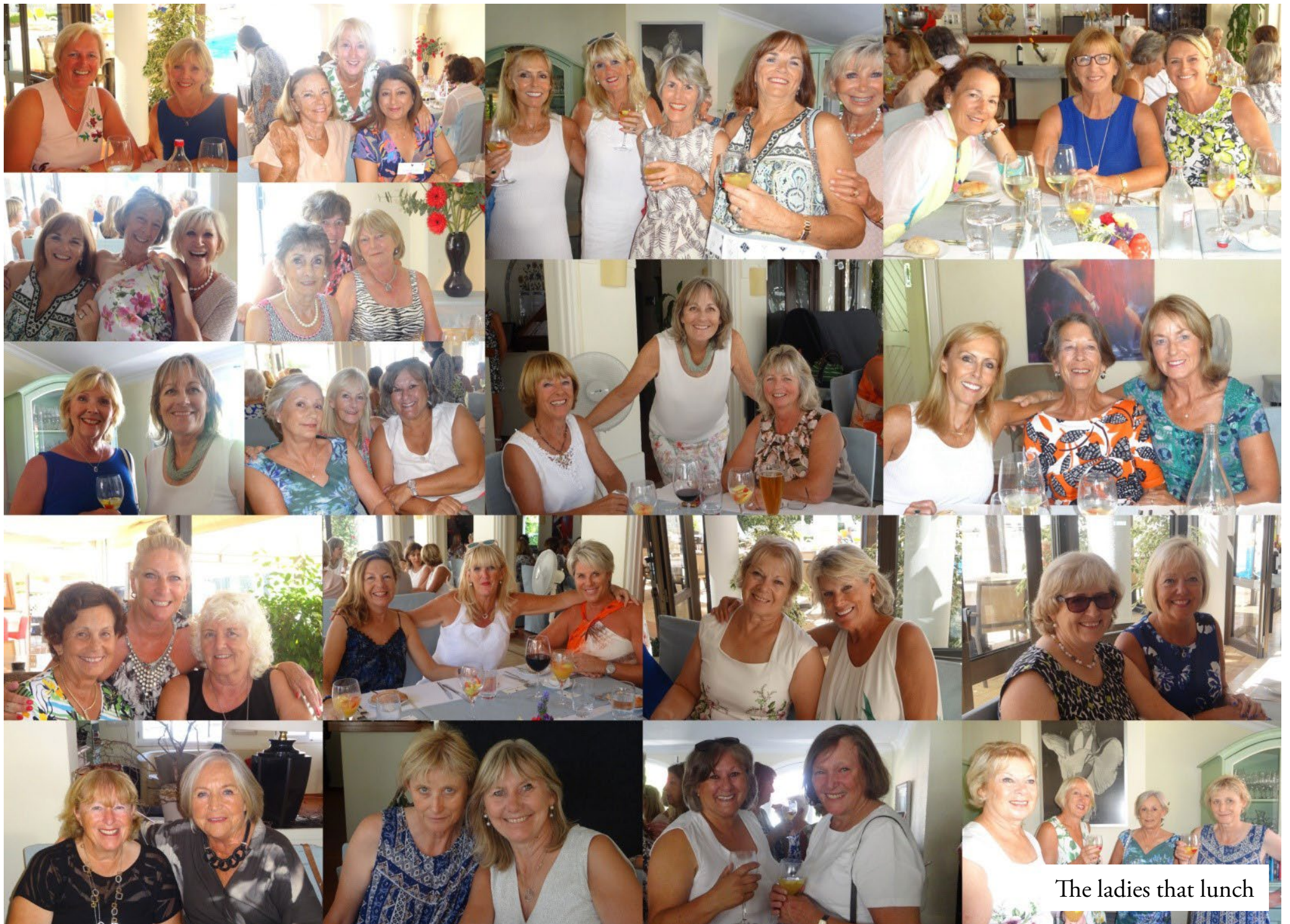
The ladies that lunch