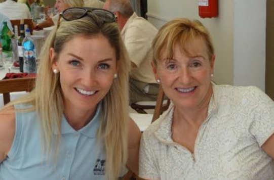
Hillbillies Vs Sanddancers