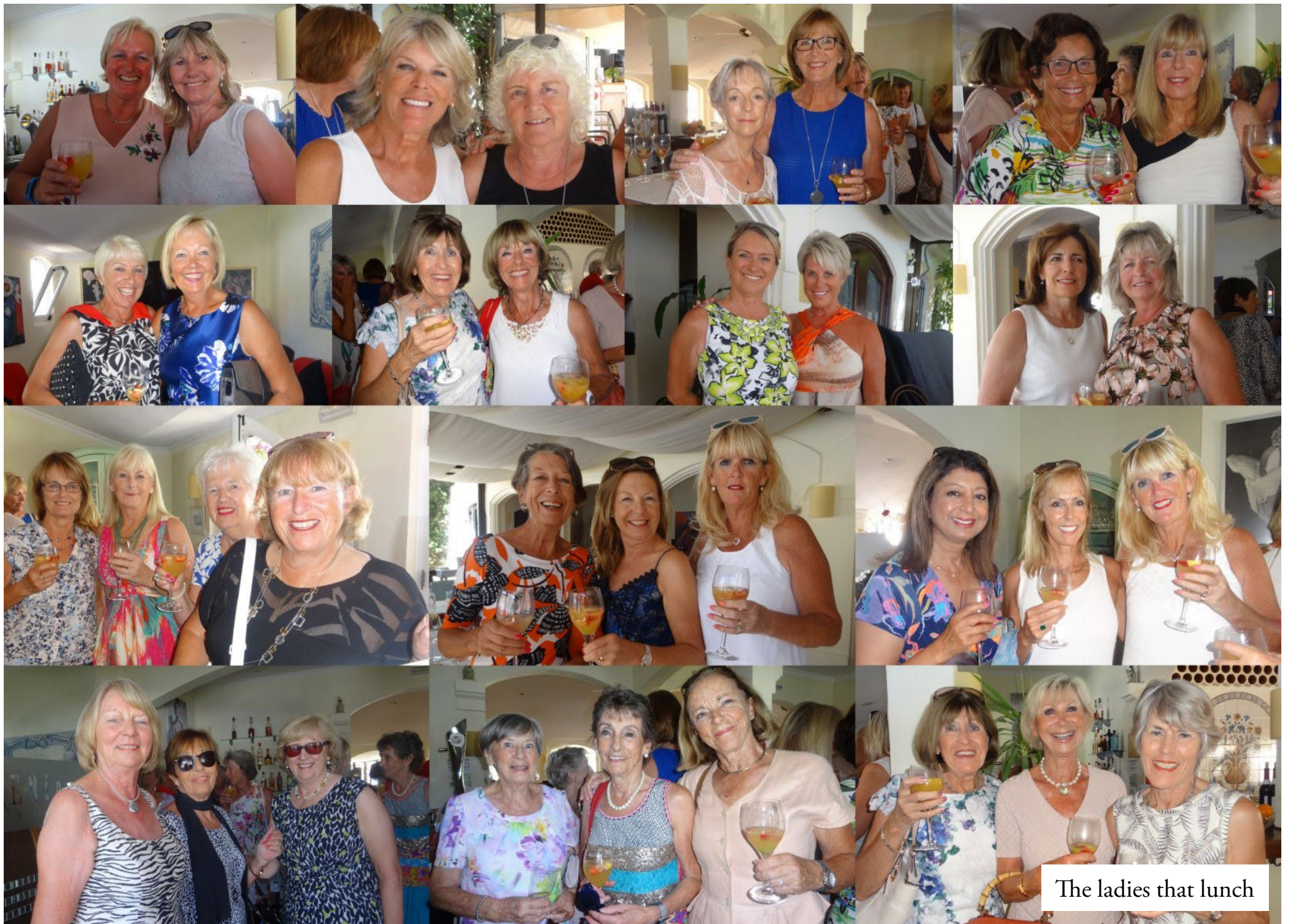
The ladies that lunch