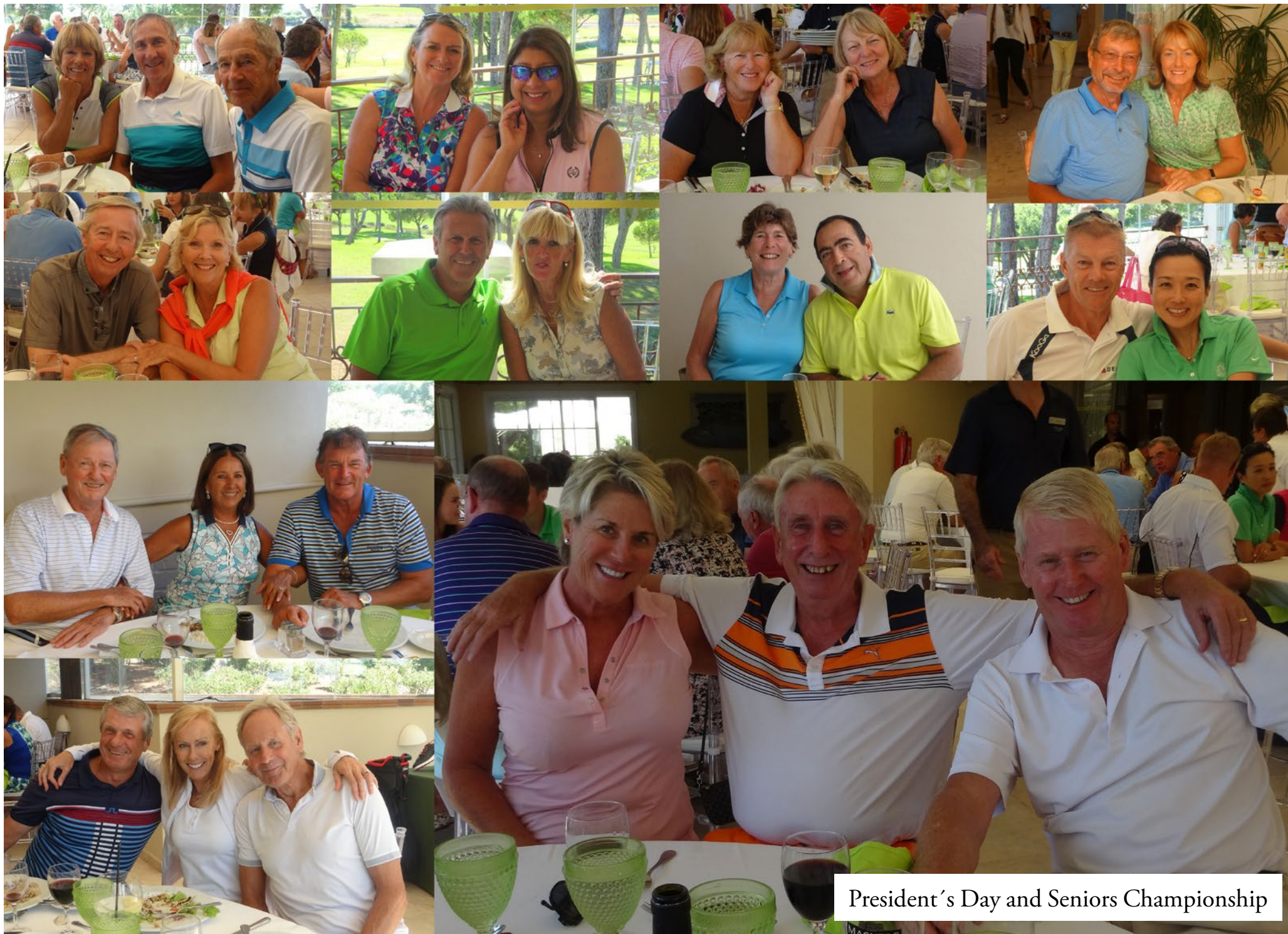
President's Day and Seniors Championship