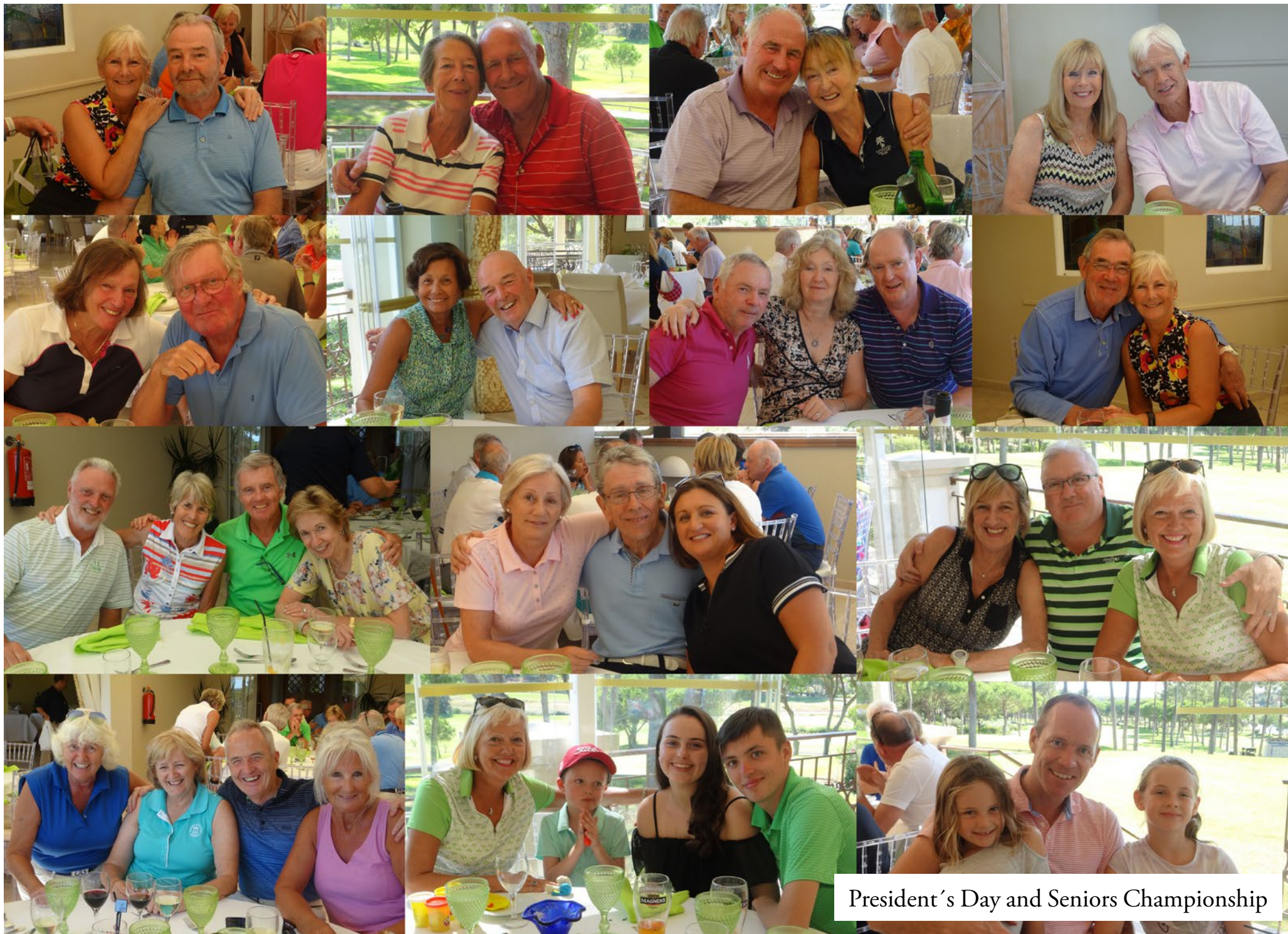
President's Day and Seniors Championship