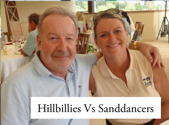
Hillbillies Vs Sanddancers