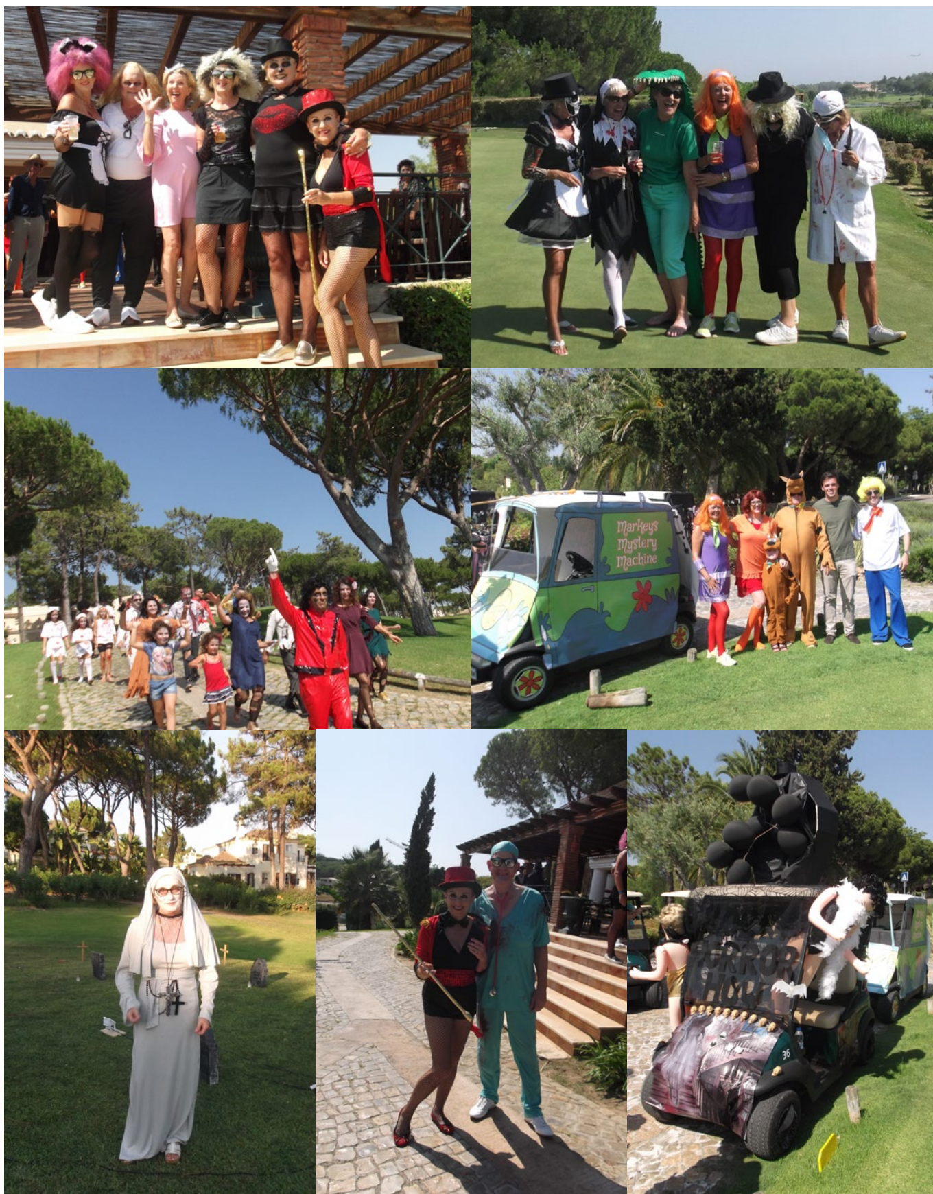
Thrillers Shoot Out