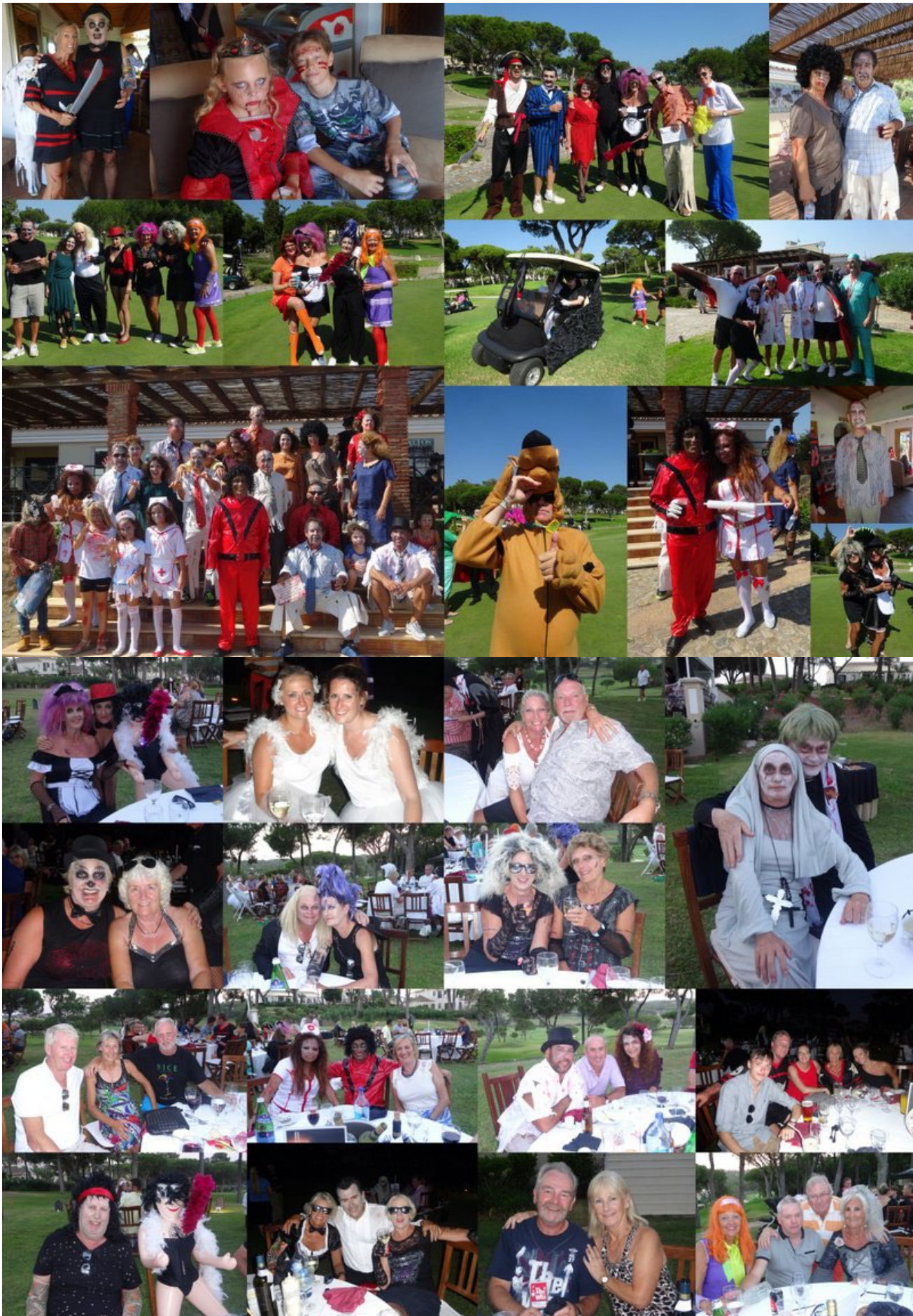
Thrillers Shoot Out