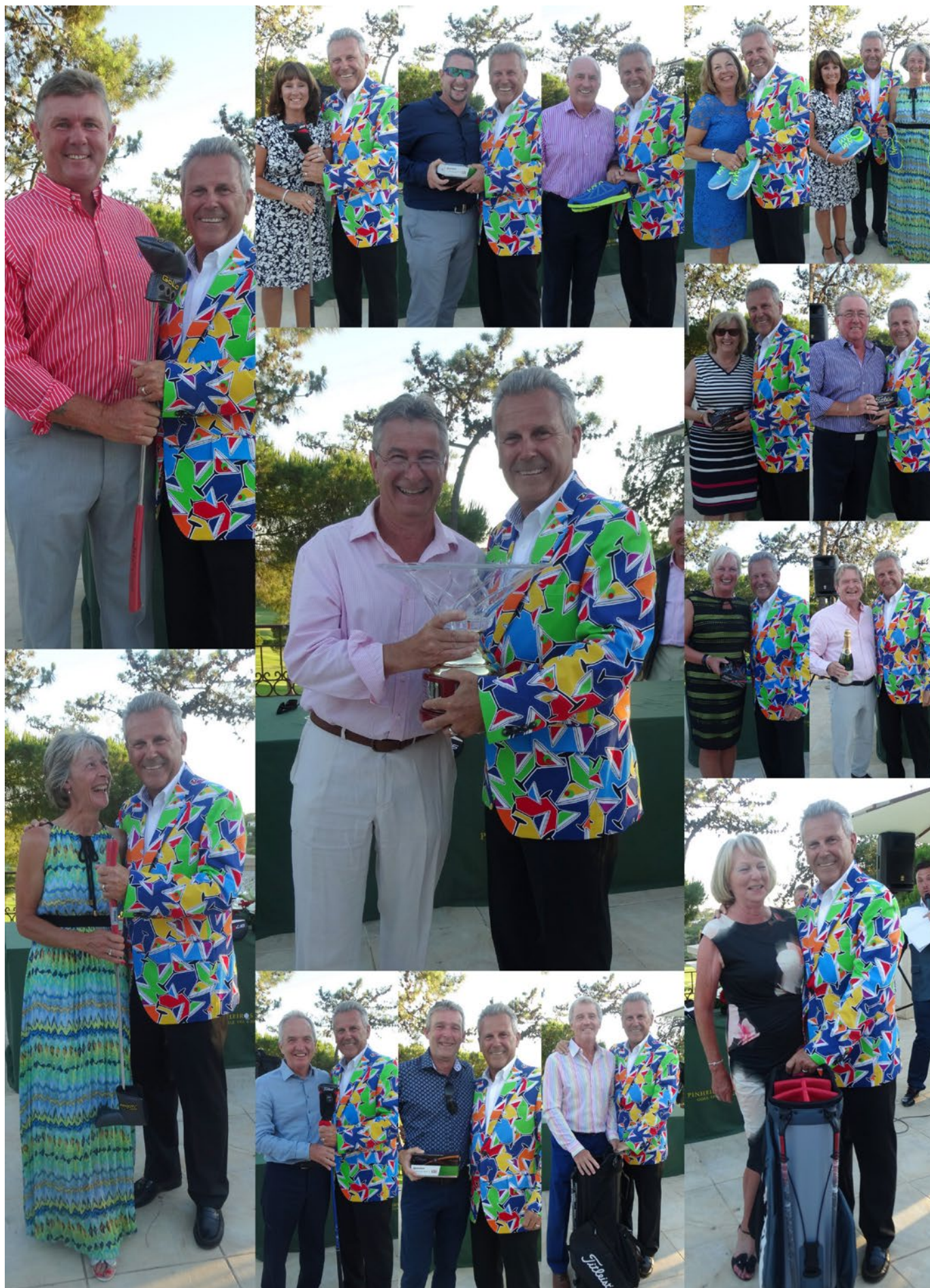
Captain's Day Prize Winners