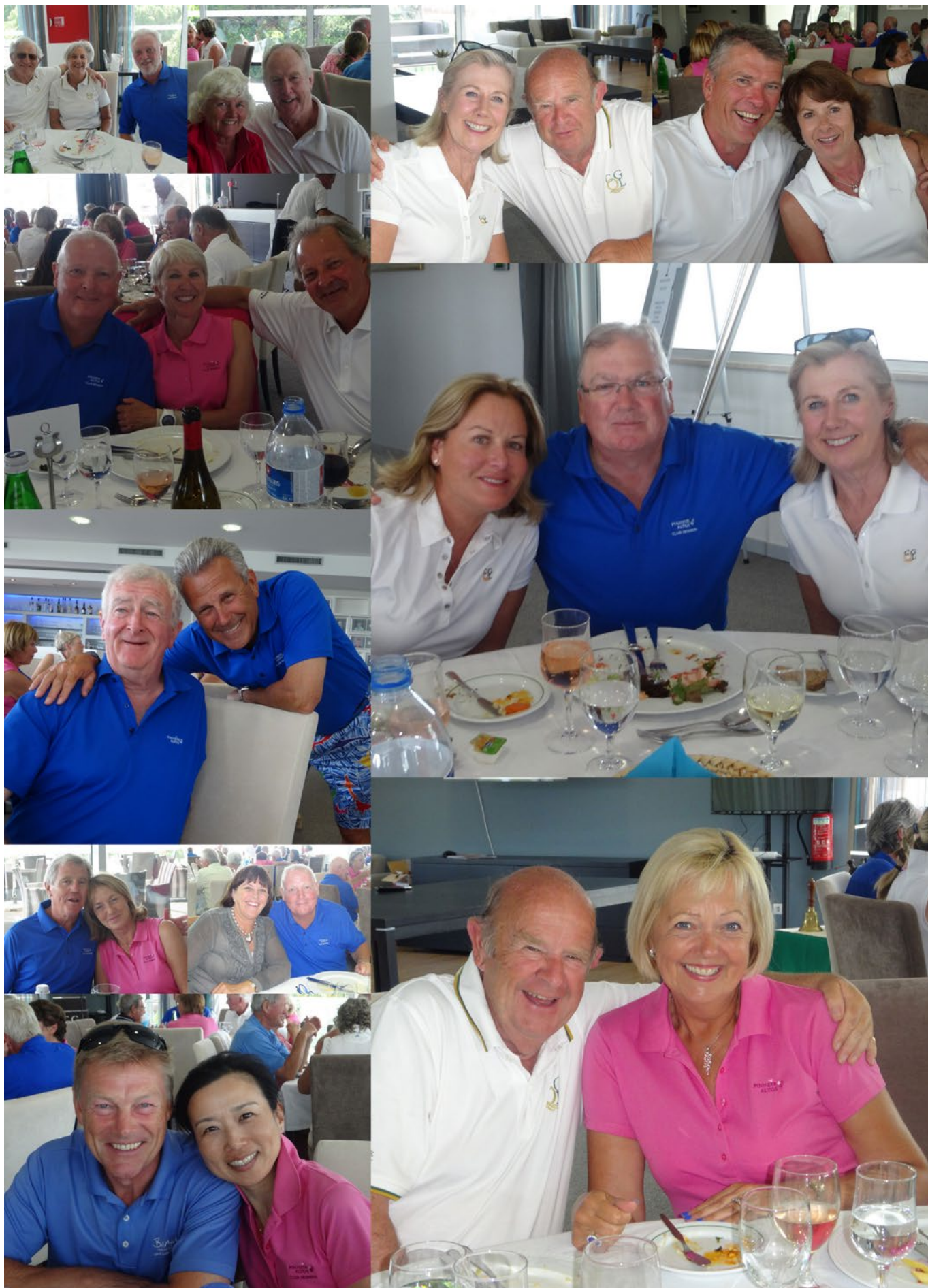
The Ben Hogan Trophy Lunch