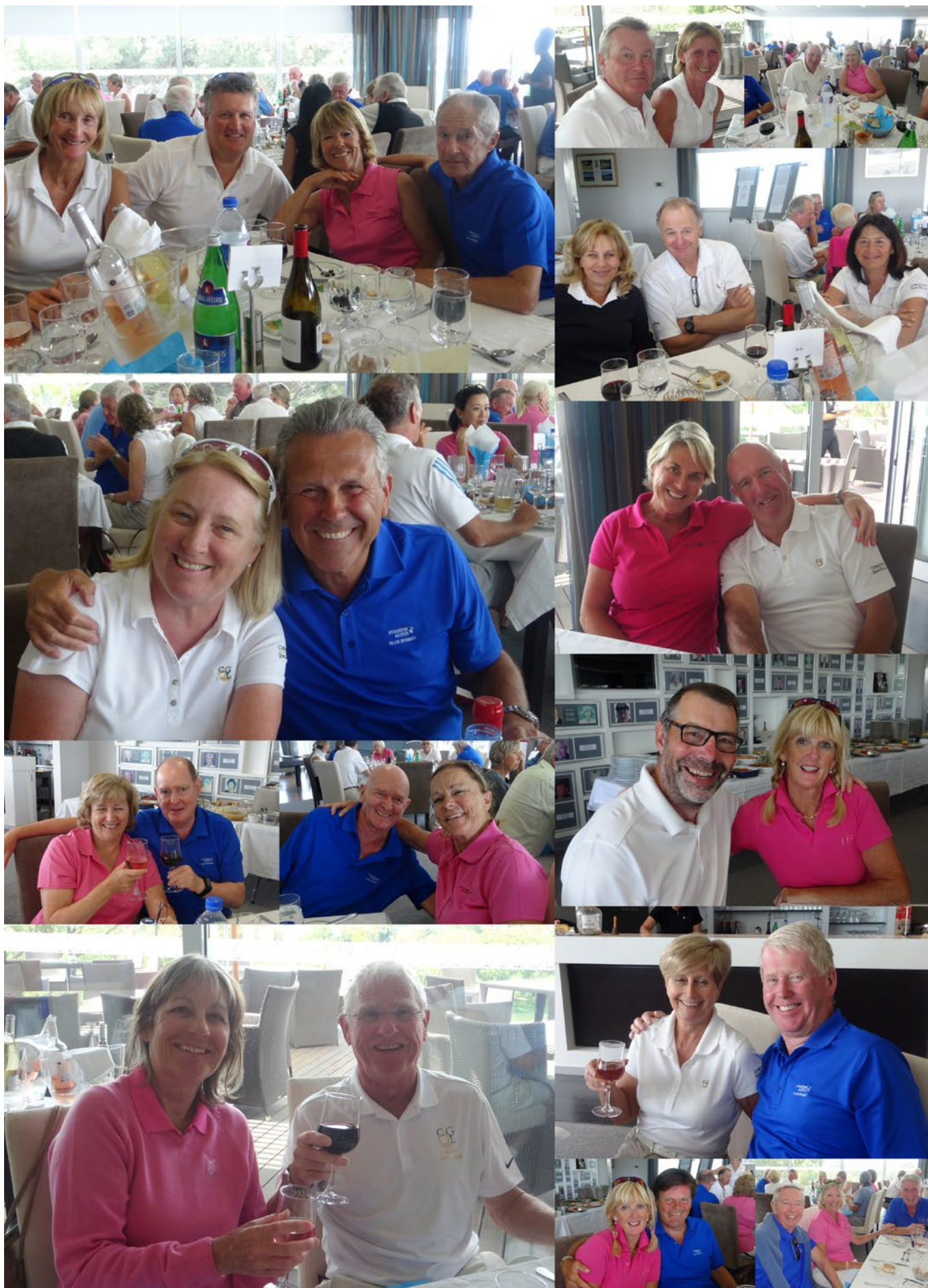
The Ben Hogan Trophy Lunch