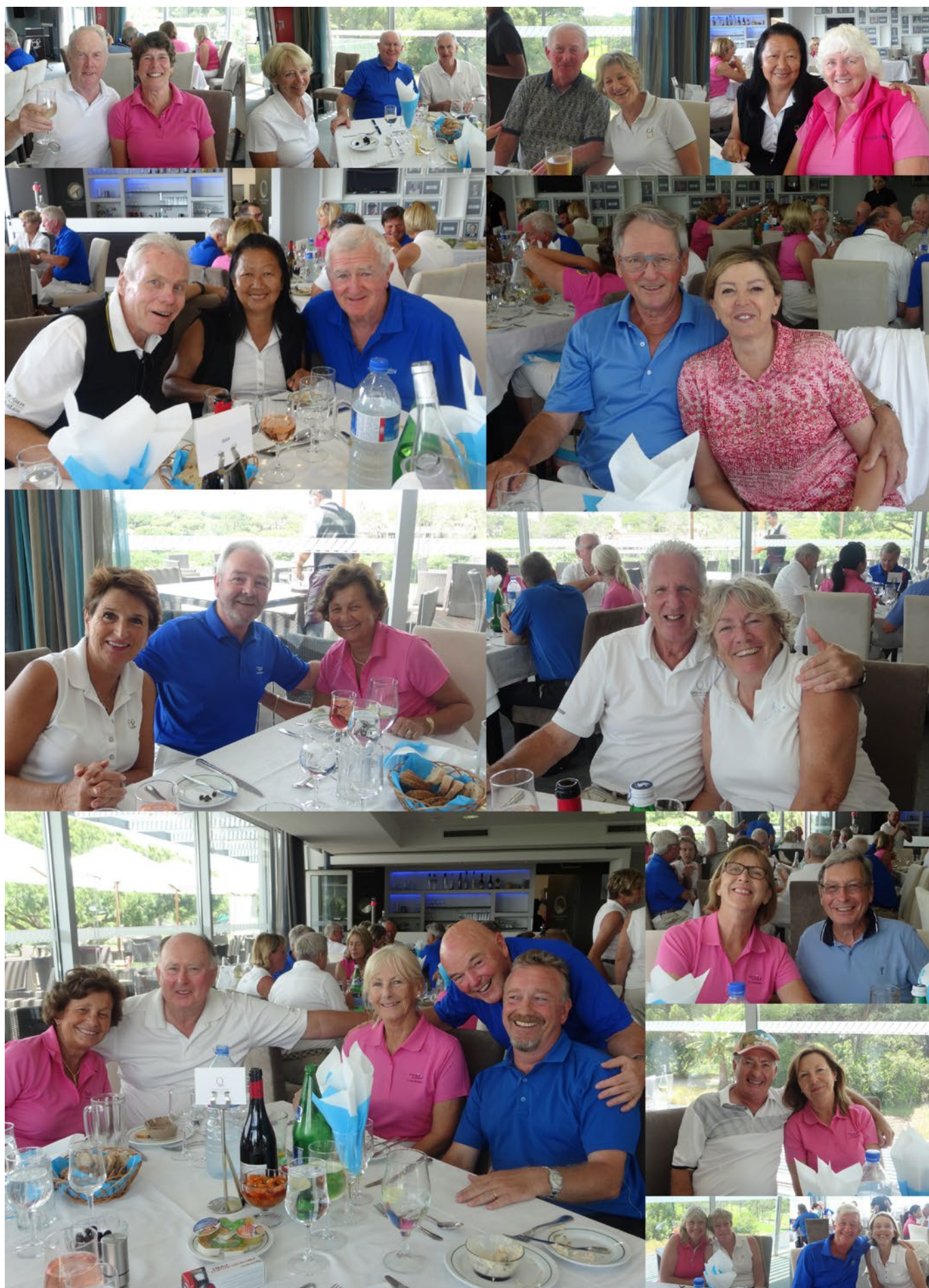
The Ben Hogan Trophy Lunch