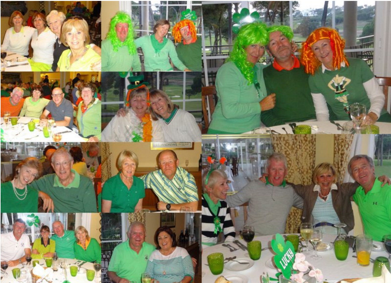
St Patricks celebrations