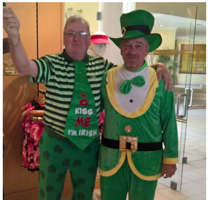
Leprecorns on Duty