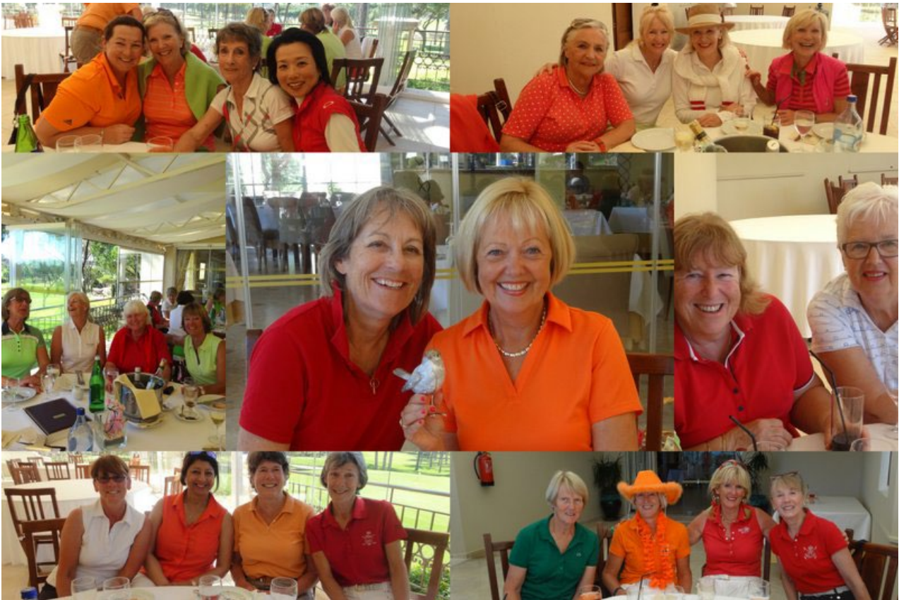
Lady Captain vs Lady Vice Captain

720 euro towards our chosen charities. So many of you made such an effort in your green, white and orange.