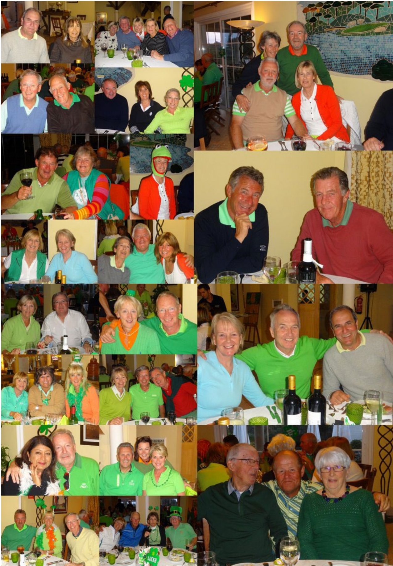
St Patricks celebrations