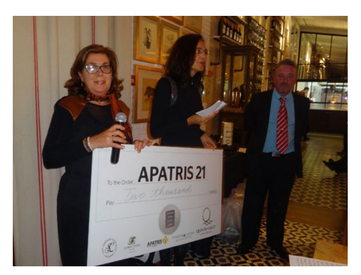
Charity Apatris 21 receiving €2000 cheque

With these few words I will hope to see you all on the upcoming events and have a fun and enjoy the game we all love.