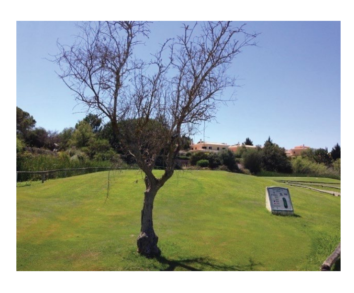
Before and After with the Artist Uwe Bindseil