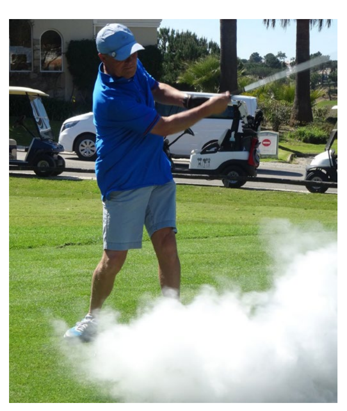
Explosive Start at the Captains Drive In