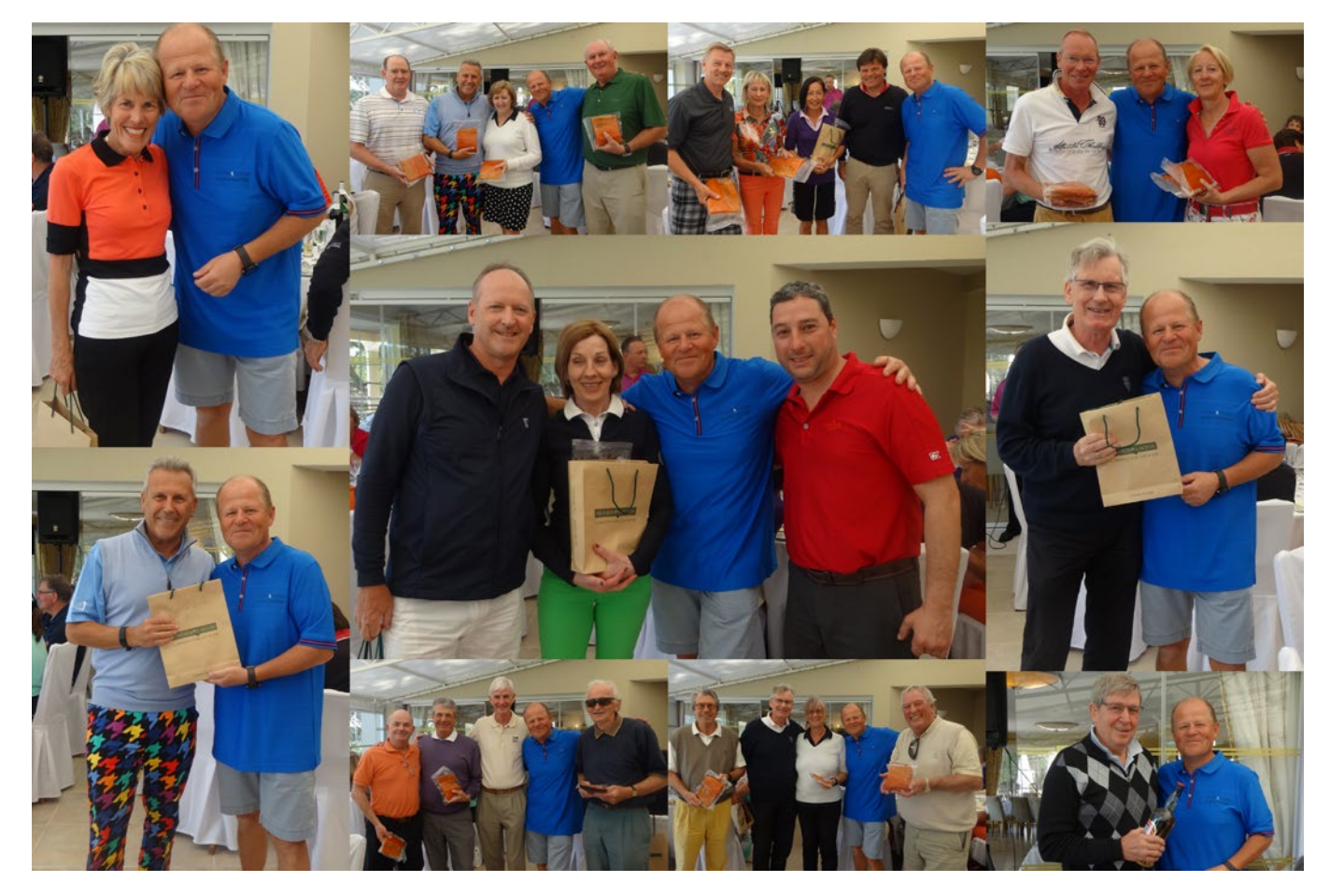
Captain's Drive In Prize Winners