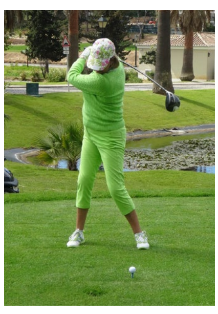
Lady Captain's Drive In