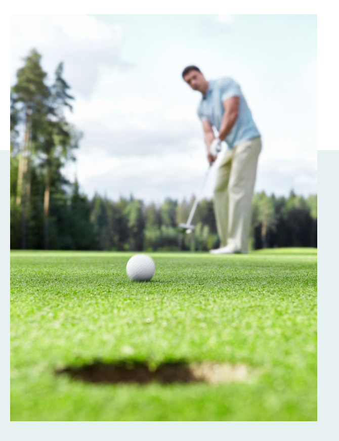
As you begin to walk up to the ball, switch your mind away from direction and onto distance. Then execute!

I have now done four seasons as Captain of the team and it is time for a change. Despite some frustrations and disappointments I have thoroughly enjoyed it but all good things come to an end.