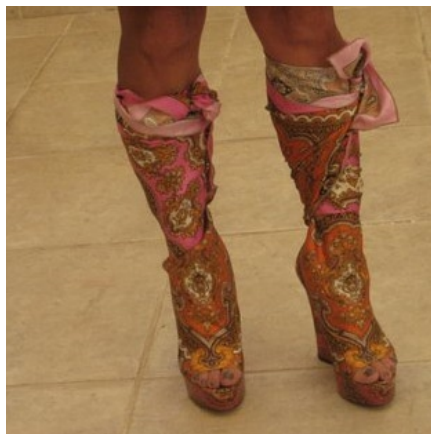
These boots are made for walking!