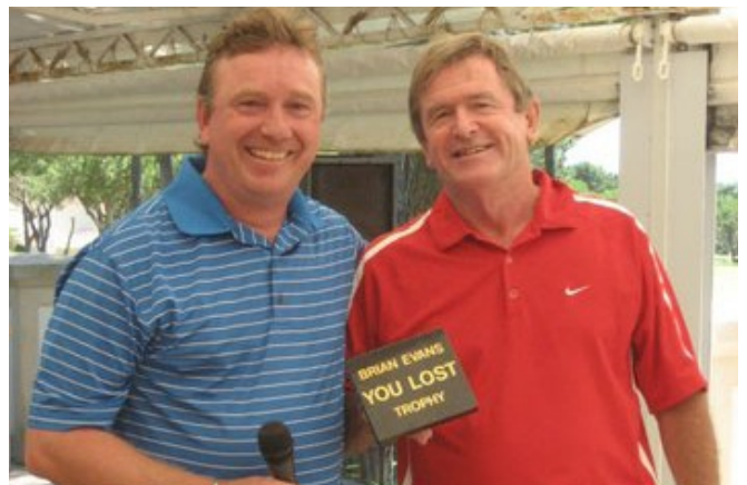
The least said, the better