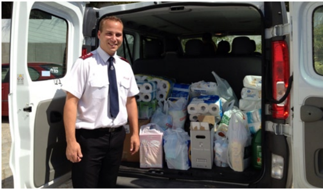
The biggest single donation received so far this year! A Big thank-you!